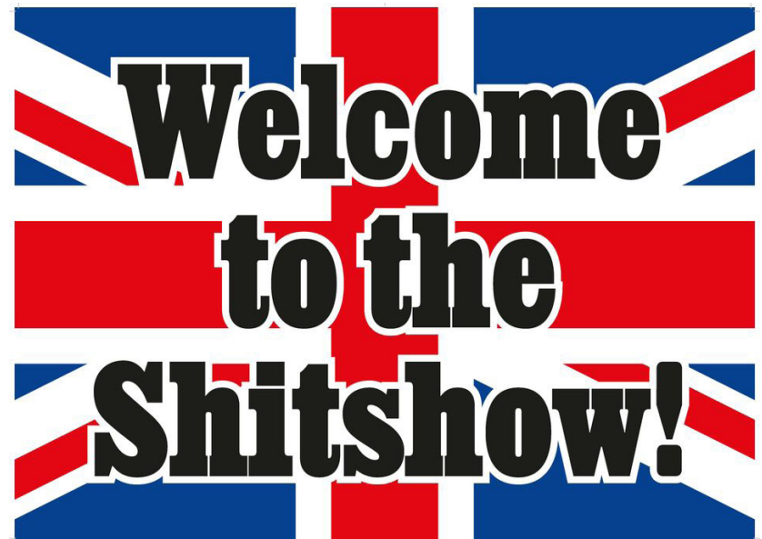
Bottom: Welcome to the Shitshow, 2019 Poster insert 58.7 x 41.8 cm 23 1/8 x 16 1/2 in TMI-DELLJ-48159