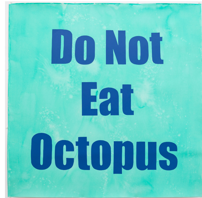
Top: Do Not Eat Octopus, 2017 Silkscreen on acrylic 150 x 150 cm, 59.1 x 59.1 in Edition of 5 plus 3 artist's proofs TMI-DELLJ-43350