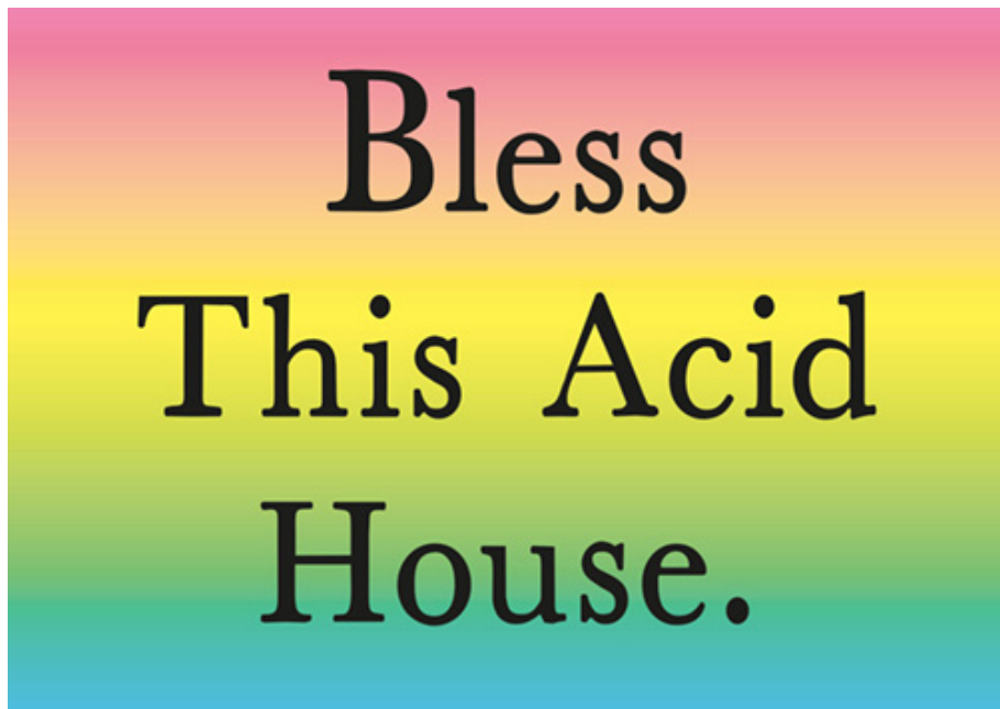
Top: Bless This Acid House, 2020 4 colour digital print 42 x 59 cm, 16 1/2 x 23 1/4 in Edition of 2000 TMI-DELLJ-47323