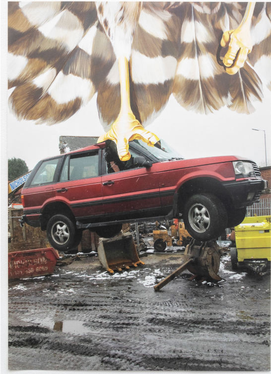
Left: If, 2014 Digital colour print on paper 59 x 42 cm 23.2 x 16.5 in Ed. of 20 + 3 AP TMI-DELLJ-39387