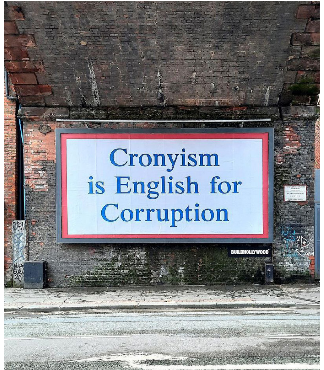
Cronyism is English for Corruption, 2021 Billboard and poster Offset lithograph 300 x 600 cm 118 1/8 x 236 1/4 in TMI-DELLJ-48697

I blame the Industrial Revolution Freetail Dub Lang lebe Jaki Liebzzeit Some Londoners English Magic circa 1990 The Problem with Humans Samaritans Stonehenge in the early morning fog Artist's impression of Lachlan Murdoch's home in Sydney, Australia on fire London & on & on A is for Beethoven We're Here Because We're Here Vote Untitled Brian Epstein Died for You Meet the Hand Axes A photograph of David Cameron on a holiday in South Africa paid for by the Apartheid Government (1989) Life/Live, Muscle Man There's a new sensation More Poetry Is Needed The grabbing hands grab all they can English Magic II Keep your 'lectric eyes on me babe The Art of Baggy I'd Rather Be Reading Keith Moon Matters Profile of William Morris detected on a standing stone at Avebury Wilt- shire Golden Years A Decade of David 1970-1980 Every Little Helps Stonehenge Keith Moon A Retrospective RIP English Magic He's A Rainbow Doctor David Kelly I Blame the Internet Sniper Scope Wallpaper