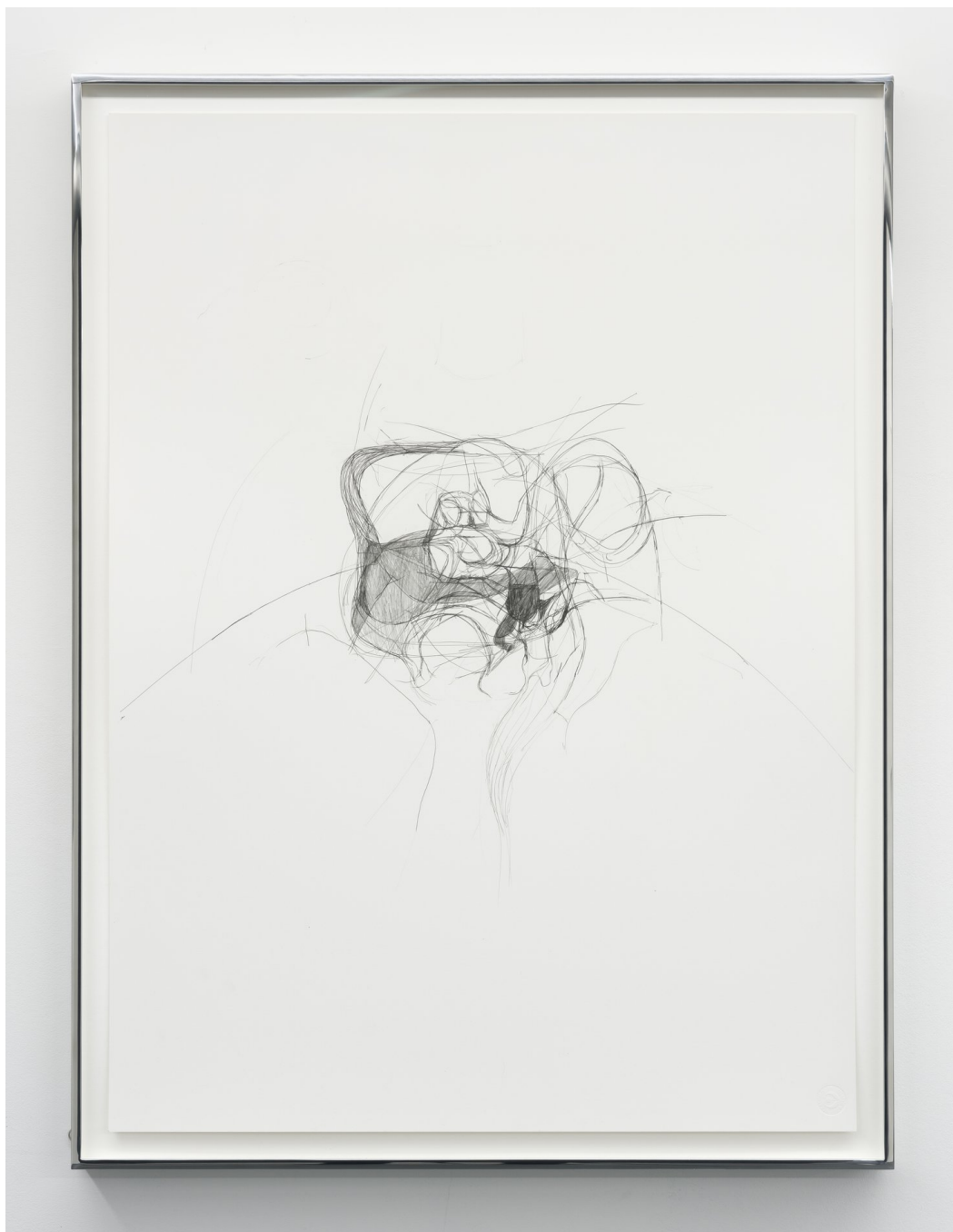
Tony Chrenka Untitled, 2021 Graphite on paper 22 x 30 in