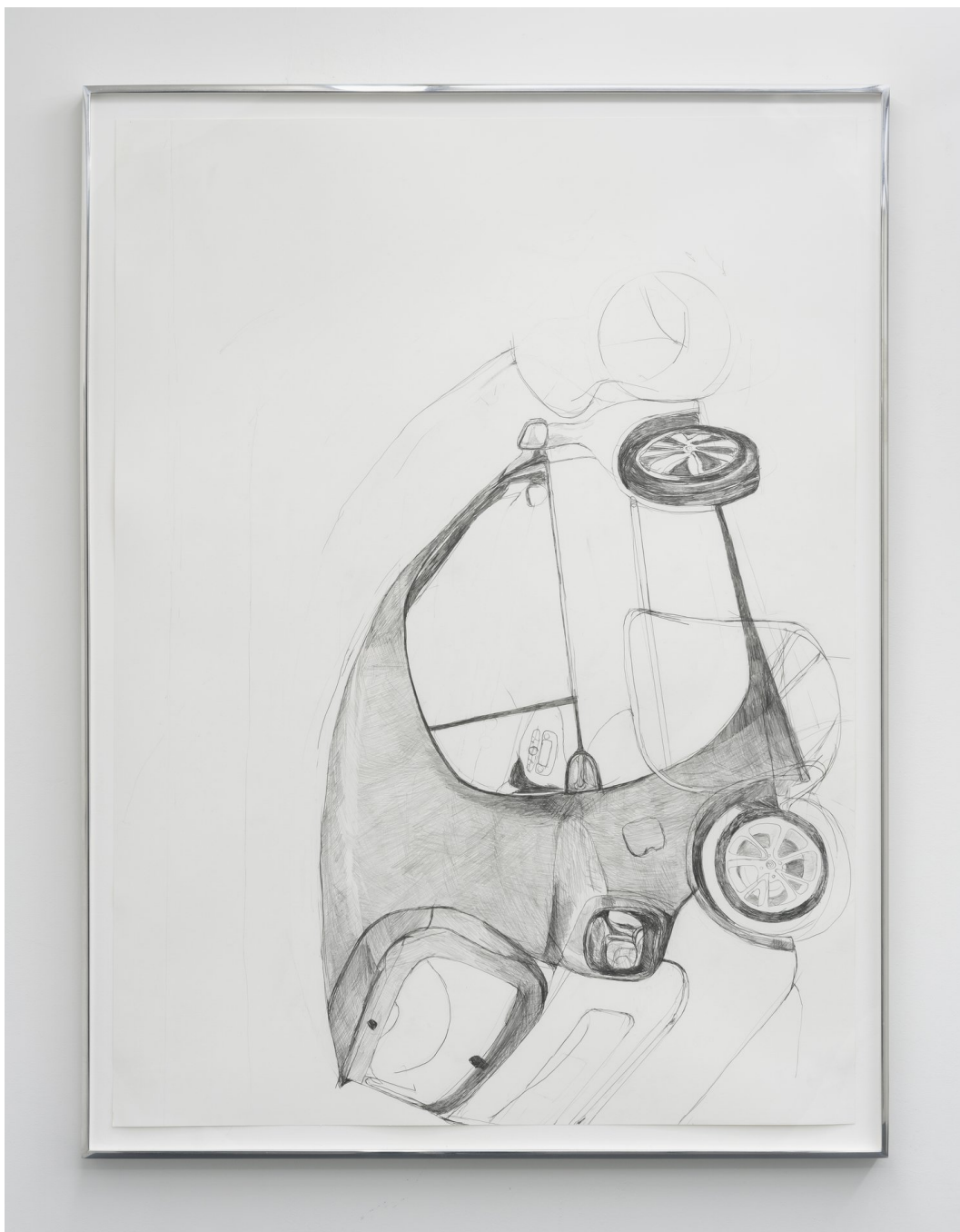
Tony Chrenka Untitled, 2021 Graphite on paper 28 x 38 in