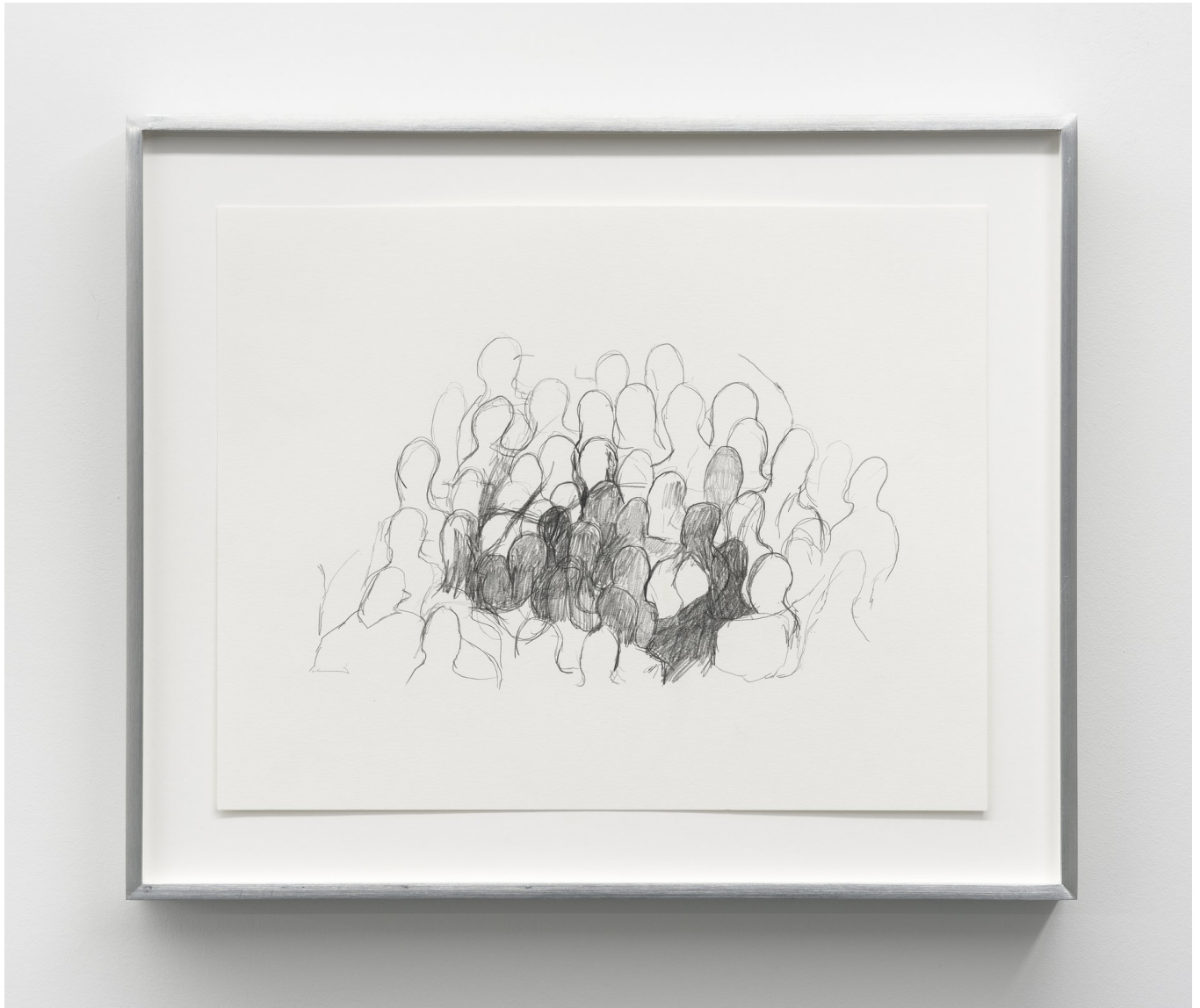
Tony Chrenka Untitled (Group) , 2021 Graphite on paper 11 x 14 in