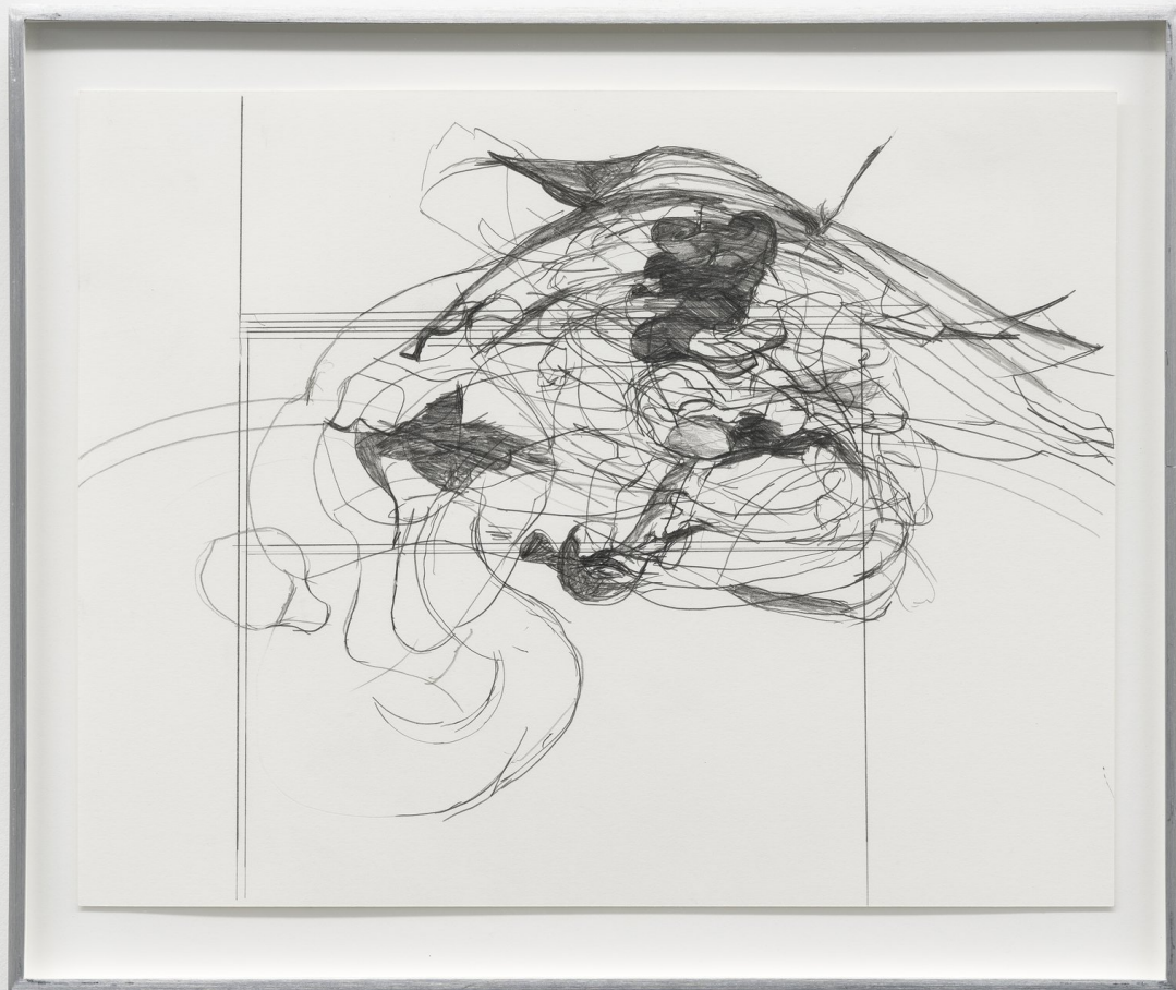
Tony Chrenka Untitled, 2021 Graphite on paper 11 x 14 in