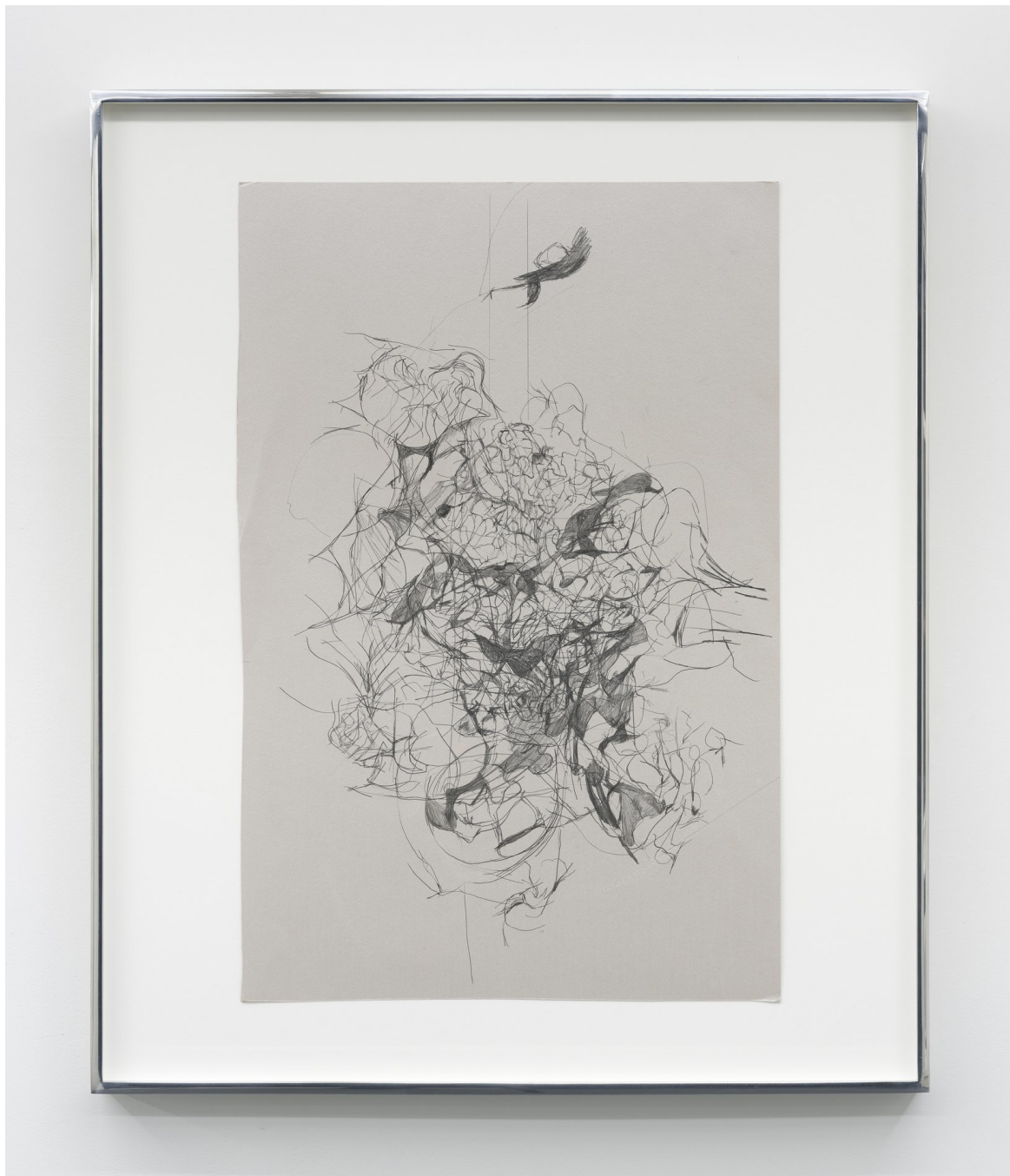
Tony Chrenka Untitled (silver) , 2021 Graphite on paper 13 1/4 x 20 in 20 x 24 in (framed)