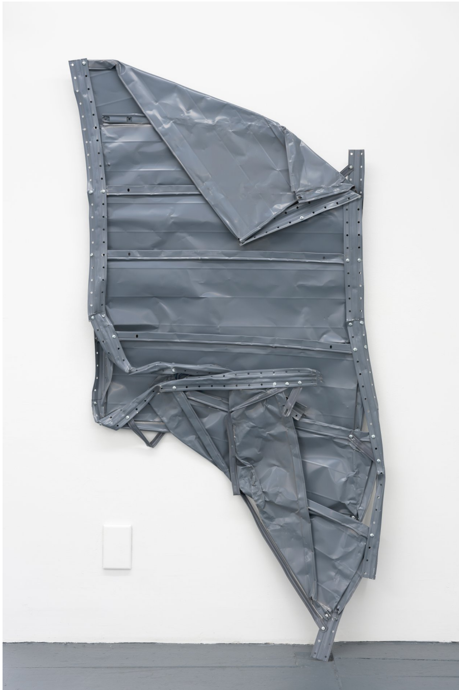
Jason Hirata Rack , 2016 Metal shelf 70 1/2 x 35 in.