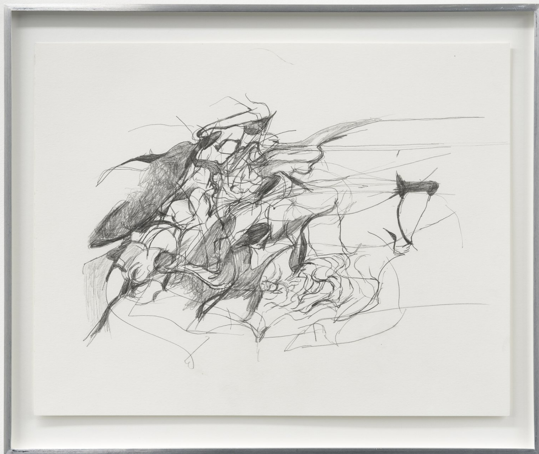
Tony Chrenka Untitled , 2021 Graphite on paper 11 x 14 in