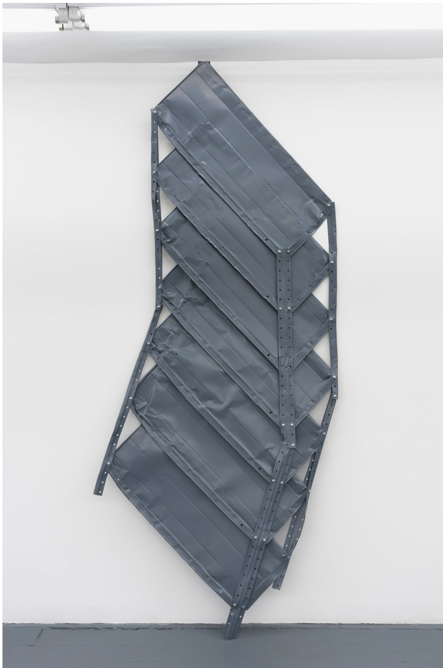
Jason Hirata Different Telling of the Same Story, 2016 Metal shelf 86 x 35 1/2 in.