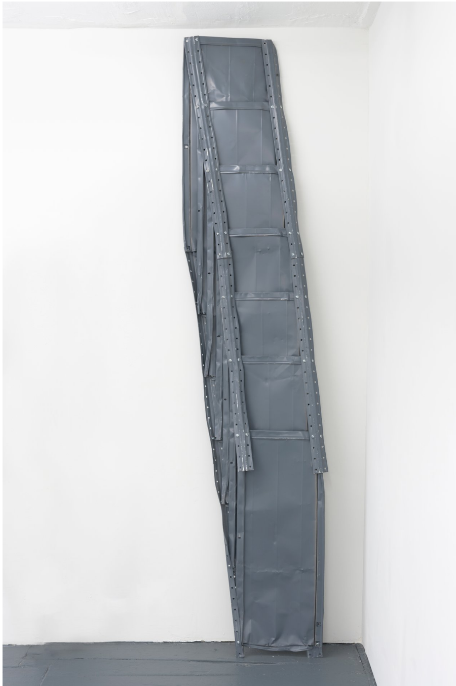
Jason Hirata Upstairs Neighbor , 2016 Metal shelf 90 1/2 x 17 in