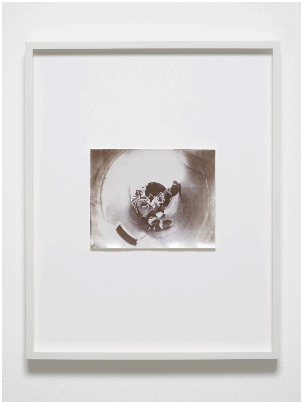
480 Hour Breakdown, 2017 Silver-gelatin print treated with simulated stomach acid