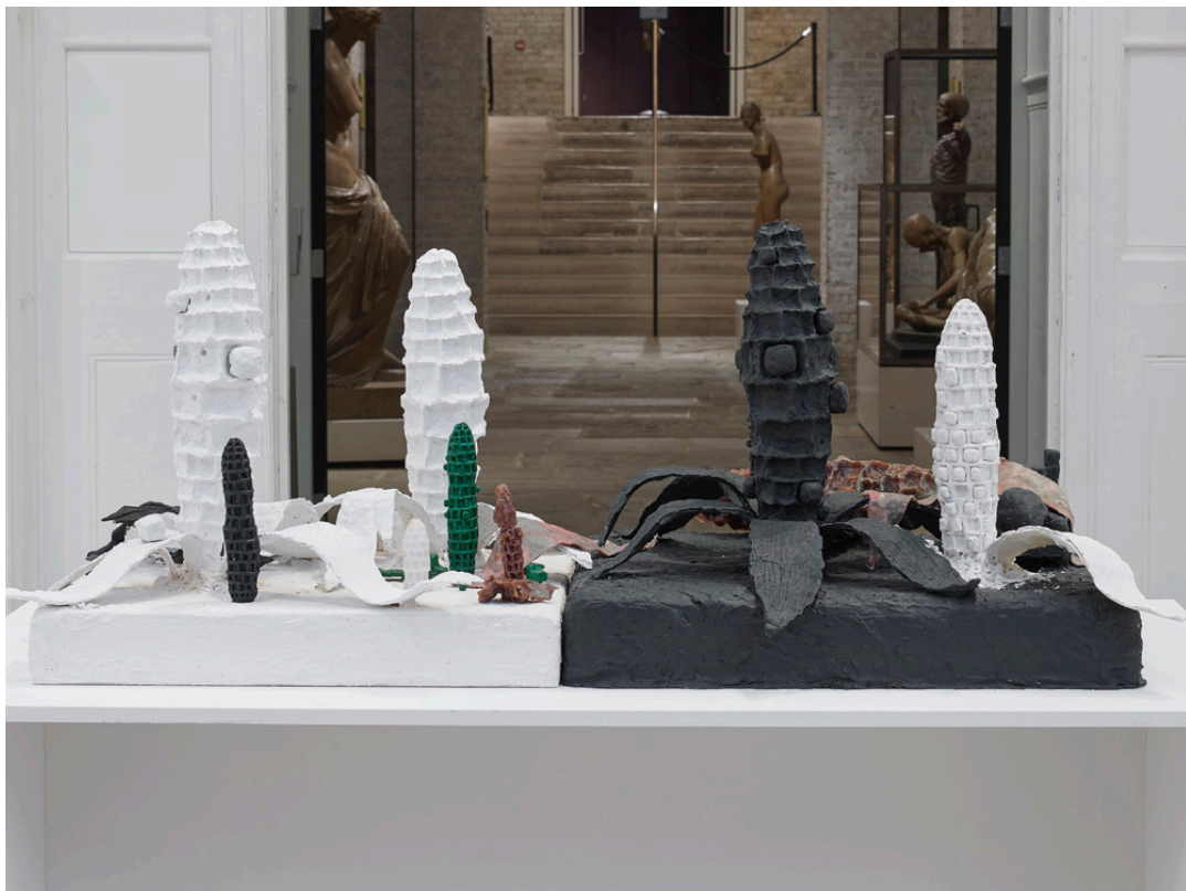
Corn Sculpture, 2021 Jesmonite, plaster, wax, paint, polystyrene, wood, steel, MDF