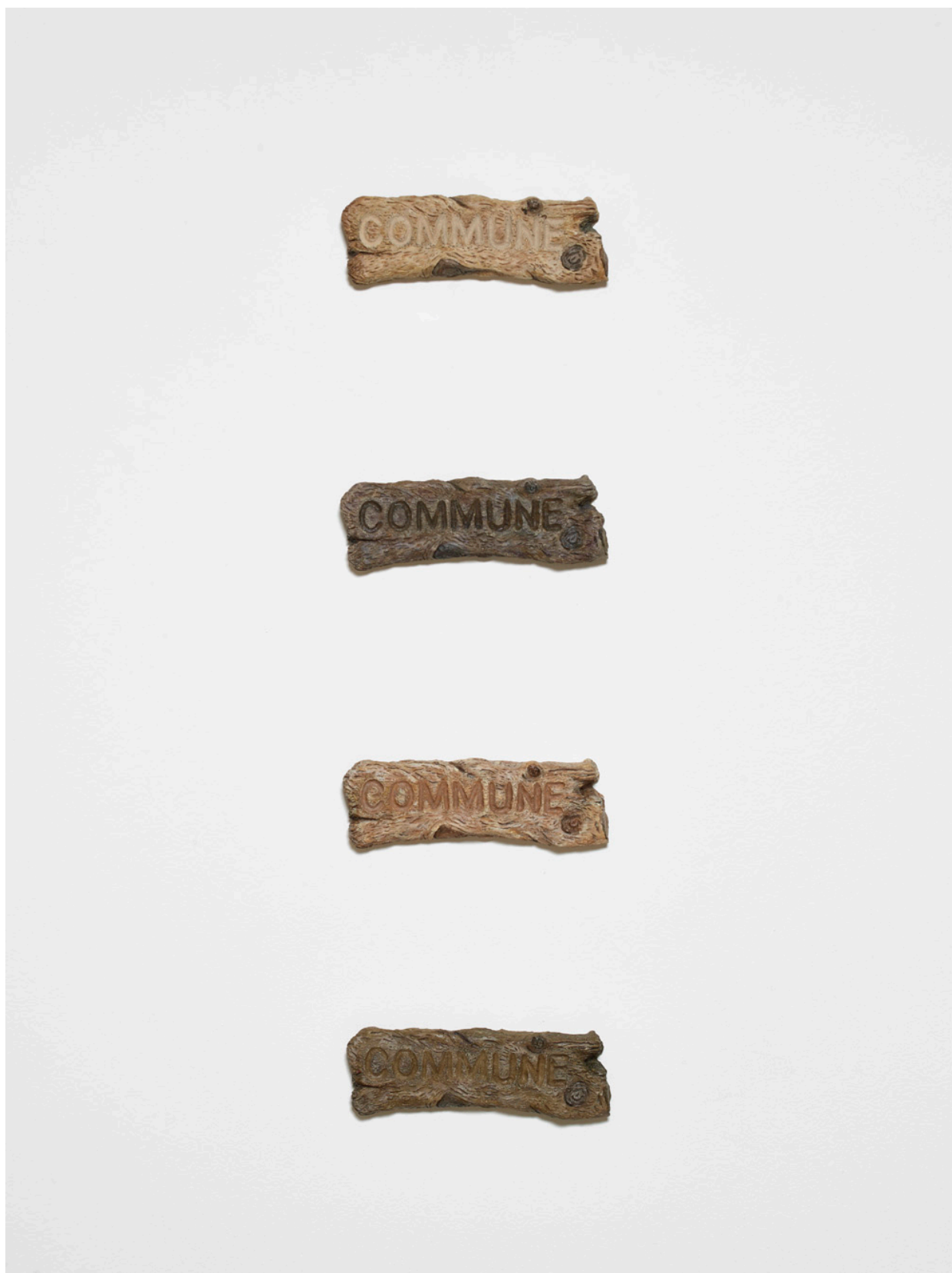
Commune , 2020-2021 Plaster, acrylic paint