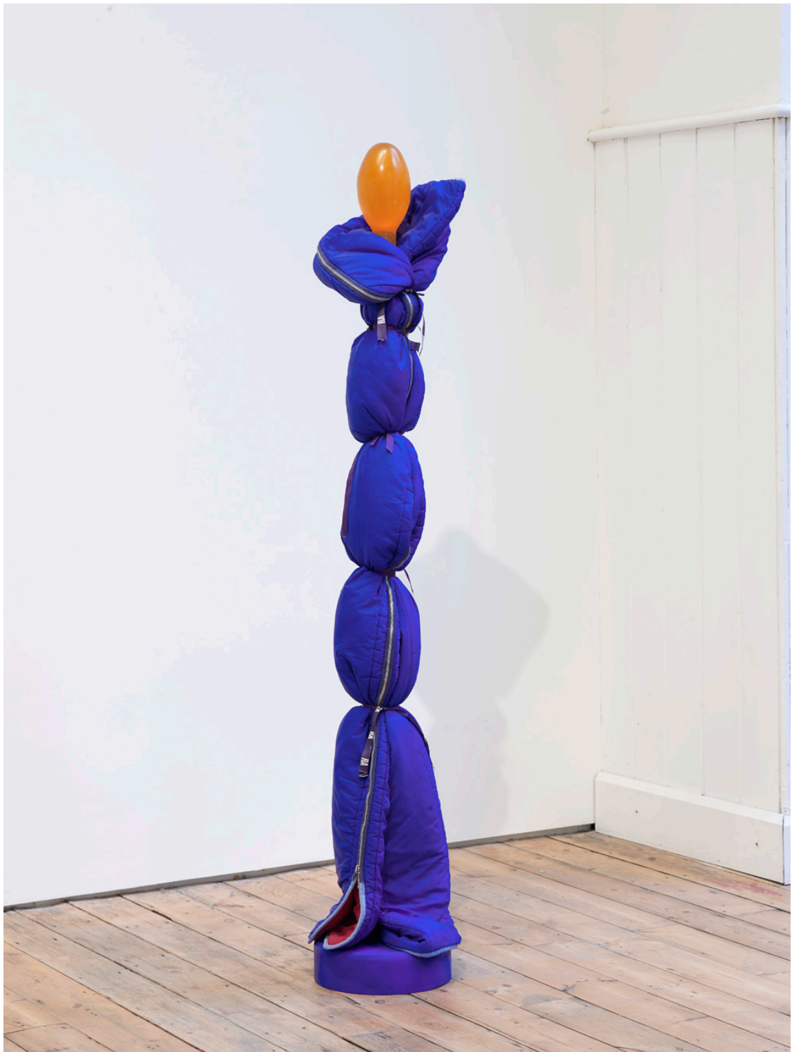
Beacon , 2021 Polyurethane, sleeping bag, straps, MDF, paint, steel