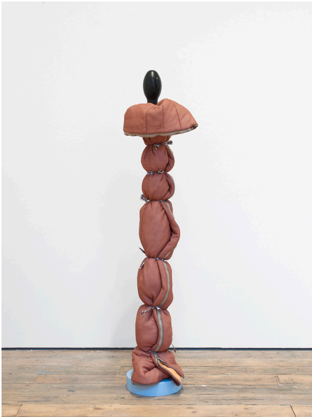
Beacon , 2021

Polyurethane, sleeping bag, wadding, straps, MDF, paint, steel