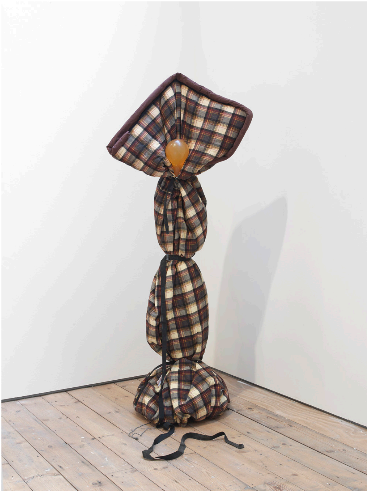
Beacon , 2021 Polyurethane, sleeping bag, straps, MDF, paint, steel