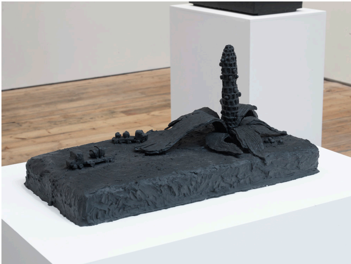
Corn Sculpture , 2021 Jesmonite, acrylic paint, polystyrene, MDF Edition of 2, 1 AP