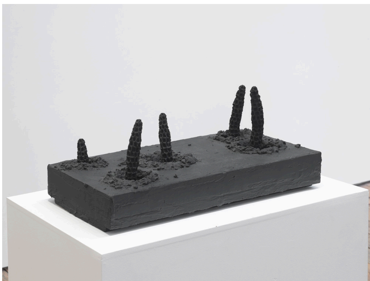
Corn Sculpture , 2021 Jesmonite, acrylic paint, pebbles, polystyrene, MDF Edition of 2, 1 AP