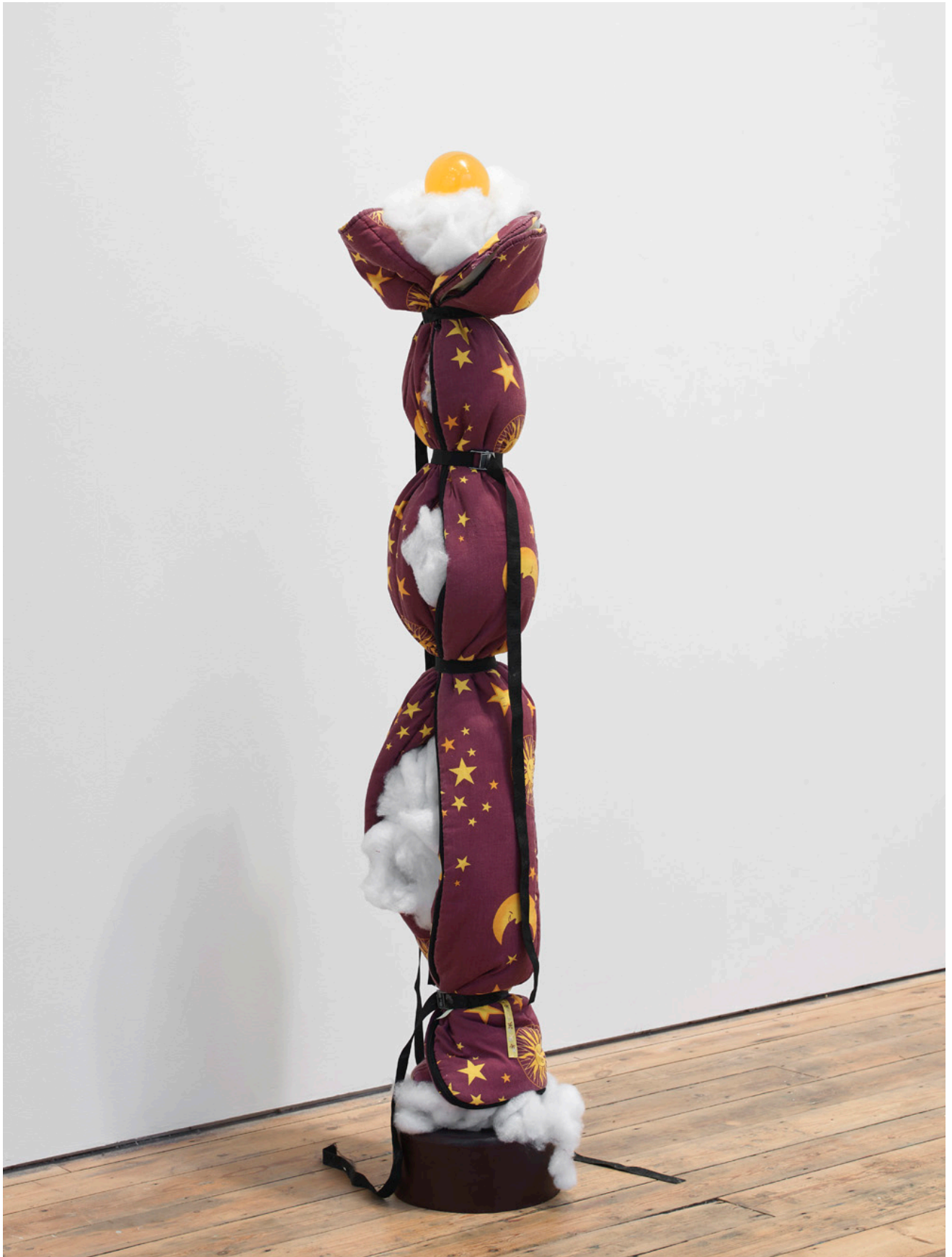
Beacon , 2021

Polyurethane, sleeping bag, wadding, straps, MDF, paint, steel