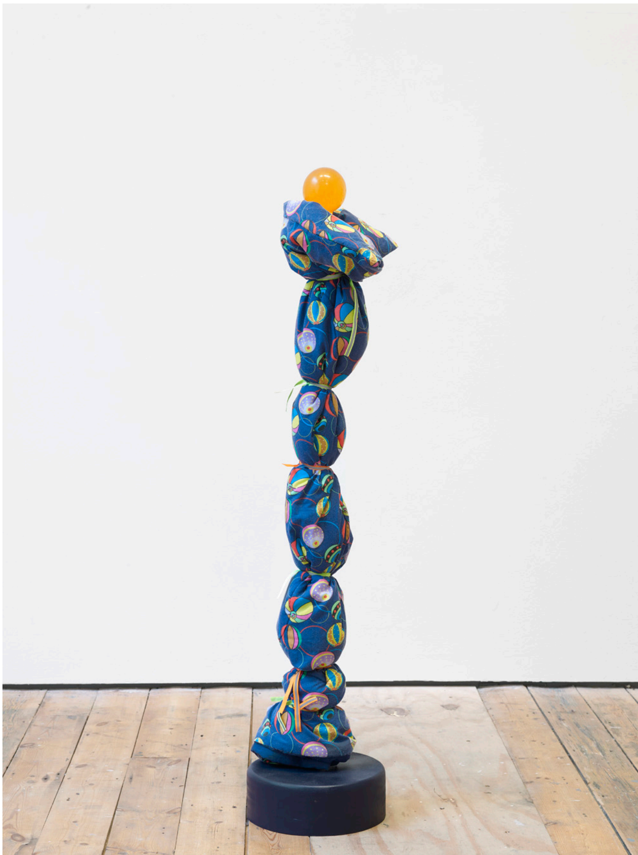
Beacon , 2021

Polyurethane, sleeping bag, straps, MDF, paint, steel