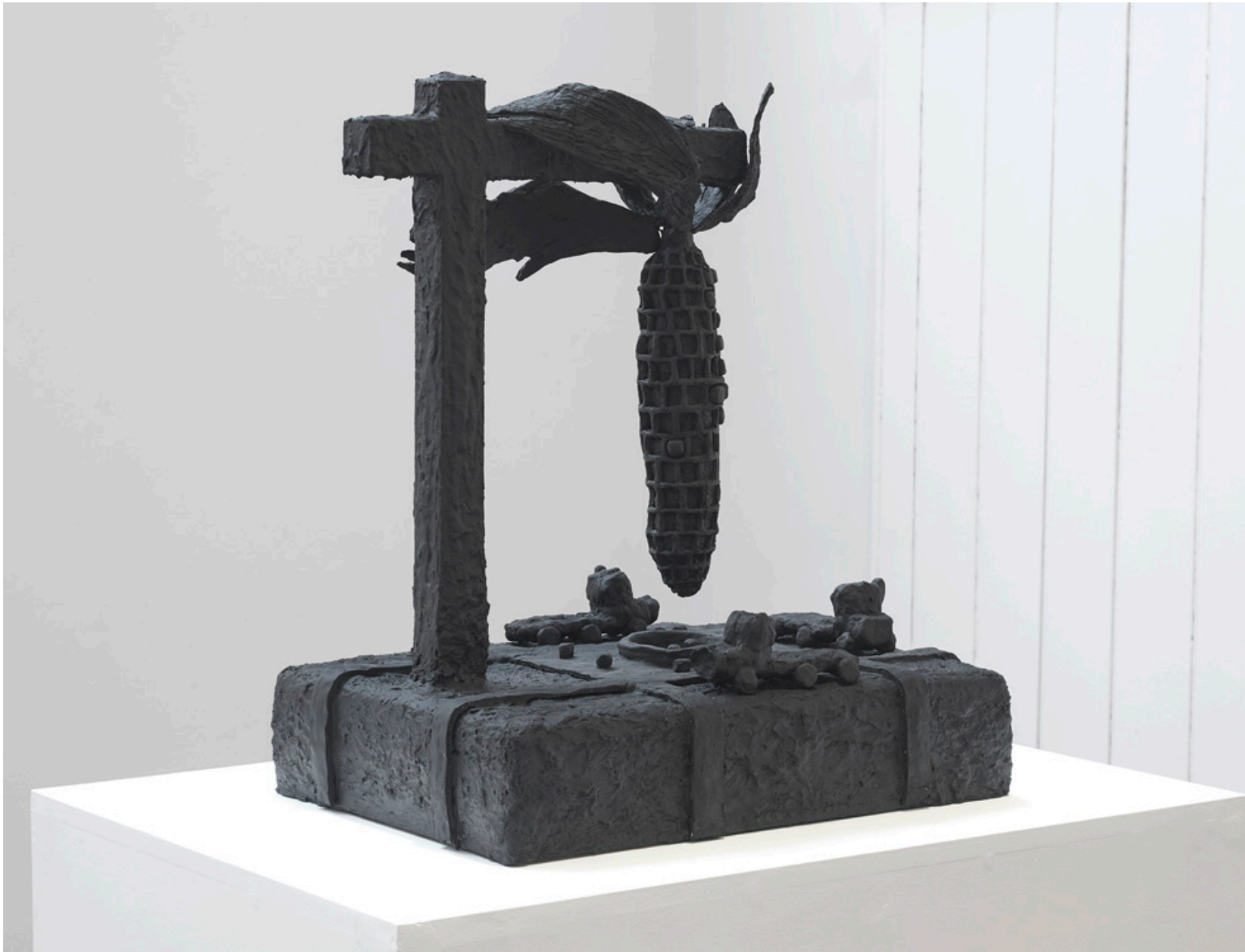
Corn Sculpture , 2021 Jesmonite, acrylic paint, polystyrene, wood, steel, MDF Edition of 2, 1 AP