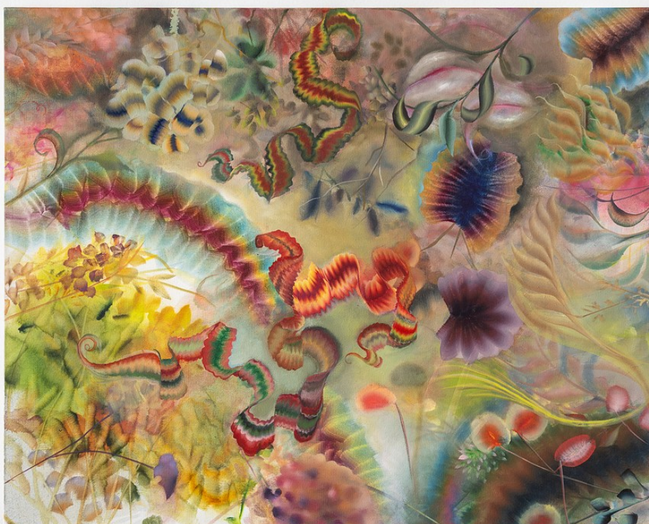
Autumn Ramsey, Stream, oil on canvas, 61 × 76 cm, 2021