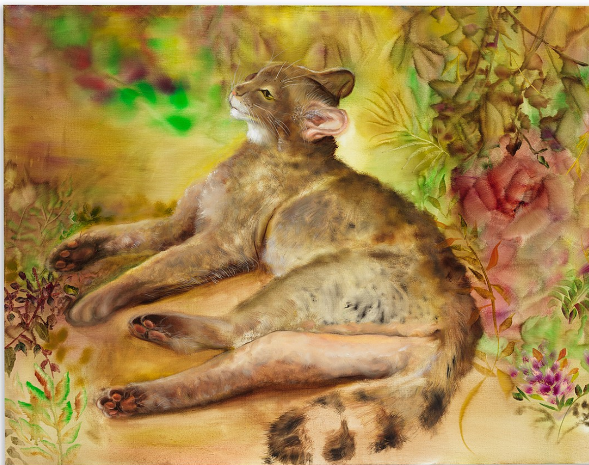
Autumn Ramsey, The Creation Myth, oil on canvas, 61 × 76 cm, 2021