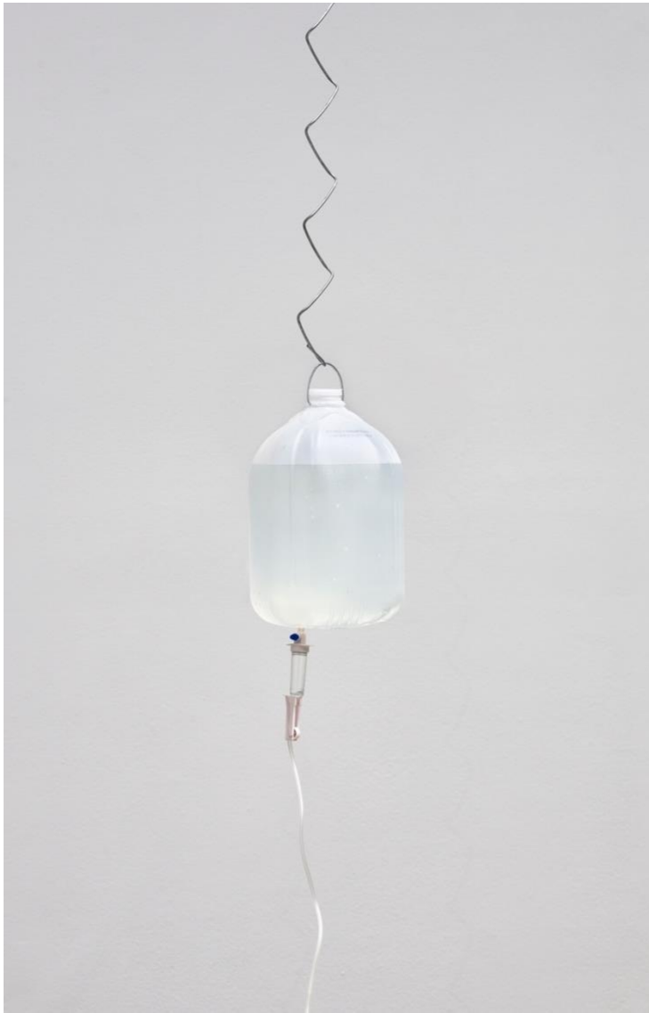
Hold/Fold 1, 2021 (detail)

Plaster, foam, aluminum, weeds, water bottle, iv tube, and chain link wire 96 x 114 x 24 in. (243.8 x 289.6 x 70 cm)