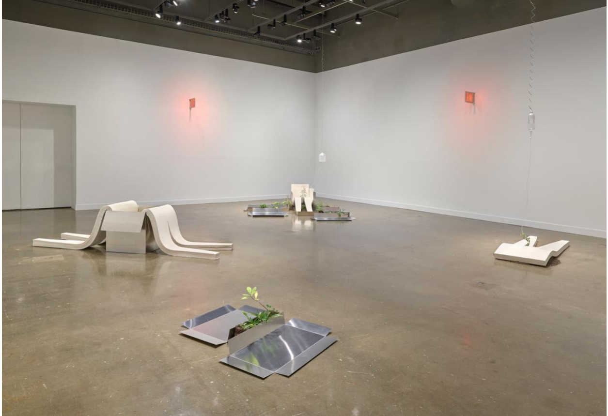
Installation view: Sreshta Rit Premnath: Grave/Grove at MIT List Visual Arts Center, Cambridge 2021.

Alt text: A gallery at the MIT List Visual Arts Center features sculptures consisting of white plaster slumps, aluminum sheets, weeds, and red glowing signs on the walls.