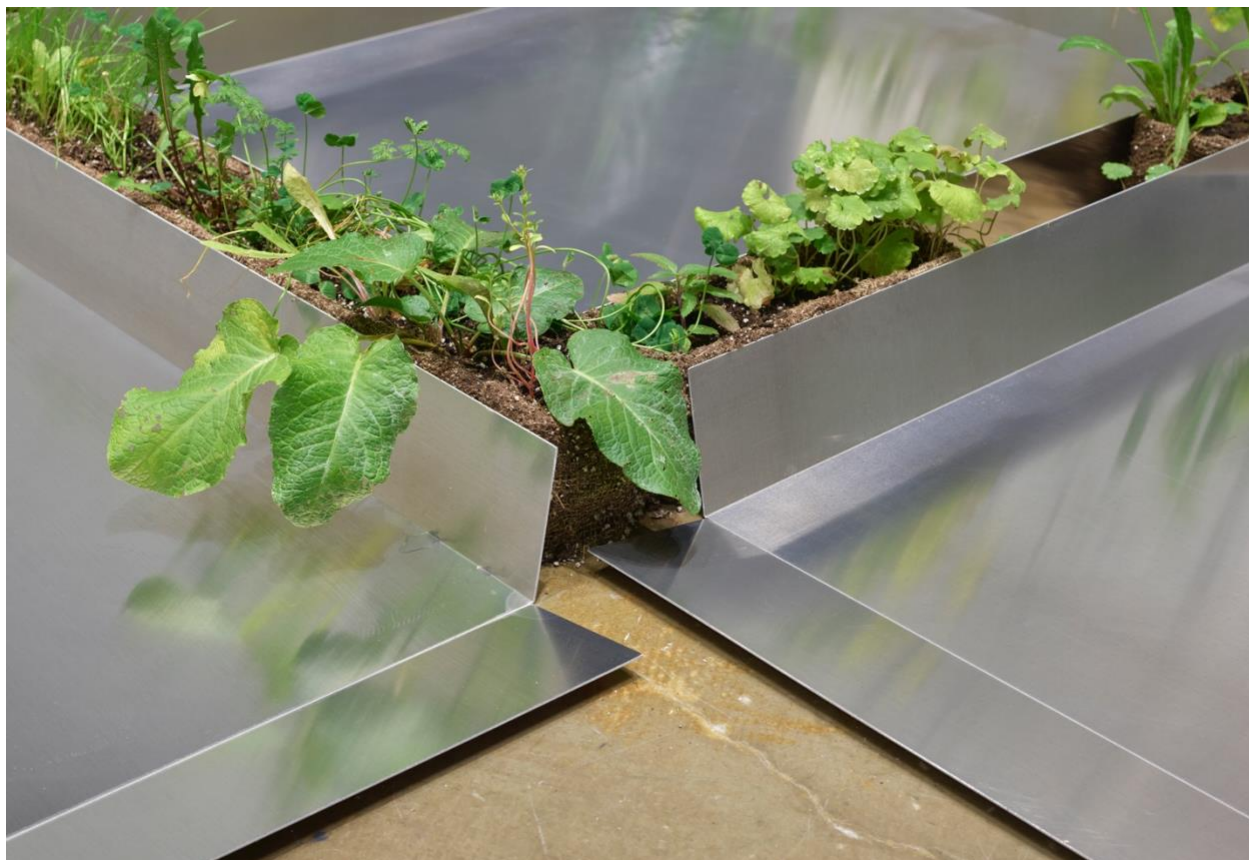
Installation view: Sreshta Rit Premnath: Grave/Grove at MIT List Visual Arts Center, Cambridge, 2021.

Alt text: A detail of a sculpture by Sreshta Rit Premnath features dirt and weeds sandwiched between aluminum sheets.