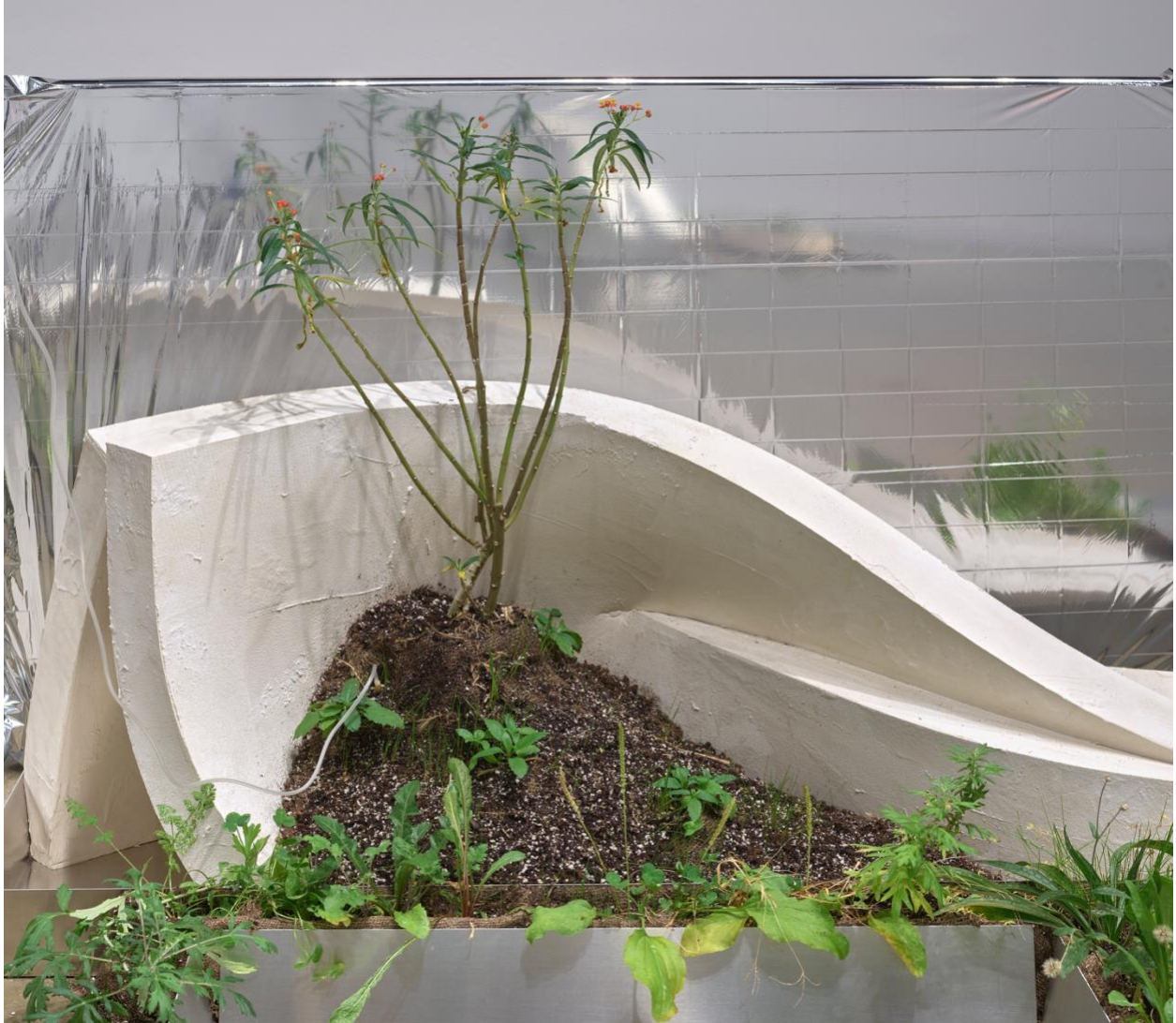
Hold/Fold 2, 2021 (detail)

Plaster, foam, aluminum, weeds, water bottle, iv tube, and chain link wire 120 x 150 x 42 in. (304.8 × 127 × 106.7 cm)