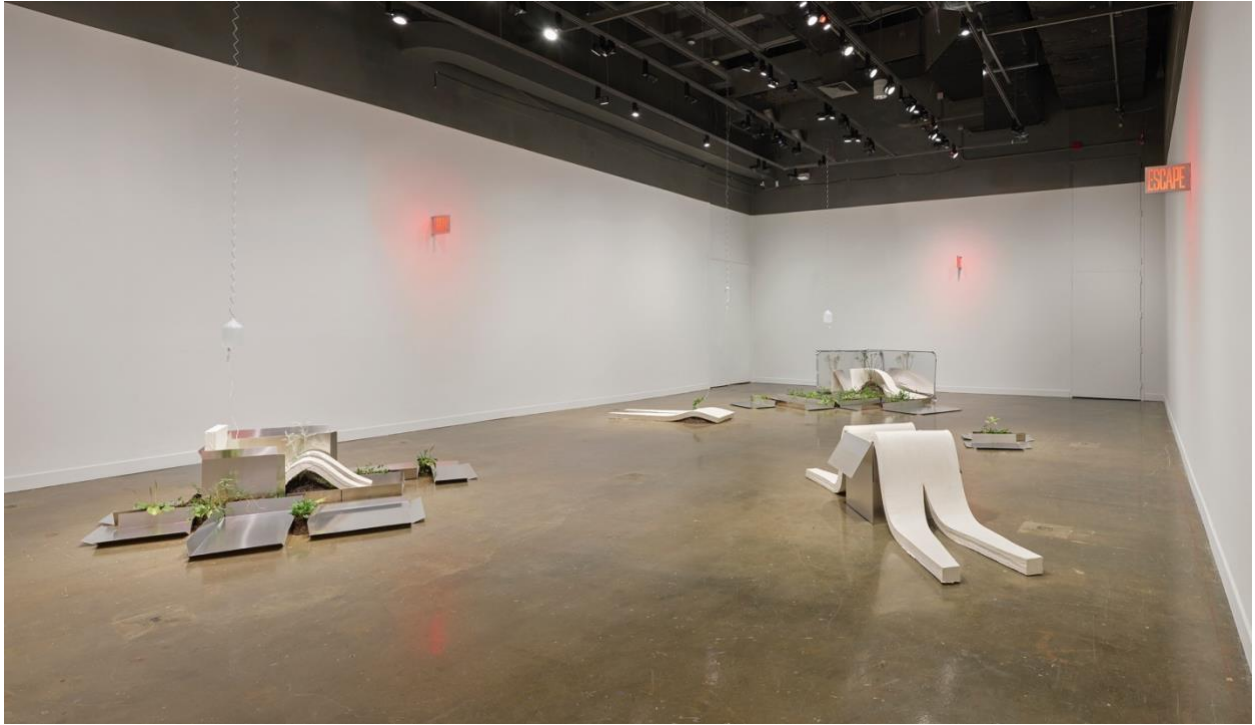
Installation view: Sreshta Rit Premnath: Grave/Grove at MIT List Visual Arts Center, Cambridge, 2021.

Alt text: A gallery at the MIT List Visual Arts Center features sculptures consisting of white plaster slumps, aluminum sheets, weeds, and red glowing signs on the walls.