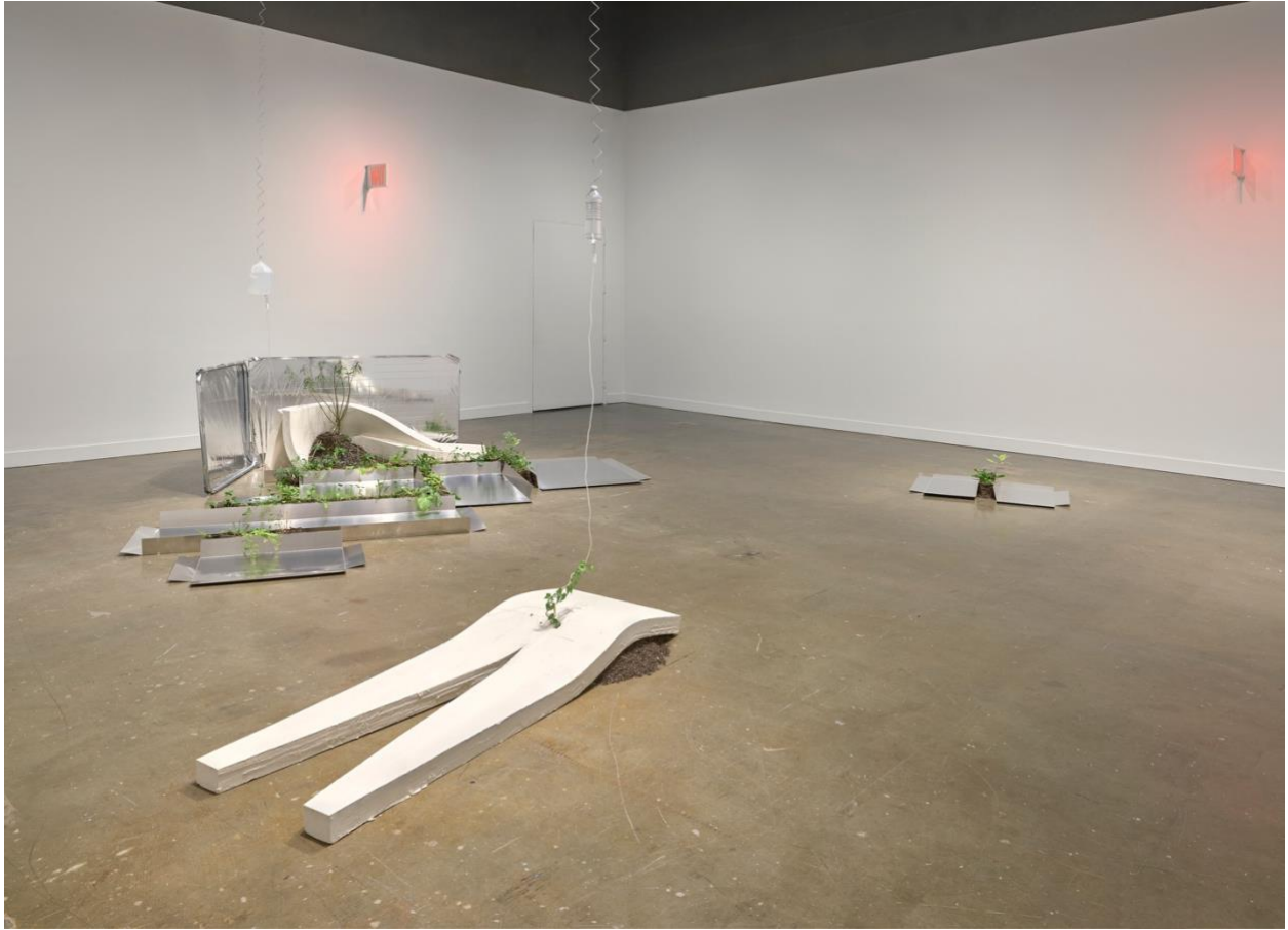
Installation view: Sreshta Rit Premnath: Grave/Grove at MIT List Visual Arts Center, Cambridge 2021.

Alt text: A gallery at the MIT List Visual Arts Center features sculptures consisting of white plaster slumps, aluminum sheets, weeds, and red glowing signs on the walls.