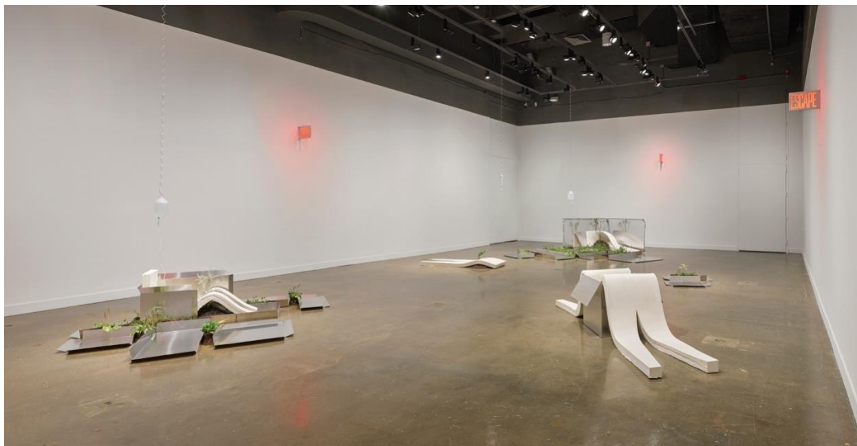
Installation view: Sreshta Rit Premnath: Grave/Grove at MIT List Visual Arts Center, Cambridge, 2021.

Alt text: A gallery at the MIT List Visual Arts Center features sculptures consisting of white plaster slumps, aluminum sheets, weeds, and red glowing signs on the walls.