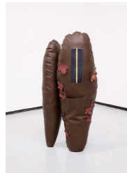
Cameron Clayborn cushioncontainercapsule, 2021 denim, fiber fill, sand, vinyl, velcro and zipper 41 x 20 x 9.5" (104.14 x 50.80 x 24.13cm)