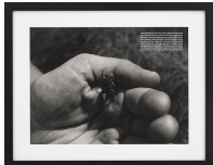
David Wojnarowicz What is this little guy's job in the world, 1990 B&W photograph (AP) 13.75 x 18.8" (34.9 x 47.3cm)