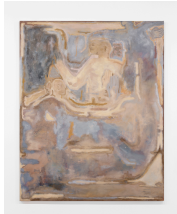
Yi To Bootstrap Paradox, 2021 Oil on canvas 59 x 51.2" (150 x 130cm)