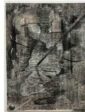
Sergio Suárez Cave, 2021 Woodcut print, India ink, charcoal and wax pencil on muslin 40 x 30" (101.6 x 76.2cm)