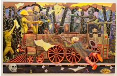
Joel Dean Small World Express: Engine #1, 2021 Oil on canvas 51.5 x 81"