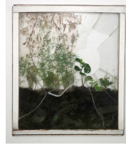
Justin Sterling Cycle (after Tori Verber-Salazar), 2021 Found window, organic matter, soil, gravel, caulking 37 x 31 x 2"