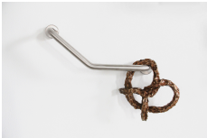
Carly Mandell Mall Pretzel, 2021 Bronze and aluminum 25 x 18 x 5"