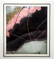
Justin Sterling Renegade (after Mark Gonzalez), 2021 Found window, fiberglass, bullet casings, insulation foam, caulking 31 x 28 x 2"