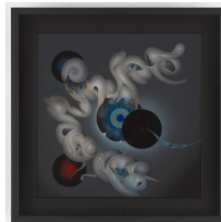
Tatsuo Ikeda Untitled, 1979 Acrylic on paper 15.5 x 15.5" (39.5 x 39.5cm)