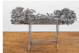
Rachelle Dang Lodestar, 2021 Salvaged aluminum, wire mesh, air dried clay, epoxy, resin, paint 46 x 72 x 36"