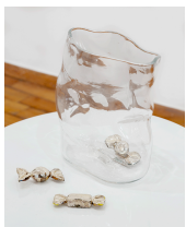
Carly Mandel Glass Handbag + Lozenges, 2021 26 x 16.5 x 13"