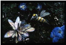
David Wojnarowicz Money Bee II, 1990 color photograph 9.25 x 14" (23.5 x 35.56cm)