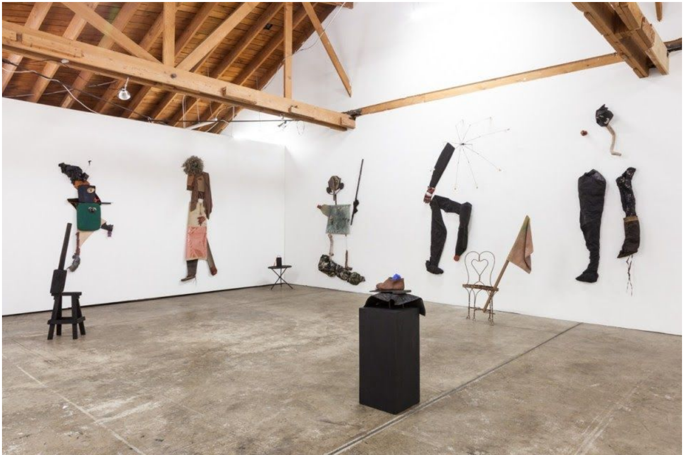
Installation view of Blair Saxon-Hill, to no ending except ourselves, December 3, 2016 - January 29, 2017, JOAN, Los Angeles.