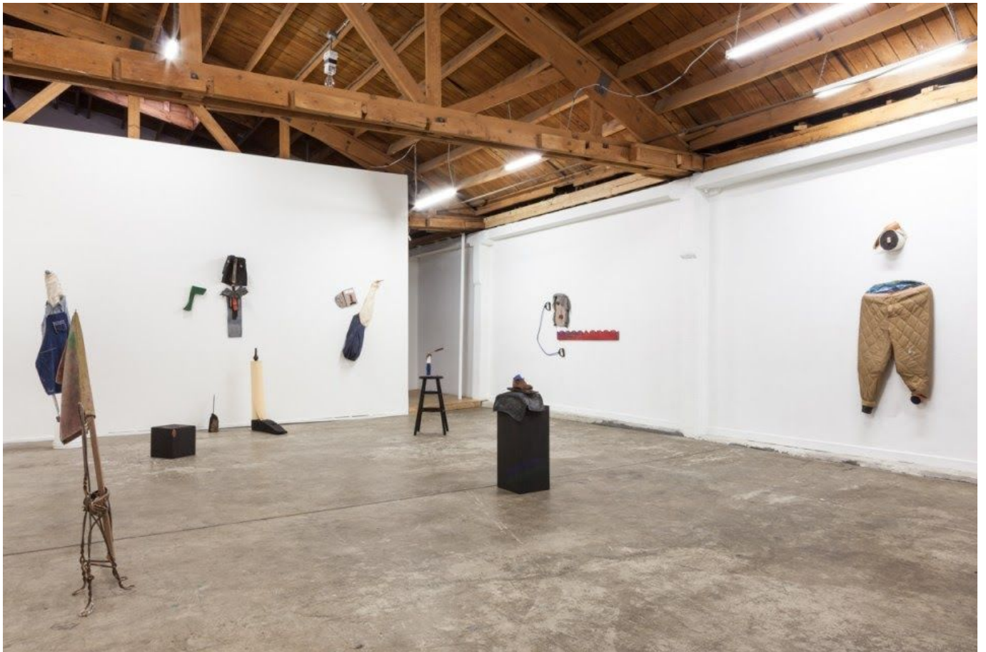
Installation view of Blair Saxon-Hill, to no ending except ourselves, December 3, 2016 - January 29, 2017, JOAN, Los Angeles.