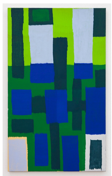
Joshua Abelow, Untitled, 2020, oil on linen, 40 x 24 inches

ND : I think that really comes across in the paintings. They feel like a pretty big departure from your previous work. Clearly they grew out of what came before, and are related, but these new works seem much more contemplative and much broader in terms of the possibilities of what can happen in each painting, what each painting is about, and how the parts of the painting relate to one another. They're surprisingly expansive. Did this entire body of work, the Leaky Abstractions , come about after the beginning of the pandemic?