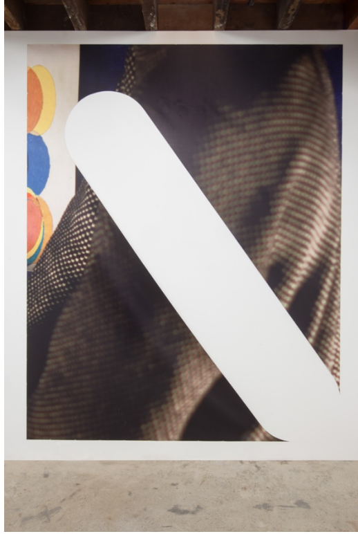
Nathan Dilworth, Untitled, 2015, UV print on vinyl, 98 x 76 inches

ND: A little bit, yes. I mean that was in my mind when I was making it. It was partially about trying to make the documentation as ambiguous as the original work.