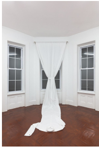
Bea Fremderman Untitled , 2021 Cotton, buttons, cufflinks, & curtain rod