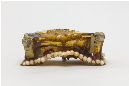
Sharona Franklin Survival Repose , 2021 Gelatin, tapioca pearls, sanitary alcohol wipes, metal hardware, & gerbera daisy 2 1/2 x 8 x 3 1/1 inches