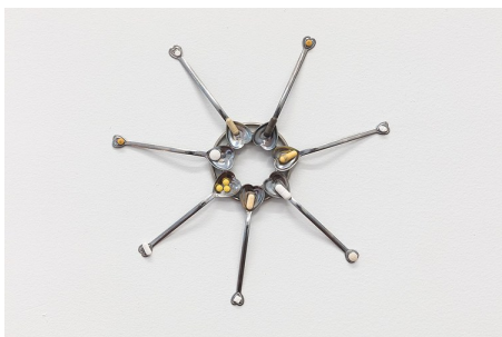
Sharona Franklin Compassion Crip Clock , 2021 Spoons, metal alloy, & expired pharmaceuticals 11 1/2 x 11 1/2 inches