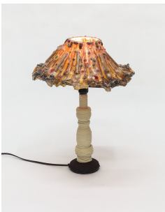
Sharona Franklin Homebound Cepheid Companion , 2021 Metal, gelatin, phone cords, shoelaces, expired pharmaceuticals, wood, polyester, dried wild botanicals, & black cherry extract 20 x 14 x 13 inches