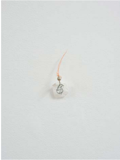
Spirit , 2021, ink on rice paper, hand dyed wool, cast silver, 8.9 x 2.5 x 3.8cm