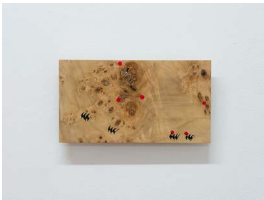
Lion, 2021, paint & shellac on cottonwood burl, 11.4 x 20.3cm