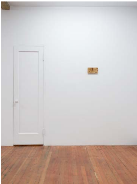
Medlar installation view