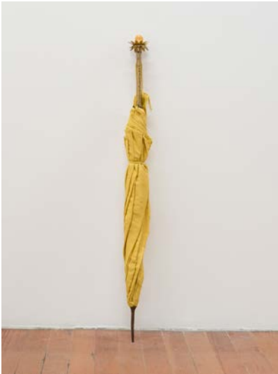
Oso , 2021, weld & fustic dyed spun silk, wood, paint, brass, found metal components, 76.2 x 6.3 x 6.3cm