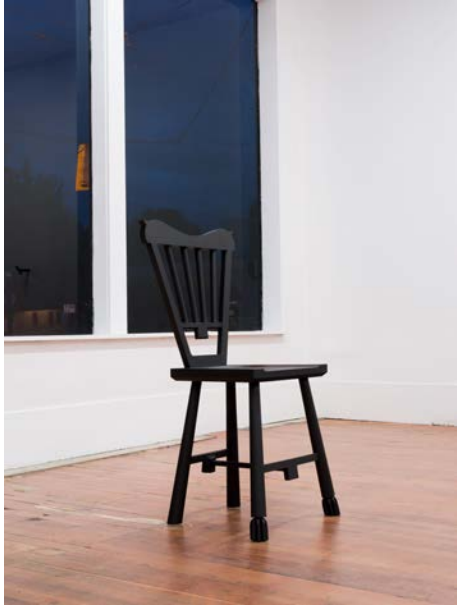
Mother furniture , 2020, cherry, milk paint, oil, 91.4 x 40.6 x 35.5cm