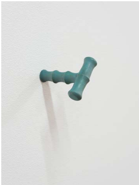
Ingress to the Ugly Room , 2021, walnut, paint, 11.4 x 8.9 x 2.5cm