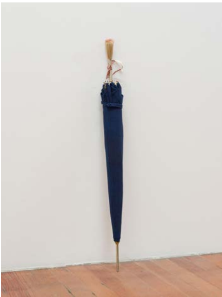
Ruddy , 2021, indigo dyed & handwoven cotton, plastic, found metal components, rice paper, 73.6 x 6.3 x 6.3cm