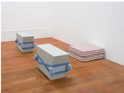
Medlar installation view