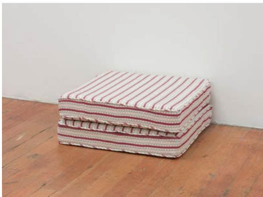
Dogged, 2021, handwoven silk, foam, zippers, thread, 40.6 x 40.6 x 15.2cm