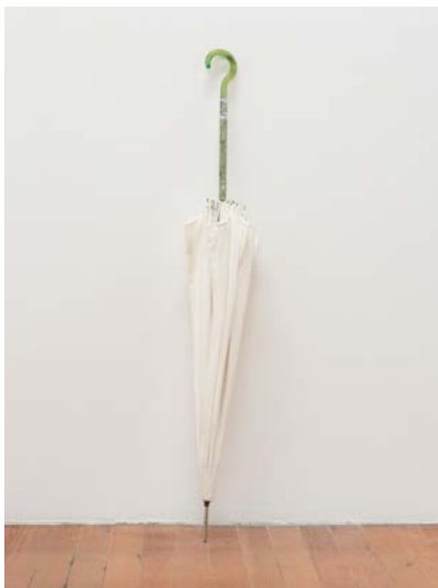
Cobweb , 2020, handwoven silk, found plastic & metal components, wrapping paper, 91.4 x 10.1 x 10.1cm