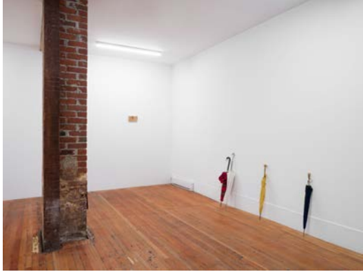
Medlar installation view