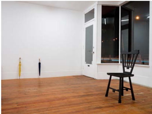
Medlar installation view