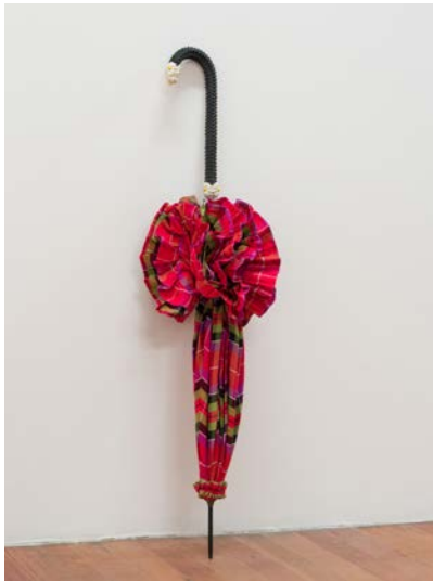
Sniff , 2019, handwoven silk, hide glue, calcium carbonate, paint, found metal components, 82.5 x 15.2 x 15.2cm