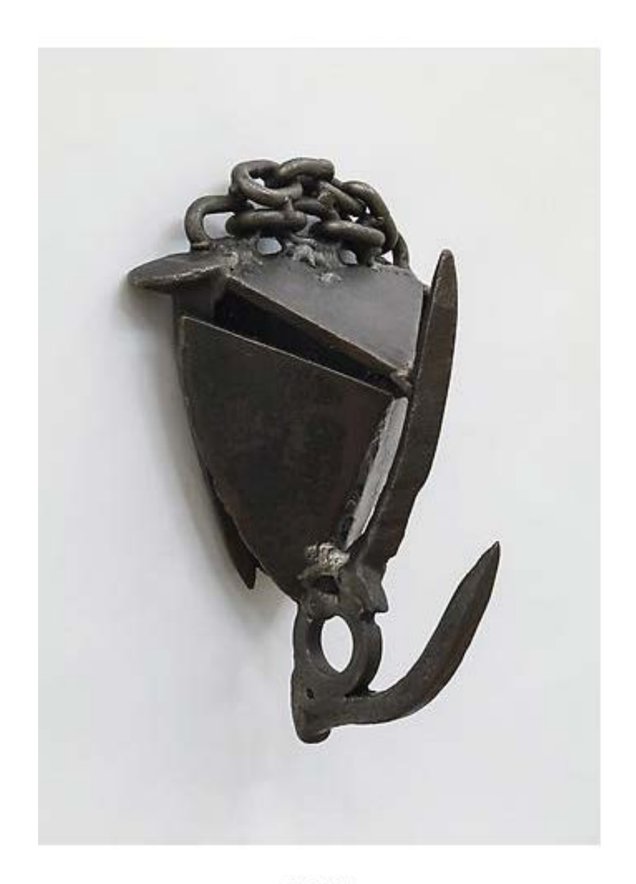
Edo (1978) Welded steel 11.5h x 8.75w x 5.63d in (29.21h x 22.23w x 14.3d cm)