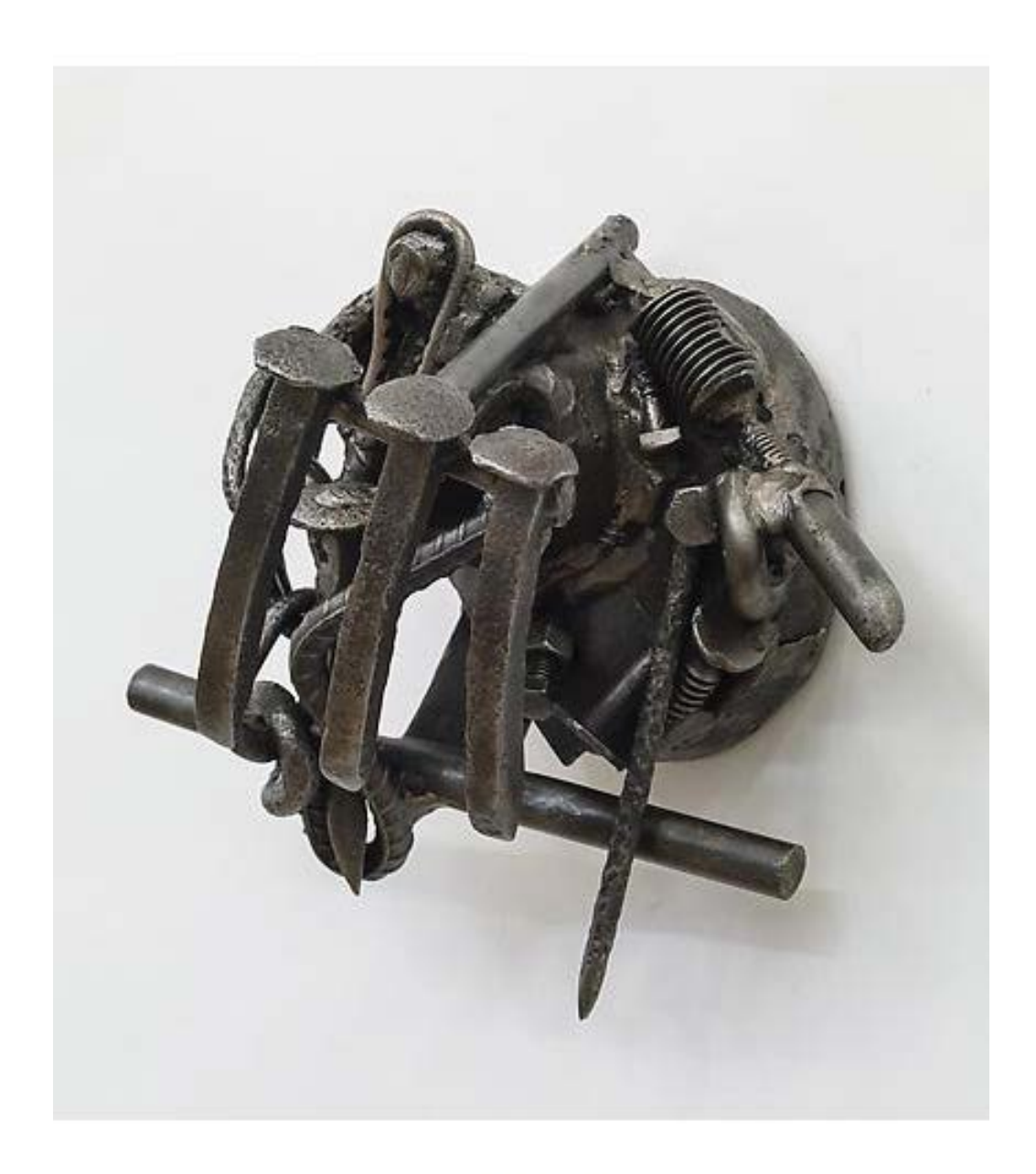
Year by Year (1994) Welded steel 10h x 11w x 8d in (25.4h x 27.94w x 20.32d cm)