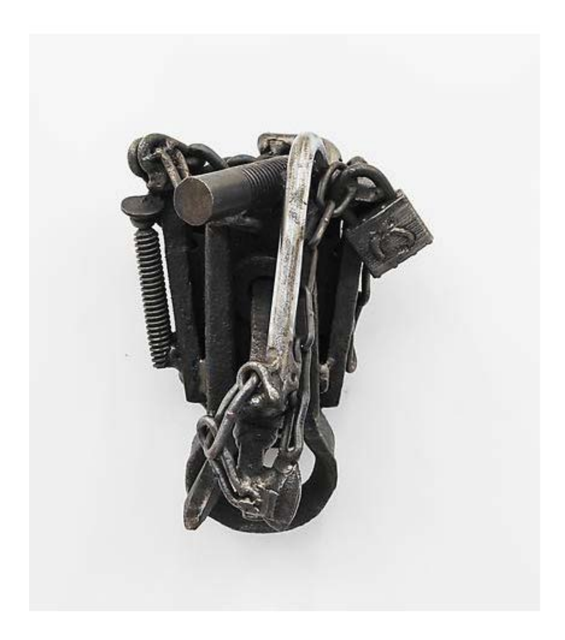
Justice for Tropic-Ana (dedicated to Ana Mendieta) (1986) Welded steel 9.75h x 7.5w x 8.13d in (24.77h x 19.05w x 20.65d cm)