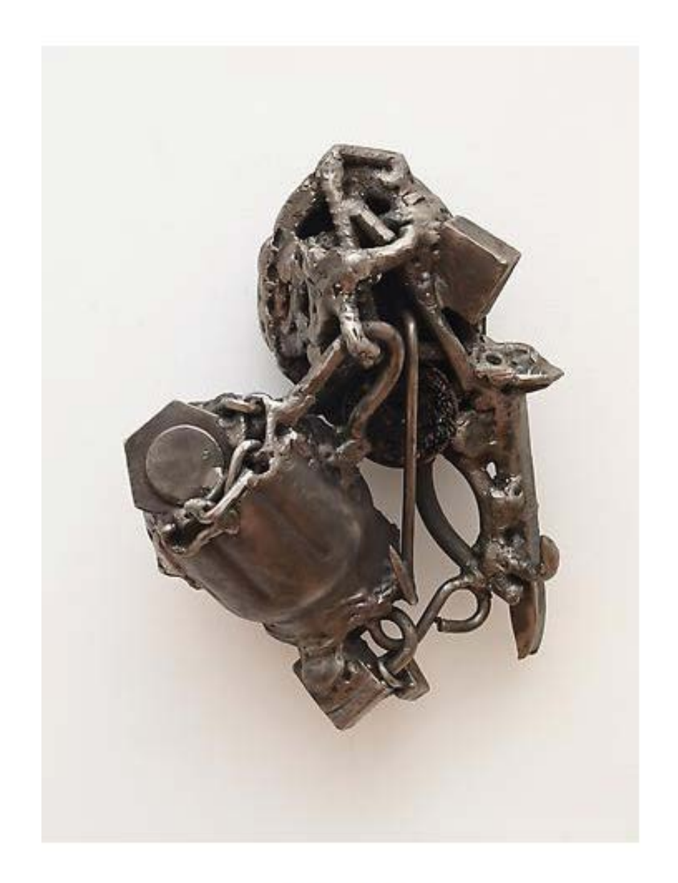
Djeri Djeff Papa Tall (2008) Welded steel 11.5h x 11.5w x 5d in (29.21h x 29.21w x 12.7d cm)