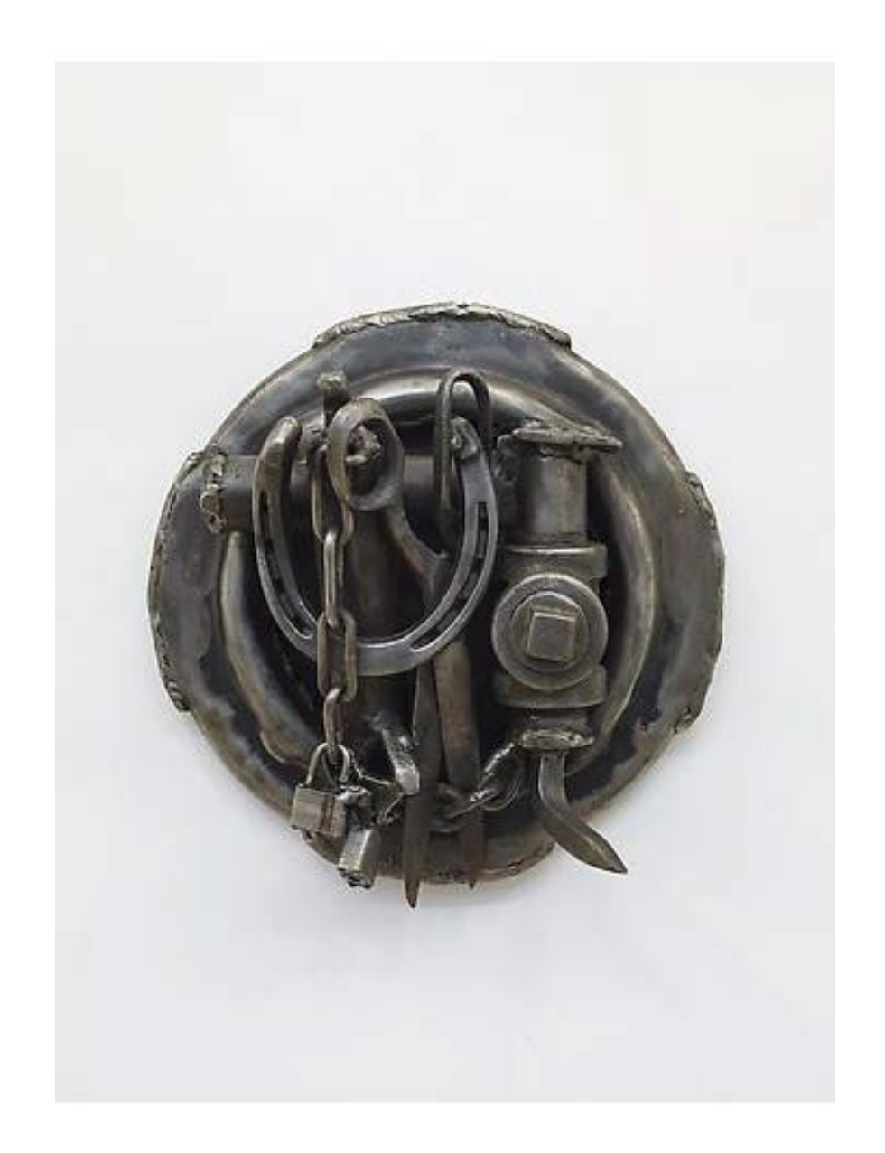
Double Info (1984) Welded steel 13h x 13w x 7.75d in (33.02h x 33.02w x 19.68d cm)