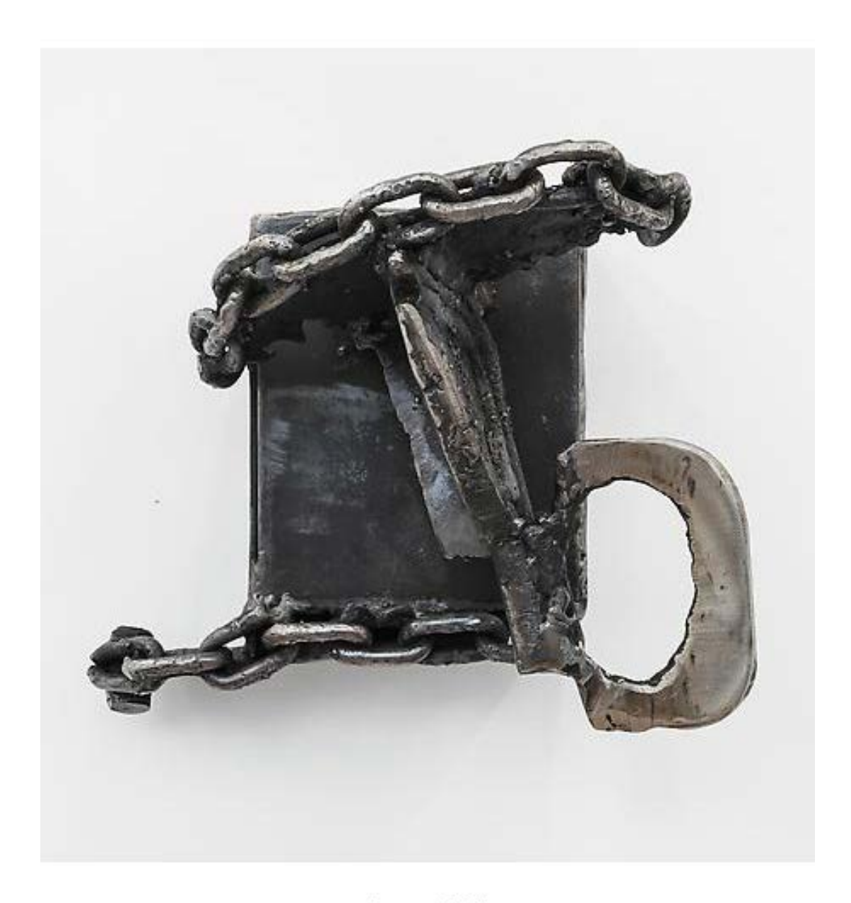
Rosewood (1995) Welded steel 7.5h x 8w x 6.75d in (19.05h x 20.32w x 17.15d cm)