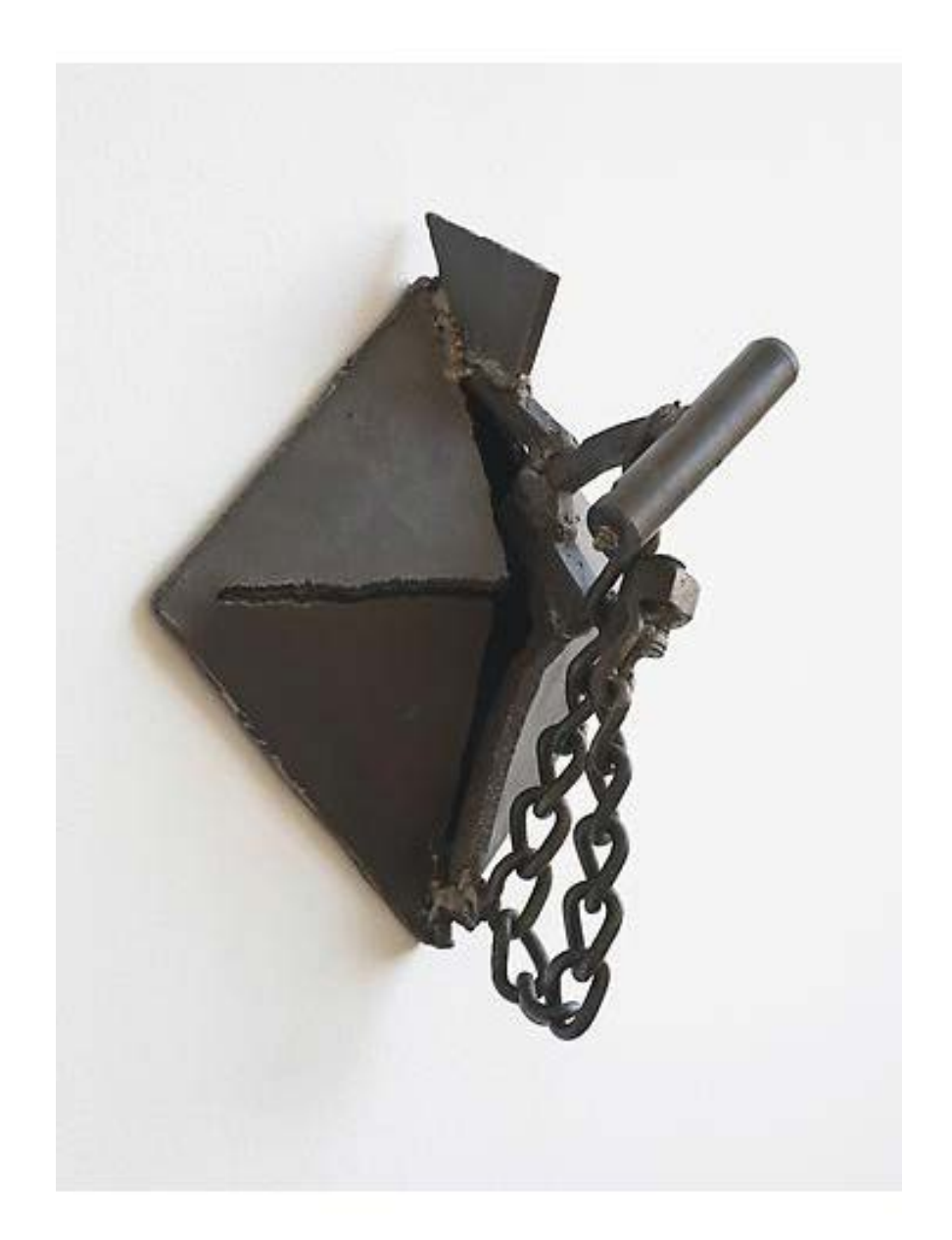
Nam (1973) Welded steel 15h x 15w x 7.5d in (38.1h x 38.1w x 19.05d cm)