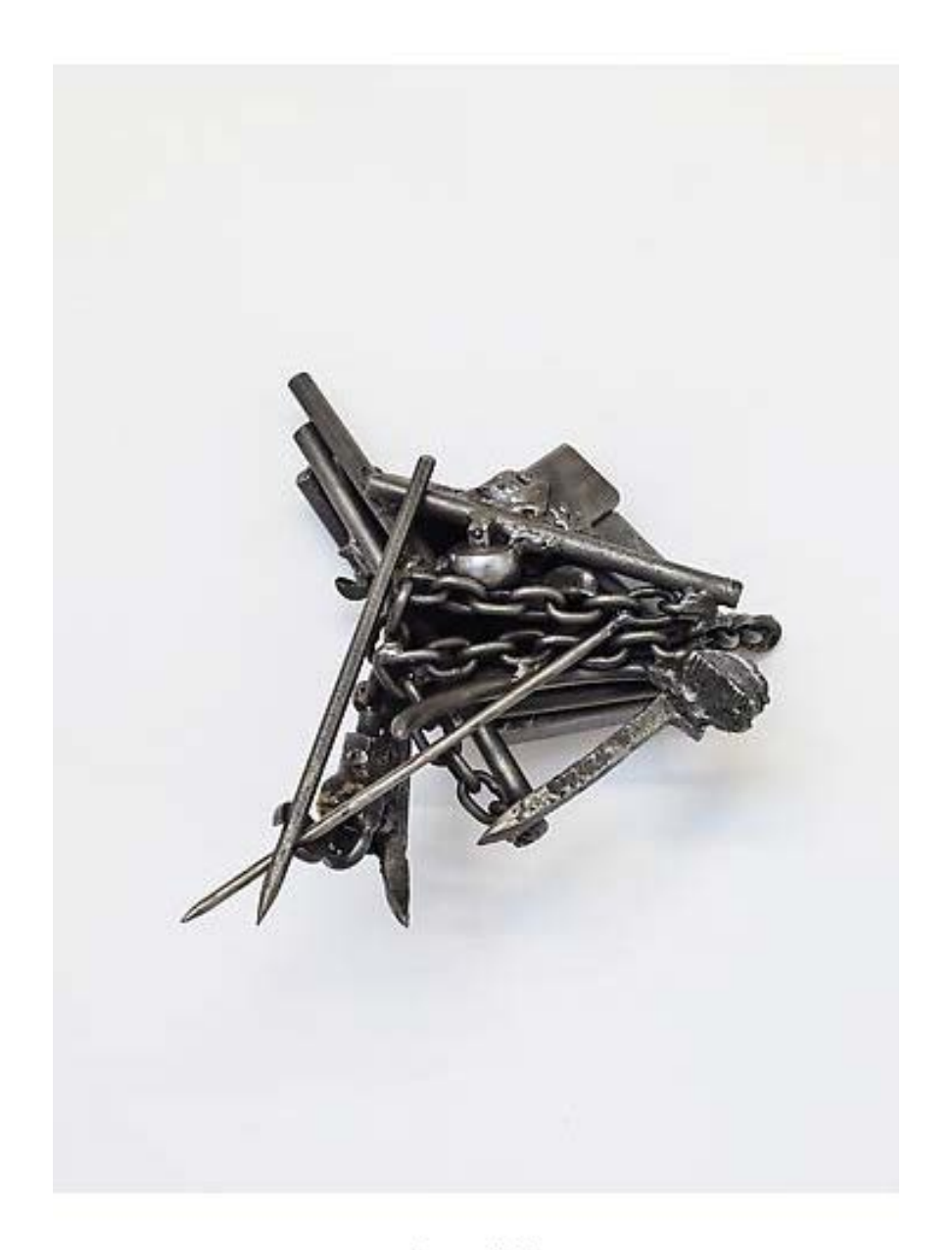
Orozoo (1996) Welded steel 15h x 14.38w x 6.25d in (38.1h x 36.53w x 15.88d cm)