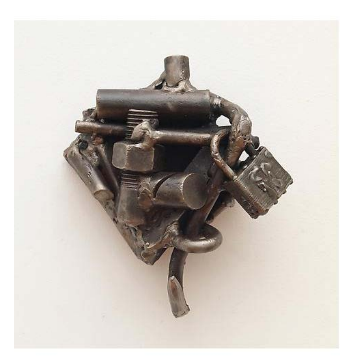
Welcome (2003) Welded steel 8.75h x 8w x 3d in (22.23h x 20.32w x 7.62d cm)