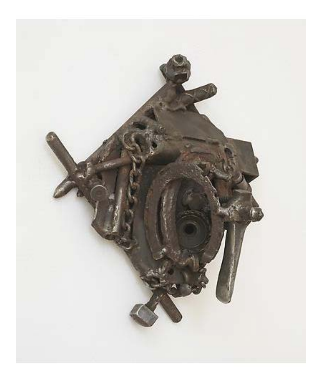
New Cult (2007) Welded steel 15h x 14w x 7d in (38.1h x 35.56w x 17.78d cm)