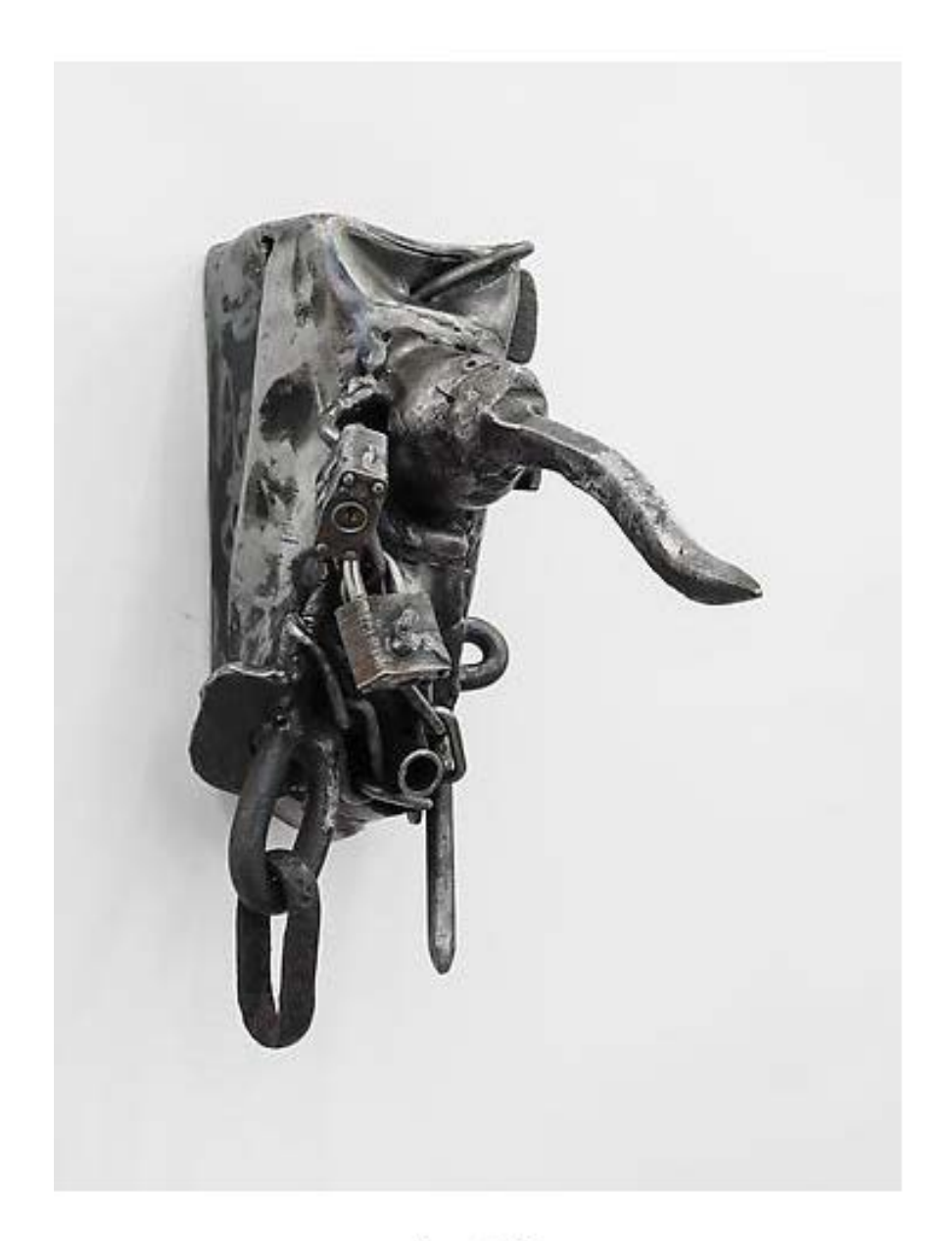
Harare (1986) Welded steel 13h x 7.75w x 11.25d in (33.02h x 19.68w x 28.58d cm)