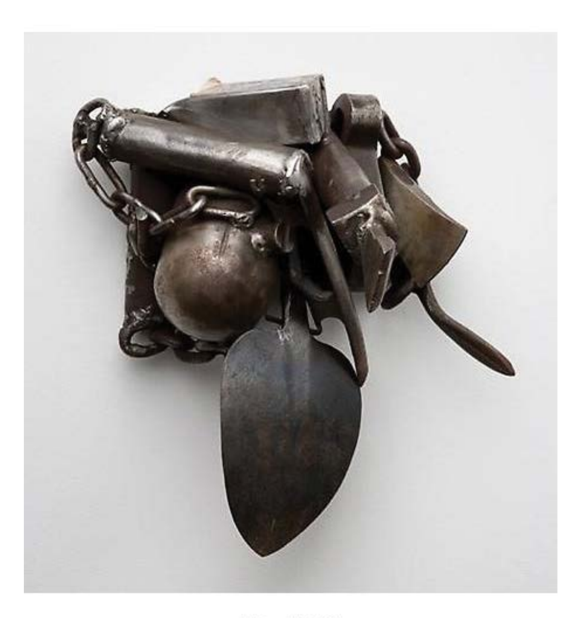
Whispers (1991-92) Welded steel 16h x 19w x 11.75d in (40.64h x 48.26w x 29.85d cm)