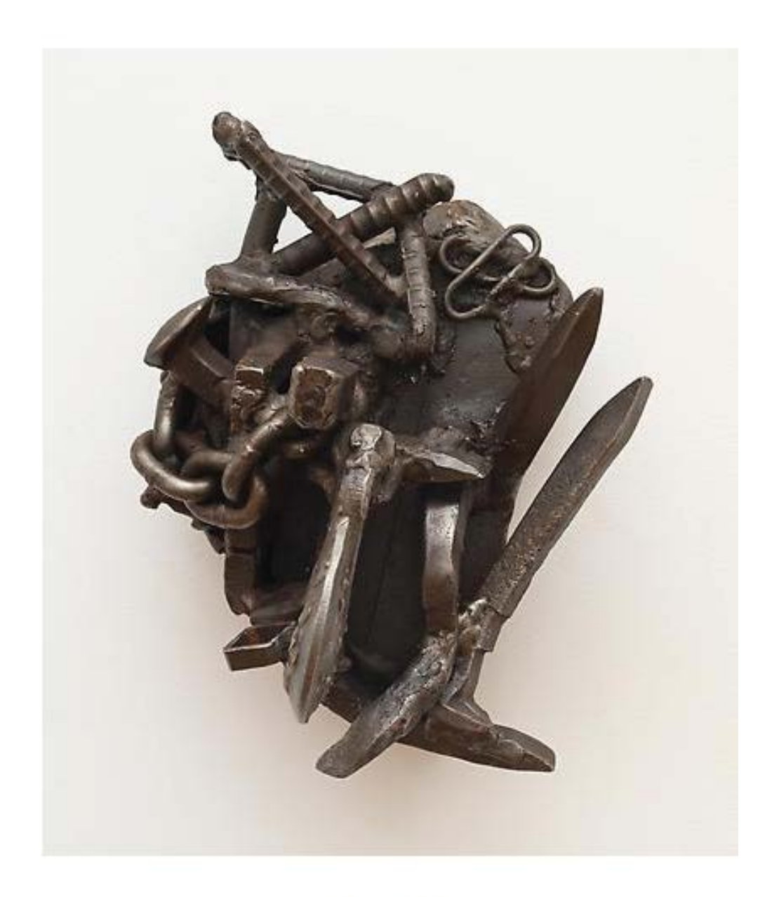
lbadan Oke (1992) Welded steel 13.5h x 11w x 8d in (34.29h x 27.94w x 20.32d cm)