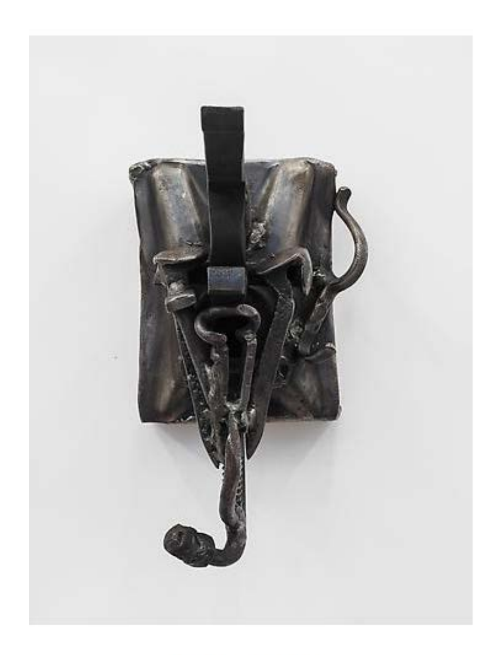
Festac 77 Lagos Reunion (1985) Welded steel 8.25h x 7.5w x 11.75d in (20.96h x 19.05w x 29.85d cm)