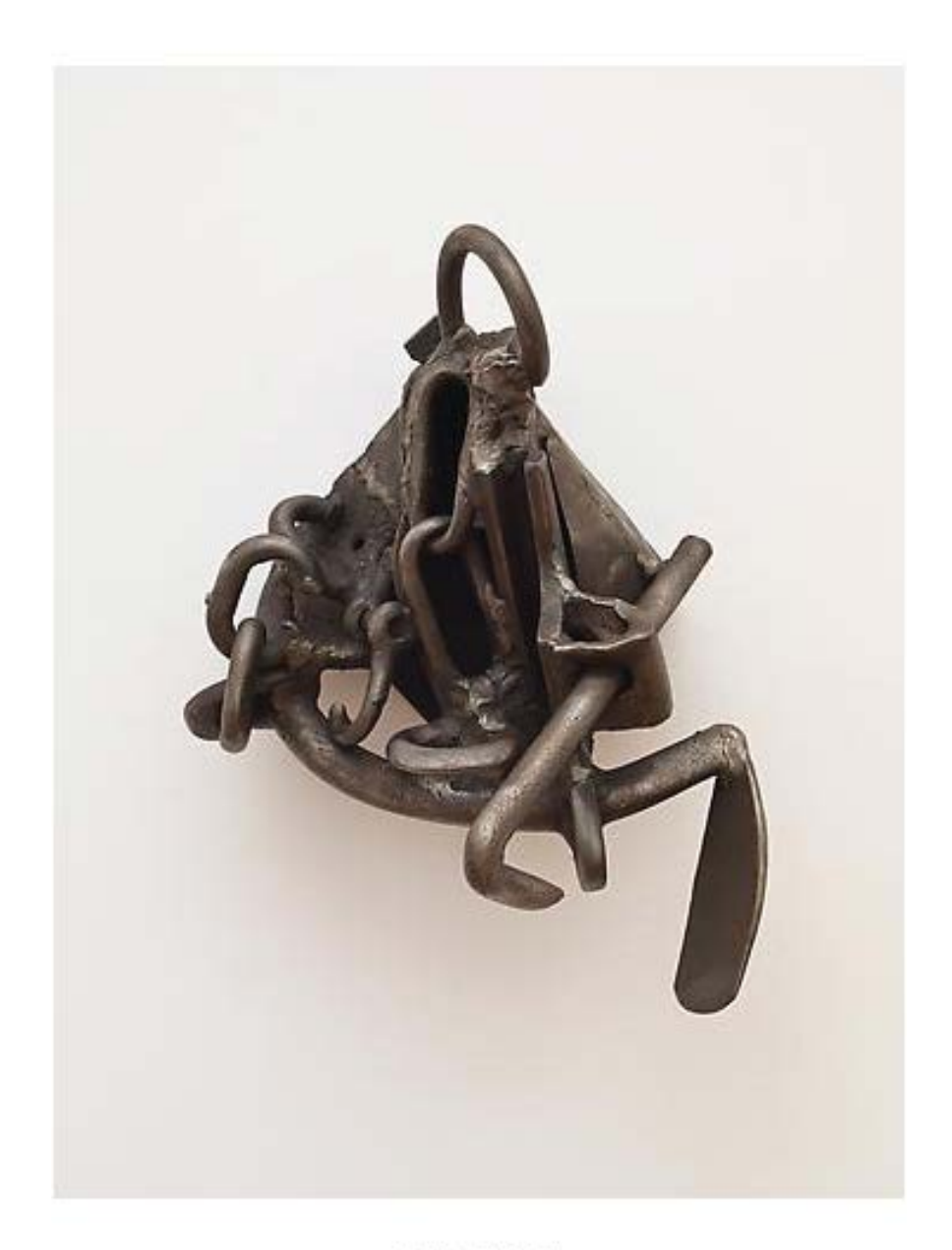
By Hand (1992) Welded steel 15.5h x 14w x 10d in (39.37h x 35.56w x 25.4d cm)