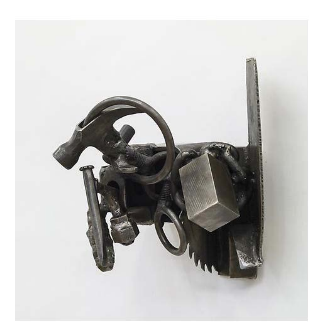
Gulf of Mexico (1990) Welded steel 11.5h x 8.5w x 8.25d in (29.21h x 21.59w x 20.96d cm)