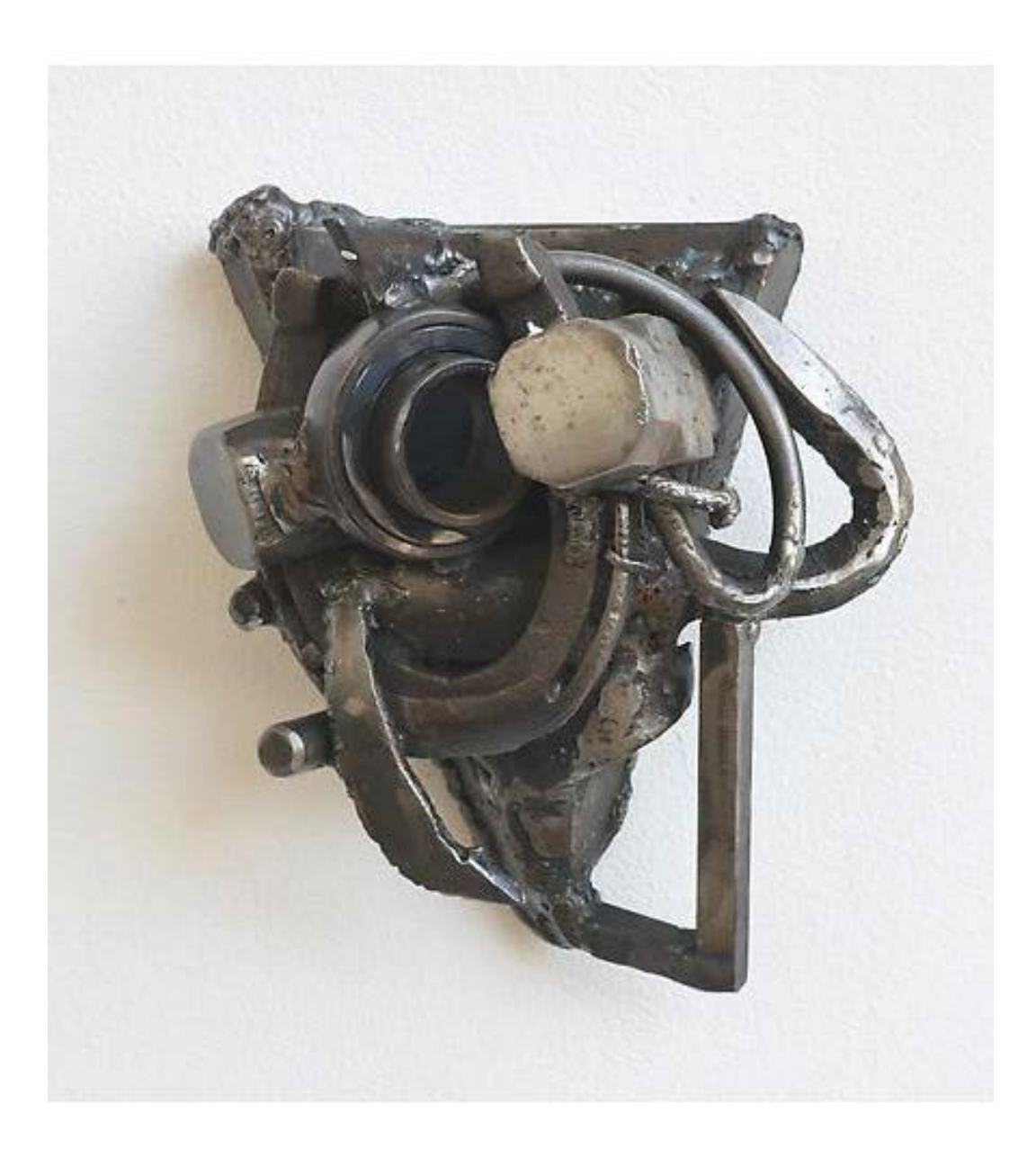
Art Education (2002) Welded steel 10h x 8w x 6d in (25.4h x 20.32w x 15.24d cm)