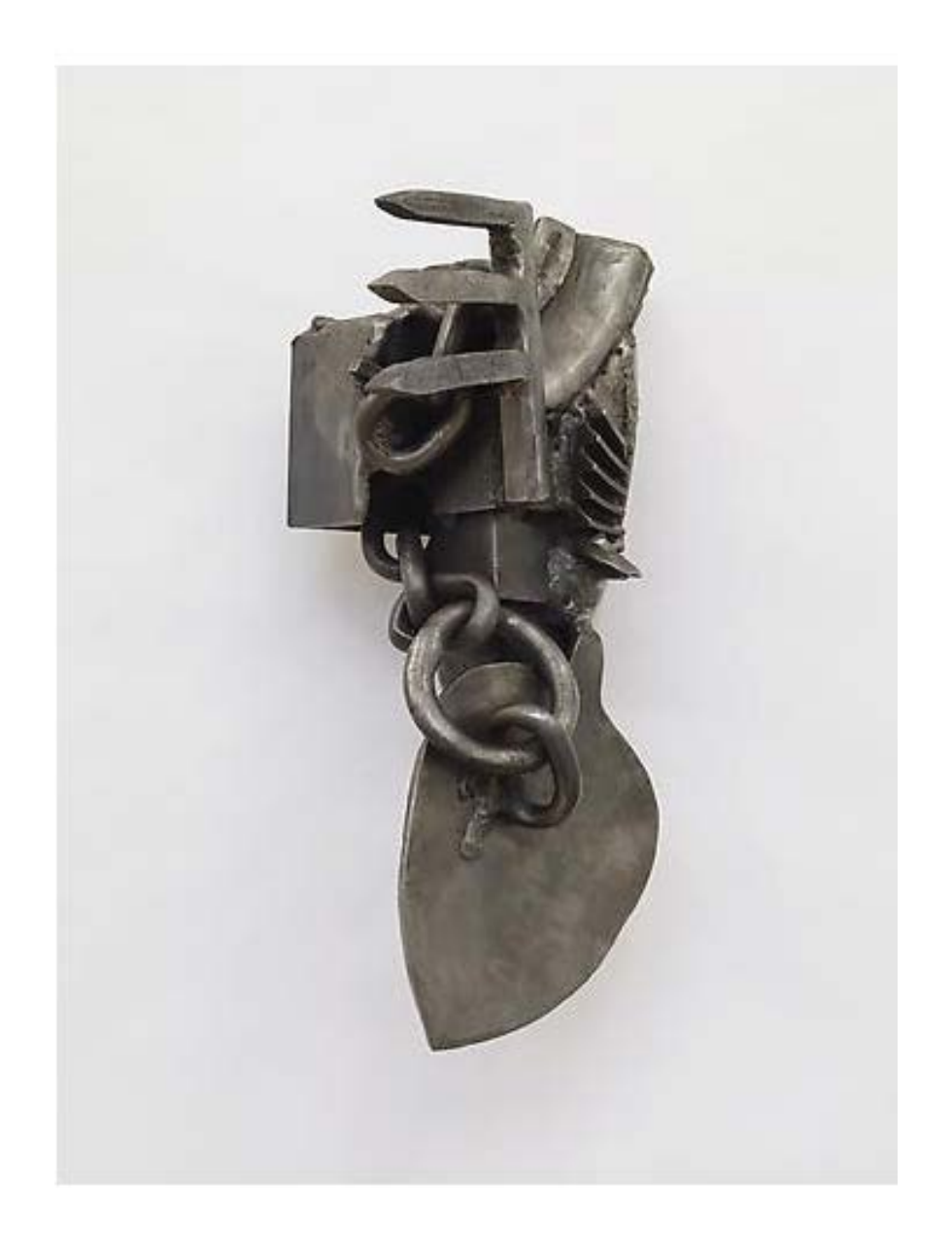
Texas Tale (1992) Welded steel 18h x 8.25w x 11:25d in (45.72h x 20.96w x 28.58d cm)