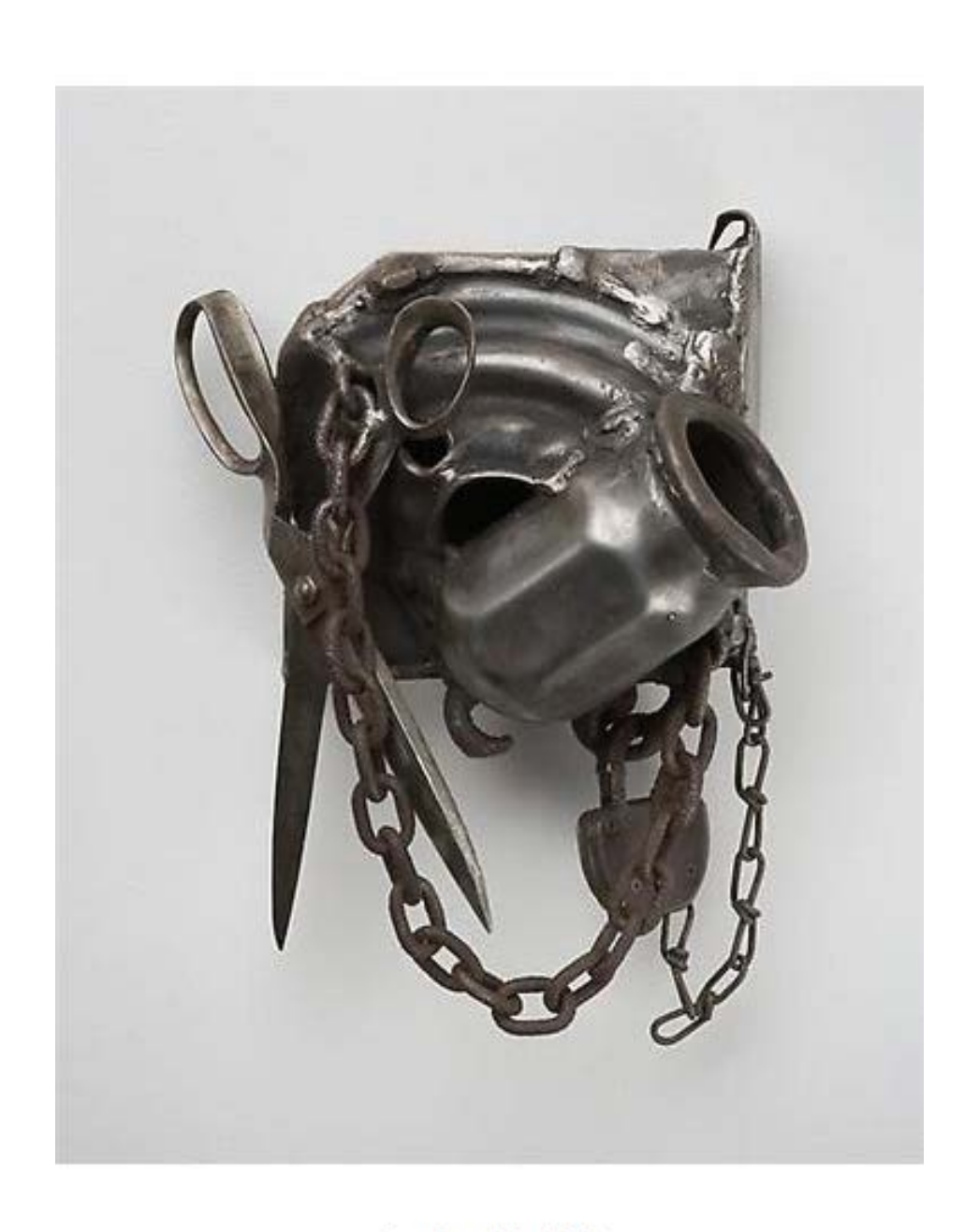
Elegy To and For (1999) Welded steel