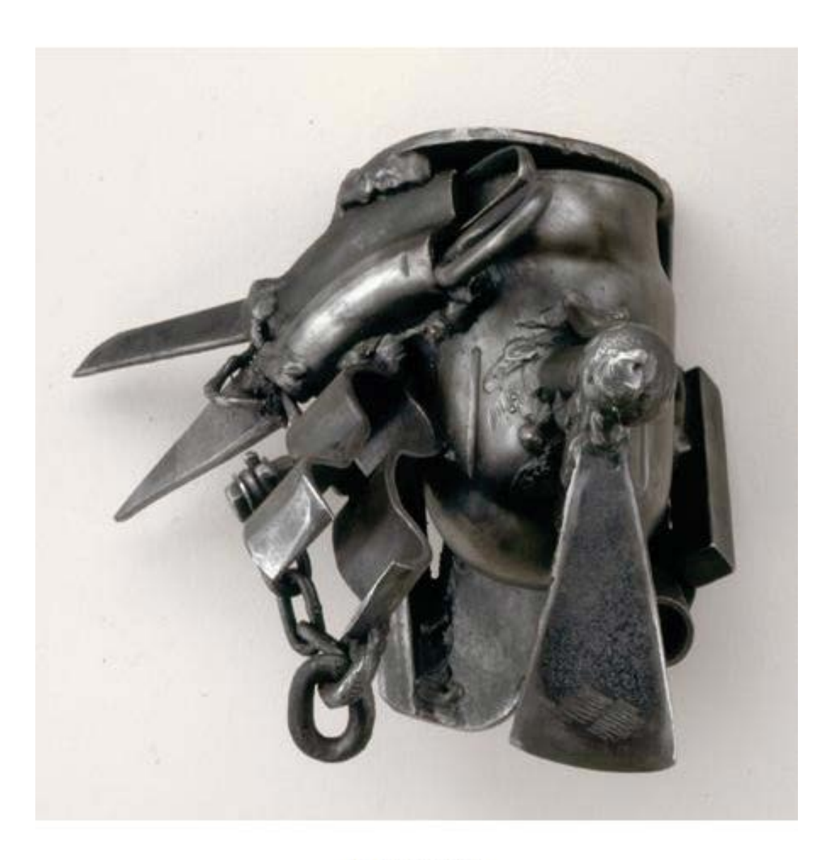
Ida's Voice (1992) Welded steel 10.13h x 11w x 11d in (25.73h x 27.94w x 27.94d cm)