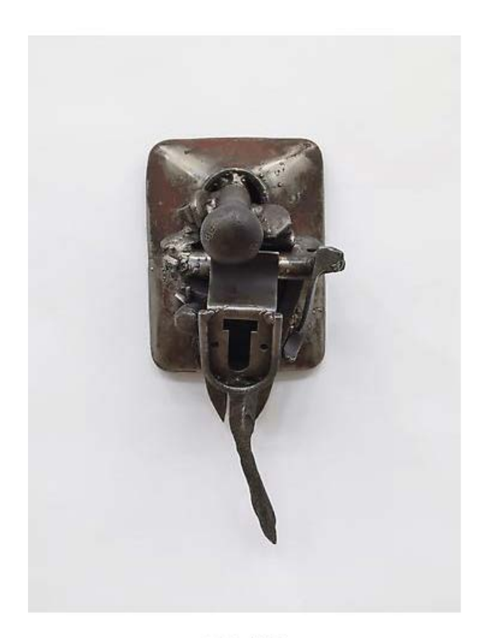
Con Rum (1981) Welded steel 13.75h x 6w x 6.75d in (34.92h x 15.24w x 17.15d cm)