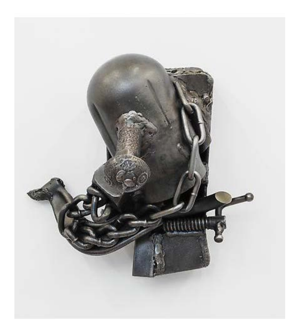
Alterable (1992) Welded steel 10.25h x 9w x 7.75d in (26.04h x 22.86w x 19.68d cm)