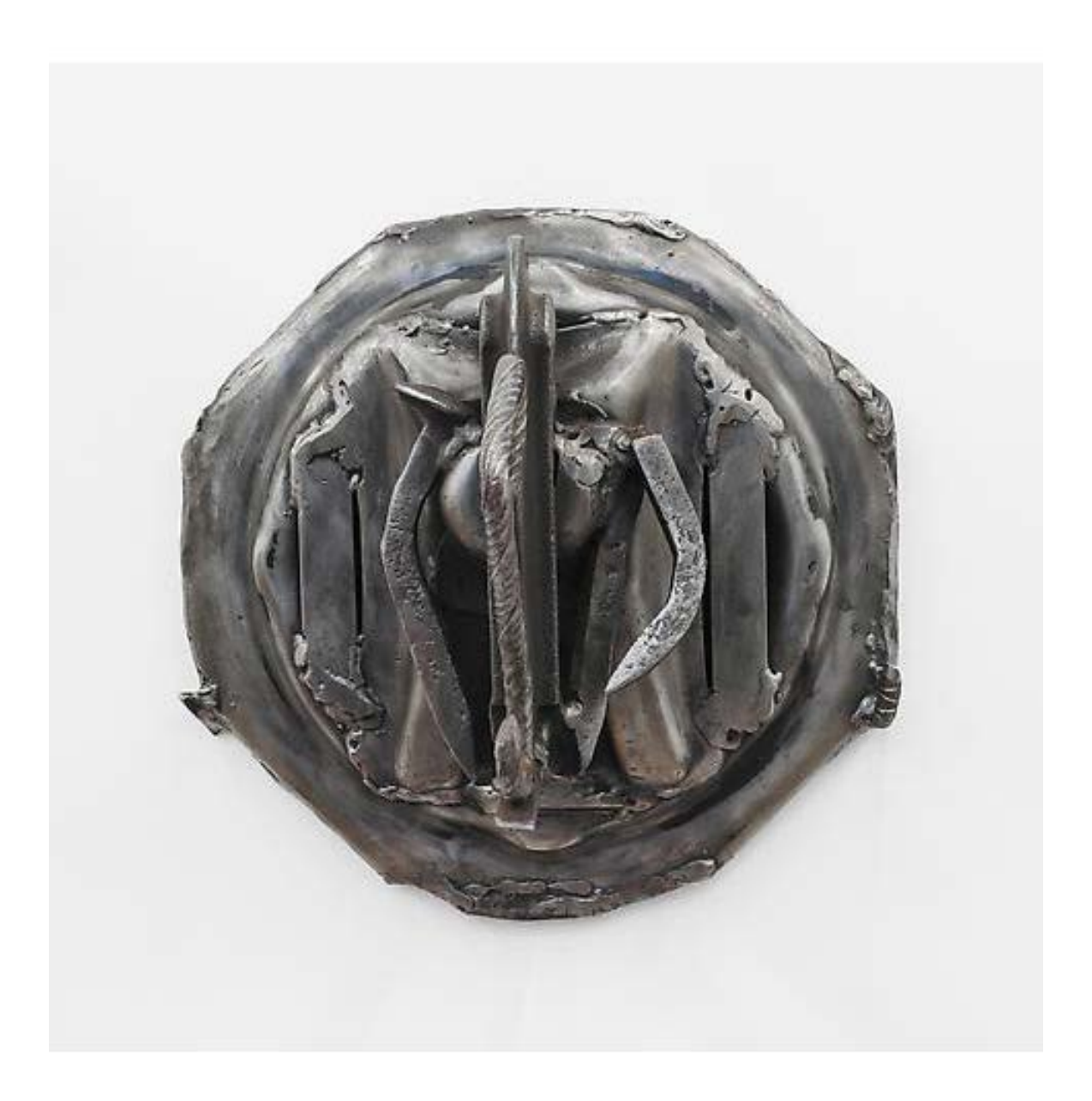
Badagry Road (1984) Welded steel 14h x 13w x 10.25d in (35.56h x 33.02w x 26.04d cm)