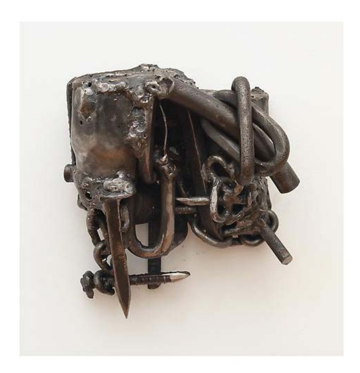
Degga Woloff (2011) Welded steel 11.5h x 9.75w x 5.5d in (29.21h x 24.77w x 13.97d cm)