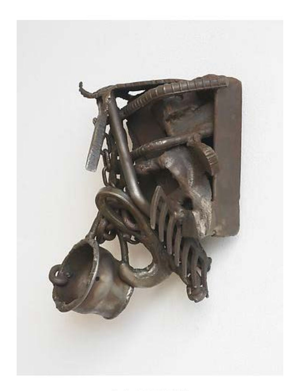
September Portion (1991) Welded steel 14.5h x 13w x 7.5d in (36.83h x 33.02w x 19.05d cm)