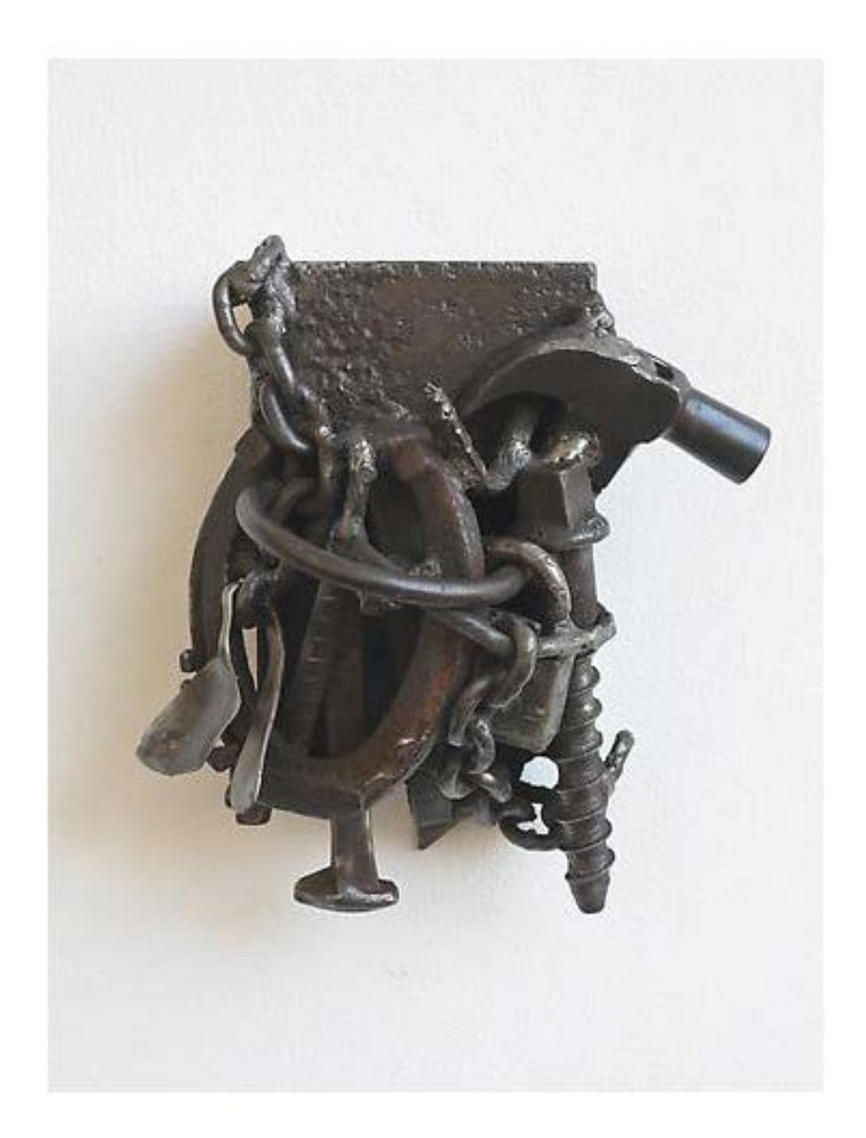
Texas August (2006) Welded steel 9h x 8w x 5.5d in (22.86h x 20.32w x 13.97d cm)