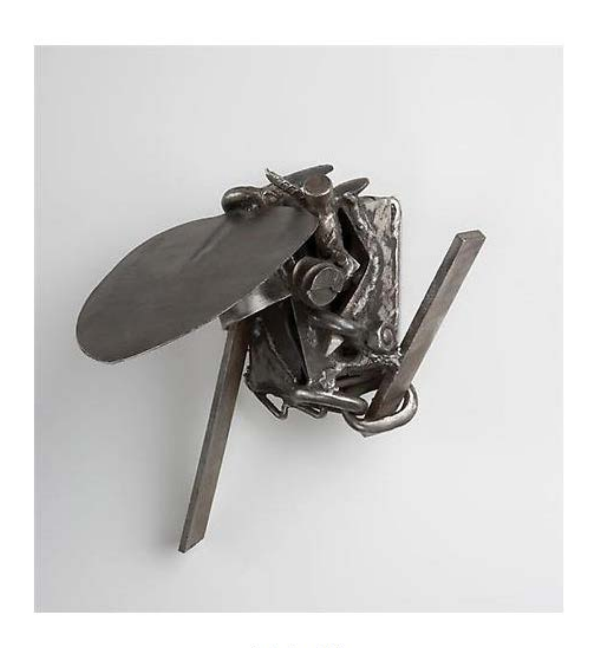
Archaeology (1995) Welded steel