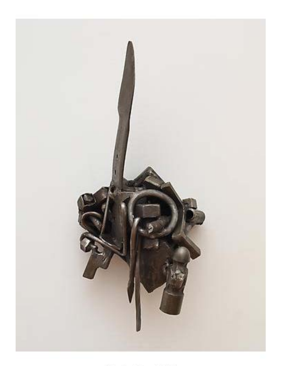
Words of Fanon (1992) Welded steel 22h x 14w x 7.5d in (55.88h x 35.56w x 19.05d cm)