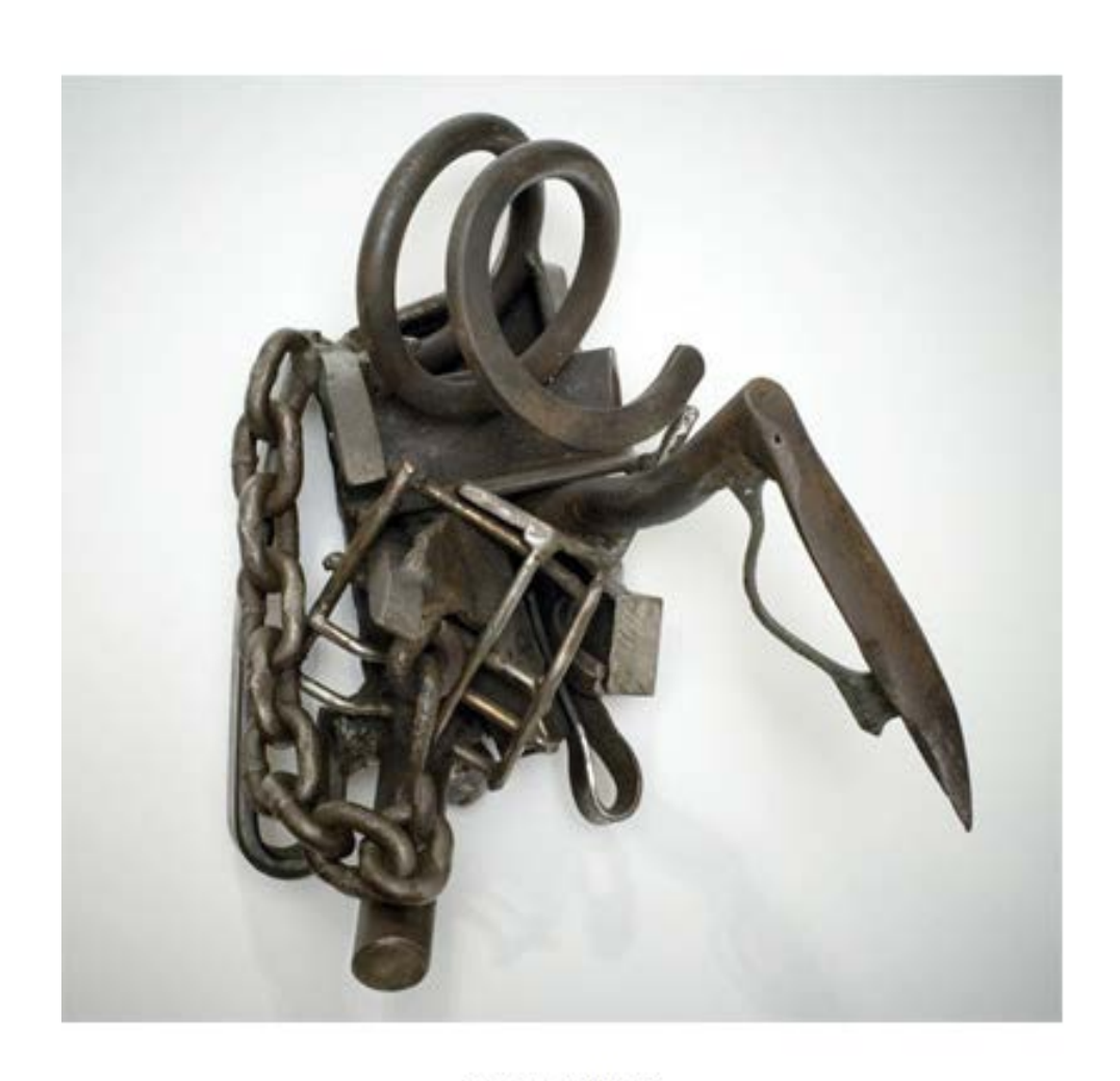
Zhakanaka (1989) Welded steel 14.02h x 12.52w x 8.5d in (35.61h x 31.8w x 21.59d cm)