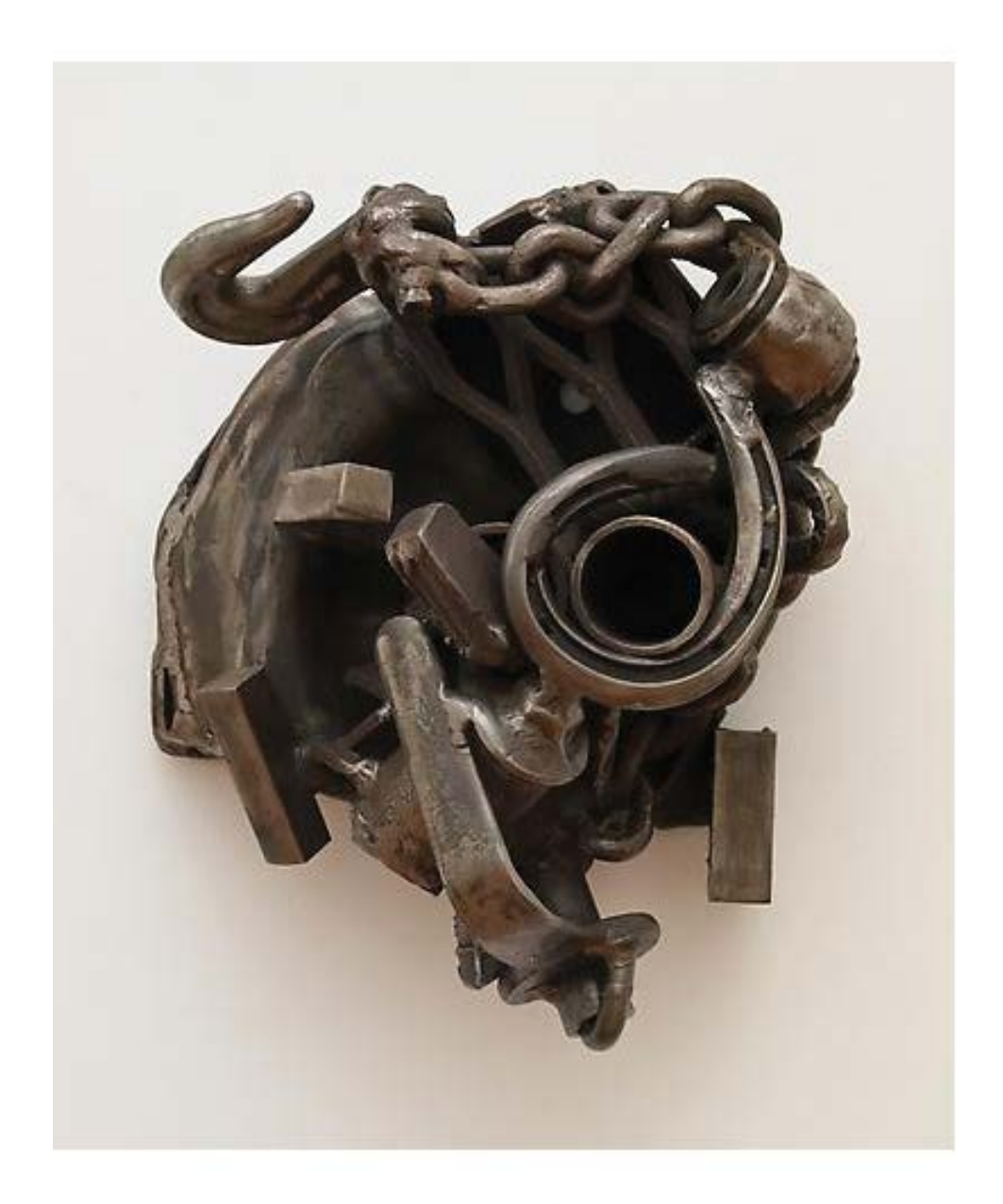
Because of Struggle (1992) Welded steel 15h x 15.5w x 15d in (38.1h x 39.37w x 38.1d cm)