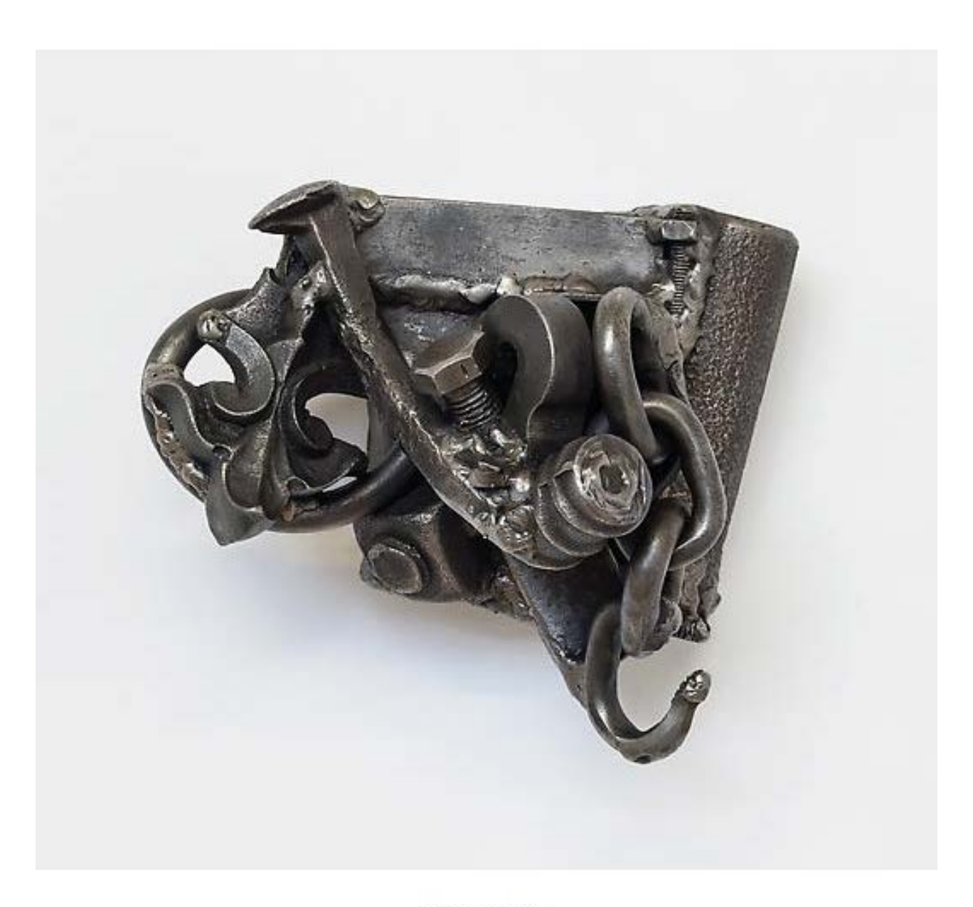
Welldone (1996) Welded steel 8.75h x 9.25w x 7.25d in (22.23h x 23.5w x 18.42d cm)