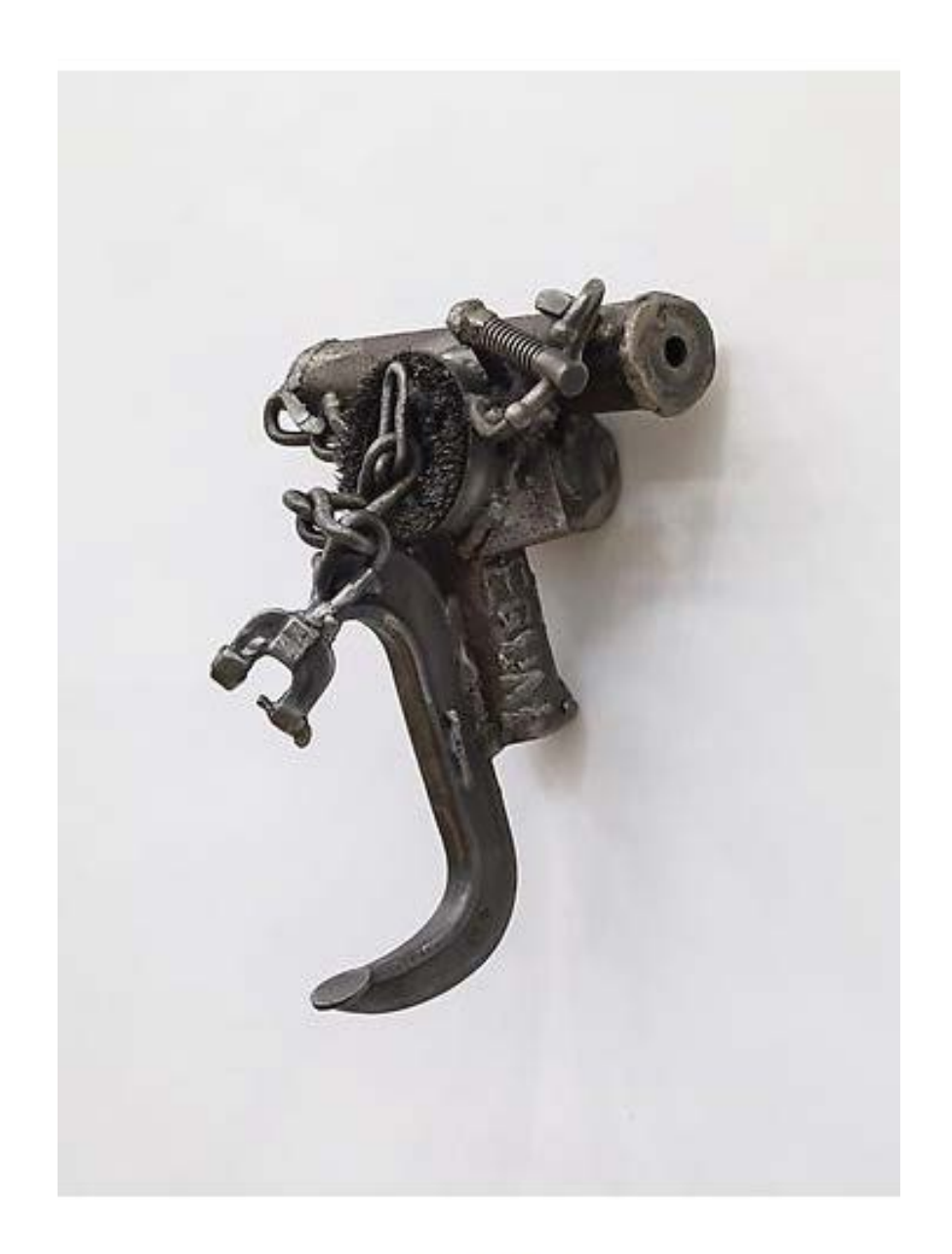
Equn Rites (1987) Welded steel 12h x 10.88w x 7.5d in (30.48h x 27.64w x 19.05d cm)