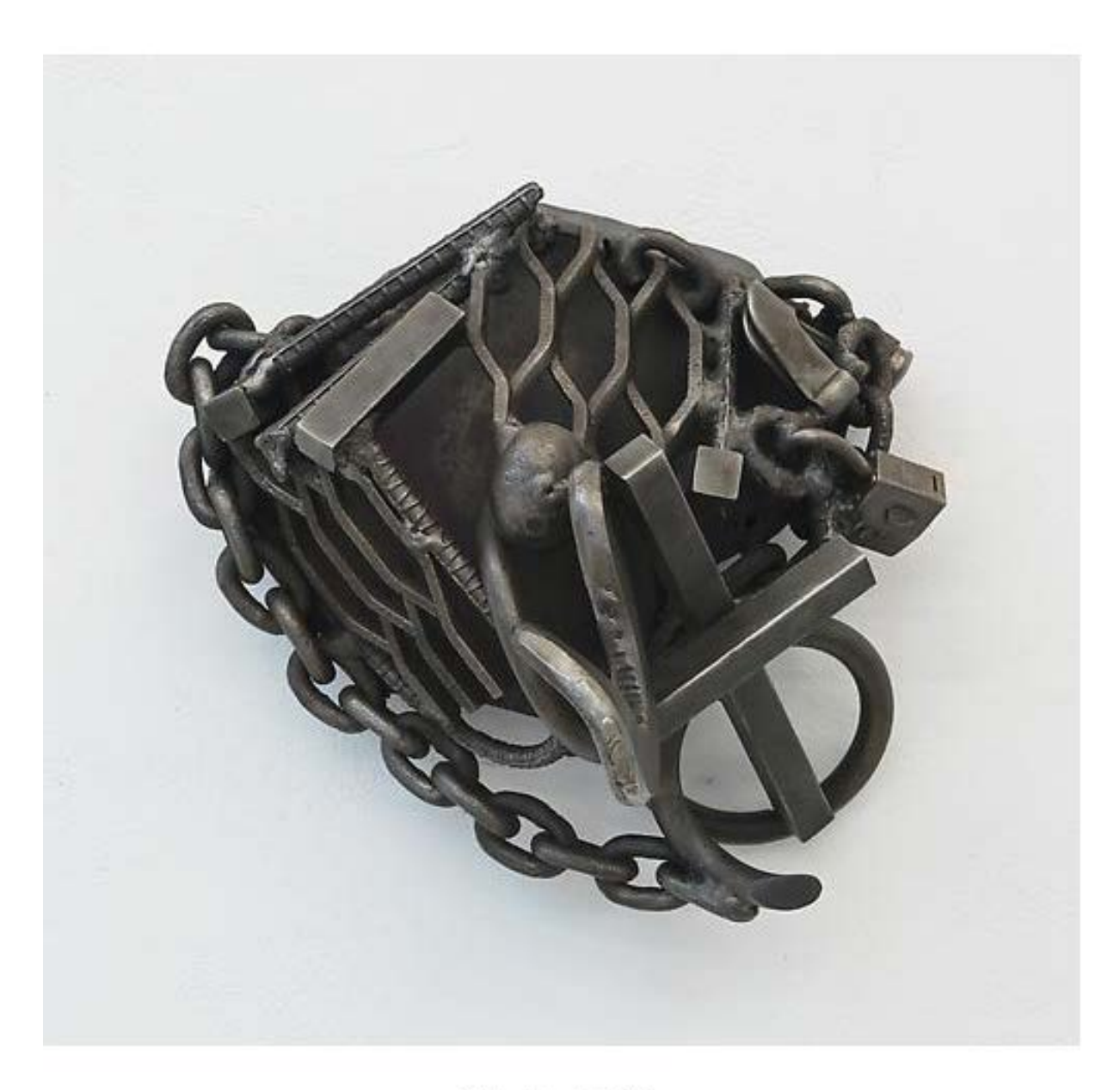
Central Ave. LA (1991) Welded steel 14h x 11.75w x 9.5d in (35.56h x 29.85w x 24.13d cm)