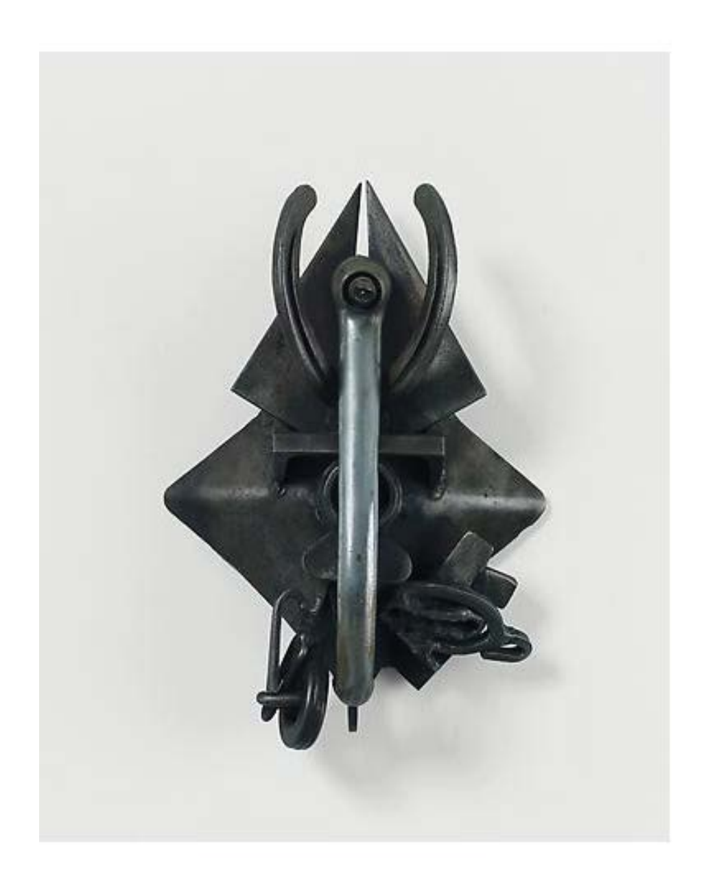
Afro-Phoenix #2 (1964) Welded steel 14h x 9w x 4.75d in (35.56h x 22.86w x 12.07d cm)