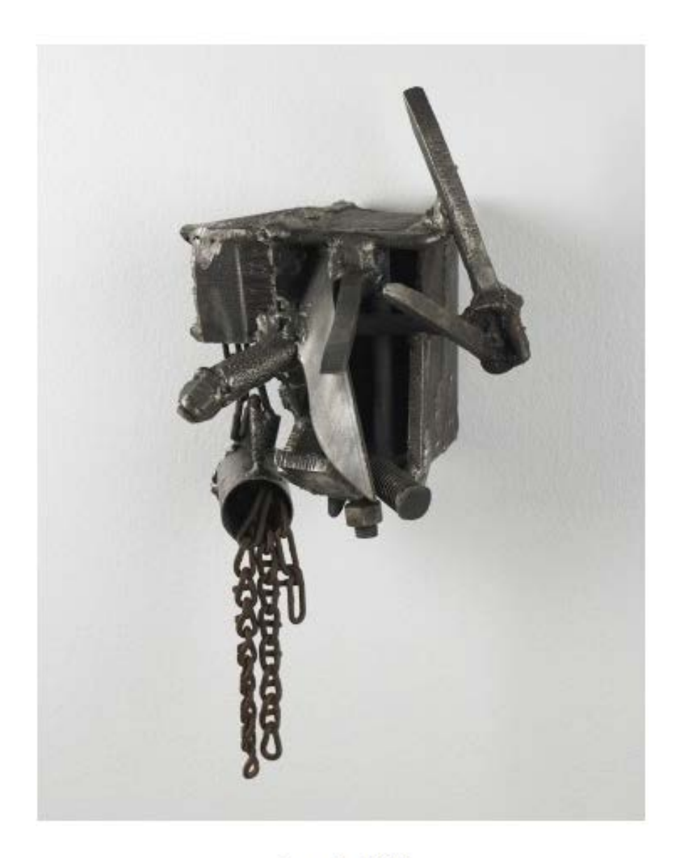
Premonition (1990) Welded steel 18.25h x 11w x 11d in (46.36h x 27.94w x 27.94d cm)