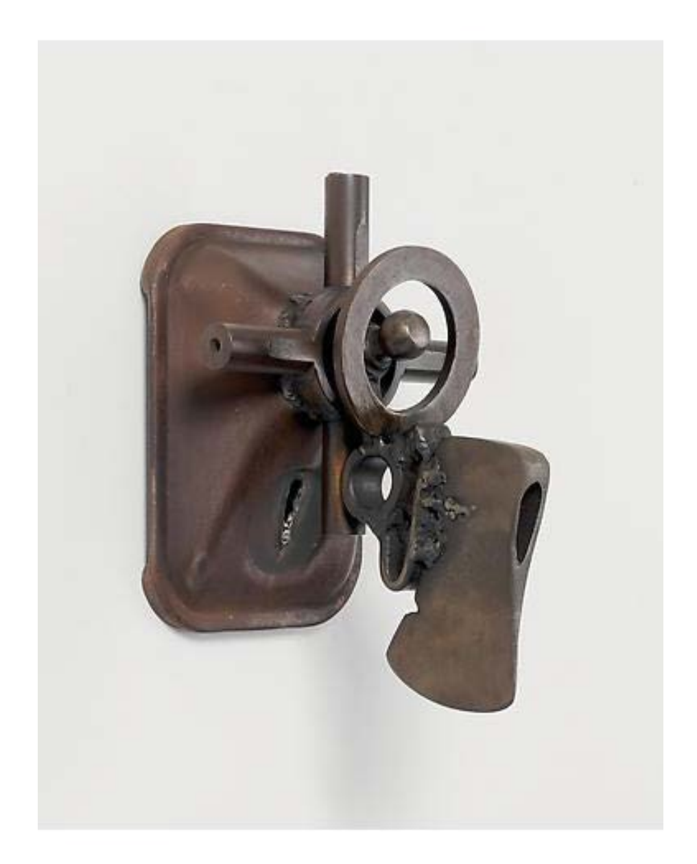
Crux (1965) Welded steel 9.75h x 6.5w x 7.5d in (24.77h x 16.51w x 19.05d cm)