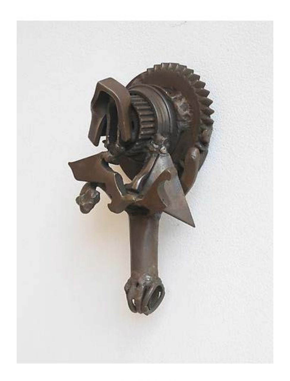
His and Hers (1964) Welded steel 10.75h x 6w x 4.25d in (27.31h x 15.24w x 10.8d cm)