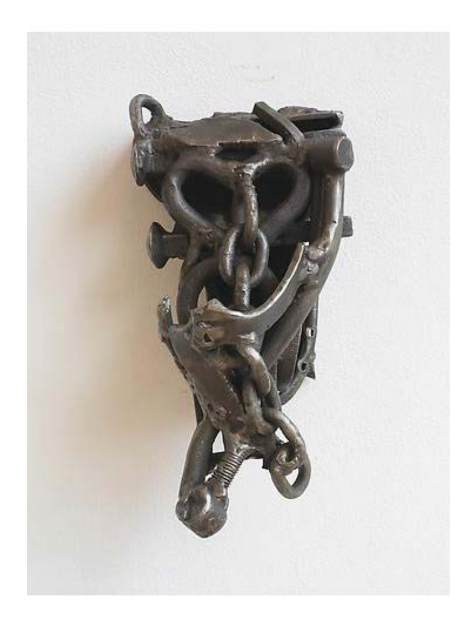
Iraq (2003) Welded steel 13h x 7w x 7d in (33.02h x 17.78w x 17.78d cm)