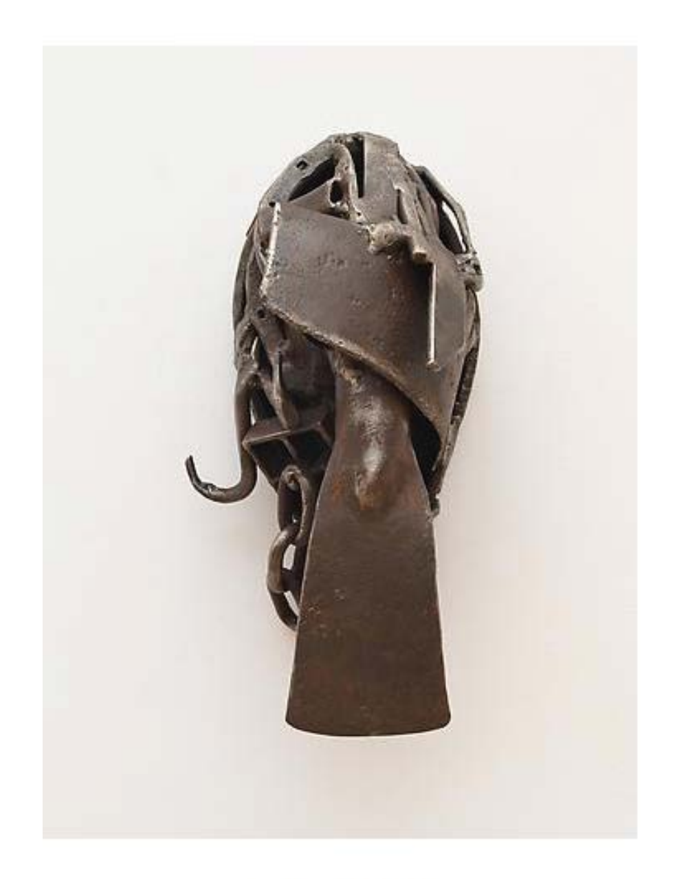
Bara Niasse Tugge (2008) Welded steel 14.5h x 6.5w x 6.75d in (36.83h x 16.51w x 17.15d cm)