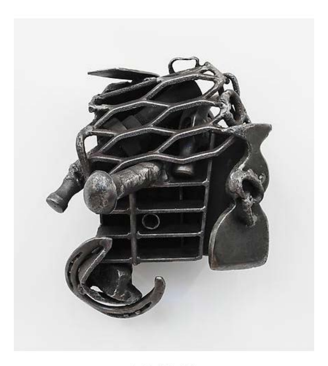
Freedom Fighter (1992) Welded steel 13h x 10.5w x 8d in (33.02h x 26.67w x 20.32d cm)