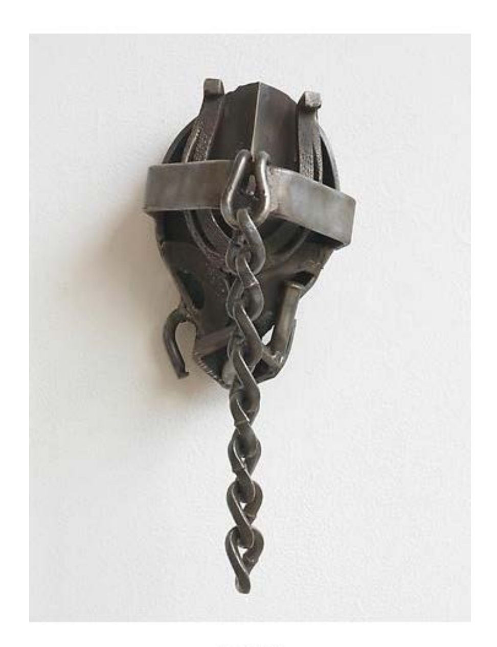
Spring (1973) Welded steel 11h x 6w x 8d in (27.94h x 15.24w x 20.32d cm)