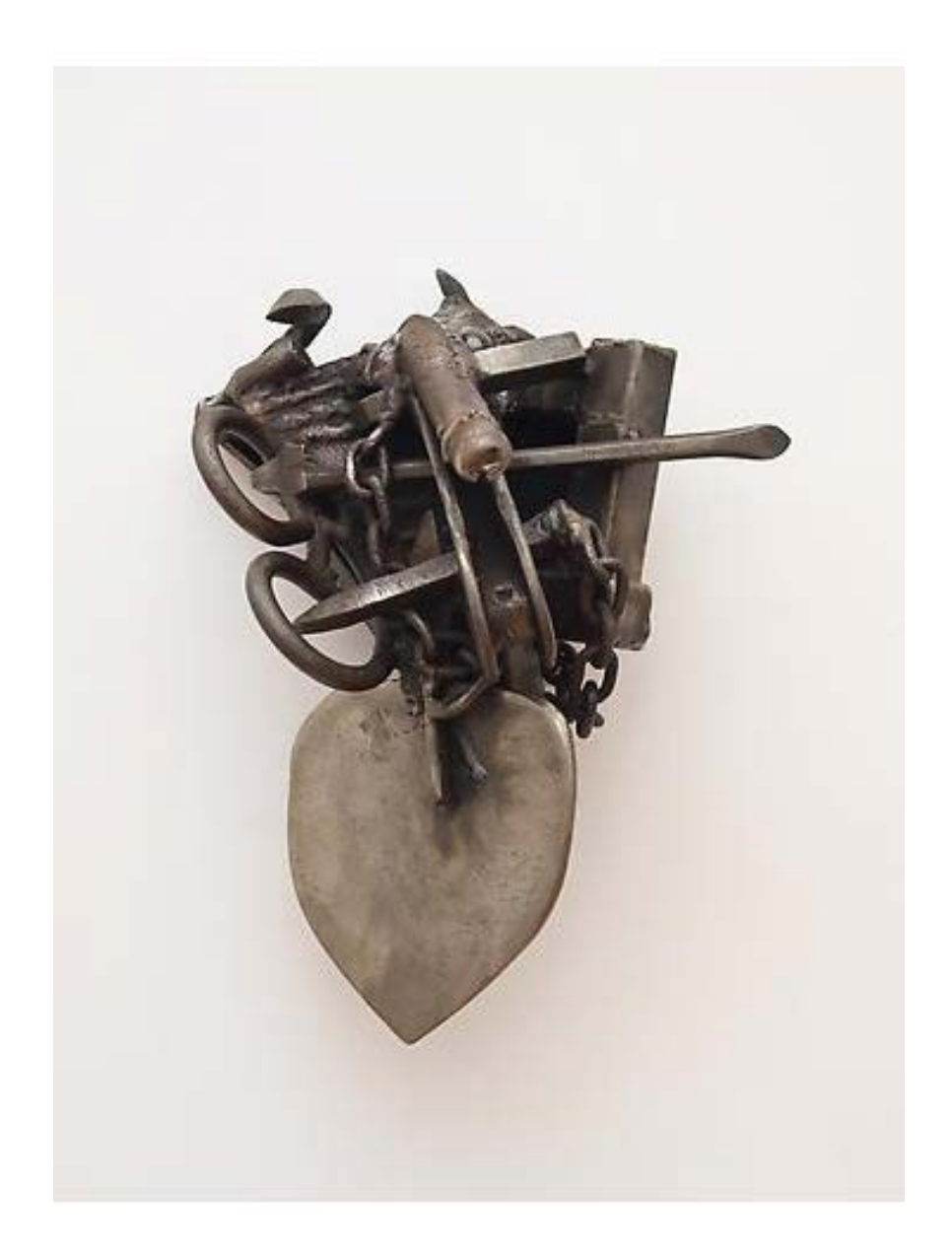
Botanical (1990-93) Welded steel 18h x 12.25w x 9d in (45.72h x 31.12w x 22.86d cm)