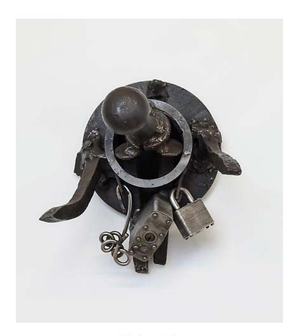
Gulley Hammer (1980) Welded steel 9.75h x 7w x 8d in (24.77h x 17.78w x 20.32d cm)