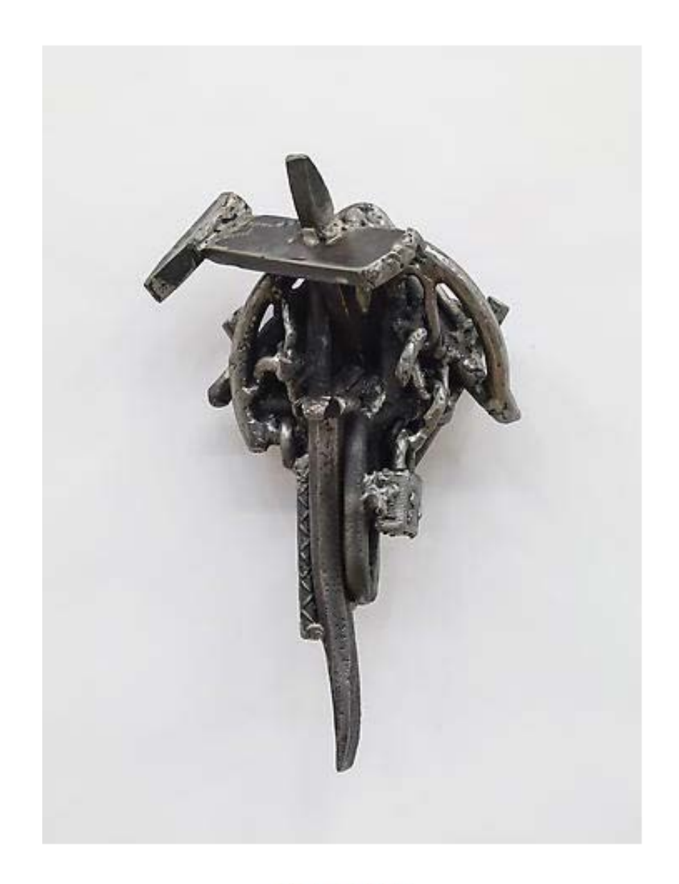
Nite Printer (2011) Welded steel 14.25h x 10.63w x 7d in (36.2h x 27w x 17.78d cm)