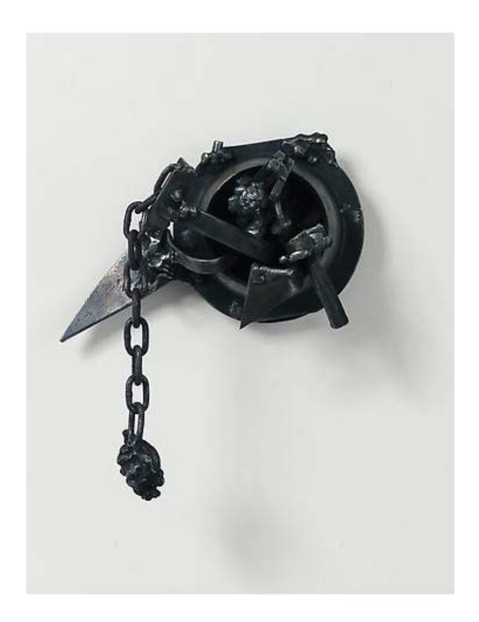
Some Bright Morning (1963) Welded steel 14.5h x 9.25w x 5d in (36.83h x 23.5w x 12.7d cm)