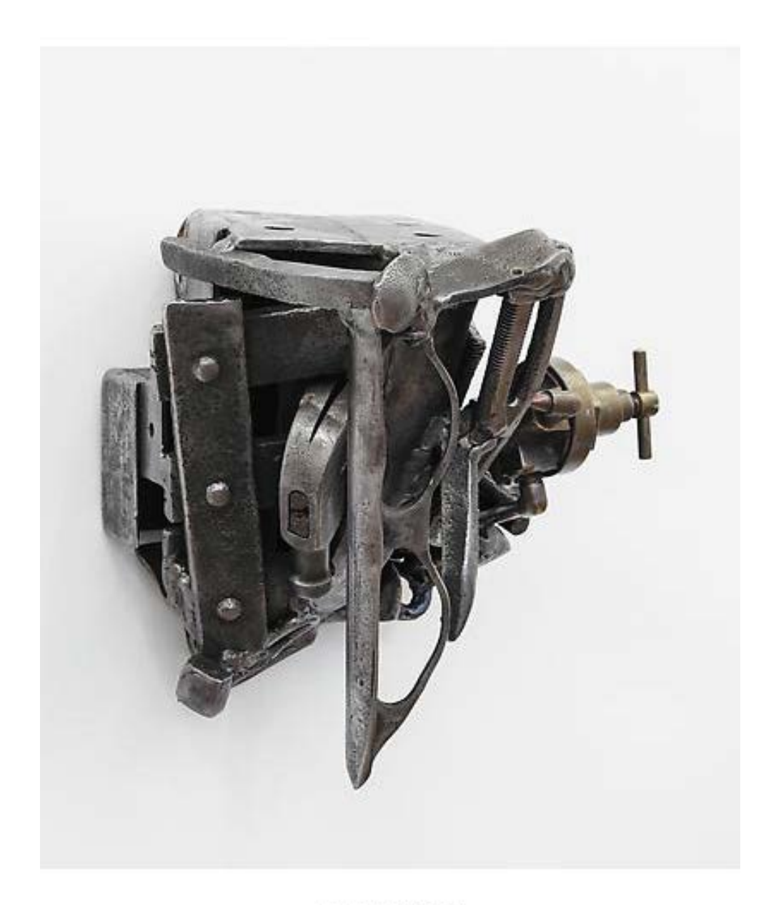
For Fresh Air (1993) Welded steel 11h x 11.75w x 10.5d in (27.94h x 29.85w x 26.67d cm)