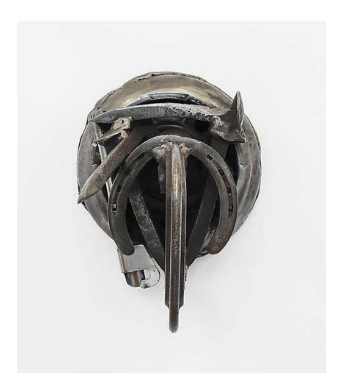
The Sharp-ville (1983) Welded steel 8h x 7.75w x 8.5d in (20.32h x 19.68w x 21.59d cm)