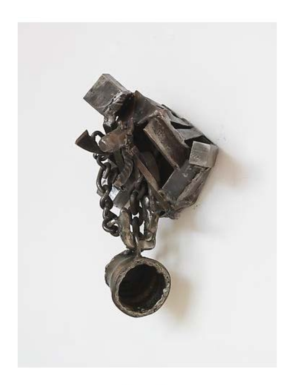
Fire Blossom (1991) Welded steel 17.5h x 13w x 9.5d in (44.45h x 33.02w x 24.13d cm)