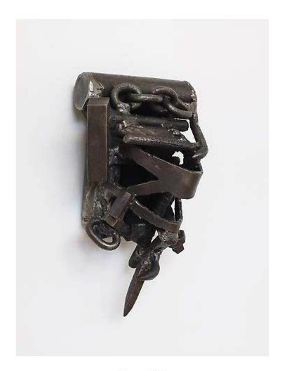
Palmares (1988) Welded steel 13.75h x 7w x 6.75d in (34.92h x 17.78w x 17.15d cm)