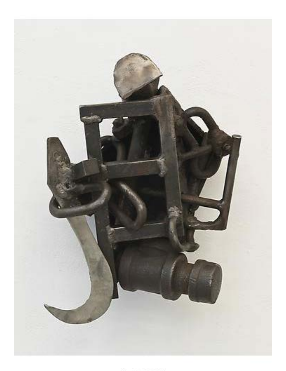
Nunake (1993) Welded steel 13.95h x 9.5w x 6.75d in (35.43h x 24.13w x 17.15d cm)