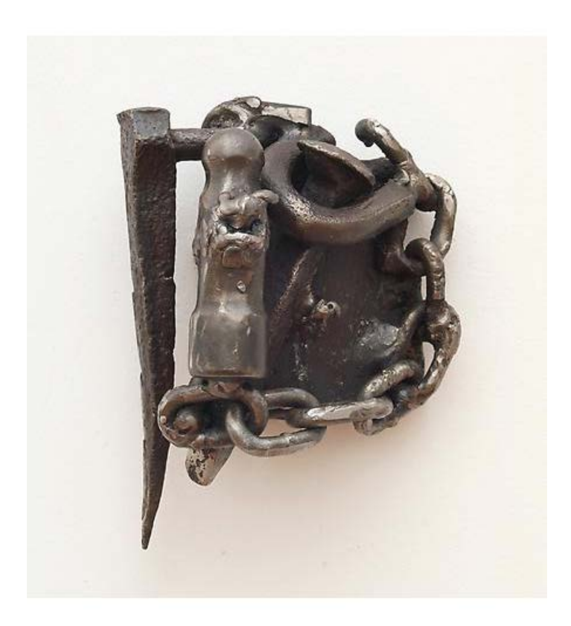
Now (2002) Welded steel 7.5h x 6.25w x 4d in (19.05h x 15.88w x 10.16d cm)