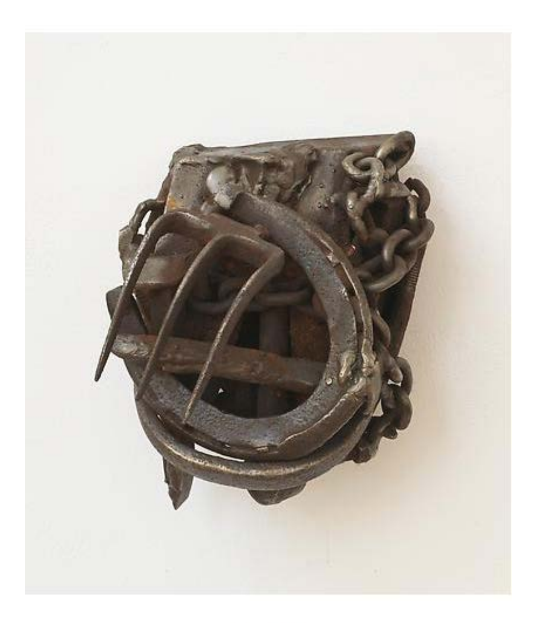
Bayou Talk (2005) Welded steel 9h x 8w x 7d in (22.86h x 20.32w x 17.78d cm)