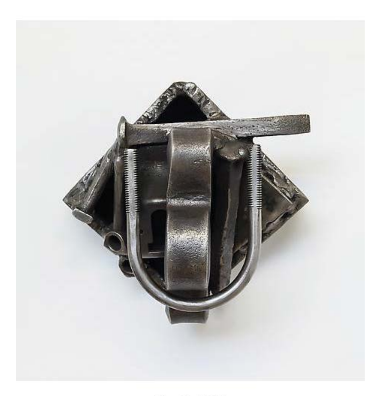
Diamond Mouth (1980) Welded steel 8.75h x 8.75w x 6.5d in (22.23h x 22.23w x 16.51d cm)