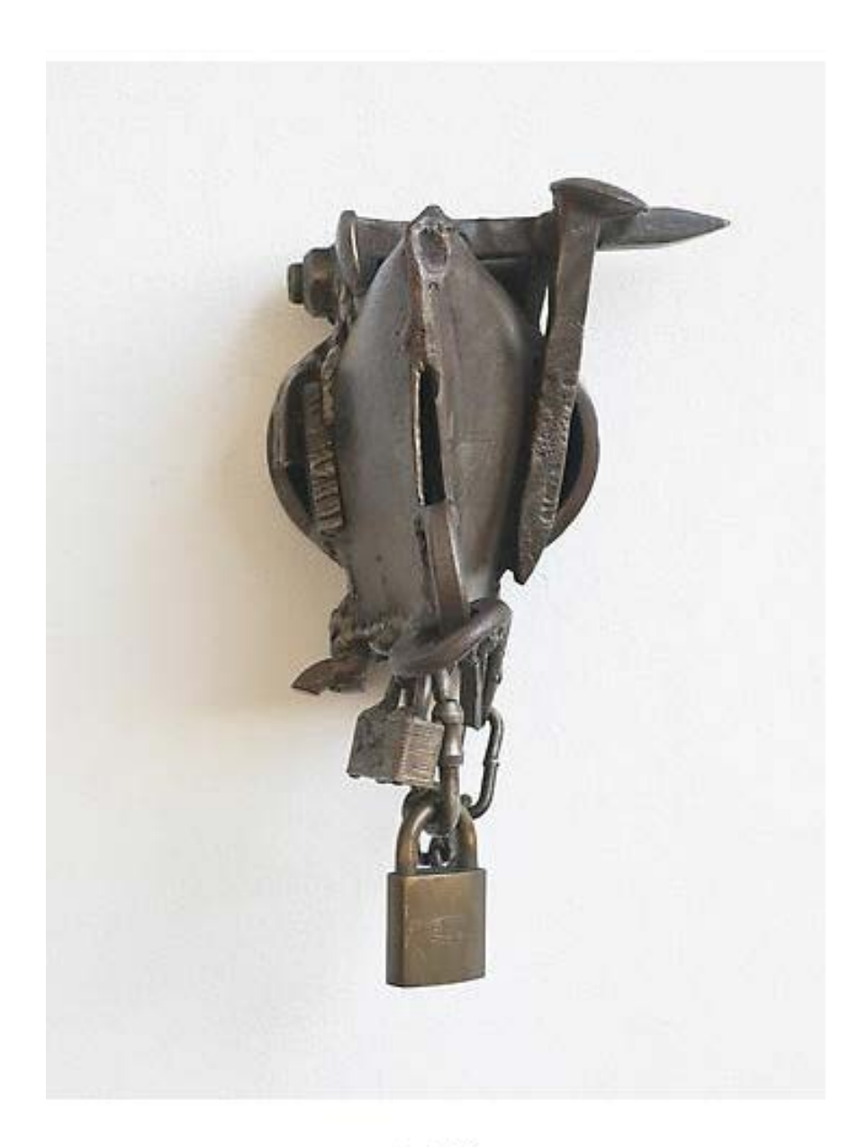
Go (1980) Welded steel 9h x 7w x 6d in (22.86h x 17.78w x 15.24d cm)