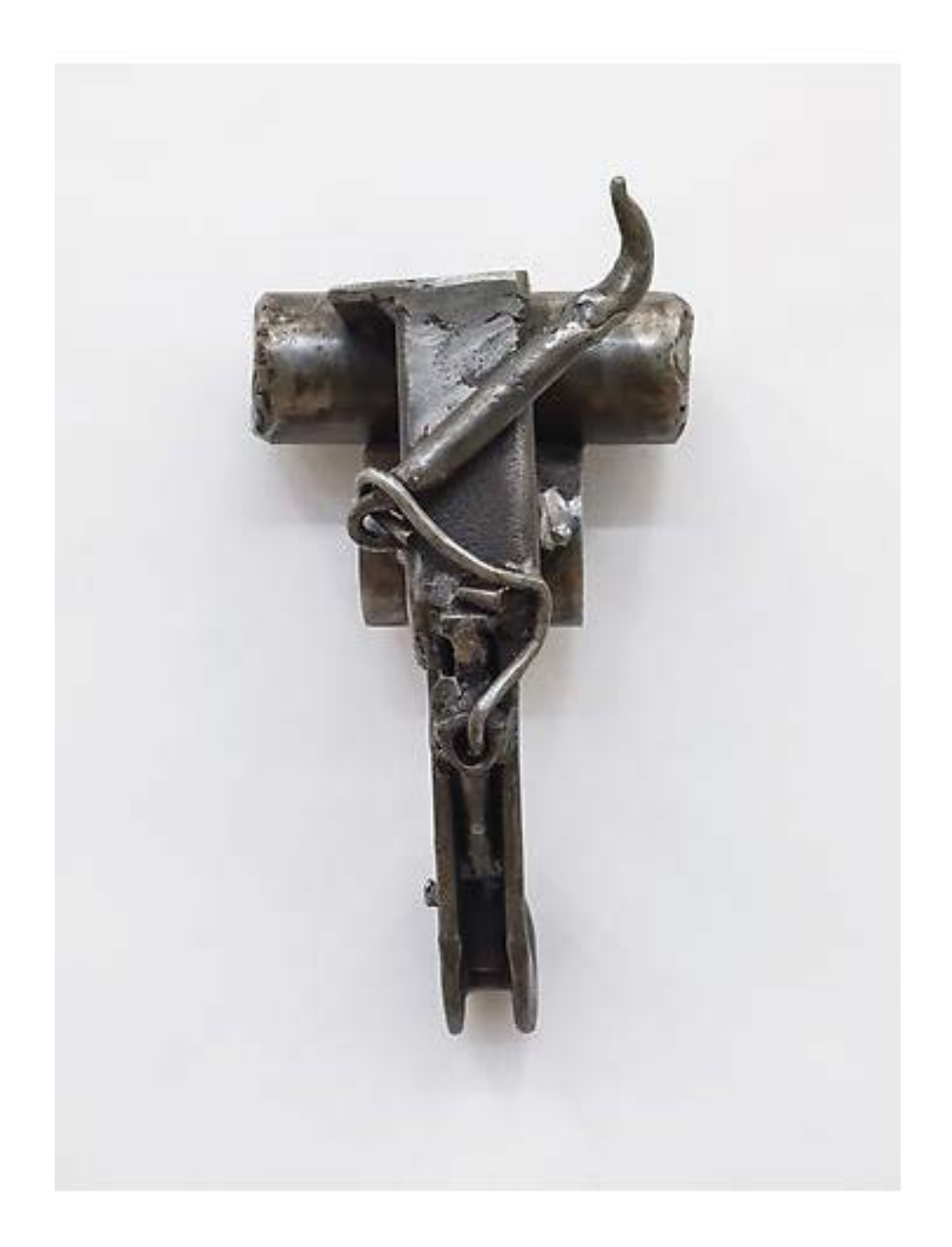
Echo Soweto (1980) Welded steel 14.25h x 7w x 5.75d in (36.2h x 17.78w x 14.61d cm)