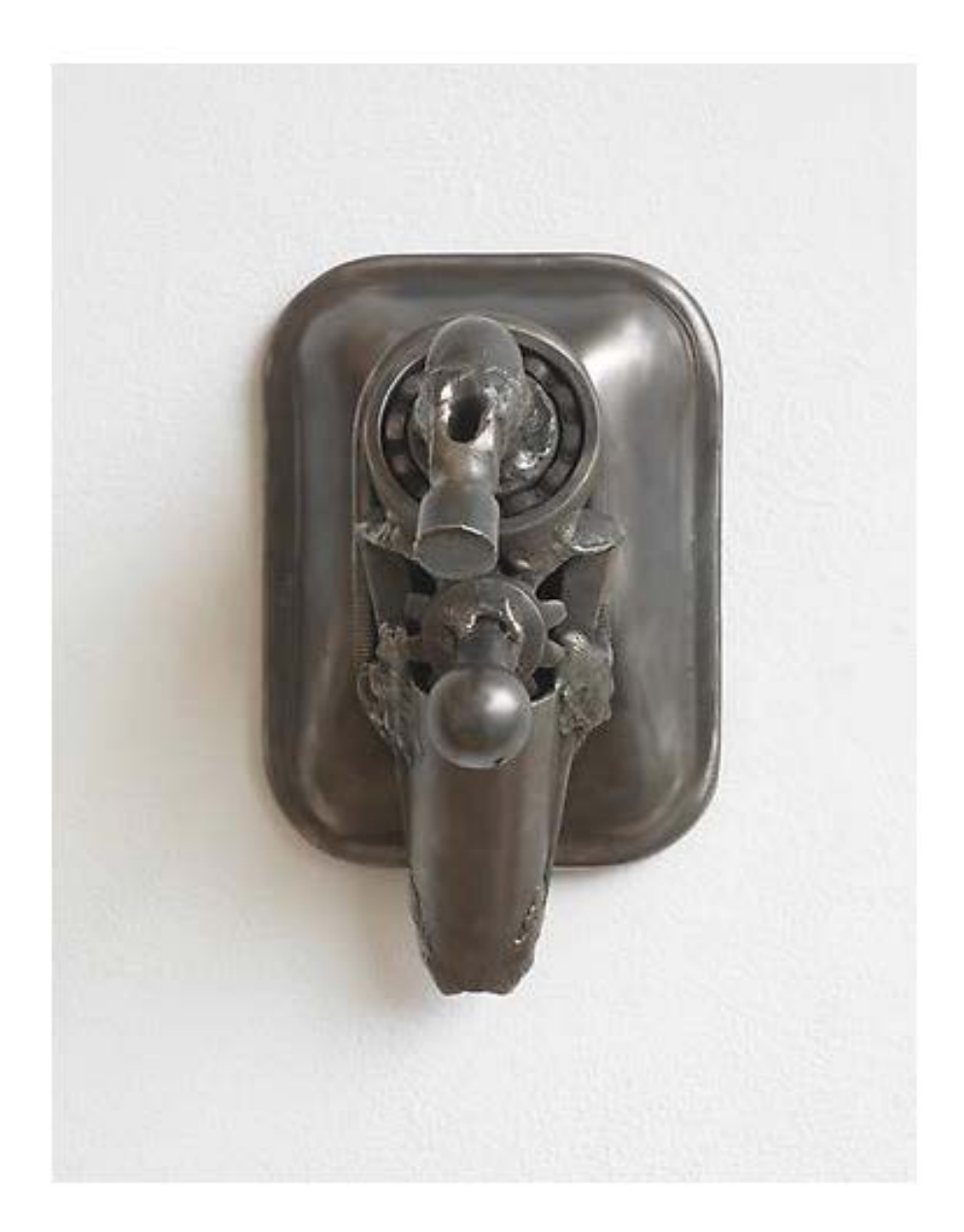
Hammer (1965) Welded steel 10h x 10w x 7d in (25.4h x 25.4w x 17.78d cm)