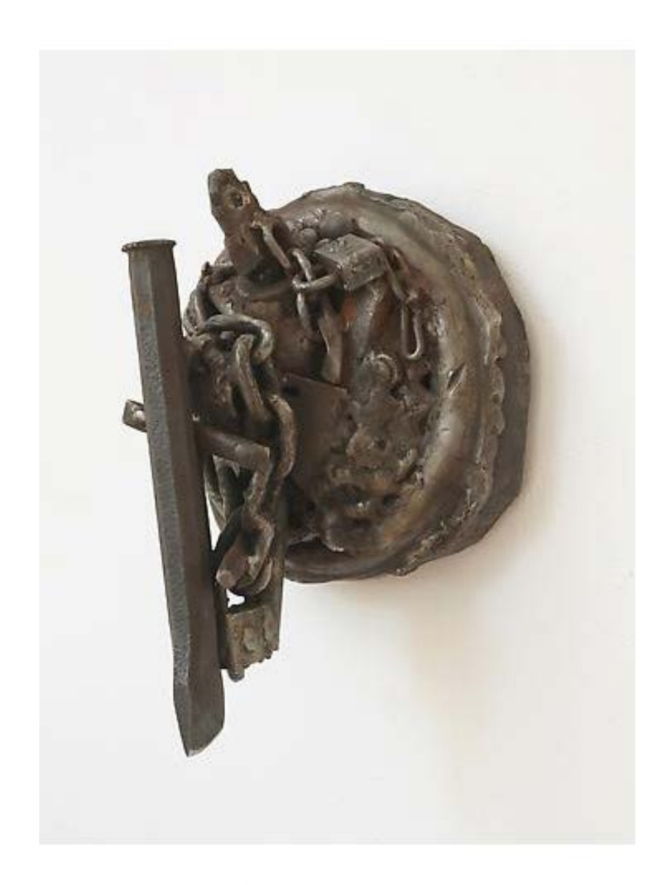
Max Bond Architect (2009) Welded steel 13h x 10w x 9d in (33.02h x 25.4w x 22.86d cm)