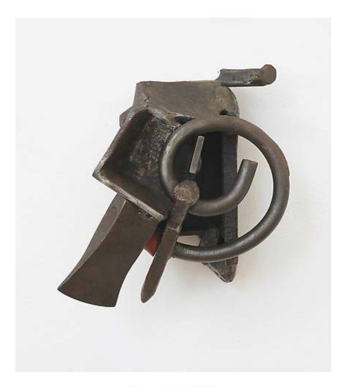
Weapon of Freedom (1986) Welded steel 11h x 9w x 6d in (27.94h x 22.86w x 15.24d cm)