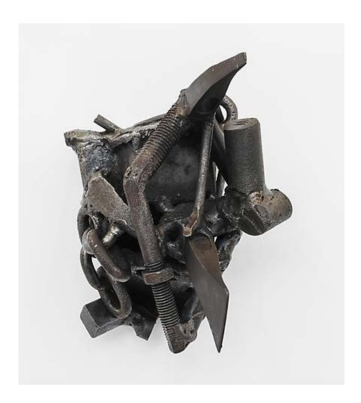
Ogun Again (1988) Welded steel 8.25h x 9.75w x 9.5d in (20.96h x 24.77w x 24.13d cm)