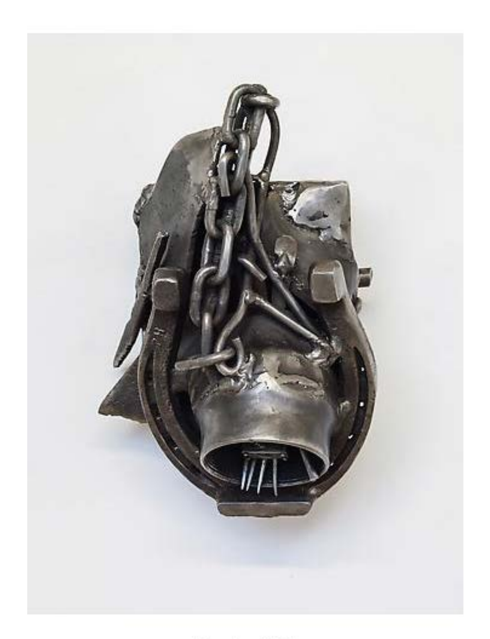
A Symptom of (1999) Welded steel 12h x 8.25w x 6.25d in (30.48h x 20.96w x 15.88d cm)