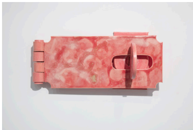
Jane Margarette Latch 3 , 2019 Ceramics, glaze 11 1/2" x 25 1/2" x 9 1/2"