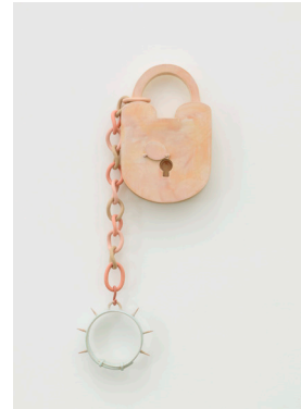
Jane Margarete Easy Daisy , 2021 Ceramics, glaze 48" x 18" x 4"