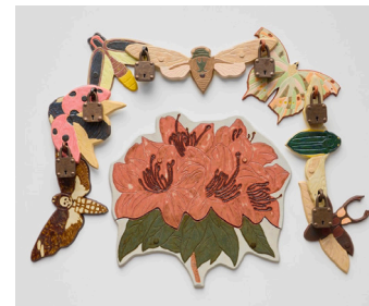
Jane Margarete Pie in the Sky , 2021 Ceramics, glaze 34" x 42" x 3"