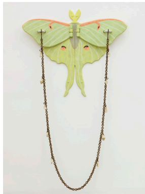
Jane Margarete Chase a Rainbow , 2022 Ceramic, glaze 74" x 43" x 5"