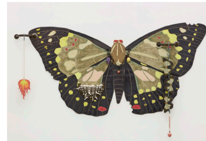
Jane Margarete Miserable with Carefulness , 2022 Ceramics, glaze 67" x 117" x 5"