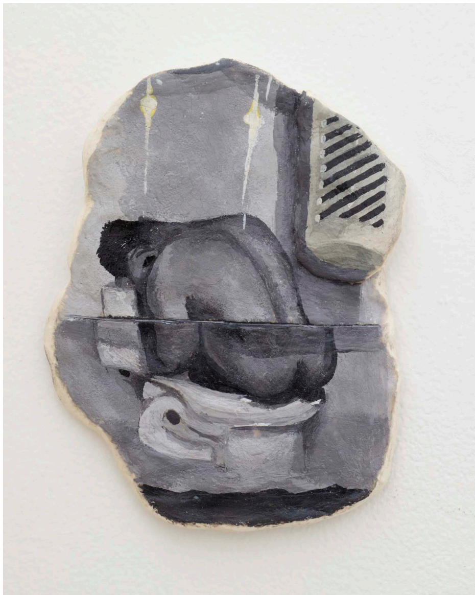
Untitled (Brita) , 2021. Gouache on paper clay. 13 x 10 cm (5.1 x 3.9 in)