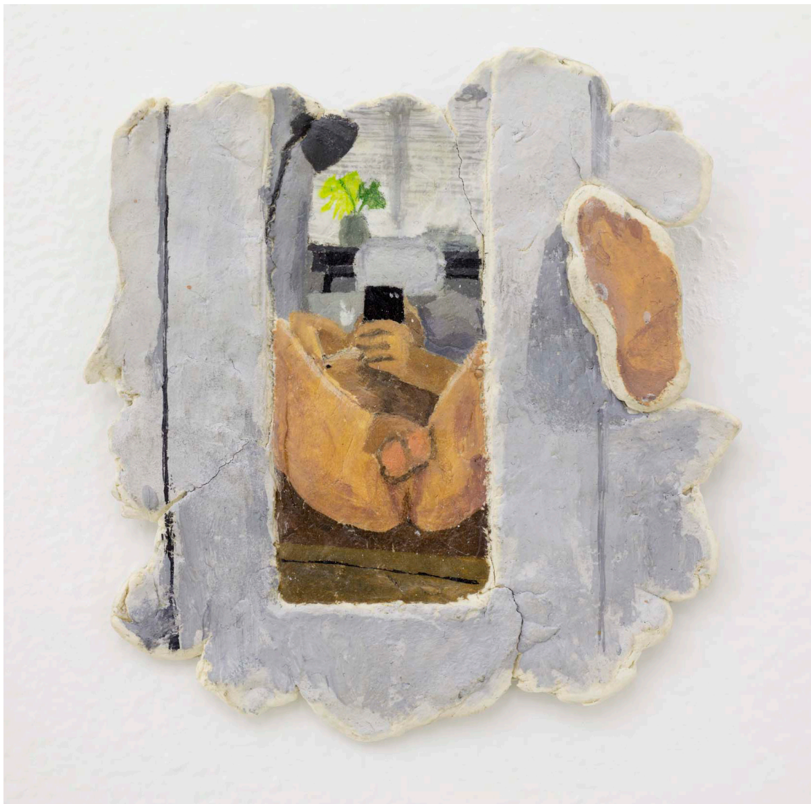
Untitled (K #3) , 2020. Gouache on paper clay. 11 x 12 cm (4.3 x 4.7 in)