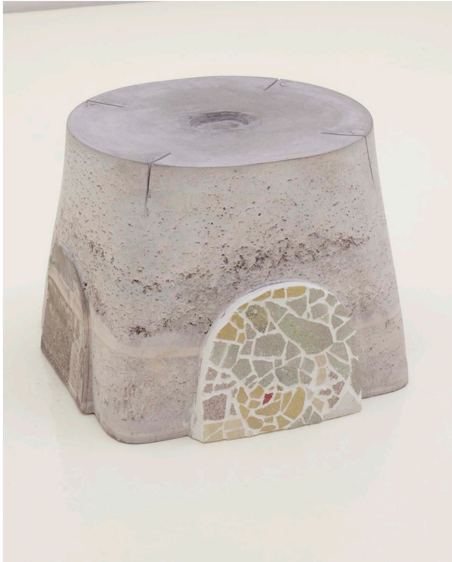
Stool (pornographic Doppelgänger), 2021.

Concrete cast, glazed porcelain tiles, joint compound. 26 x 23 x 24 cm (10.2 x 9 x 9.4 in)