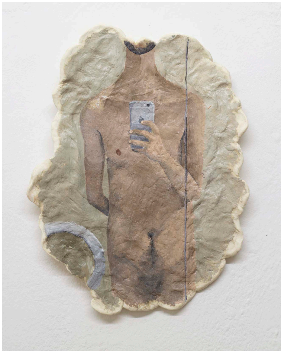
Untitled (bathroom #2) , 2021. Gouache on paper clay. 24 x 18 cm (9.4 x 7 in)