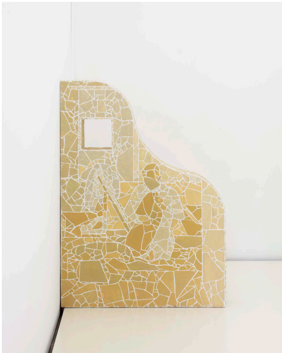
Partition (two toilets) , 2021.

Wood, glazed porcelain tiles, joint compound. 140 x 100 x 22 cm (55.1 x 39.3 x 8.6 in)