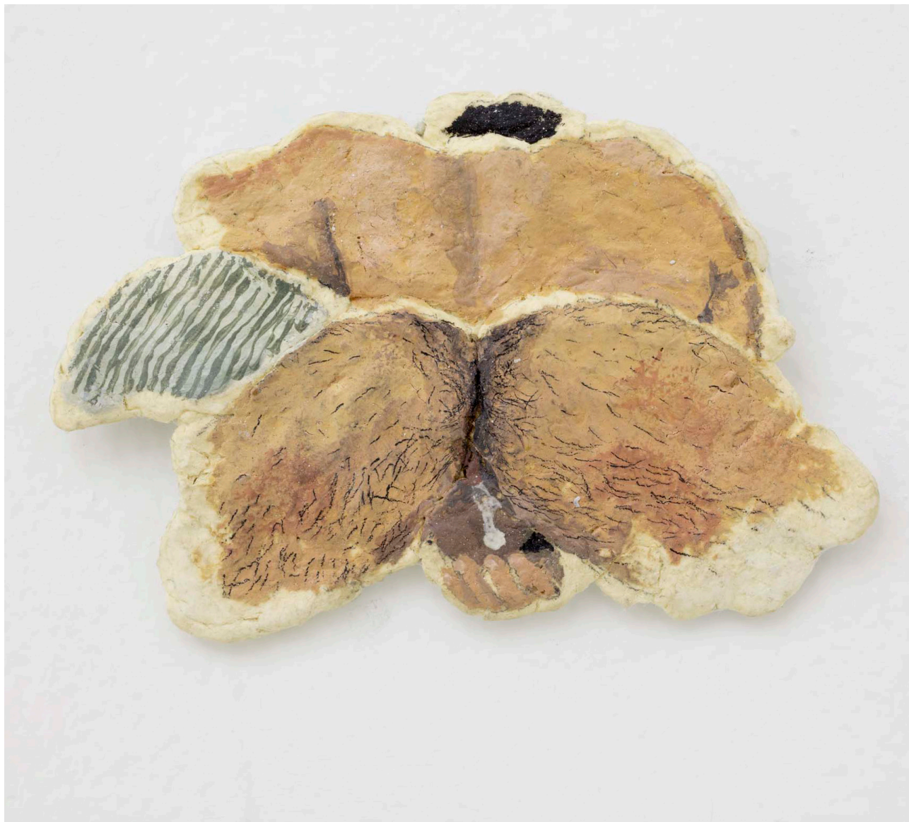
Untitled, 2020. Gouache on paper clay. 10 x 6 cm (3.9 x 2.3 in)