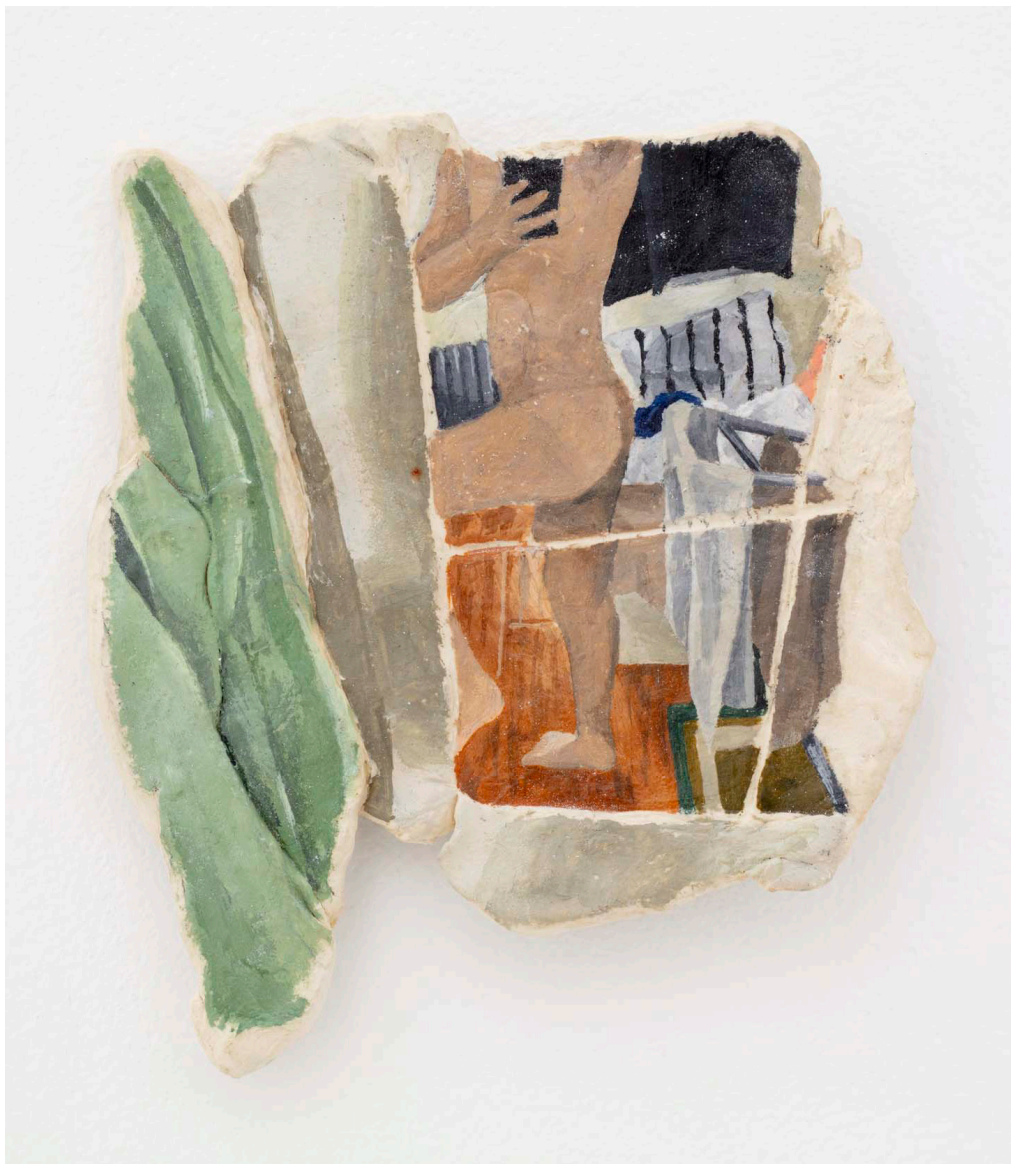
Untitled (Clean laundry) , 2020. Gouache on paper clay. 12 x 13 cm (4.7 x 5.1 in)