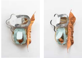
“buttai 83” 2021

January 15 - February 19, 2022 check list