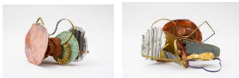
“buttai 87” 2021

cloth, cotton, brass, aluminum board, copper board, wood, acrylic and paint h 43 x w 34 x d 24 cm (16.92 x 13.38 x 9.44 inches)