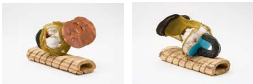
“buttai 85” 2021

brass, copper board, cloth, wood, wire, acrylic, and spray h 44 x w 28 x d 22 cm (17.32 x 11.02 x 8.66 inches)