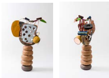
“buttai 88” 2021

copper mesh, brass, aluminum board, wood, paper, cloth, acrylic and paint h 26 x w 44 x d 35 cm (10.23 x 17.32 x 13.77 inches)