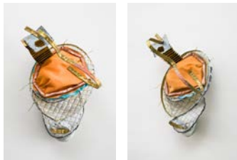
“buttai 84” 2021

aluminum board, copper board, brass, wood, plaster, cotton, acrylic, paint and spray h 58 x w 34 x d 17 cm (22.83 x 13.38 x 6.69 inches)