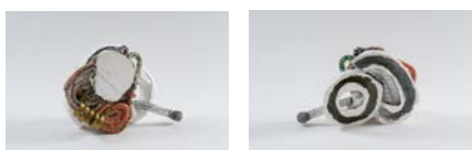
“buttai 89” 2021

wood, copper board, copper mesh, acrylic and paint h 82 x w 54 x d 26 cm (32.28 x 21.26 x 10.23 inches)