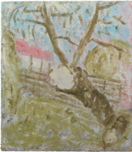
Cherry Tree in Spring , 2015 oil on board, 56 x 48 in (142.2 x 121.9 cm)