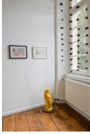
Anne Duk Hee Jordan Pferdeäpfel, Ziggy goes Wild 2019 Dried horse dung, string 200 x 82 x 8,5 cm