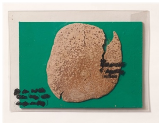
Dieter Roth Selbstoportrait 1969 Chocolate on green plywood board 20 x 28,5 Edition 46/100 Signed, dated and numbered