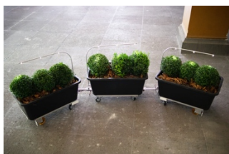
Anne Duk Hee Jordan Buchsbäume 2020 Plastic pots, boxwood, leaves, sensors, motor frame, LED lights 84 x 282 x 46,5 cm