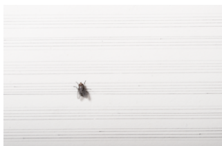
Andreas Greiner Etüden Für 6 Beine und 2 Flügel 2015 Pencil on paper, 6 flies' pupaes 62,5 x 93,5 cm (framed)