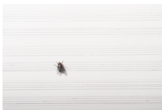
Andreas Greiner (in collaboration with Therese Strasser) Etüden Für 6 Beine und 2 Flügel 2015 HD video of six hatching flies on a sheet of music, composition for four hands by Therese Strasser, based on the video work by Andreas Greiner, 11 pages each 29,7 x 21 cm