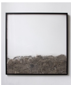
Elisa Jule Braun HUMUS HUMANA, Version Stumm/Braun 2017 Dust, frame 100 x 100 cm