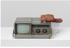
untitled, 2021 tv stereo, epoxy putty, glass 12 x 42 x 34 cm 4 3/4 x 16 1/2 x 13 3/8 in (MA-SMITM-00143)