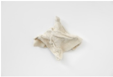
untitled, 2021 drone, towel 43.5 x 49 x 11 cm 17 1/8 x 19 1/4 x 4 3/8 in (MA-SMITM-00142)