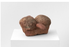
untitled, 2021 stone, epoxy putty 16 x 37 x 27 cm 6 1/4 x 14 5/8 x 10 5/8 in (MA-SMITM-00144)