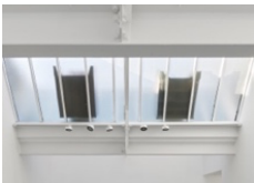
untitled, 2021 chests of drawers overall 112 x 332 x 50 cm 44 1/8 x 130 3/4 x 19 3/4 in (MA-SMITM-00155)