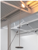
untitled, 2021 lamp, extension cable 153 x 25 x 25 cm 60 1/4 x 9 7/8 x 9 7/8 in (MA-SMITM-00154)