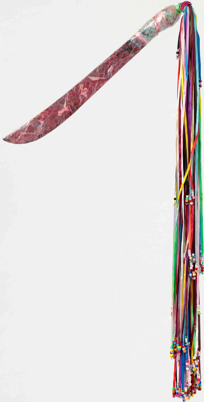
Jordan/Martin Hell Rachel, my torment... , 2021 ribbon, acrylic, plastic, reflective tape, human hair, hair beads 108 x 57 cm, 42 1/2 x 22 1/2 inches