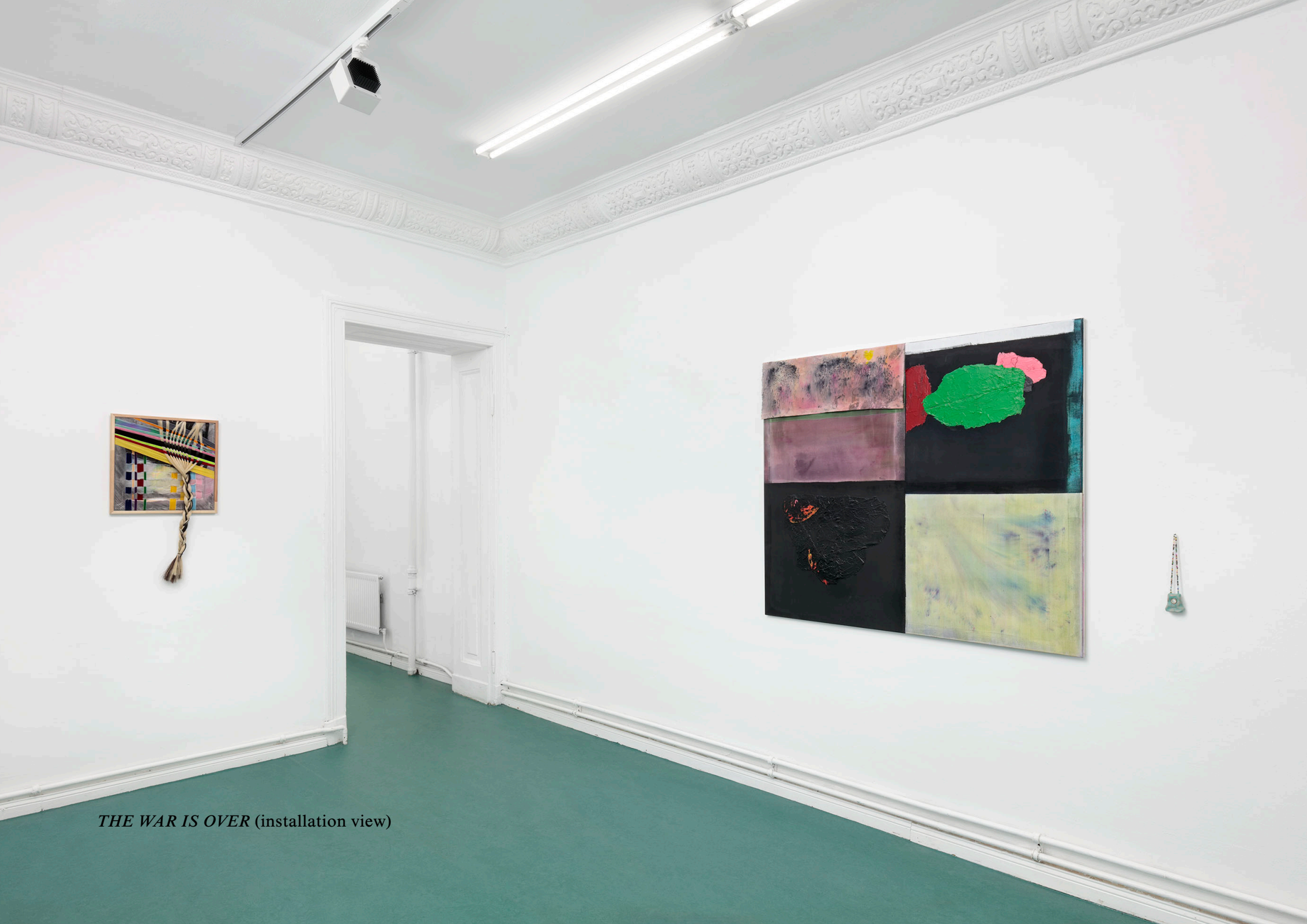
THE WAR IS OVER (installation view)