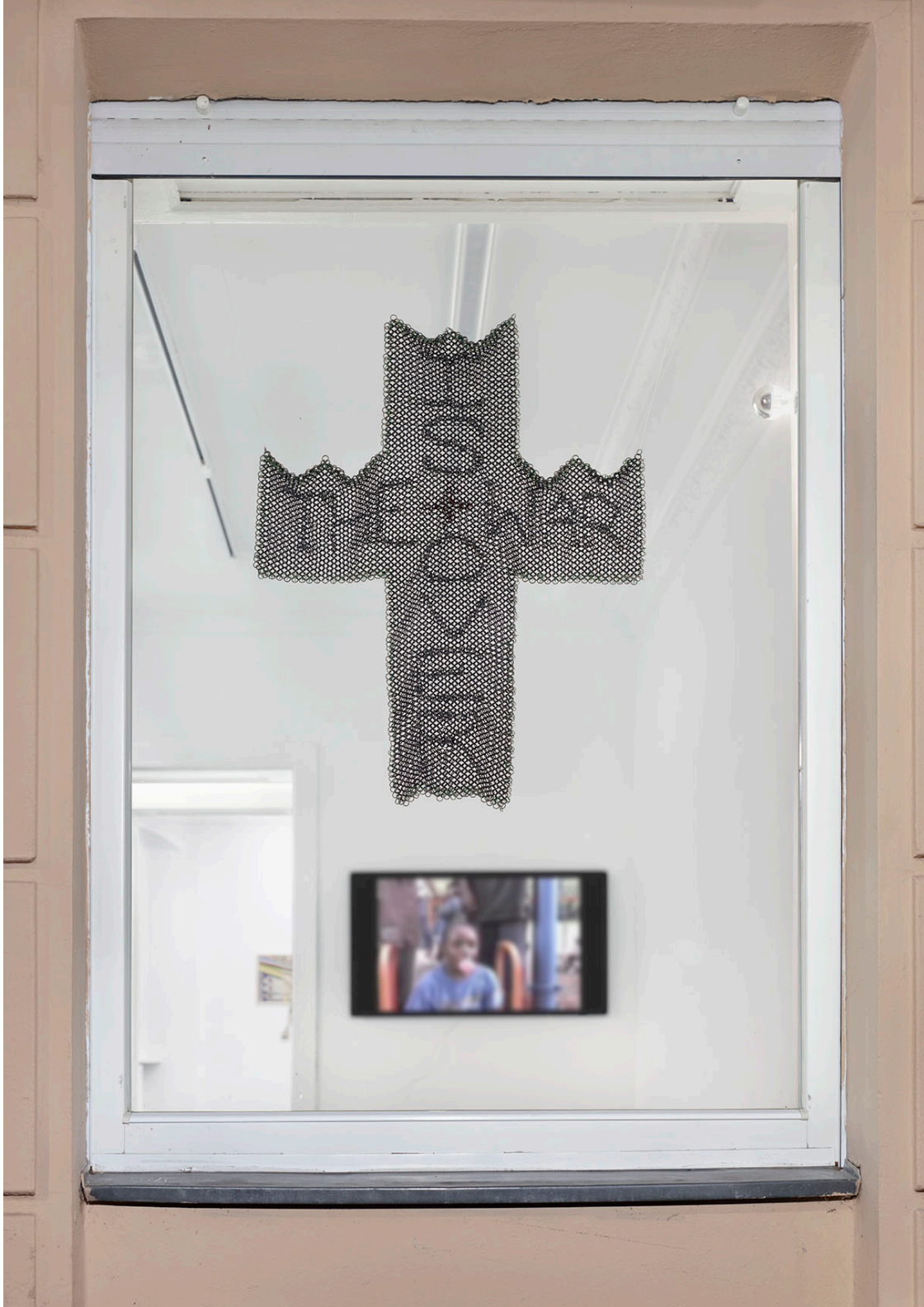
Jordan/Martin Hell THE WAR IS OVER , 2022 chain rings 83 x 64 cm, 32 5/8 x 25 1/4 inches