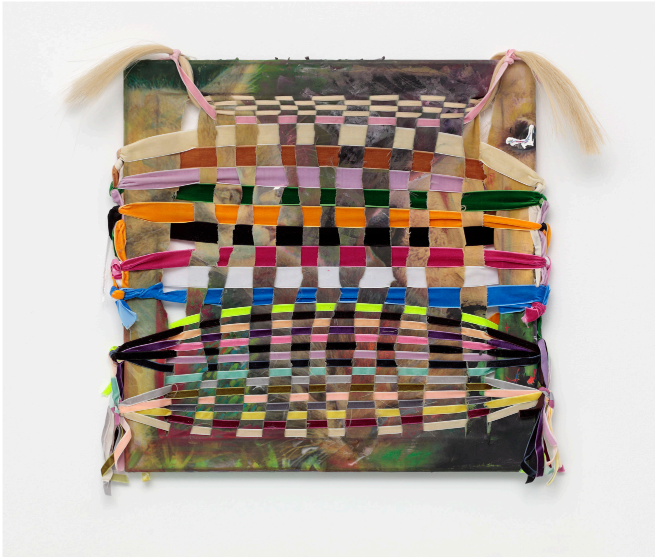
Jordan/Martin Hell Rebecca , 2021 fabric, velvet ribbon, acrylic, horse hair 50 x 54 cm, 19 3/4 x 21 1/4 inches