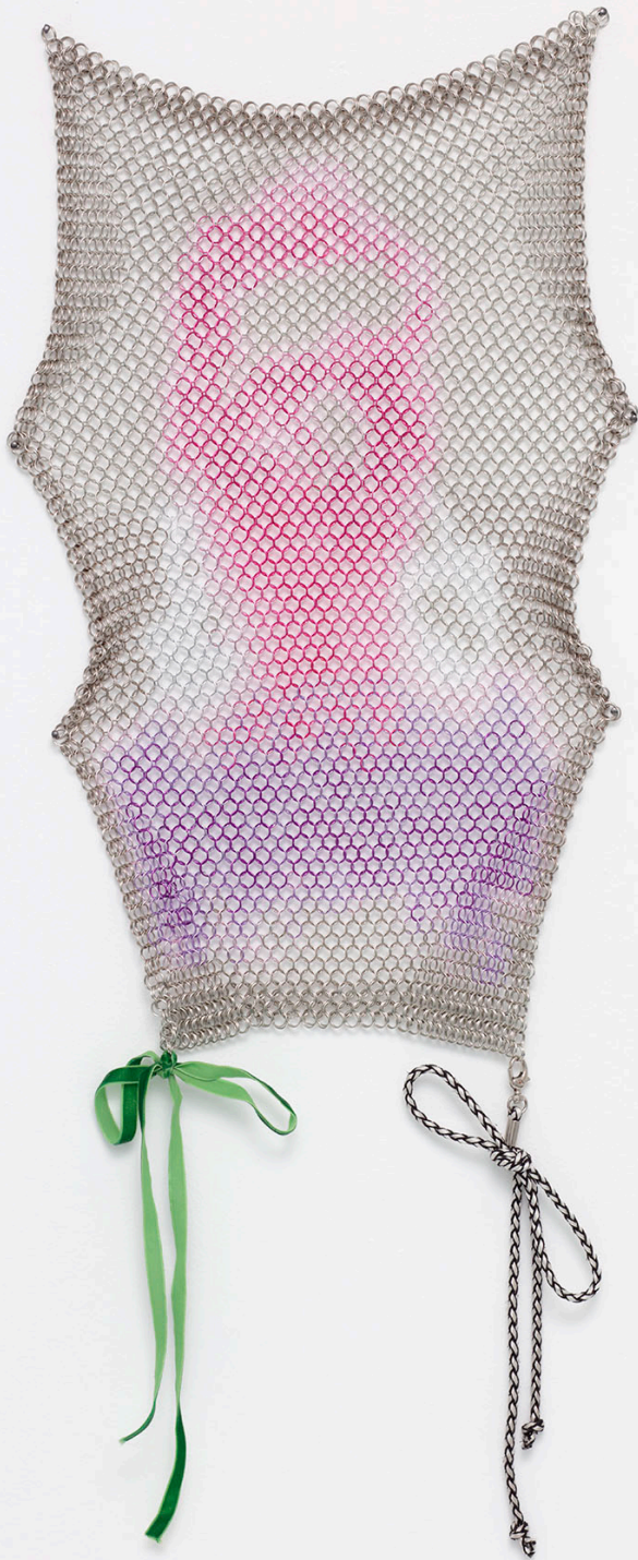
Jordan/Martin Hell Portrait of Hilma af Klint in Chainmail , 2021 chain rings, velvet ribbon, string 86 x 35 cm, 33 7/8 x 13 3/4 in