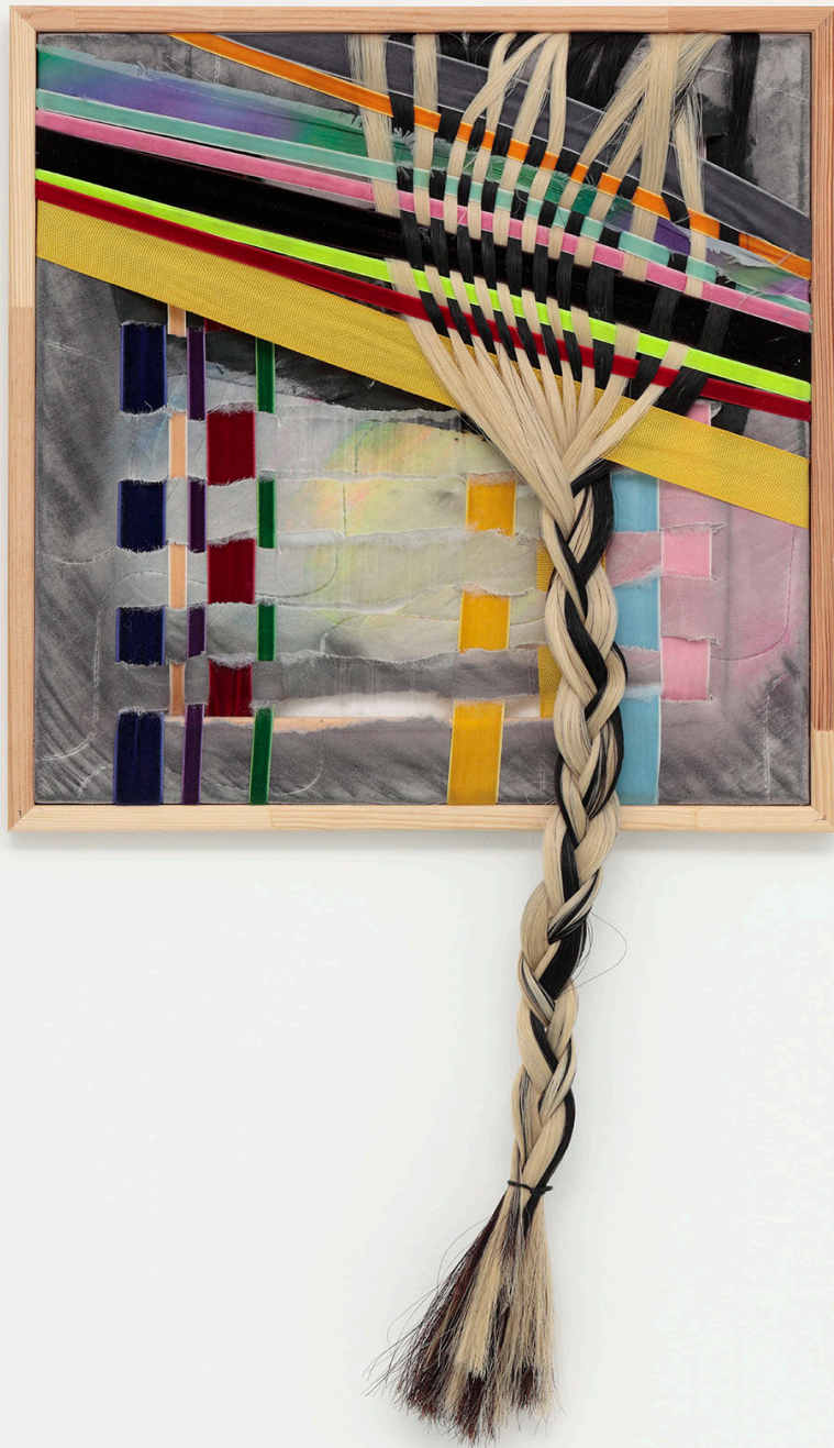
Jordan/Martin Hell Bianca , 2021 fabric, acrylic, dye, horse hair, various ribbons 75 x 43 cm, 29 1/2 x 16 7/8 inches