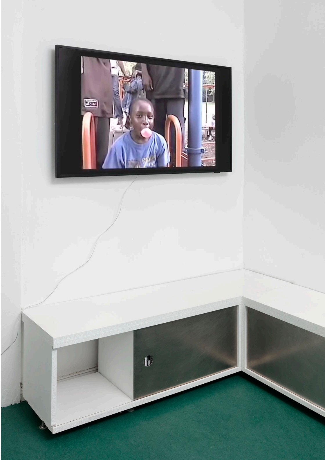
THE WAR IS OVER (installation view)