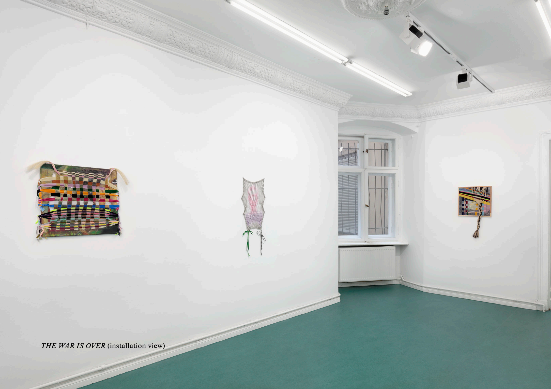
THE WAR IS OVER (installation view)