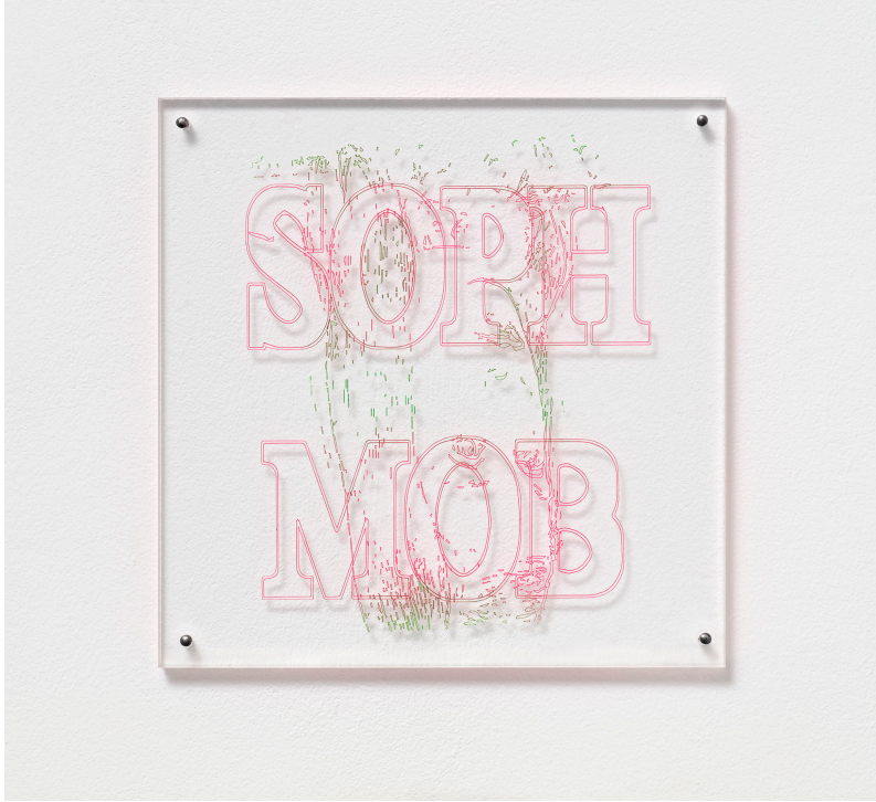
Jordan/Martin Hell SOPH MOB , 2021 laser cut on plexi, oil pastel 20 x 20 cm, 7 7/8 x 7 7/8 inches