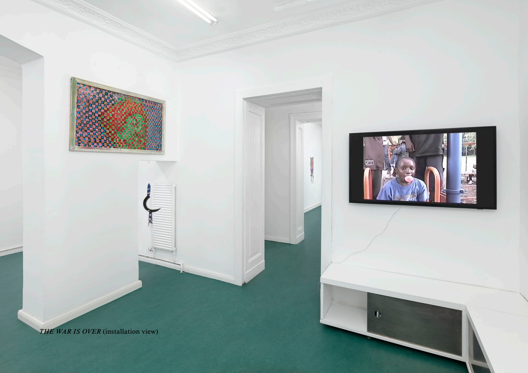
THE WAR IS OVER (installation view)