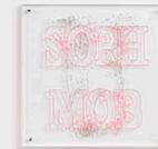
THE WAR IS OVER (installation view)