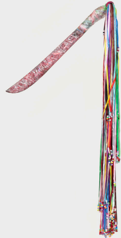
THE WAR IS OVER (installation view)