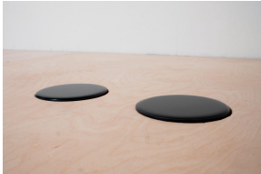
Many Rabbit Holes , 2022. Wood, aluminum, water, dimensions variable.