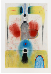
Body Print #2 , 2022. Pastel on paper, 63.5 x 42 inches.