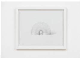
Slinky #2 . Graphite on paper, 13.75 x 16.5 inches (framed dimensions).