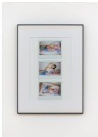
Body Prints Documentation , 2022. Polaroid photographs, 16.25 x 12 inches (framed dimensions).