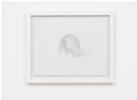
Slinky #1 , 2022. Graphite on paper, 13.75 x 16.5 inches (framed dimensions).