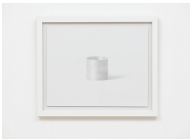
Slinky #3 . Graphite on paper, 13.75 x 16.5 inches (framed dimensions).