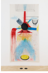
Body Print #1 , 2022. Pastel on paper, 82.5 x 42 inches.