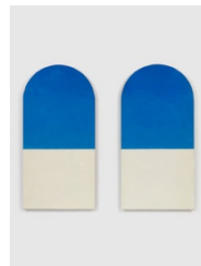
Mary Obering Dream Plane , 1975 Oil on masonite 2 panels: 48 x 24 in (121.9 x 60.9cm) (MO9573)