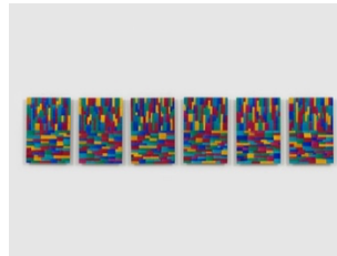
Mary Obering Jewels , 1977 Egg tempera on masonite 6 panels: 12 x 8 in (30.5 x 20.3cm) each (MO9570)