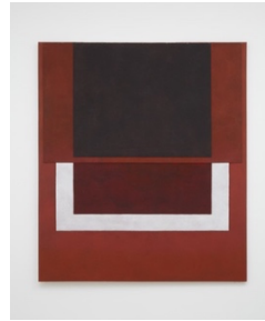
Mary Obering The Chinese Place , 1975 Acrylic on canvas 82 x 72 in (208.3 x 182.9cm) (MO9555)