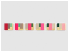
Mary Obering Story , 1999 Egg tempera and gold leaf on gessoed panel 6 panels: 10 x 12 x 1 3/4 in (25.4 x 30.5 x 4.45 cm) each (MO9580)