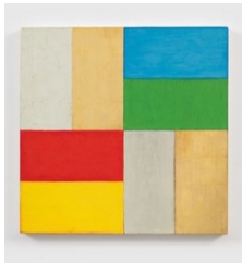
Mary Obering L'Aiuola , 1992 Egg tempera, gold leaf, and white gold leaf on gessoed panel 24 x 24 in (61 x 61cm) (MO9152)