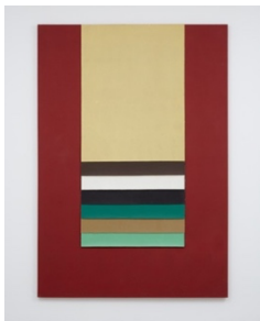
Mary Obering Drop Series #10 , 1972 Acrylic on canvas 96 x 66 in (243.8 x 167.6cm) (MO9553)

Please ask to see the following works in the office