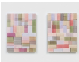
Mary Obering Paler I , 1978 Egg tempera on plywood 2 panels: 30 x 24 in (76.2 x 60.9cm) each (MO9579)