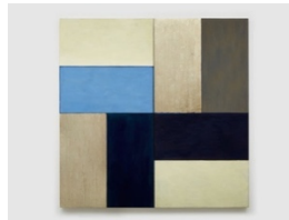
Mary Obering Winter , 1992 Egg tempera and white gold leaf on gessoed panels 84 x 84 in (213.4 x 213.4 cm) (MO9587)