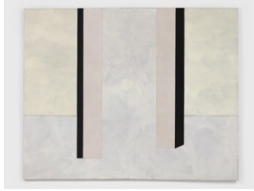
Mary Obering Through Snowy Mountains at Dawn , 1973 Acrylic on canvas 96 x 120 in (243.8 x 304.8cm) (MO9572)