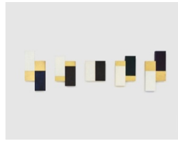
Mary Obering Sail On (For Hyde) , 1998 Egg tempera, gold leaf on gessoed panels Variable 5 panels: 24 x 24 x 4 3/4 in (60.96 x 60.96 x 12.06 cm) to 36 x 24 x 4 3/4 in (91.44 x 60.96 x 12.06 cm) each (MO9576)