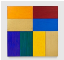
Mary Obering A2 + Y2 , 1992 Egg tempera and gold leaf on gessoed panels 2 panels, total dimensions: 84 x 84 in (213.4 x 213.4cm) 2 panels: 84 x 42 in (213.4 x 106.7cm) each (MO9578)