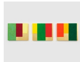
Mary Obering KCB, BKC, CBK , 2003 Egg tempera and gold leaf on gessoed panels 3 panels: 24 x 30 x 2 in (60.9 x 76.2 x 5.1 cm) each (MO9583)