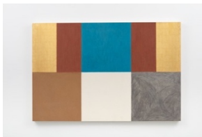
Mary Obering Archangel , 1990 Egg tempera, gold leaf, graphite, and gilding clay on gessoed panel 48 x 72 in (121.9 x 182.9cm) (MO9338)