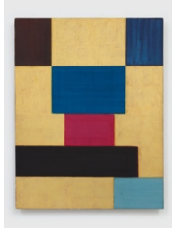
Mary Obering Bridge , 1979 Egg tempera, gold leaf on gessoed panel 27 x 21 in (68.6 x 53.3cm) (MO9575)