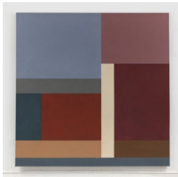
Mary Obering Announcement , 1973 Oil on canvas 108.25 x 108.25 in (274.9 x 274.9cm) (MO9571)

Please ask to see the following works in the office