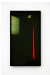
Jennifer Bolande Exit Triangle , 2010 Inkjet print 30h x 16w in Edition #1/2