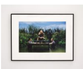
Yul Brynner Cecil B. DeMille on the Set of The Ten Commandments , 1956 Archival inkjet print 16h x 20w in Edition #6/15