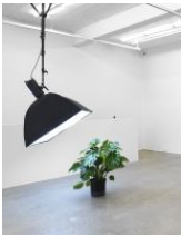
Kerry Tribe Ceiling Light (Monstera deliciosa) , 2018 Modified lighting equipment and potted plant Dimensions variable