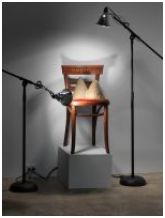
Jennifer Bolande Movie Chair , 1984 Wooden chair, velvet, bronze, enamel paint, light stands, lights, gaffer's tape 60h x 72w x 36d in