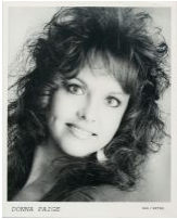
Meg Cranston Yes No Maybe (no) , 1994 Black and white print 20h x 16w in