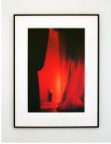
Yul Brynner The King and I , 20th Century Fox Studios, Los Angeles, 1956 Archival inkjet print 20h x 16w in Edition #4/15