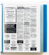
Meg Cranston Women Who Would Play Me If I Paid Them (Partial Facsimile) , 1994 Black and white xerox, display book with plastic sleeves Each page: 11x8.5 in; overall: 11.375x9.625 in