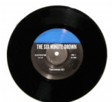
Jack Goldstein The Six Minute Drown , 1977 Black vinyl record with blue label 7h x 7w in