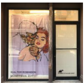
Walter Robinson Money Man , 2017 Acrylic on bed sheet 98h x 69.50w in