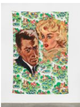
Walter Robinson Strange Journey , 2017 Acrylic on bed sheet 92.50h x 63w in