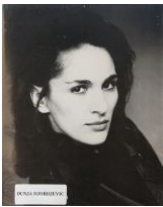
Meg Cranston Yes No Maybe (maybe) , 1994 Black and white print 20h x 16w in