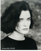
Meg Cranston Yes No Maybe (yes) , 1994 Black and white print 20h x 16w in