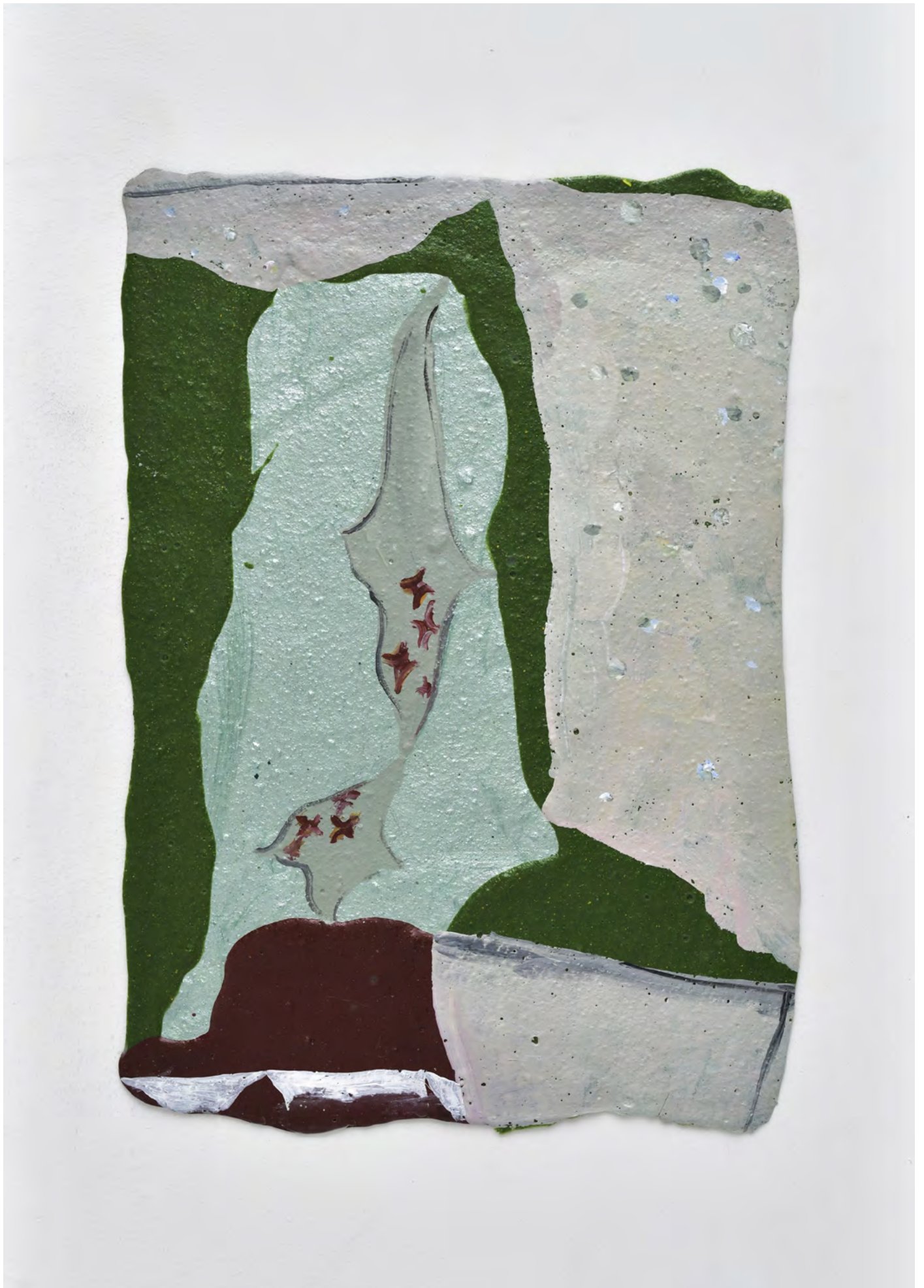
Minuit , 2021. Acrylic painting, acrylic binder, pigments