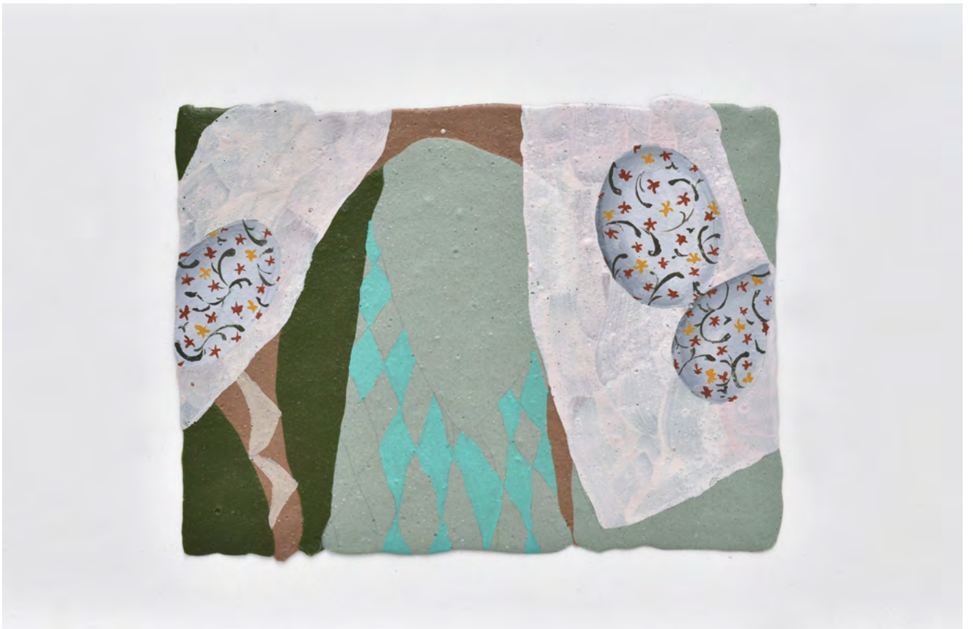
Trung, 2021. Acrylic binder, pigments, acrylic painting, pencil