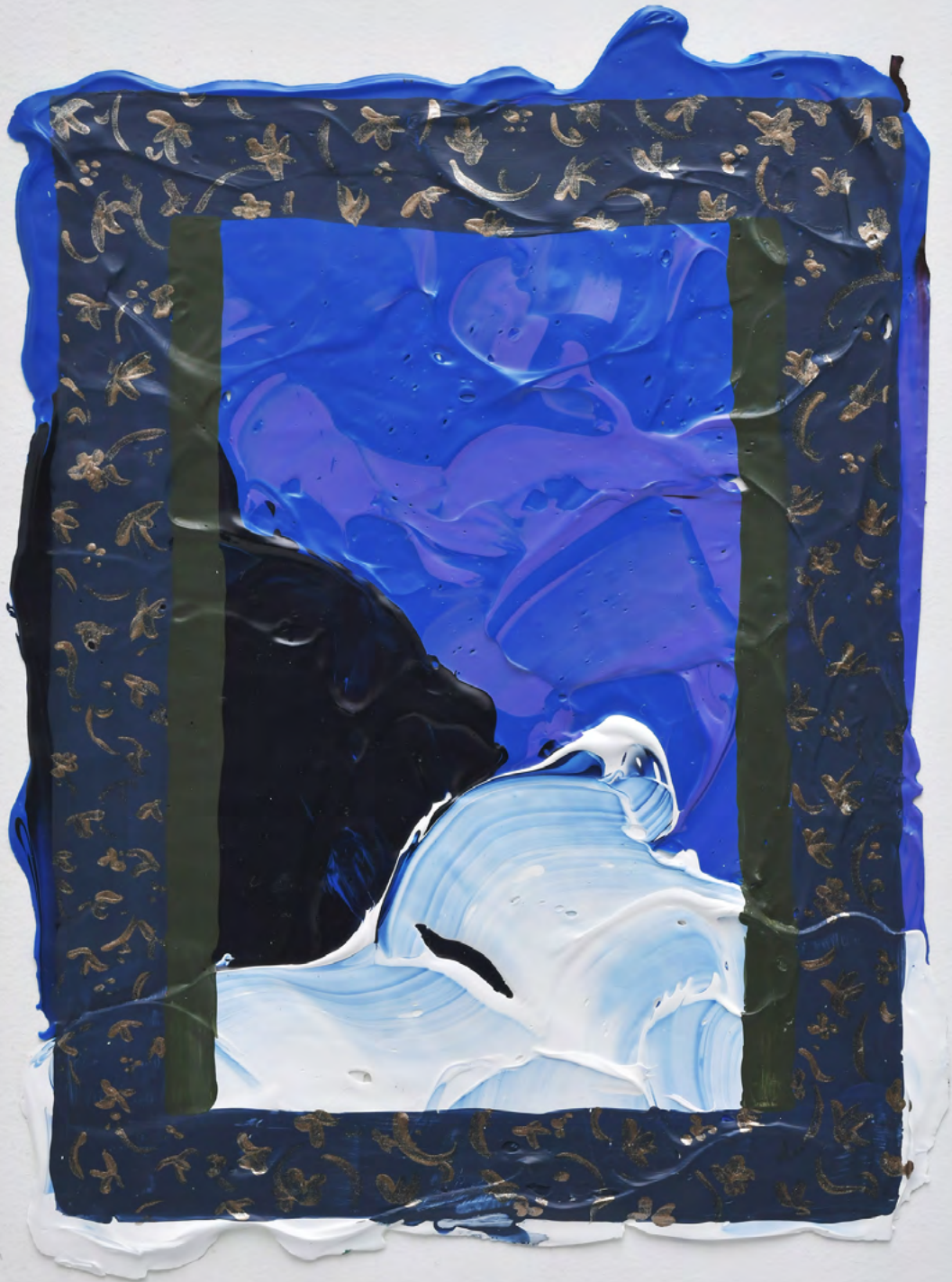
Minia , 2022. Acrylic painting