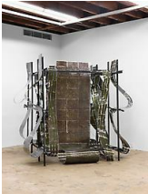
Anne Libby Tessera , 2017 Seaweed, laminate, formica, powder-coated steel 84 x 84 x 84 in