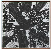
Barry Le Va Diagrammatic Silhouettes: Sculptured Activities (Black Stress) , 1987 Ink on paper, cut and glued to ink on paper 80 x 80 in Unique