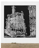
Peter Nagy Eight Line Poem , 1991 Acrylic on canvas 72 x 72 in Unique