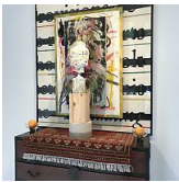
Peter Nagy Was and When , 2017 Work by: Arlene Shechet, Cosmo Head , 1997, Hydrocal, Acrylic Paint Skins, Concrete and Steel, 18 x 7 x 7.4 in.; Ross Bleckner, Untitled , 2014, Oil on Linen, 32 x 16 in.; Bill Saylor, Future Cast , 2017, Oil, Oil Pastel, Pastel, Graphite and Charcoal on Paper mounted on Canvas Panel, 40 x 27 in.; Joseph Kosuth, Zero & Not , Offset Print on Paper with Colored Tape, 54 x 47 in.; Amritsar Rug , 20th c., Wool, 36 x 72 in.; Meiji Era Merchant's Chest , 19th c., Keyaki and Sugi Wood, 40 x 47.5 x 16 in Overall Dimension: 94 x 47 x 16 in