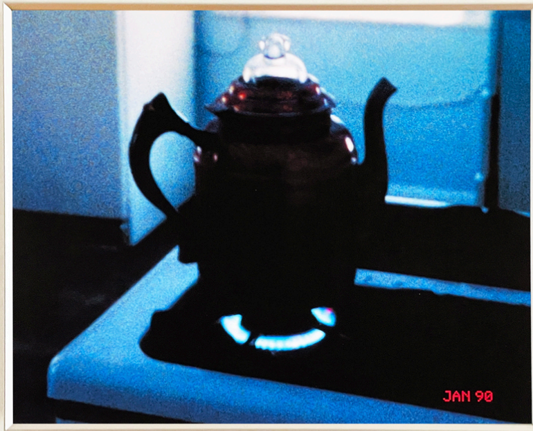
Steel Stillman Small Percolator (1990), 2017 Archival pigment print 8 x 10 inches (20.3 x 25.4 cm) Edition: 1/3