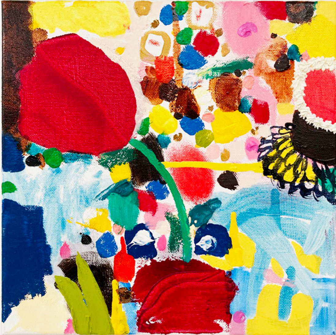
Tracy Miller Tulips , 2021 Oil on canvas 10 x 10 inches (25.4 x 25.4 cm)