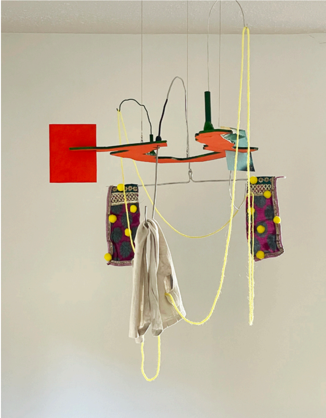
Dawn Cerny Relatable holes and a tender bruise, 2021

Wood, apoxie sculpt, wire, textiles, pom poms, paint, gouache on archival pigment proofs by Steel Stillman: "Dappled" and "Pool," both 2016