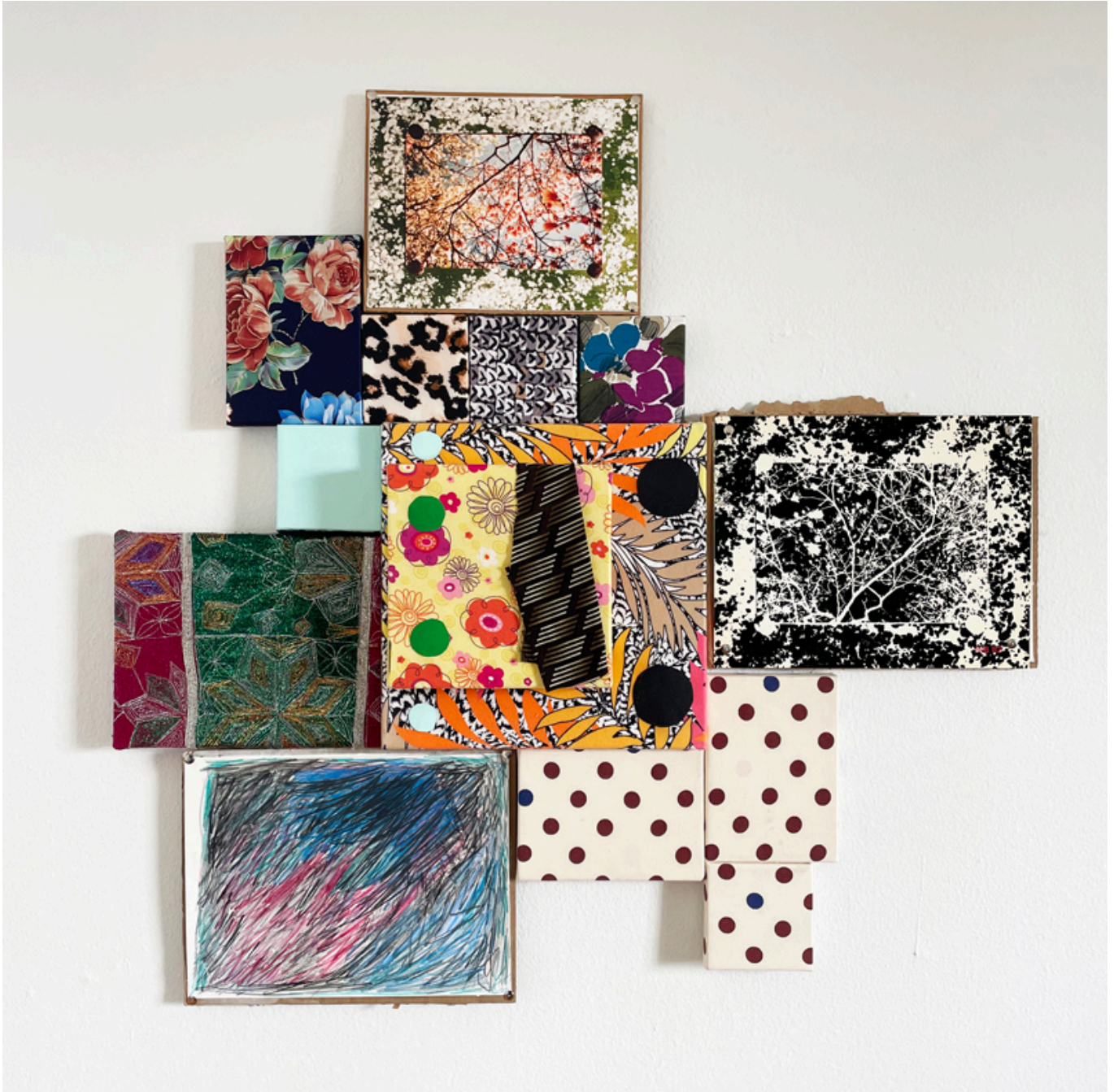
Nancy Shaver Spacer #2 with Steel Stillman , 2021

Photographs, canvas panels, dress fabric, t-shirt fabric, tablecloth, Afghani sleeve, paper, Flashe paint, scribble drawing 24 x 30 x 4 inches (61 x 76.2 x 10.2 cm)