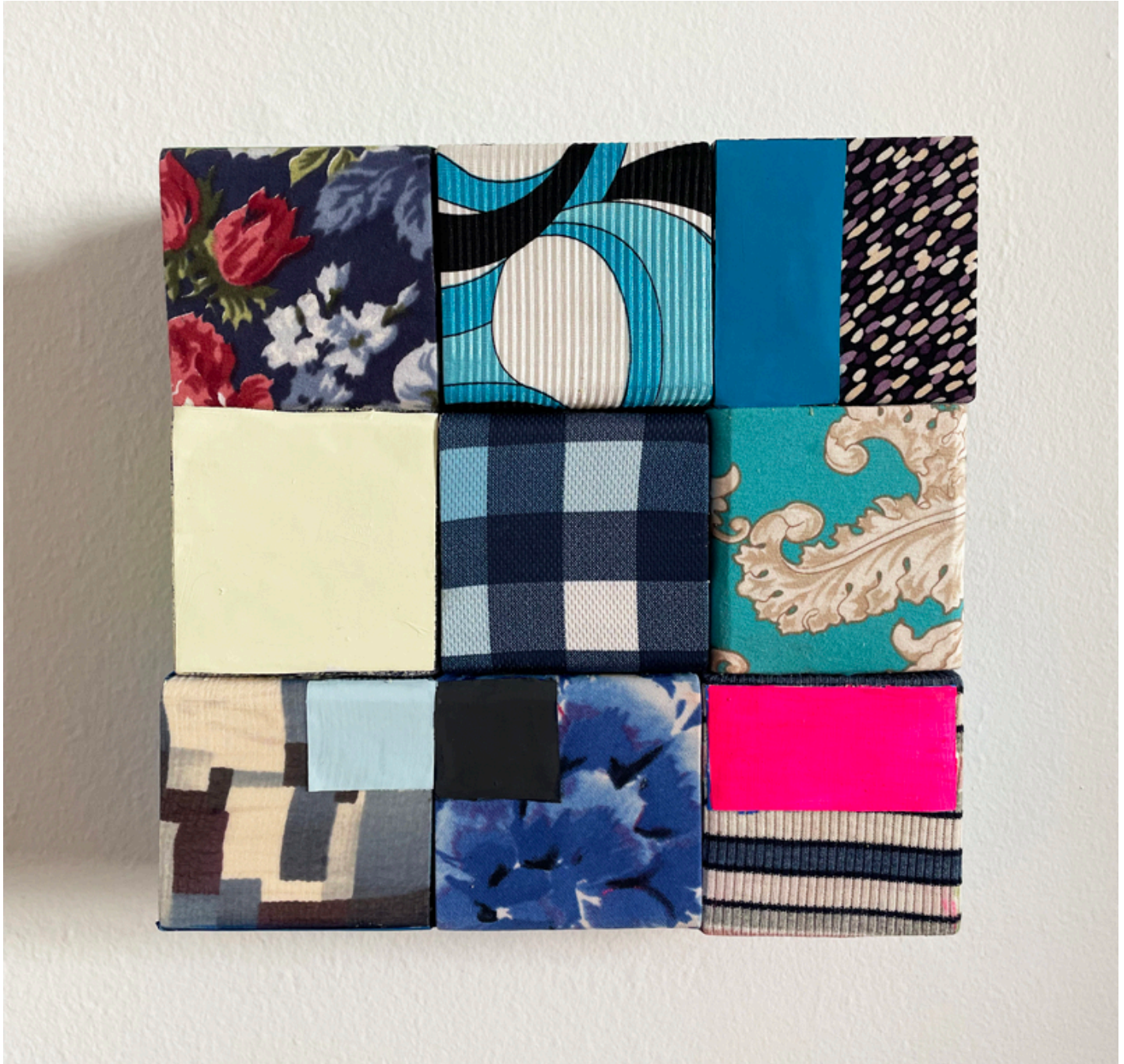
Nancy Shaver #5 from the Gret series , 2021 Wooden blocks, dress fabric, paper, Flashe paint 10 3/4 x 10 1/2 x 3 inches (27.3 x 26.7 x 7.6 cm)