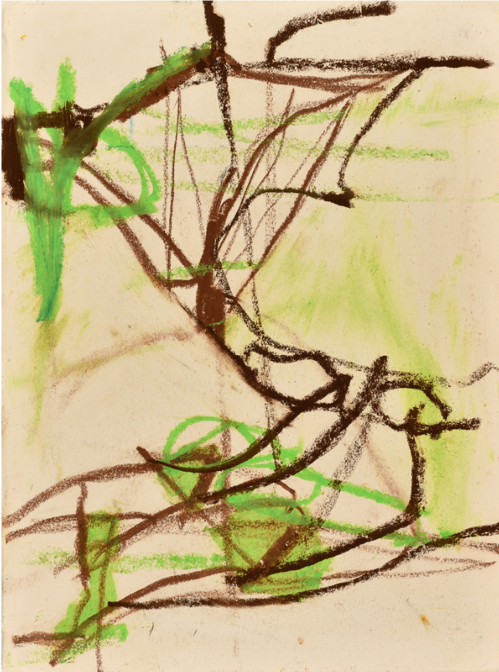
Pamela Cardwell DM80 , 2021 Oil pastel on paper pinned to cardboard frame by Shaver 15 1/2 x 11 5/8 inches (39.4 x 29.3 cm)