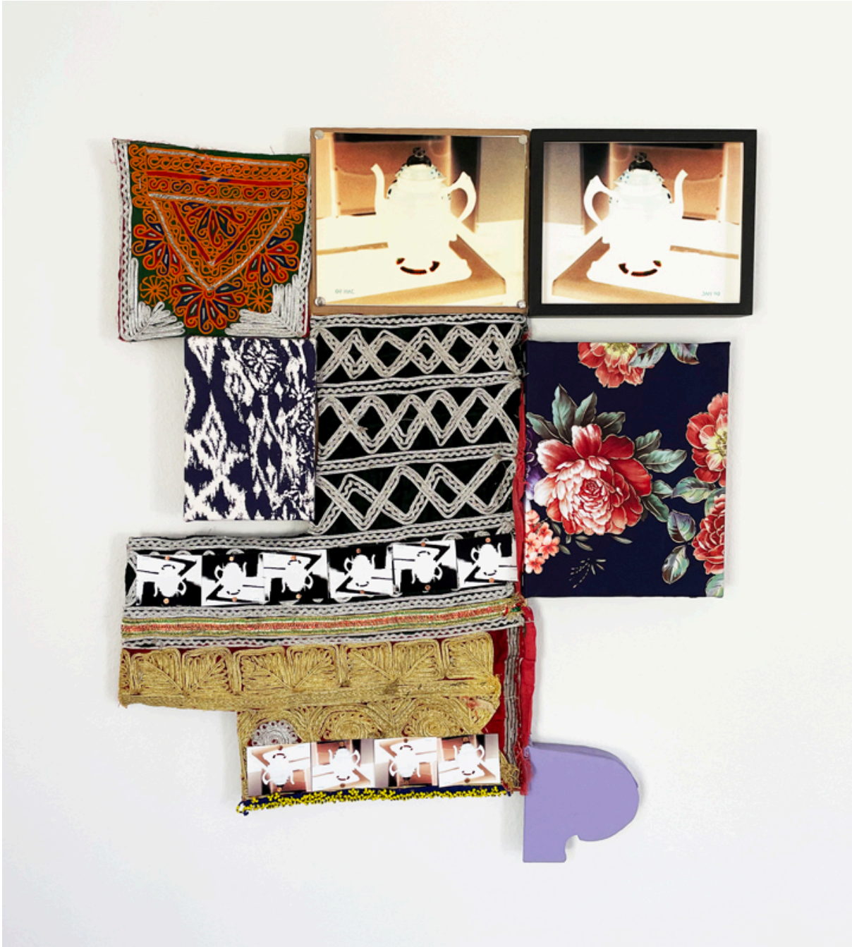
Nancy Shaver Spacer #3 with Steel Stillman , 2021

Photographs, canvas panels, dress fabric, Afghani sleeve, picture frame, wood, Flashe paint 29 x 34 inches (73.7 x 86.4 cm)