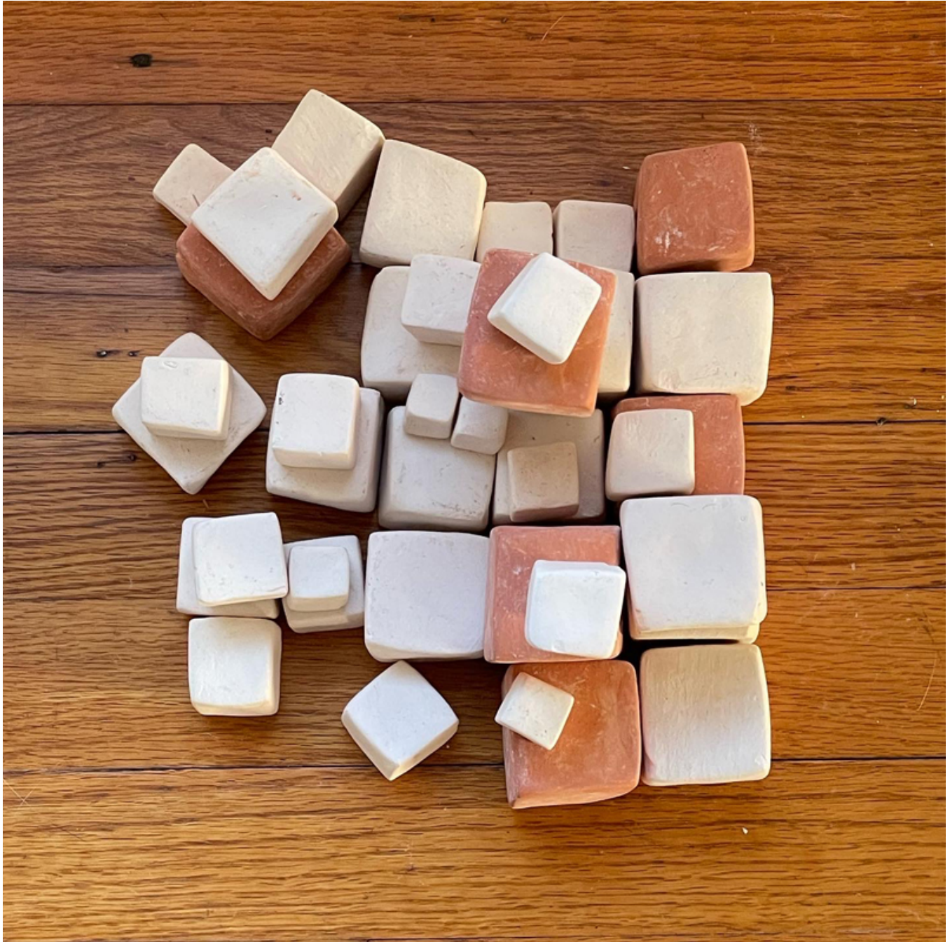
Marley Freeman Blocks , ongoing Fired stoneware Variable dimensions