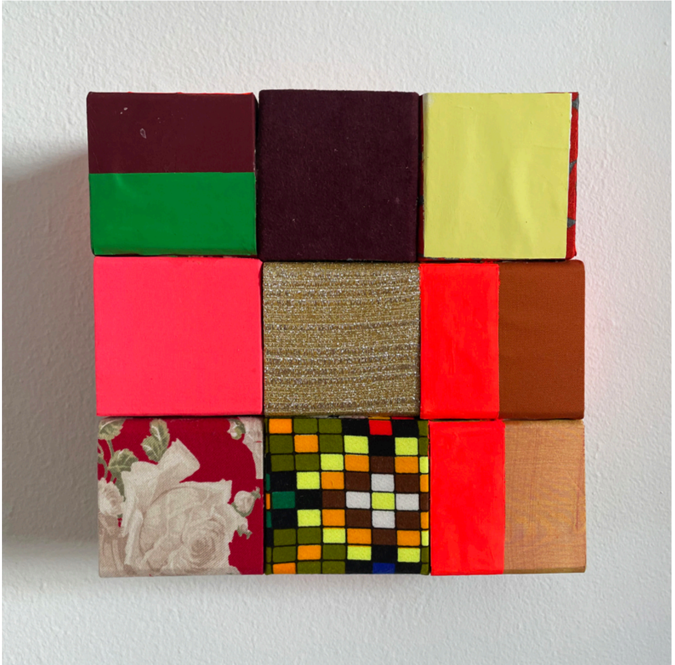
Nancy Shaver #3 from the Gret Series, 2021 Wooden blocks, dress fabric, Flashe paint 10 1/2 x 10 3/4 x 3 inches (26.7 x 27.3 x 7.6 cm)