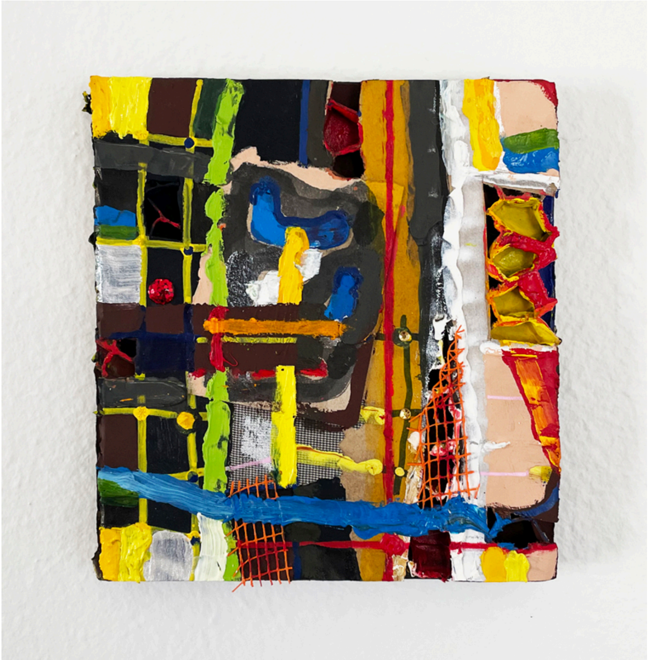
Jean-Philippe Antoine Riverrun , 2021

Honeycombed cardboard, paper, fabric, Flashe, oil and acrylic paint, acrylic marker, adhesive rhinestones 6 x 5 1/2 inches (15.2 x 14 cm)