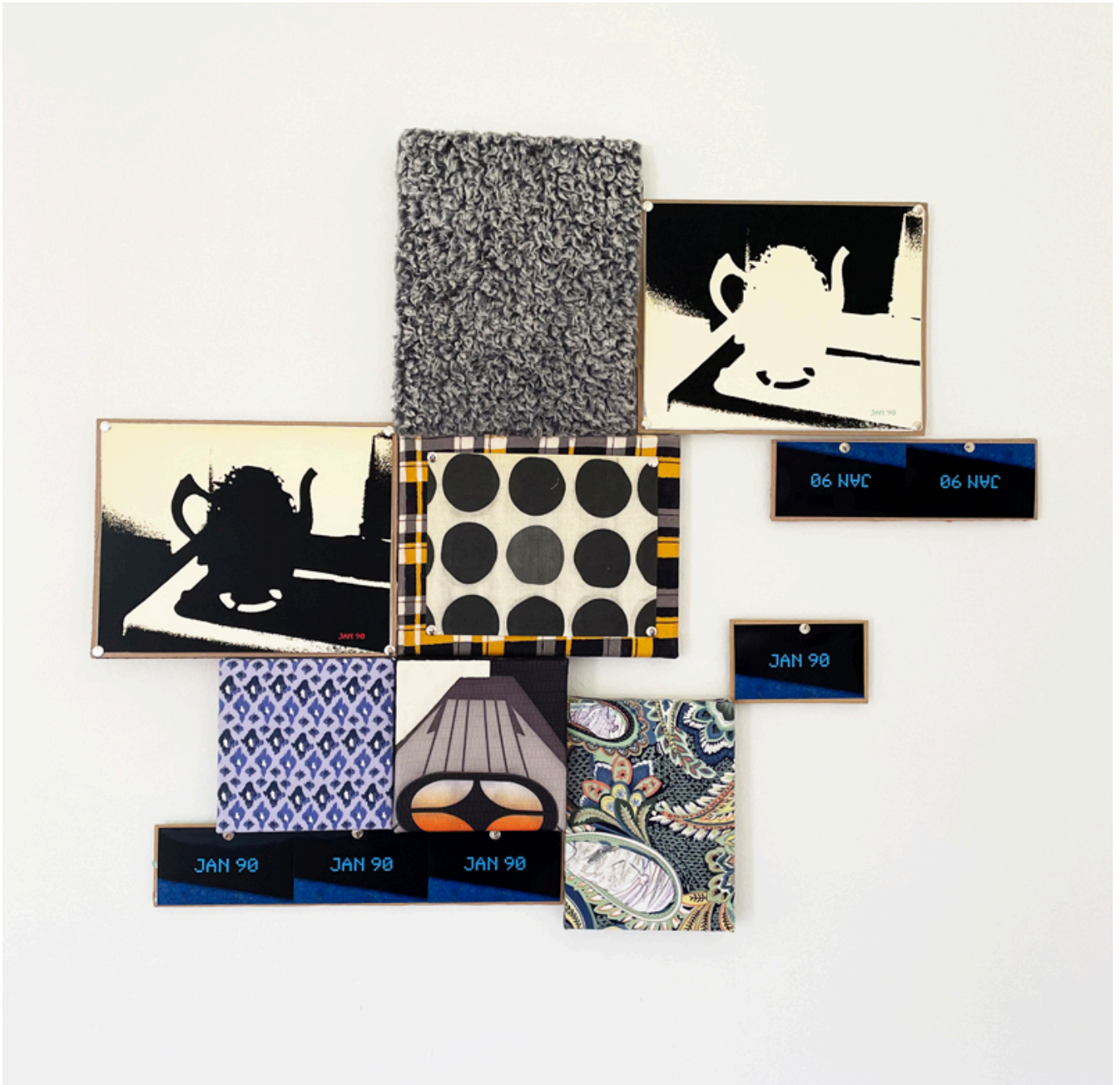
Nancy Shaver Spacer #1 with Steel Stillman , 2021

Photographs, canvas panels, dress fabric, jacket fabric, t-shirt fabric, photocopy, Flashe paint 28 x 34 inches (71.1 x 86.4 cm)