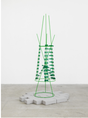
Linnea Kniaz Framework 7 , 2017 Powder-coated wire, construction mesh Work: 52 x 13.5 x 13.5 inches Pedestal: 2 x 26 x 32 inches 21 acrylic-painted bricks: 2 x 3.5 x 8 inches each