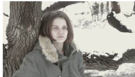
Keren Cytter Siren , 2014 Digital HD video with sound; 14 min, 39 sec Edition 4 of 5 + 2 APs