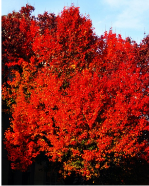
Steel Stillman Autumn , 2016 Archival Inkjet Print 74h x 60w in Unique, plus 1 AP