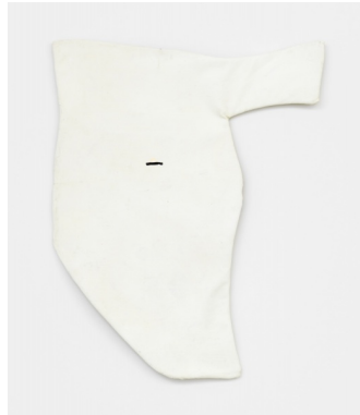
Linnea Kniaz The One Special mark is Given a Platform and a Glow but is Still Small , 2013 Acrylic and oil marker on canvas stretched onto rubber frame 42h x 35w in