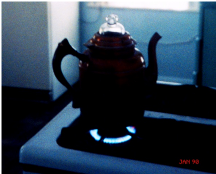
Steel Stillman Percolator , 2017 Archival Inkjet Print 16h x 20w in 1/5