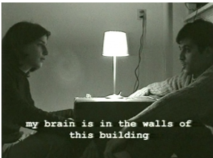
Keren Cytter Experimental Film , 2002 SD video with sound; 6 min, 1 sec Ed. 4 of 5 + 2 AP