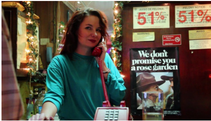
Keren Cytter Rose Garden , 2014 Digital HD video with sound; 8 min, 57 sec Ed. 4 of 5 + 2 AP