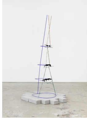
Linnea Kniaz Framework 8 , 2017 Wire, construction mesh, acrylic, gouache Work: 53.75 x 16 x 16 inches Pedestal: 2 x 26 x 32 inches 21 acrylic-painted bricks: 2 x 3.5 x 8 inches each