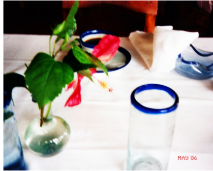
Steel Stillman Coffee , 2017 Archival Inkjet Print 16h x 20w in 1/5