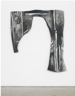
Linnea Kniaz Not There, There but Not There , 2013 Oil on canvas stretched onto rubber frame 66h x 57w in