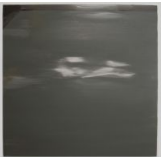
Shirley Irons Fluorescence , 2008 Oil on wood 18h x 18w in