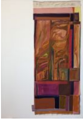
Annabeth Marks Heat Extender , 2018 Oil on canvas with tape and thread 80h x 56w in