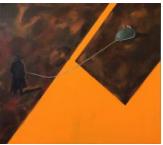
Kathryn Kerr The Country , 2018 Acrylic and oil on canvas 28h x 32w in