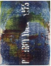
Israel Lund Untitled (SEVERED HEAD DESTROY YOURSELVES) , 2018 Acrylic on raw canvas 88h x 68w in