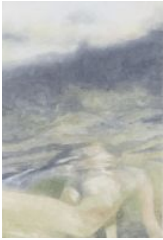
Lucien Smith Lili Swimming , 2017 Oil on linen 17h x 11.50w in