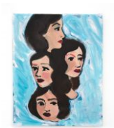
Becky Kolsrud Untitled Study (Heads) , 2017 Oil on canvas 20h x 16w in