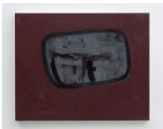
Robert Bordo Red Eye , 2015 Oil on canvas on panel 32h x 40w in