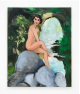
Becky Kolsrud Untitled Study (Bather with Rocks) , 2017 Oil on canvas 20h x 16w in