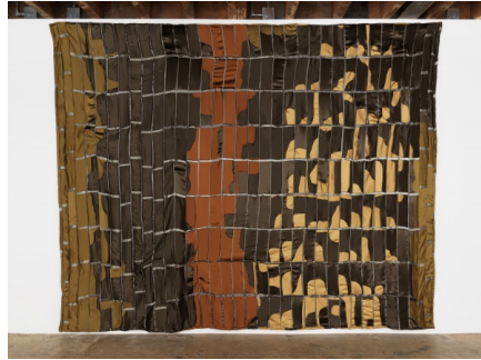
Anne Libby Sunset Gates (submerged) , 2018 Polyester Satin, Batting 102h x 128w in