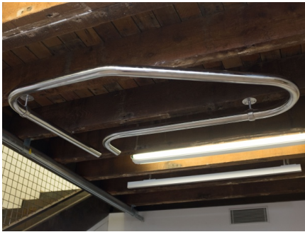
Anne Libby Emanation Body , 2018 Stainless Steel 35.50h x 50.50w x 4.50d in