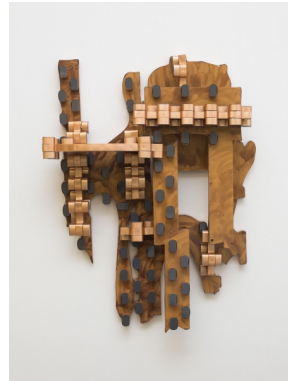
Anne Libby City of Fire , 2018 Plywood, Pigmented Urethane, Venetian Blinds, Formica 31h x 23w x 7d in