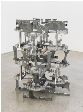
Anne Libby Moloch to Heaven , 2018 Plywood, Pigmented Urethane, Venetian Blinds, Formica 45.25h x 36.50w x 36d in