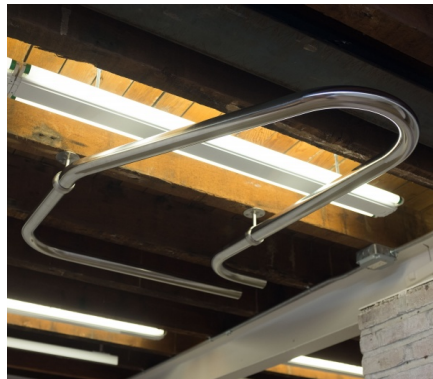
Anne Libby Emanation Body II , 2018 Stainless Steel 35.50h x 50.50w x 4.50d in