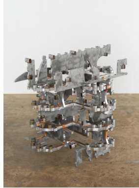
Anne Libby Thirteenth , 2018 Plywood, Pigmented Urethane, Venetian Blinds, Formica 42h x 32.25w x 34.25d in