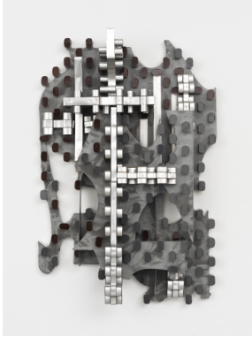
Anne Libby Radiolaria , 2018 Plywood, Pigmented Urethane, Venetian Blinds, Formica 36h x 23.50w x 7d in