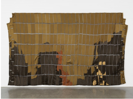
Anne Libby Sunset Gates , 2018 Polyester Satin, Batting 80.50h x 129w in