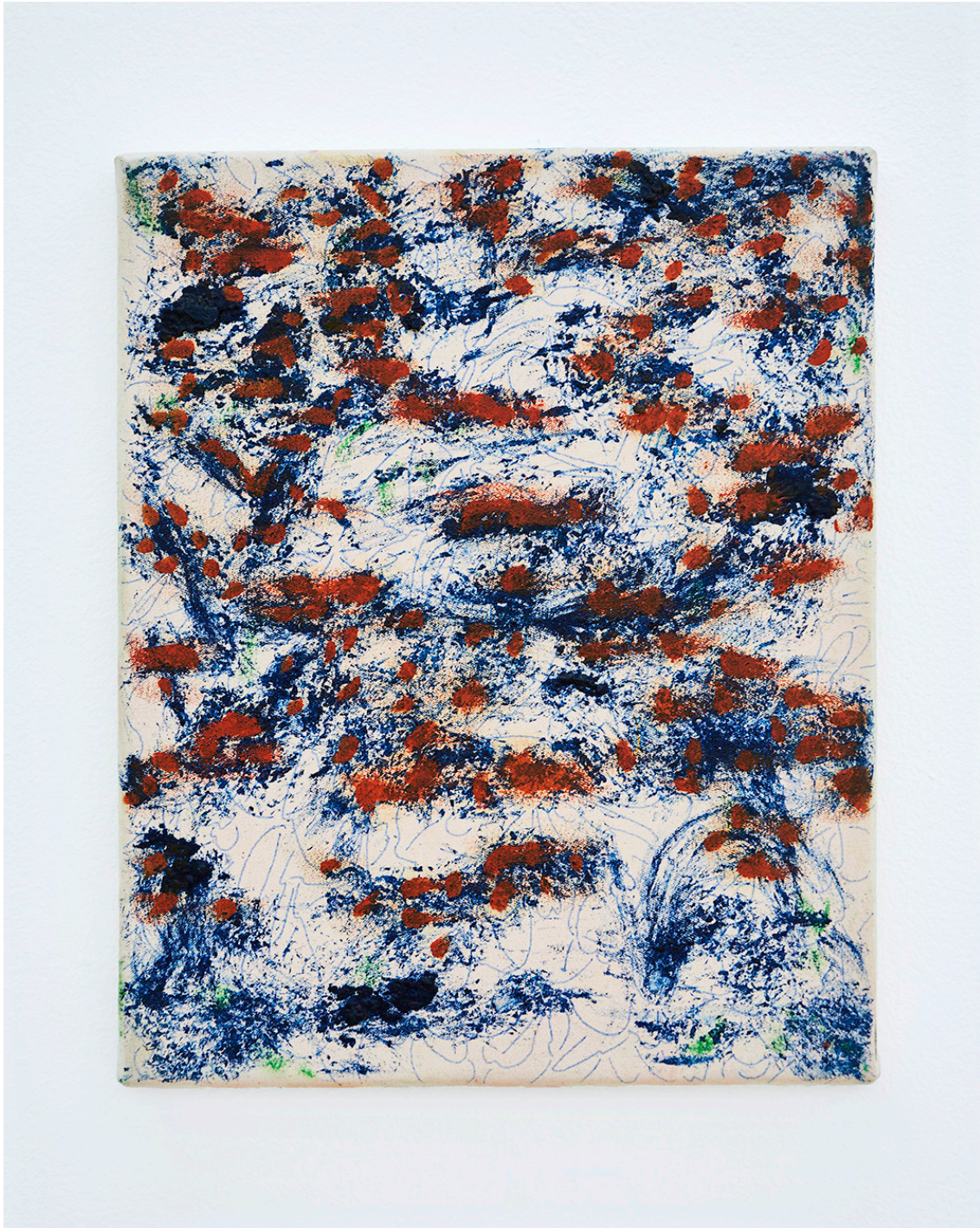
Anna Schachinger, Untitled , 2013. Ink and oil on canvas, 22 x 27 cm (8.5 x 10.5 in.)