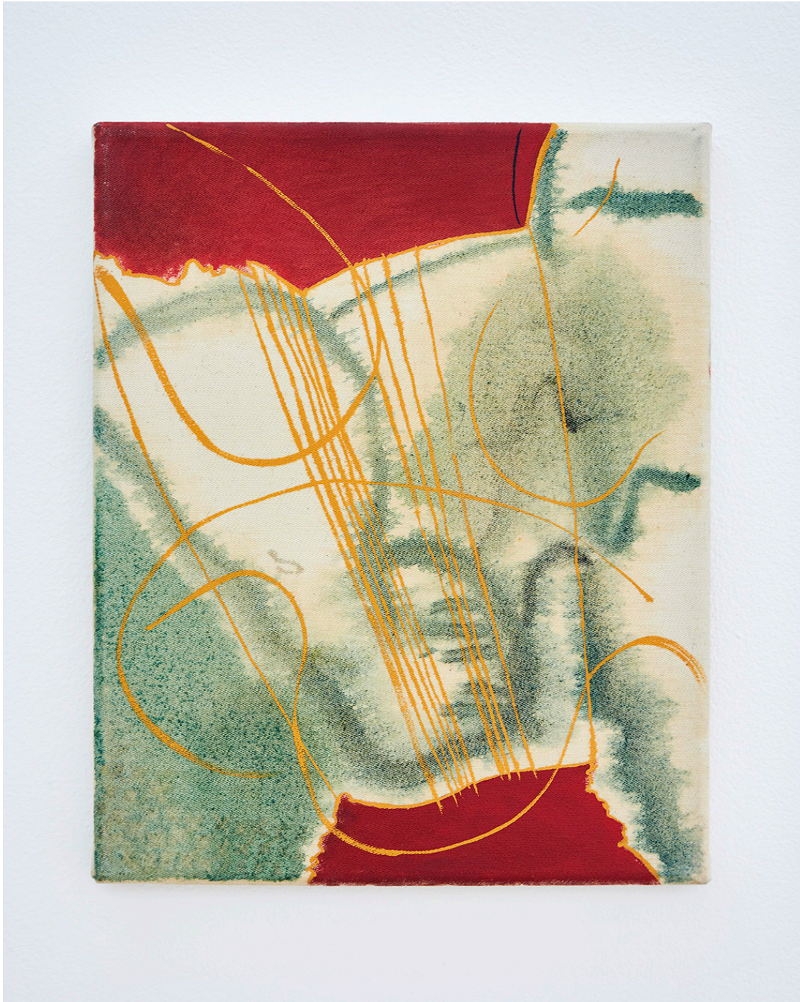
Anna Schachinger, Untitled , 2014. Oil on canvas, 22 x 27 cm (8.5 x 10.5 in.)