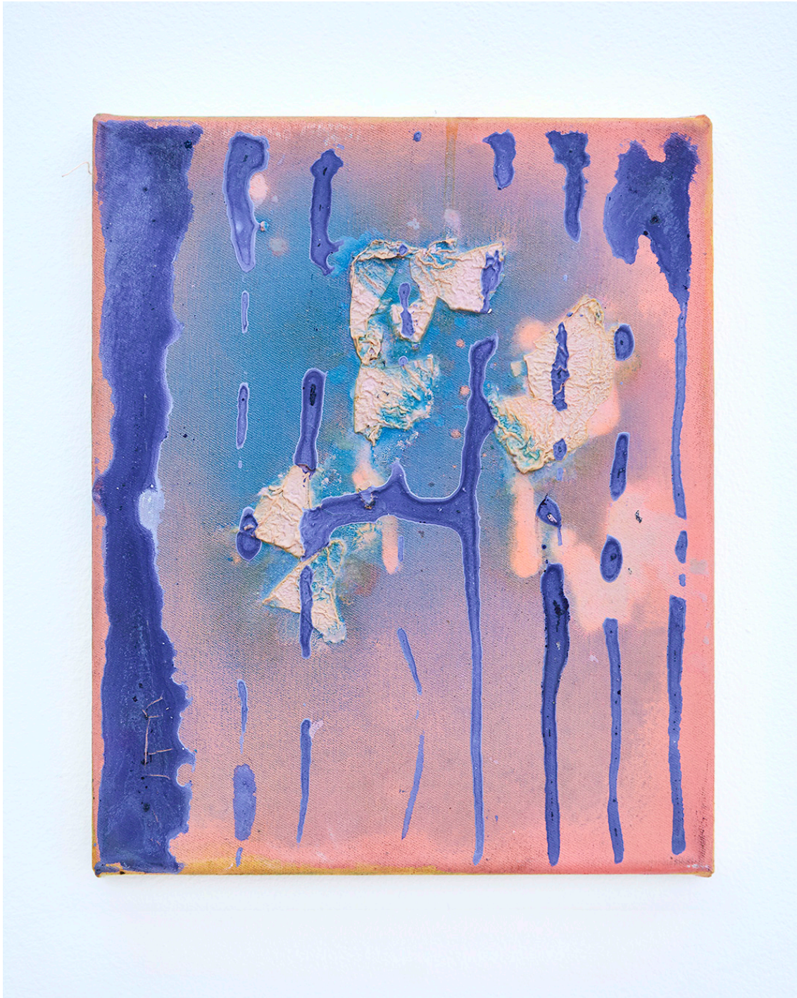
Anna Schachinger, Untitled , 2015. Oil and gesso on canvas, 22 x 27 cm (8.5 x 10.5 in.)