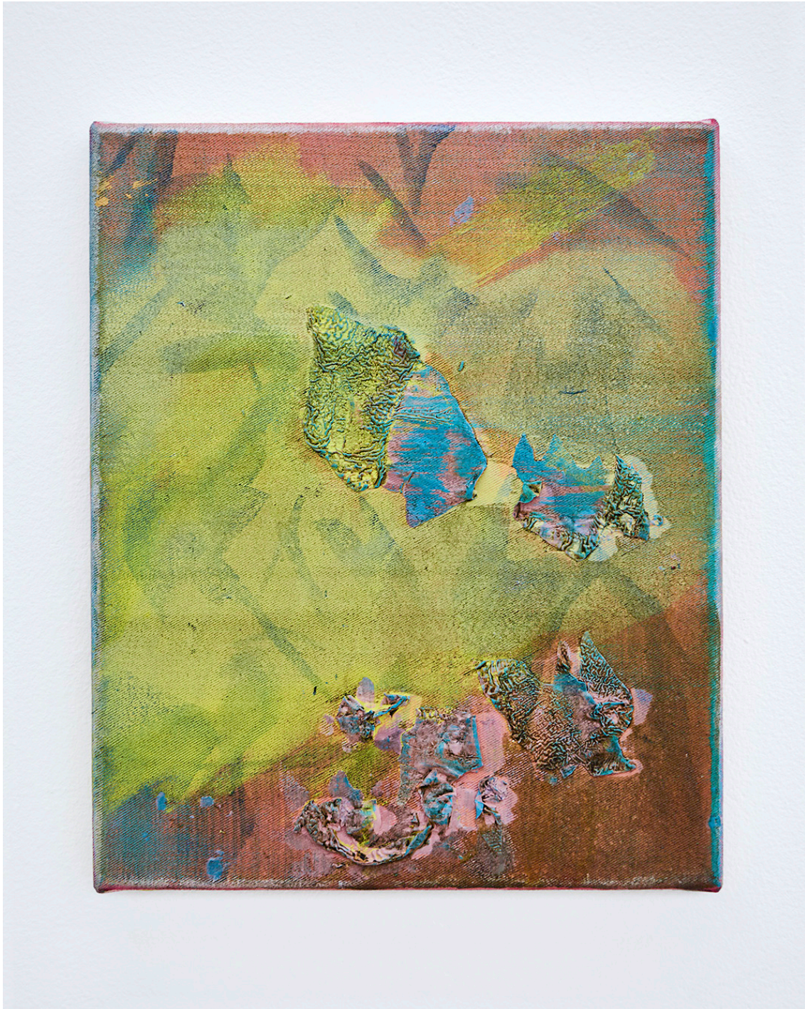
Anna Schachinger, Untitled , 2015. Oil on canvas, 22 x 27 cm (8.5 x 10.5 in.)