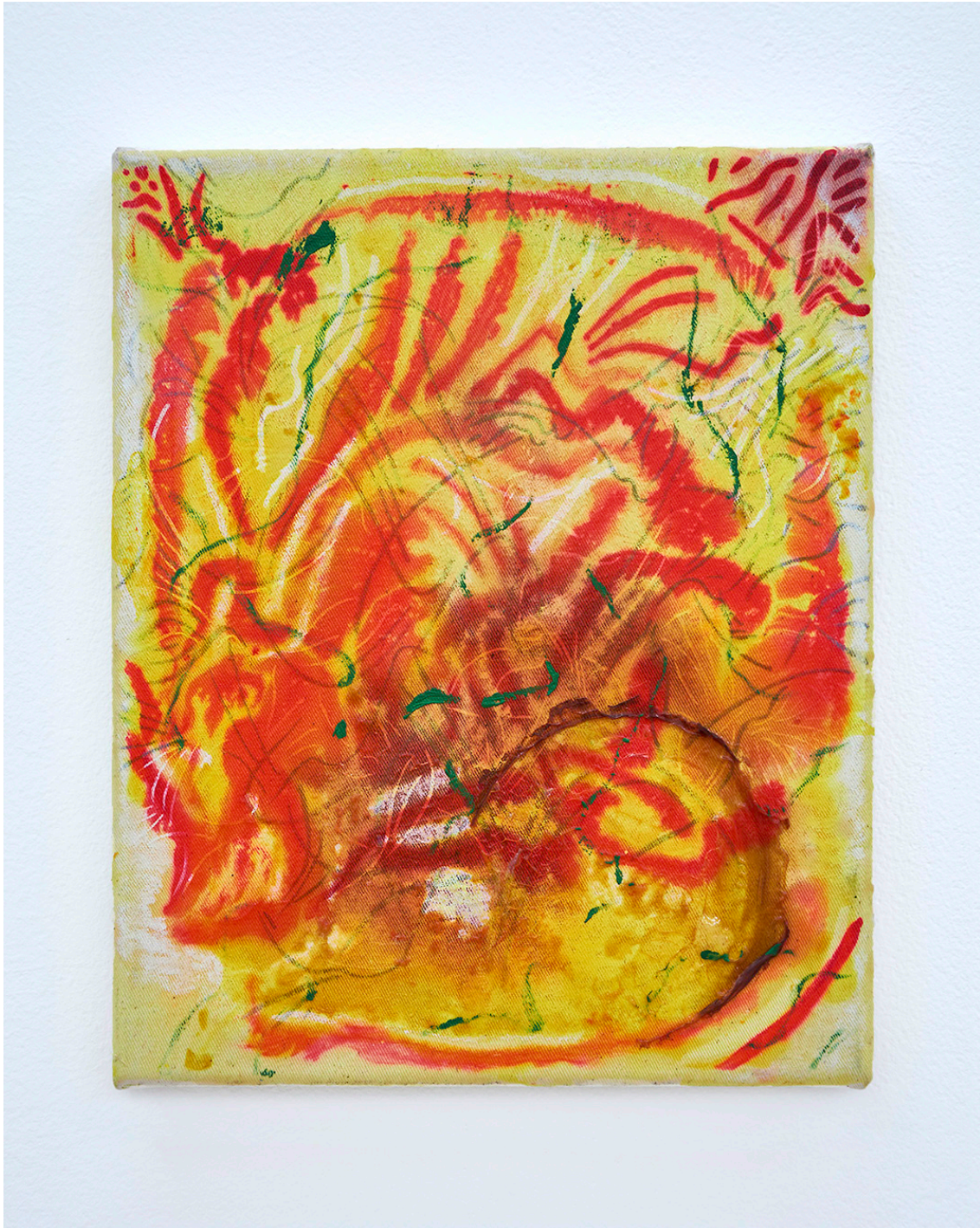
Anna Schachinger, Untitled , 2016. Ink and oil on canvas, 22 x 27 cm (8.5 x 10.5 in.)