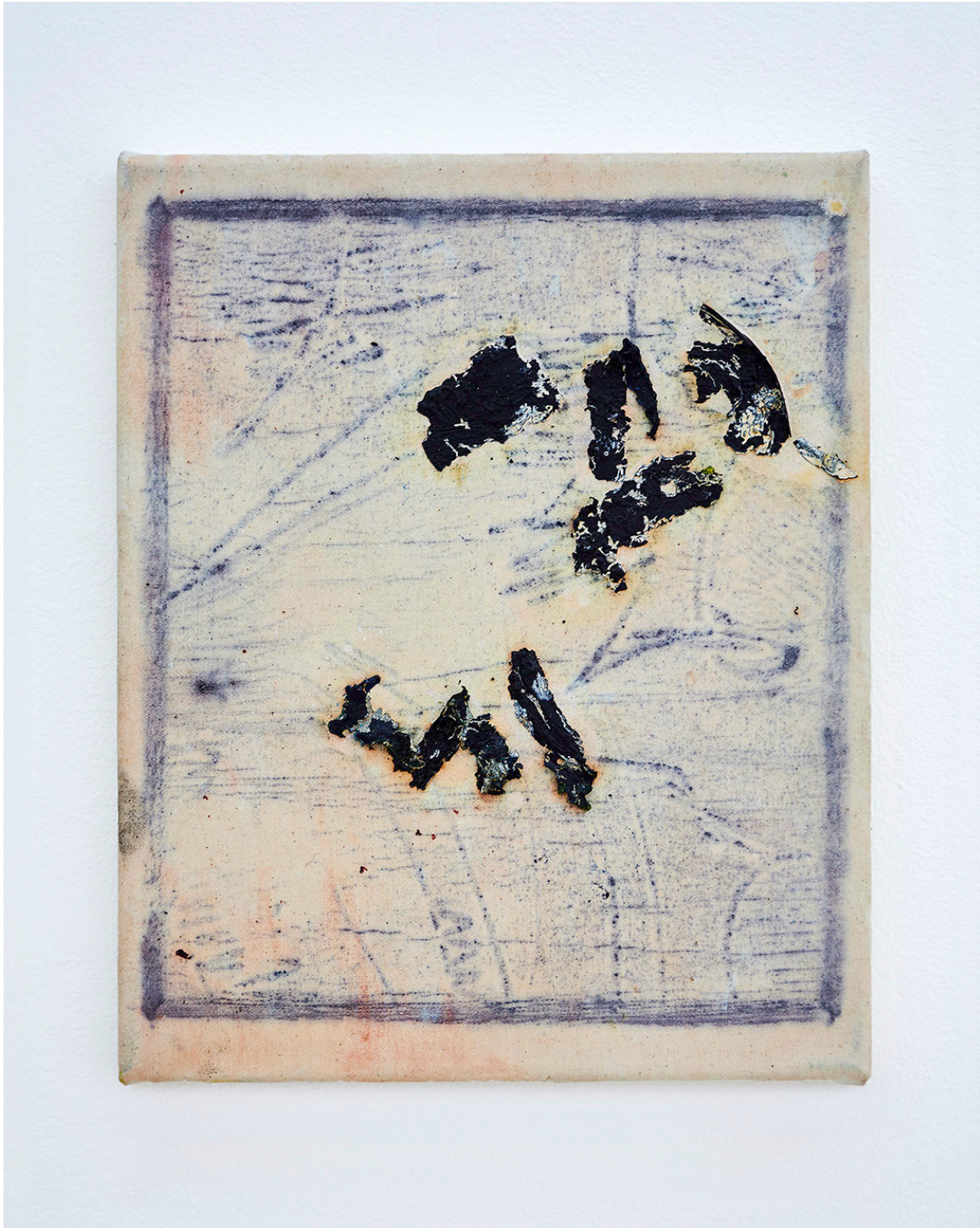
Anna Schachinger, Untitled , 2015.

Oil and acrylic medium on canvas, 22 x 27 cm (8.5 x 10.5 in.)