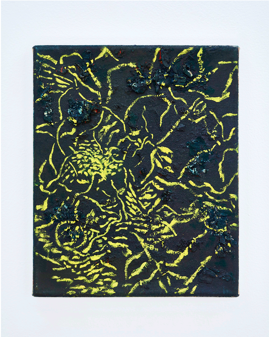
Anna Schachinger, Untitled , 2013. Oil on canvas, 22 x 27 cm (8.5 x 10.5 in.)