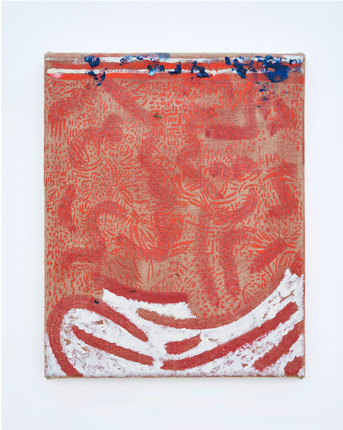
Anna Schachinger, Untitled , 2015. Oil on linen, 22 x 27 cm (8.5 x 10.5 in.)