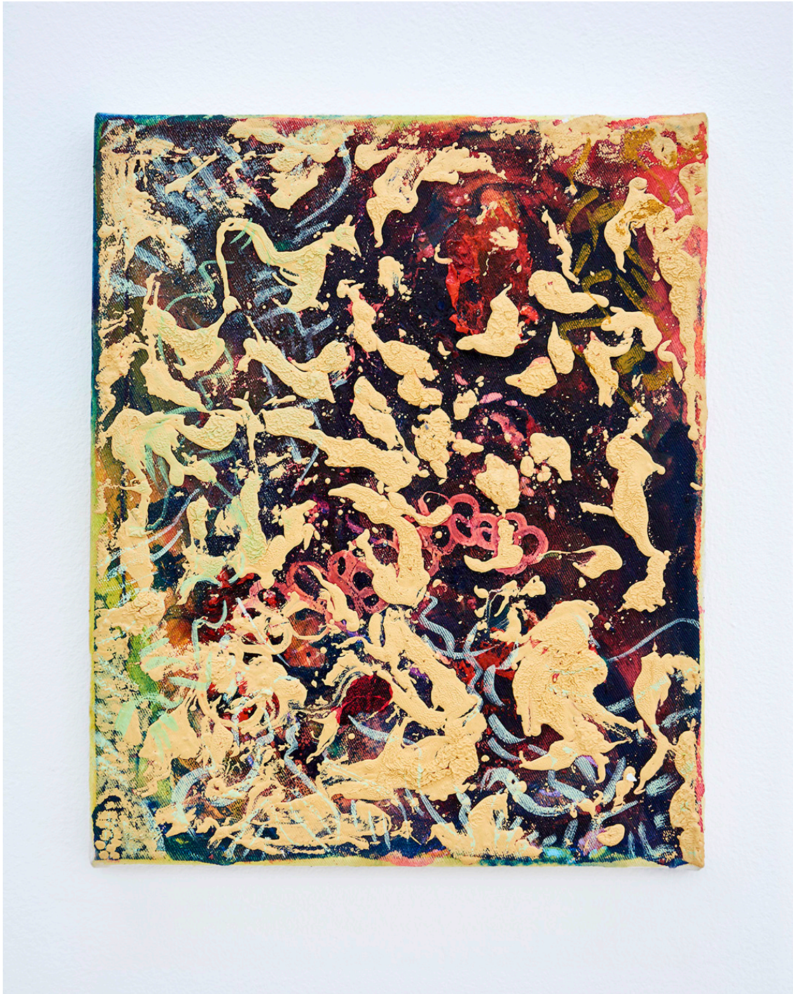
Anna Schachinger, Untitled , 2016. Ink and oil on canvas, 22 x 27 cm (8.5 x 10.5 in.)