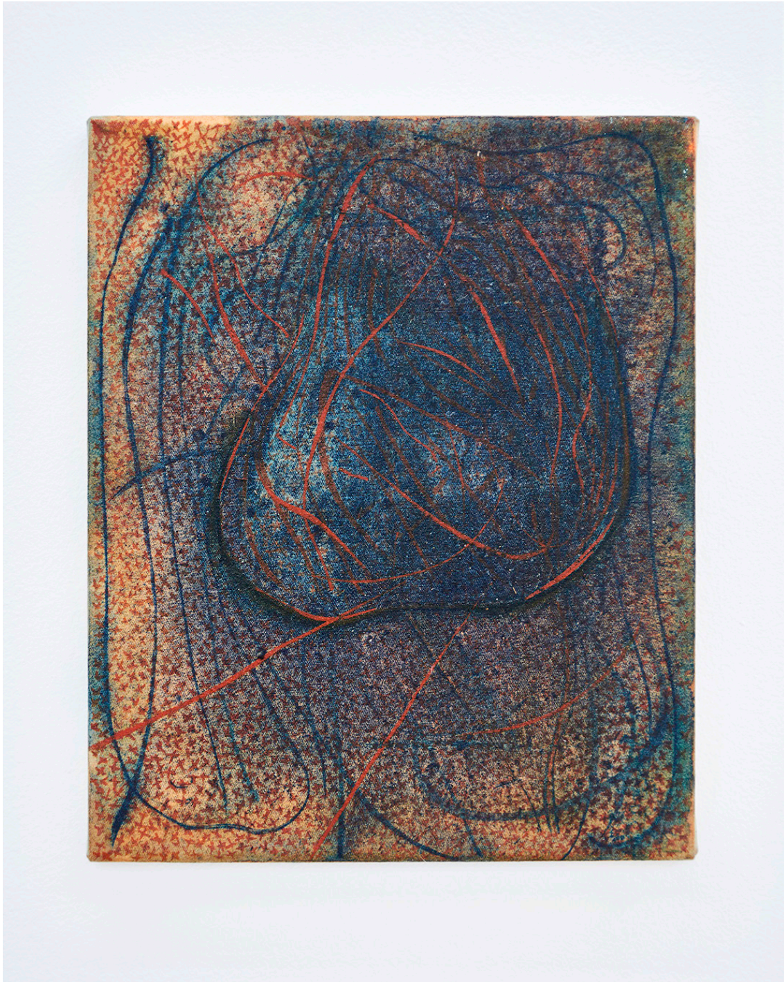
Anna Schachinger, Untitled , 2014. Oil on canvas, 22 x 27 cm (8.5 x 10.5 in.)