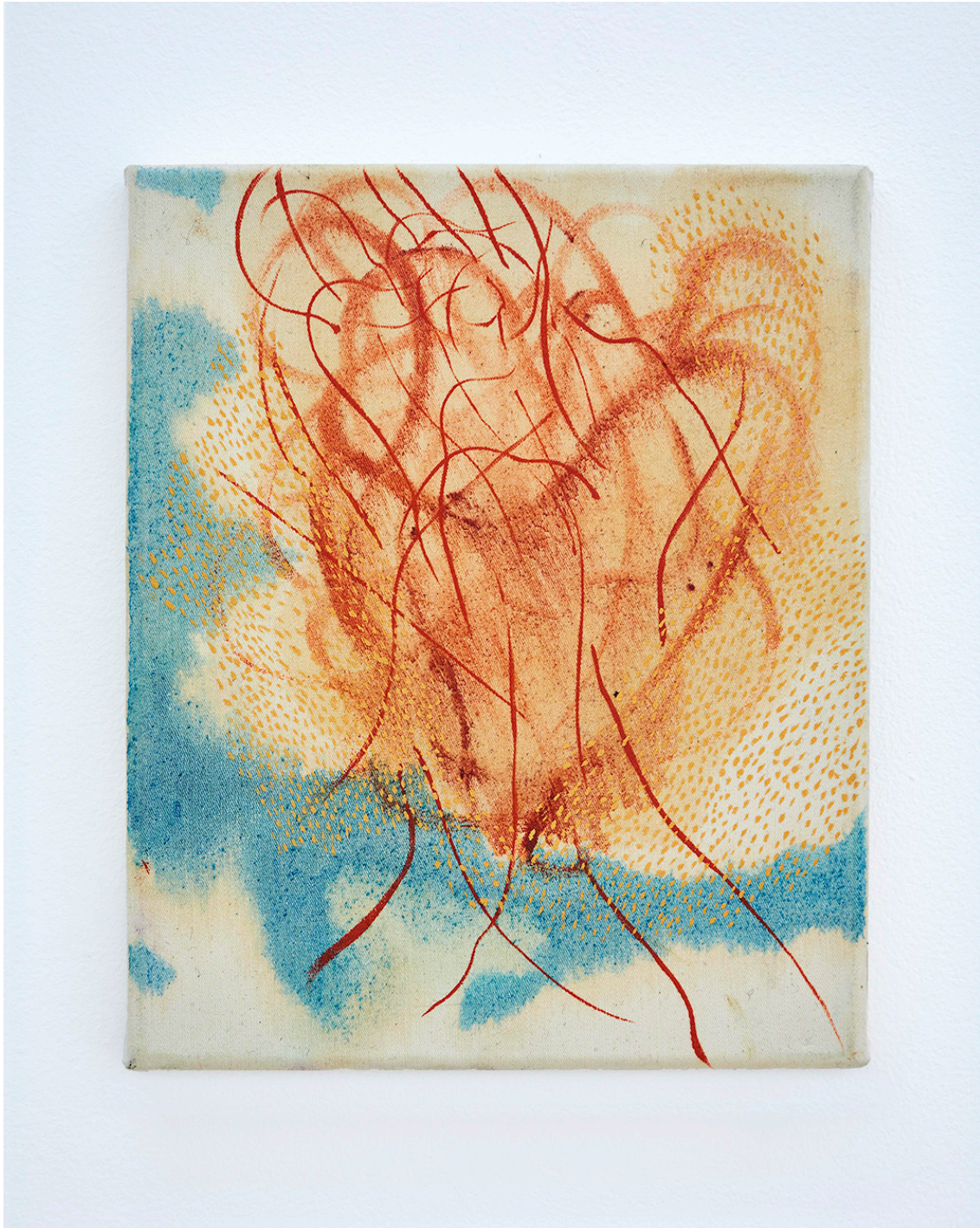
Anna Schachinger, Untitled , 2014. Oil on canvas, 22 x 27 cm (8.5 x 10.5 in.)