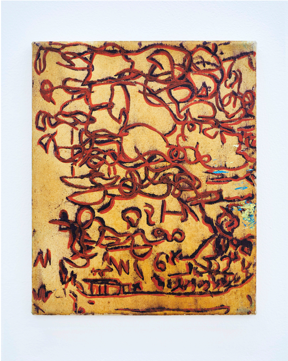
Anna Schachinger, Untitled , 2014. Oil on canvas, 22 x 27 cm (8.5 x 10.5 in.)