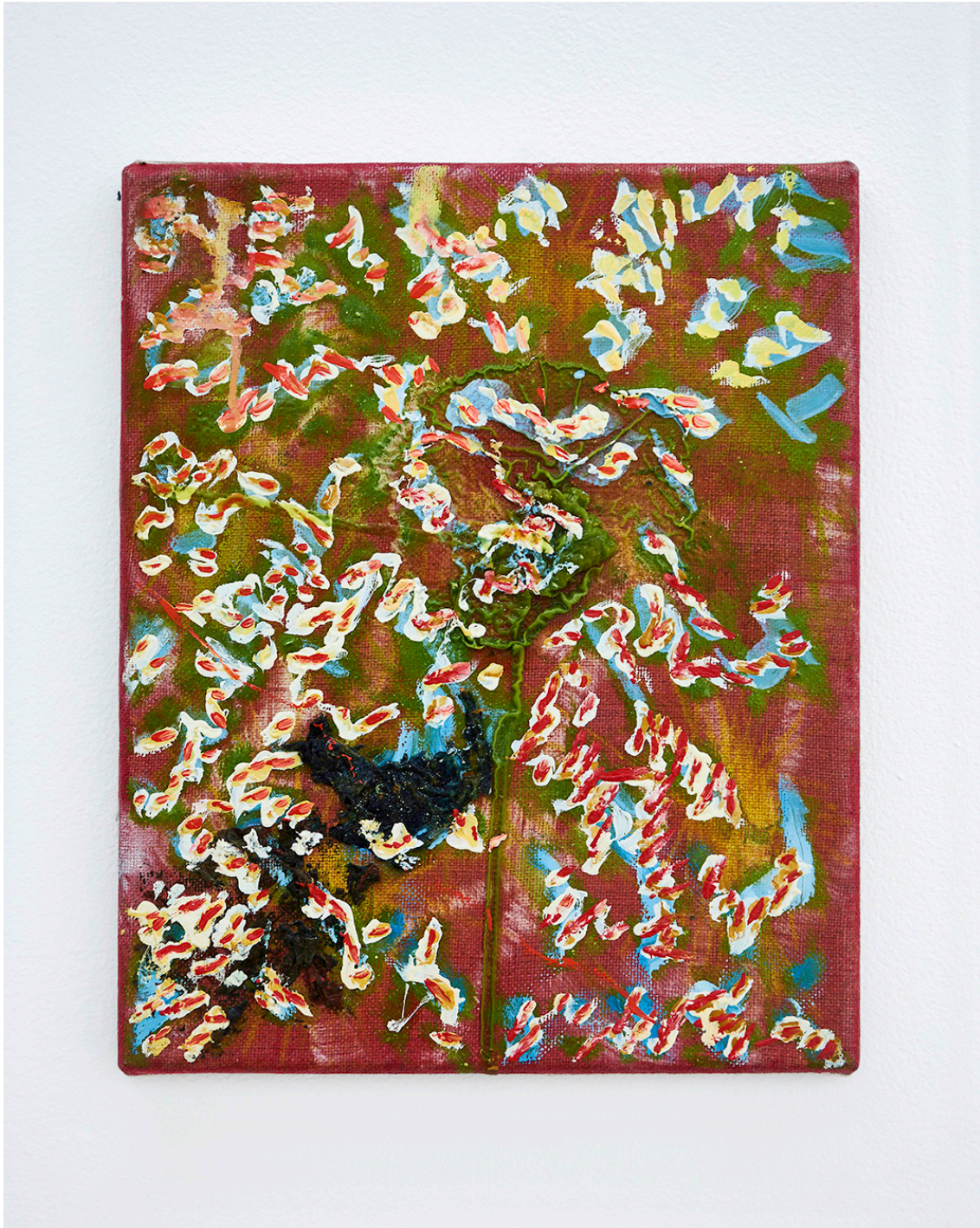
Anna Schachinger, Untitled , 2015. Oil on linen, 22 x 27 cm (8.5 x 10.5 in.)