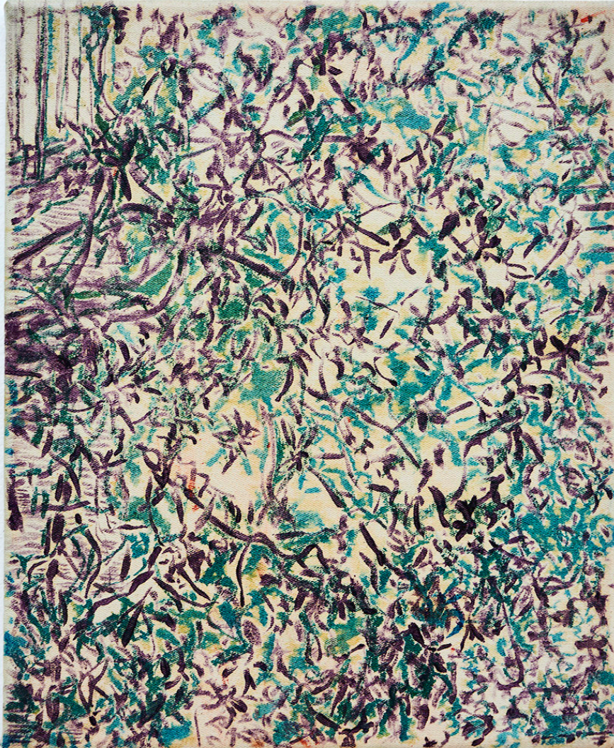
Anna Schachinger, Untitled , 2014. Oil on canvas, 22 x 27 cm (8.5 x 10.5 in.)