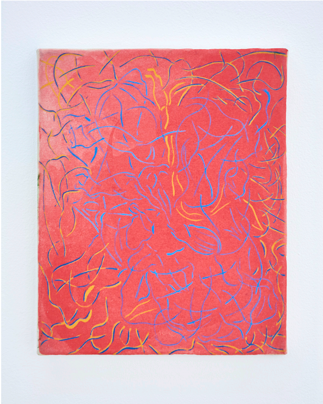
Anna Schachinger, Untitled , 2014. Oil and pigment on canvas, 22 x 27 cm (8.5 x 10.5 in.)