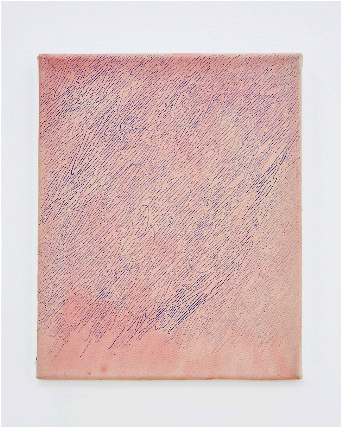
Anna Schachinger, Untitled , 2014. Ink and rabbit skin glue on canvas, 22 x 27 cm (8.5 x 10.5 in.)