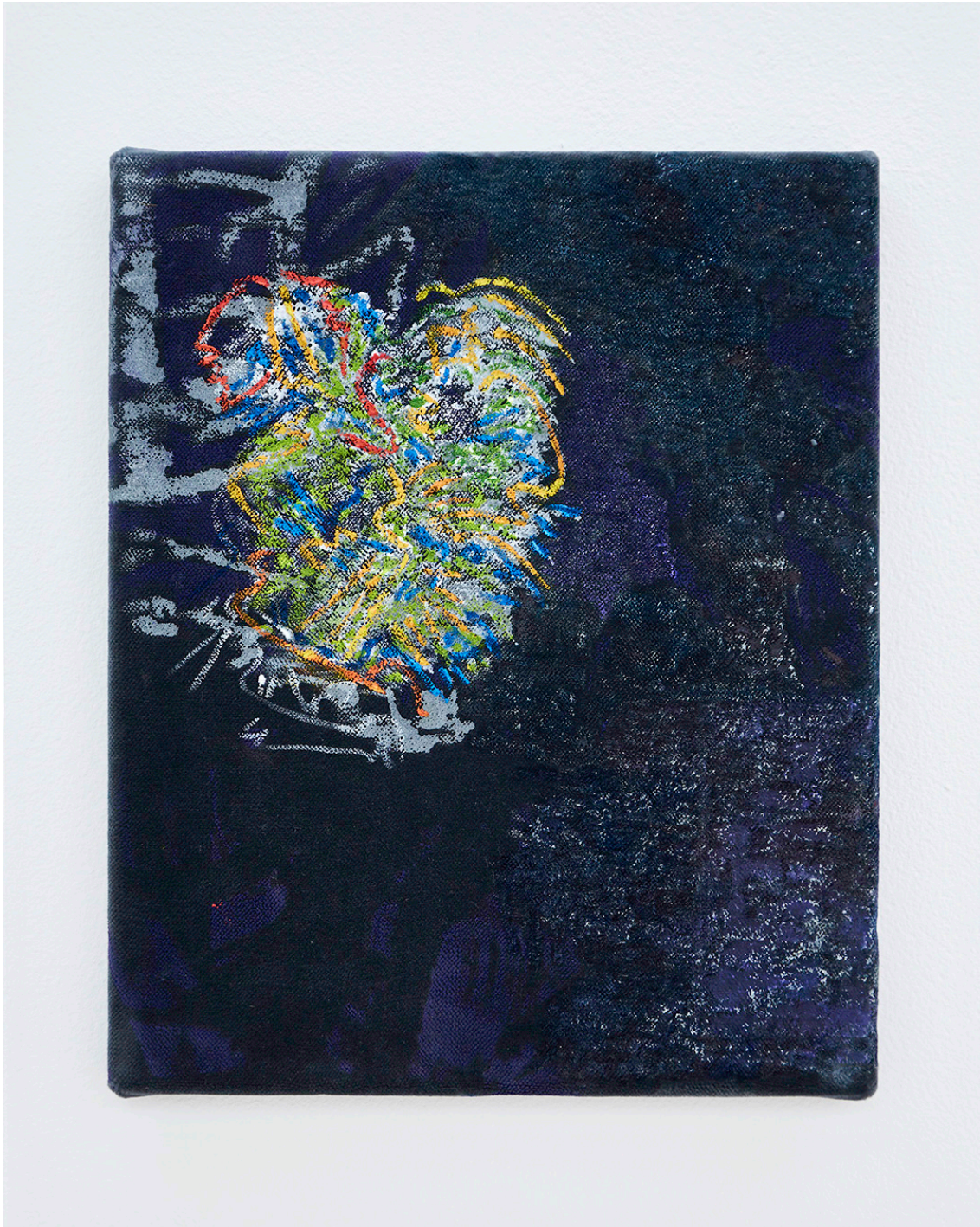
Anna Schachinger, Untitled , 2017. Acrylic medium, oil and acrylic paint on velvet, 22 x 27 cm (8.5 x 10.5 in.)