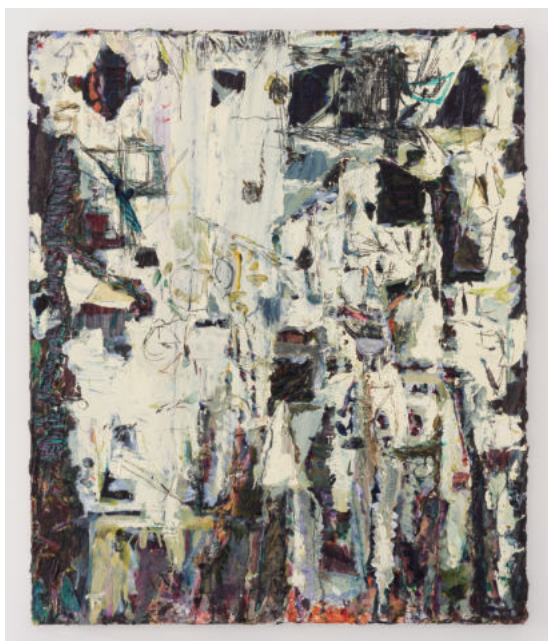
lower right : quiz 2014, oil on canvas, 72.7 x 60.6 cm