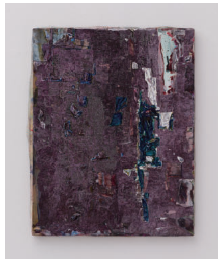
upper left : aureolin 2018, oil on canvas, 227.3 x 181.8 cm