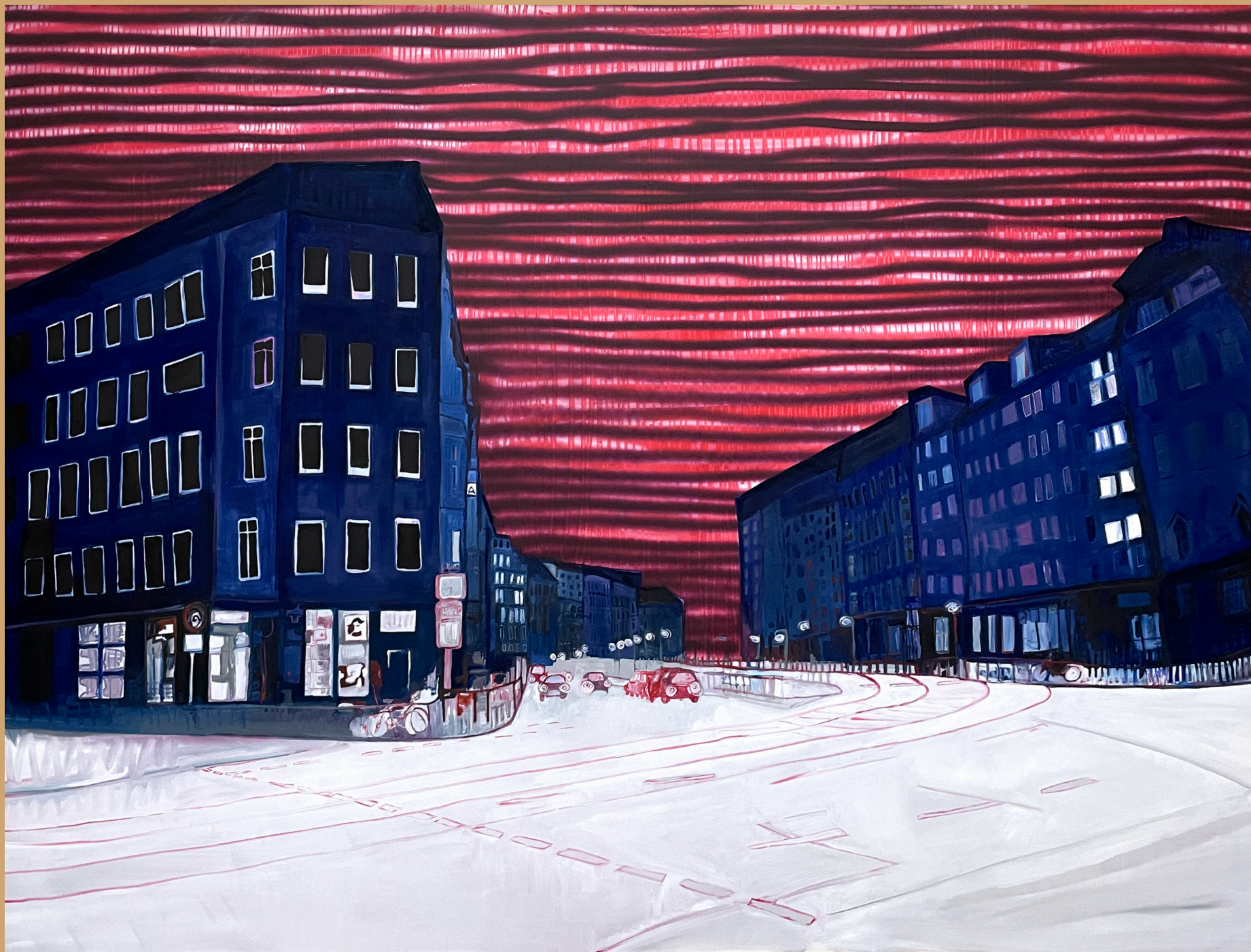
Sofia Berakha, Espiral , 2021. Oil and spray paint on canvas. 185 x 240 cm (72.83 x 98.42 in). Inquire