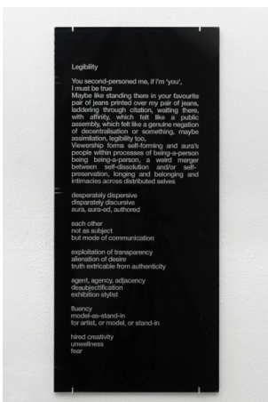
Alex Clarke Legibility , 2022 Reverse glass painting, gouache and enamel on tempered glass 80 x 35 cm 31 1/2 x 14 in (SDAC76)