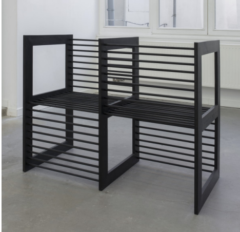
Alex Clarke Kissing Bench (Black) , 2022 Pine, beech, ink and wax 85 x 51 x 100 cm 33 1/2 x 20 x 39 1/2 in (SDAC73)