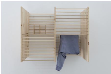
Alex Clarke Kissing Bench (Pine) , 2021 Pine, beech, mushroom, clothing, "Kissing Bench Model", douglas fir, beech 85 x 100 x 51 cm 33 1/2 x 39 1/2 x 20 in (SDAC74)