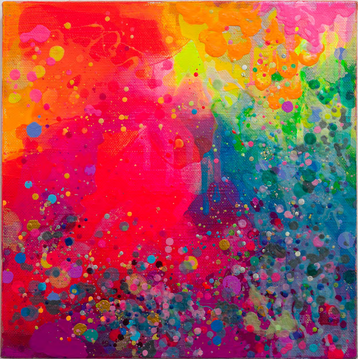
Rosalie Knox Sagitta II , 2020 Acrylic, Polyurethane, Enamel and Dye on Belgian Linen 18h x 18w in 45.72h x 45.72w cm RK_010