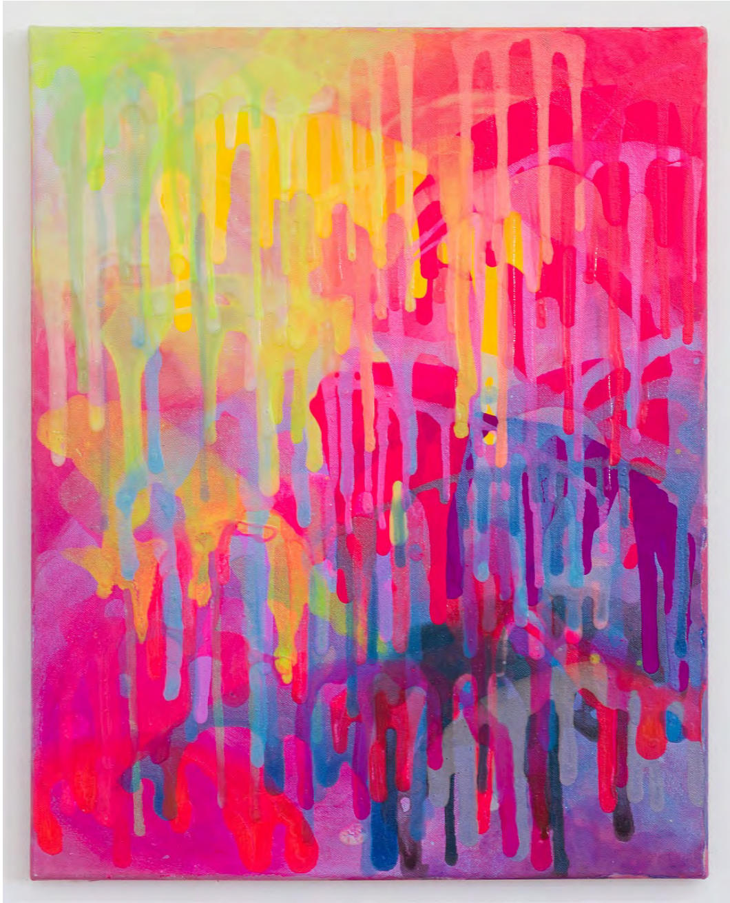
Rosalie Knox Party Girl , 2021 Acrylic, Polyurethane, Enamel and Dye on Belgian Linen 20h x 16w in 50.80h x 40.64w cm RK_008