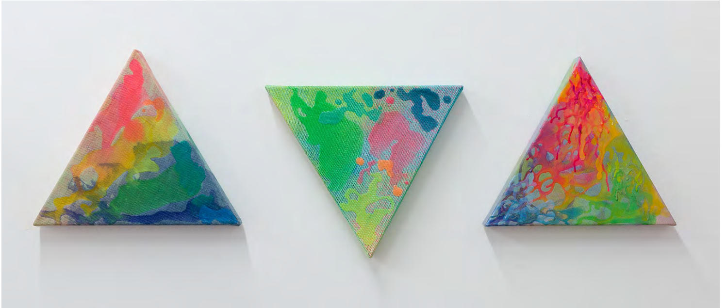
Rosalie Knox Prismid Triumvirate , 2020 Acrylic, Polyurethane, Enamel and Dye on Belgian Linen RK_014