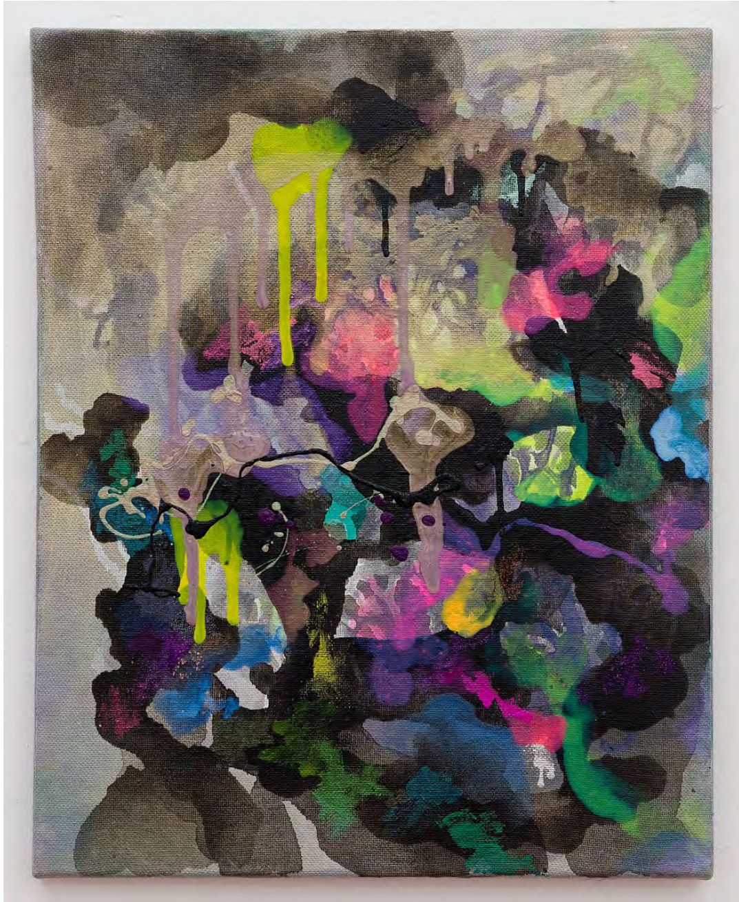
Rosalie Knox Precious Platinum , 2022 Acrylic, Polyurethane, Enamel and Dye on Belgian Linen 20h x 16w in 50.80h x 40.64w cm RK_005