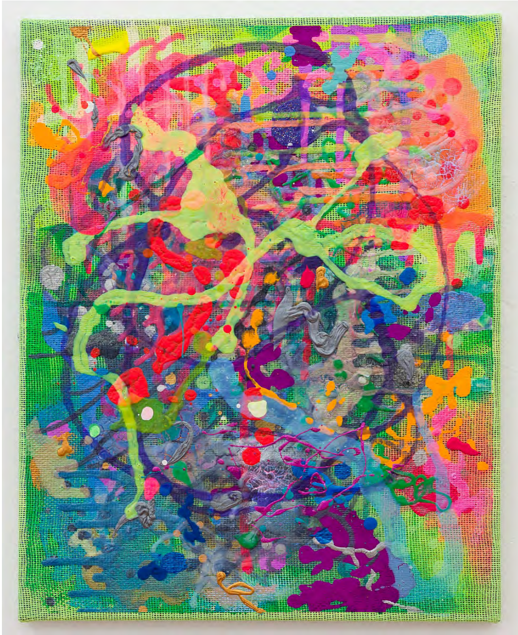
Rosalie Knox Pure Perfume , 2021 Acrylic, Polyurethane, Enamel and Dye on Belgian Linen 20h x 16w in 50.80h x 40.64w cm RK_004