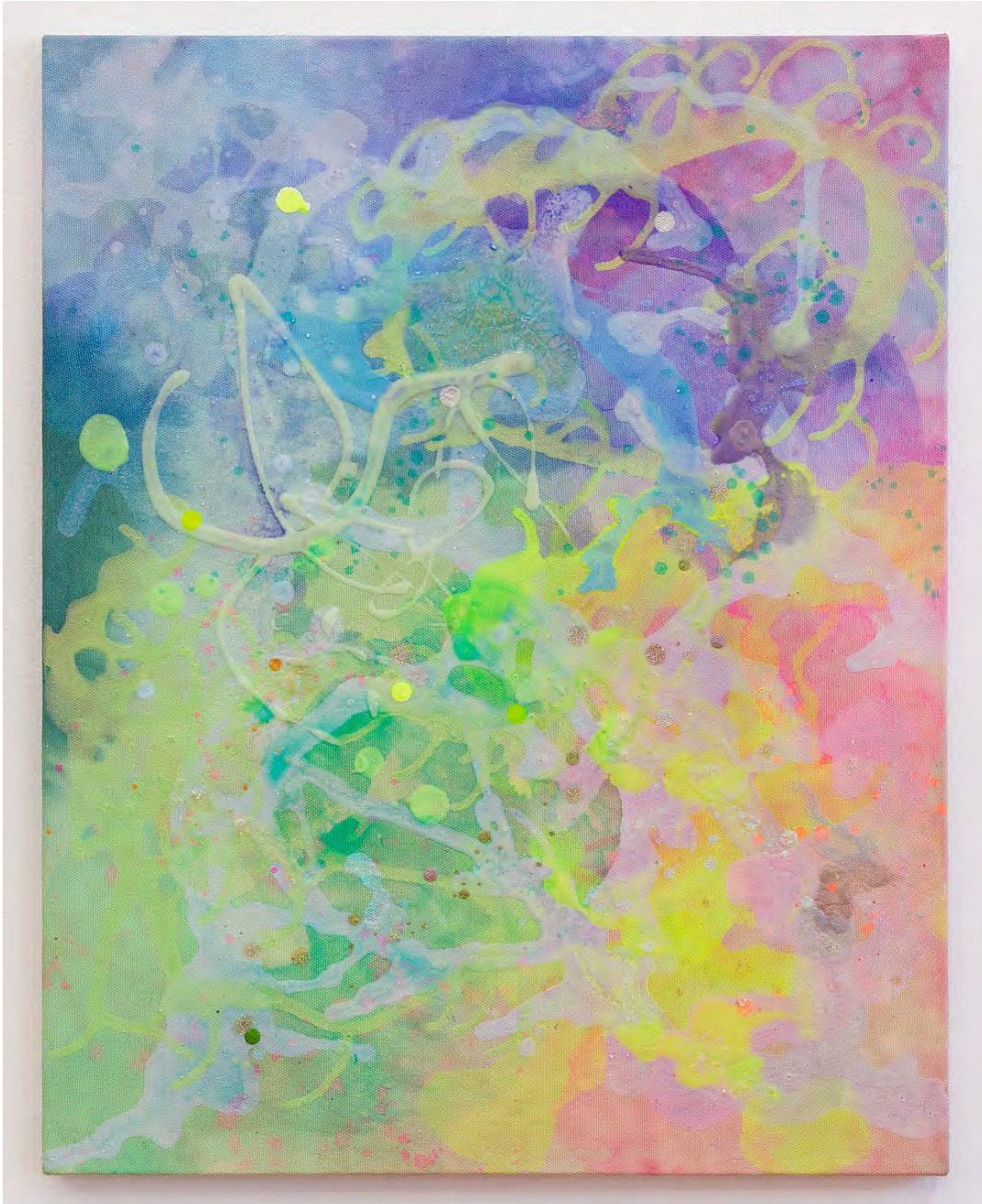
Rosalie Knox Princess Crown , 2022 Acrylic, Polyurethane, Enamel and Dye on Belgian Linen 20h x 16w in 50.80h x 40.64w cm RK_007