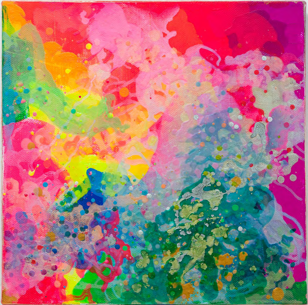
Rosalie Knox Sagitta I , 2020 Acrylic, Polyurethane, Enamel and Dye on Belgian Linen 18h x 18w in 45.72h x 45.72w cm RK_009