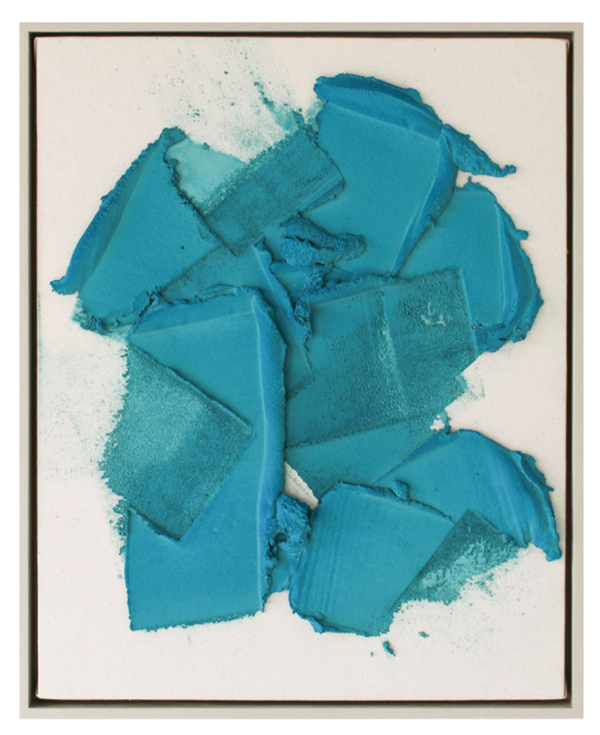
River Pull 2021 17 x 21 in Concrete, dye, canvas on panel with UV protective coat PH0009