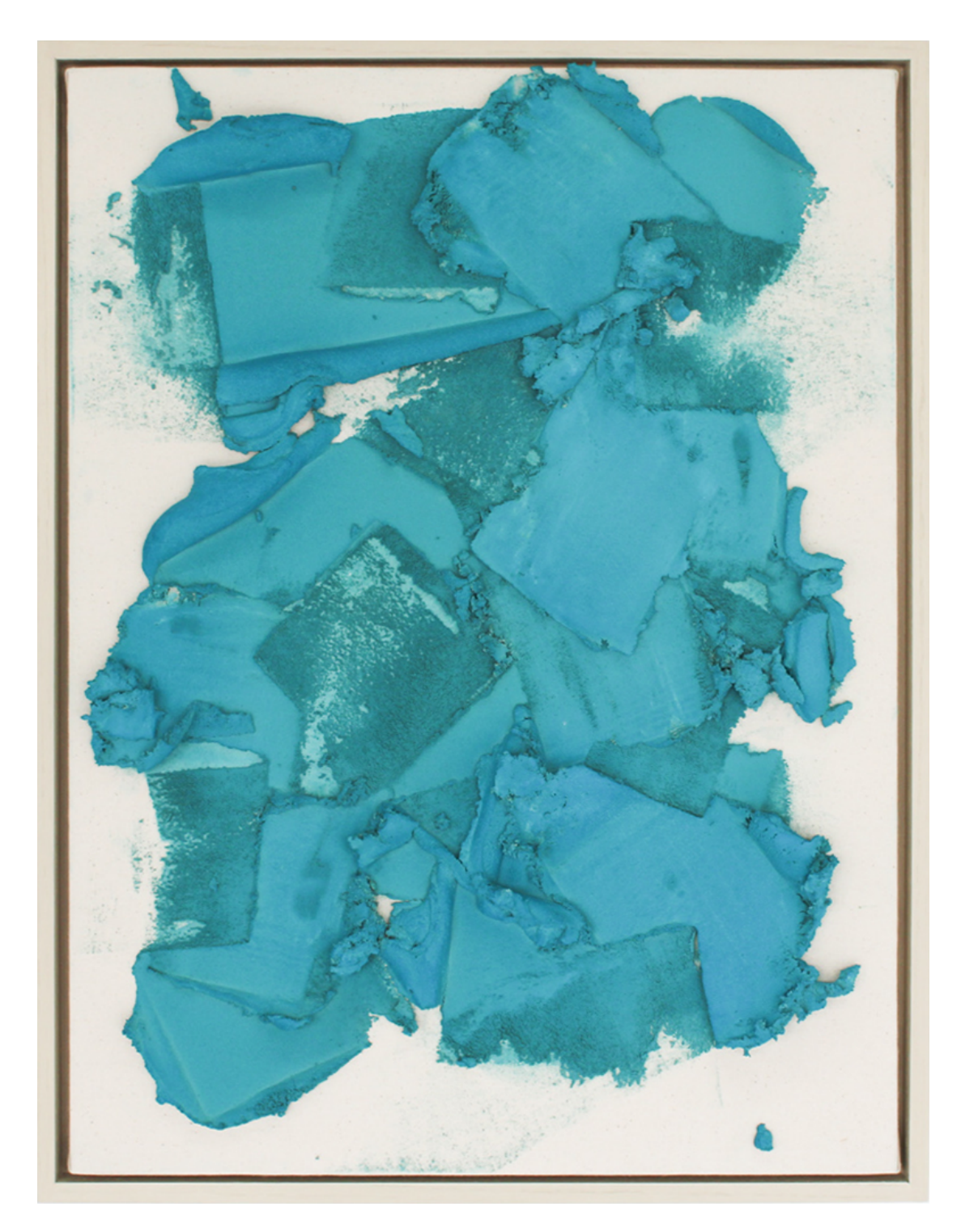
River Pull 2021 17 x 21 in Concrete, dye, canvas on panel with UV protective coat PH0005