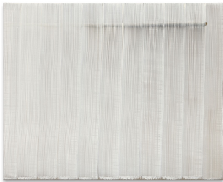
Hyun-Sook Song 12 Brushstrokes, 2021 Tempera on canvas 160 × 200 cm 63 × 78 3/4 inches © Hyun-Sook Song Courtesy the artist and Sprüth Magers