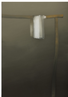
Hyun-Sook Song 8 Brushstrokes, 2021 Tempera on canvas 170 × 120 cm 67 × 47 1/4 inches © Hyun-Sook Song Courtesy the artist and Sprüth Magers