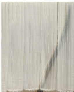
Hyun-Sook Song 5 Brushstrokes over Tiger, 2009 Tempera on canvas 100 × 80 cm 39 3/8 × 31 1/2 inches © Hyun-Sook Song Courtesy the artist and Sprüth Magers