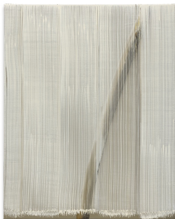
Hyun-Sook Song 5 Brushstrokes over 1 Brushstroke, 2009 Tempera on canvas 100 × 80 cm 39 3/8 × 31 1/2 inches © Hyun-Sook Song Courtesy the artist and Sprüth Magers