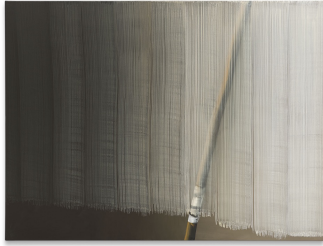
Hyun-Sook Song Brushstrokes Diagram, 2021 Tempera on canvas 150 × 200 cm 59 × 78 3/4 inches © Hyun-Sook Song Courtesy the artist and Sprüth Magers