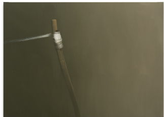
Hyun-Sook Song 7 Brushstrokes, 2020 Tempera on canvas 130 × 180 cm 51 1/8 × 70 7/8 inches © Hyun-Sook Song Courtesy the artist and Sprüth Magers