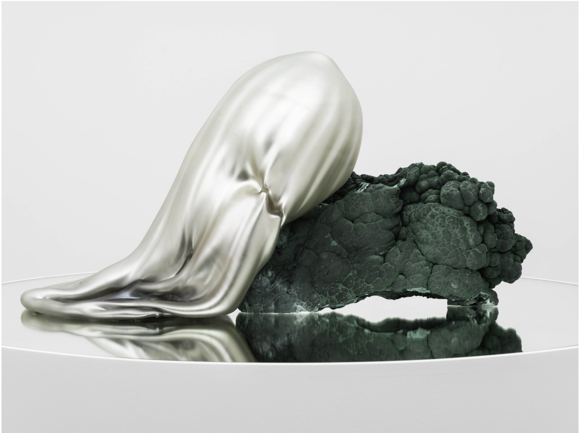
Rachel Rose, Loop (4,000 BC), 2022.

Rachel Rose | Enclosure Pilar Corrias Eastcastle Street & Pilar Corrias Savile Row 8 March – 16 April 2022