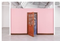
Door to Cockaigne , 2022 acrylic, timber, mdf, found door 244 x 408 cm 96 1/8 x 160 5/8 ins (MA-CECCJ-00011)