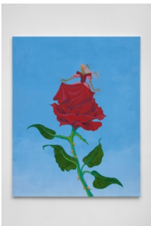
Blooming Cadaver , 2022 acrylic on canvas 150 x 120 cm 59 1/8 x 47 1/4 ins (MA-CECCJ-00009)