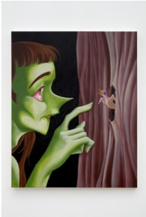
Wrinkly Little Bird , 2022 acrylic on canvas 150 x 120 cm 59 1/8 x 47 1/4 ins (MA-CECCJ-00005)