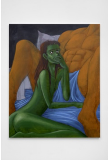
Night Friends , 2022 acrylic on canvas 150 x 120 cm 59 1/8 x 47 1/4 ins (MA-CECCJ-00010)