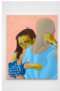
Pig Carrying a Fork on its Back , 2022 acrylic on canvas 150 x 120 cm 59 1/8 x 47 1/4 ins (MA-CECCJ-00008)