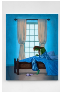
Pyjama Day , 2022 acrylic on canvas 150 x 120 cm 59 1/8 x 47 1/4 ins (MA-CECCJ-00007)