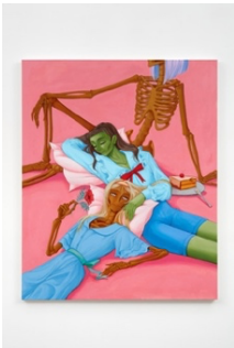
The Land of Cockaigne , 2022 acrylic on canvas 150 x 120 cm 59 1/8 x 47 1/4 ins (MA-CECCJ-00004)