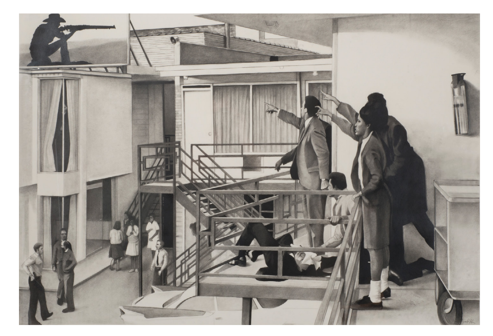
Frank Martínez, Sin título "Untitled," 2012. Charcoal on paper. Courtesy of the artist.

will divulge their secret. In an interview with Revolución y Cultura , Ayón expanded on her subject matter, "People are intrigued because the eyes look at you directly, I believe that you cannot hide—wherever you go they are there, always looking at you, making you an accomplice of what you are seeing." Báez is a natural extension of this sentiment. In her painting Zafa Fukú (April 30th, 2012) , 2015, the subject's identifiable features are obscured, except for her eyes and hair, which is pulled back into a tight bun, a comment on the repressive laws governing the appearance of women of color in