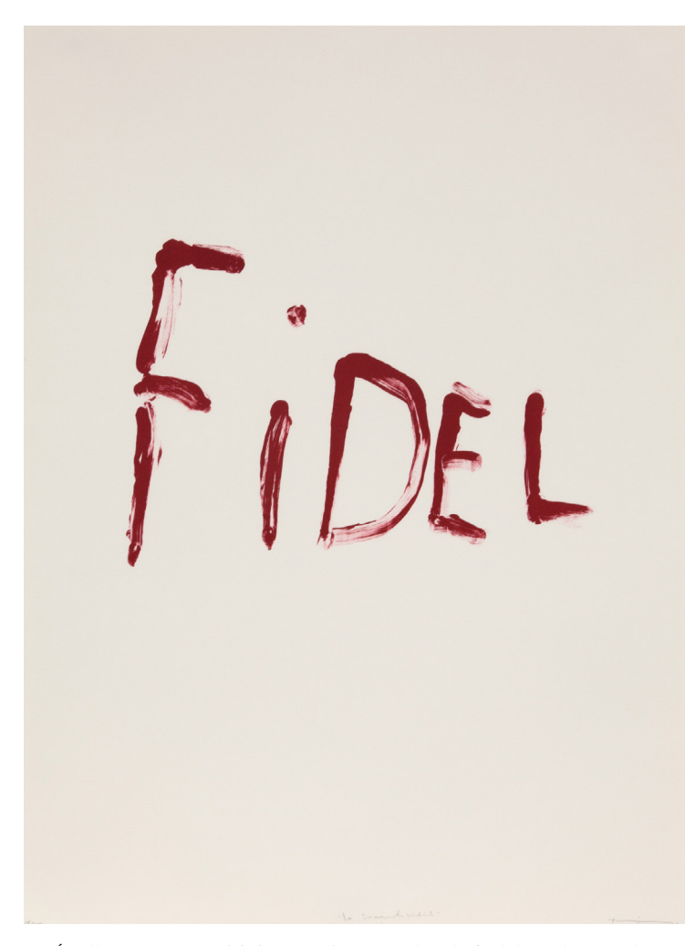
José Ángel Toirac, La Inmortalidad "Immortality, " 1998. Flatbed offset lithograph in one color on Arches cover white.

Jean-Auguste-Dominique Ingres and features a reclining woman donning one of the group's trademark Gorilla masks. The work has been updated periodically to reflect new statistics, the 2012 iteration states "Less than 4% of the artists in the Modern Art sections are women, but 76% of the nudes are female." This scandalous disparity, and the seemingly apparent level of stasis in museums and other cultural institutions is central to the conceptual drive of their oeuvre. Current movements to "decolonize" or "occupy" museums have grown out of this external reevaluation and critique of cultural institutions, instigated by artist-driven collectives such as these.