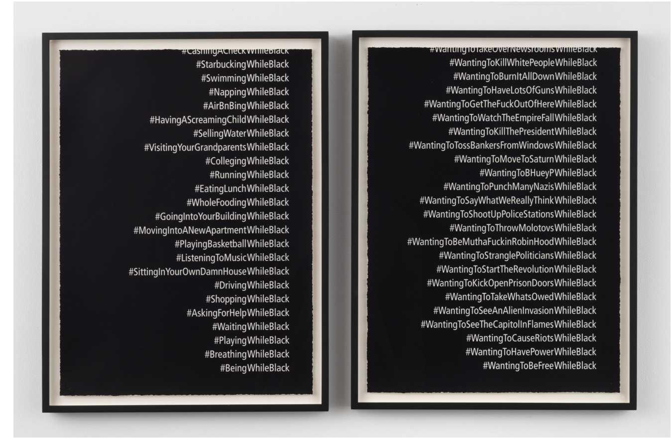
Dread Scott, #WhileBlack, 2018. Screen print. Courtesy of Dread Scott.

The artists and collectives in Articulating Activism have reshaped our understanding of the cultural and political landscape, and continue to do so. They are committed to social change, using their platform as public figures to take