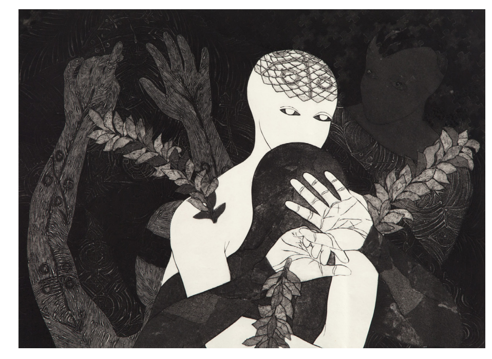
Belkis Ayón, Sin título (Figura negra que carga una blanca) "Untitled (Black Figure Carrying a White One)," 1996. Collagraph.

In Campos-Pons' Freedom Trap (2013) she wears what has the appearance of a scold's bridle, yet the "trap" is self-imposed. She gazes from a cage-like web of threads, challenging the viewer, not looking down in shame, but rather outwards.