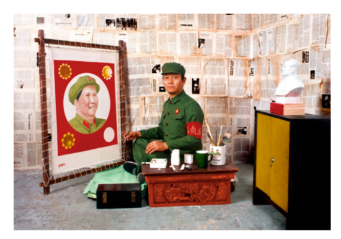
Gonkar Gyatso, My Identity 2, 2007. Chromogenic print.

line—speaking to us visually through images, messaging, or a combination of both. Through editing, aesthetics, and composition, they synthesize information and data in a way that is as easily communicable as it is consumable, and can be made for wide distribution to the masses. The autobiographical nature of many works in this exhibition affirm the intrinsic link between the maker, the politics, the personal, and the advocate. In many cases, it is difficult to separate the causes and issues from the artist's own identity. Art alone can't directly change policy or laws, but can be the catalyst for both—the defiant act of speaking out can galvanize the public, or those in power, to enact change. Both individually and collectively, the works in Articulating Activism demonstrate art's power as a tool to champion social equality and stand against oppressive societal conditions, providing a voice and illuminating struggles on a global scale.