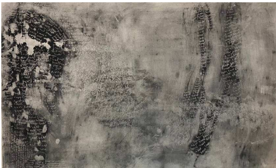
Something about the sun, 2022, charcoal and graphite on paper, 18 x 29 in.

Celestial motifs, things in motion (bicycles and horses) and sources of light (suns and candles) are recurring images in the works, although they are often abstracted beyond immediate recognition. The imagery unfurls, spirals, and mutates from piece to piece, while the shifting values of light and darkness create a sense of dissonance between the forms and the surfaces on which they are rendered. In some moments, the graphite appears to hover above the paper; in others, the material has been worked vigorously into the surface of the work, as though applied with the force of the whole body.