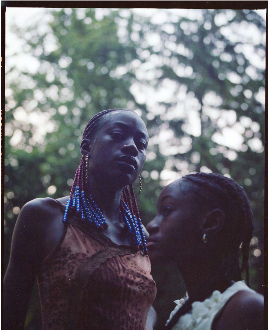
Jorian Charlton Georgia & Kukua, 2020 Baryta Fine Art Print mounted to Dibond 55 x 44 x 1.5 in (139.7 x 111.8 x 3.8 cm) Framed J.Charlton0005