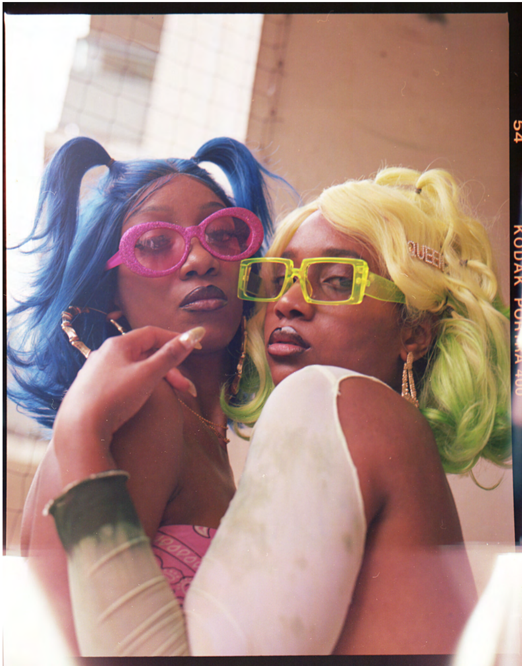
Jorian Charlton Sydné & Keverine, 2020 Baryta Fine Art Print mounted to Dibond 25 x 21 x 1.5 in (63.5 x 53.3 x 3.8 cm) Framed J.Charlton0002