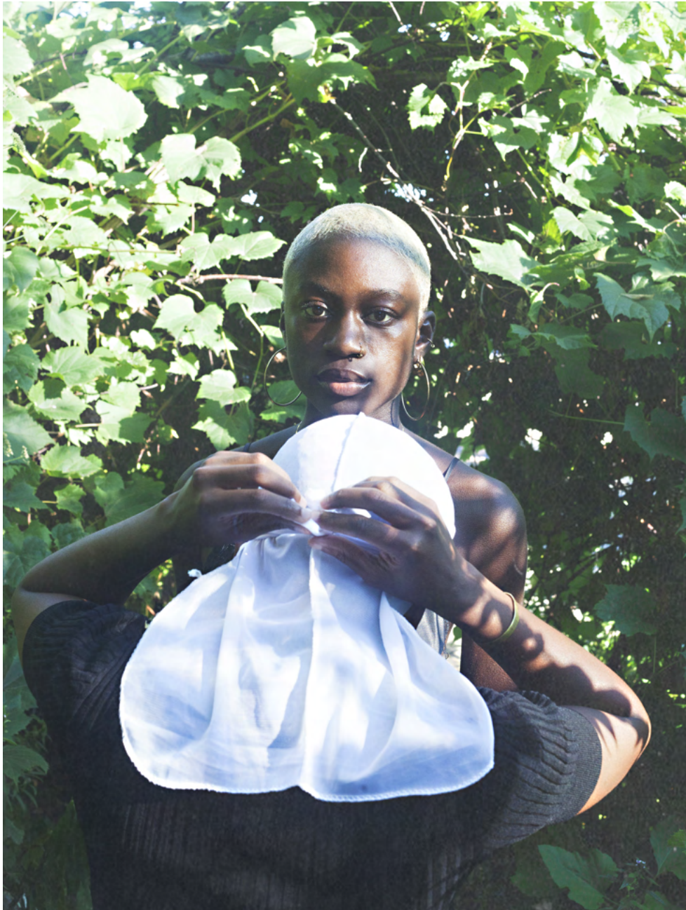
Jorian Charlton Ayo & Georgia, 2019 Baryta Fine Art Print mounted to Dibond 25 x 21 x 1.5 in (63.5 x 53.3 x 3.8 cm) Framed J.Charlton0008