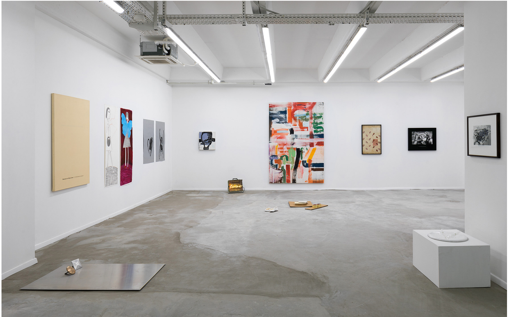
'Under the Volcano', 2022 exhibition view, Dvir Gallery Tel Aviv