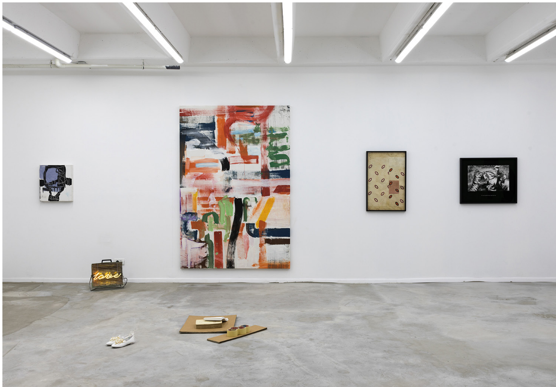
'Under the Volcano', 2022 exhibition view, Dvir Gallery Tel Aviv