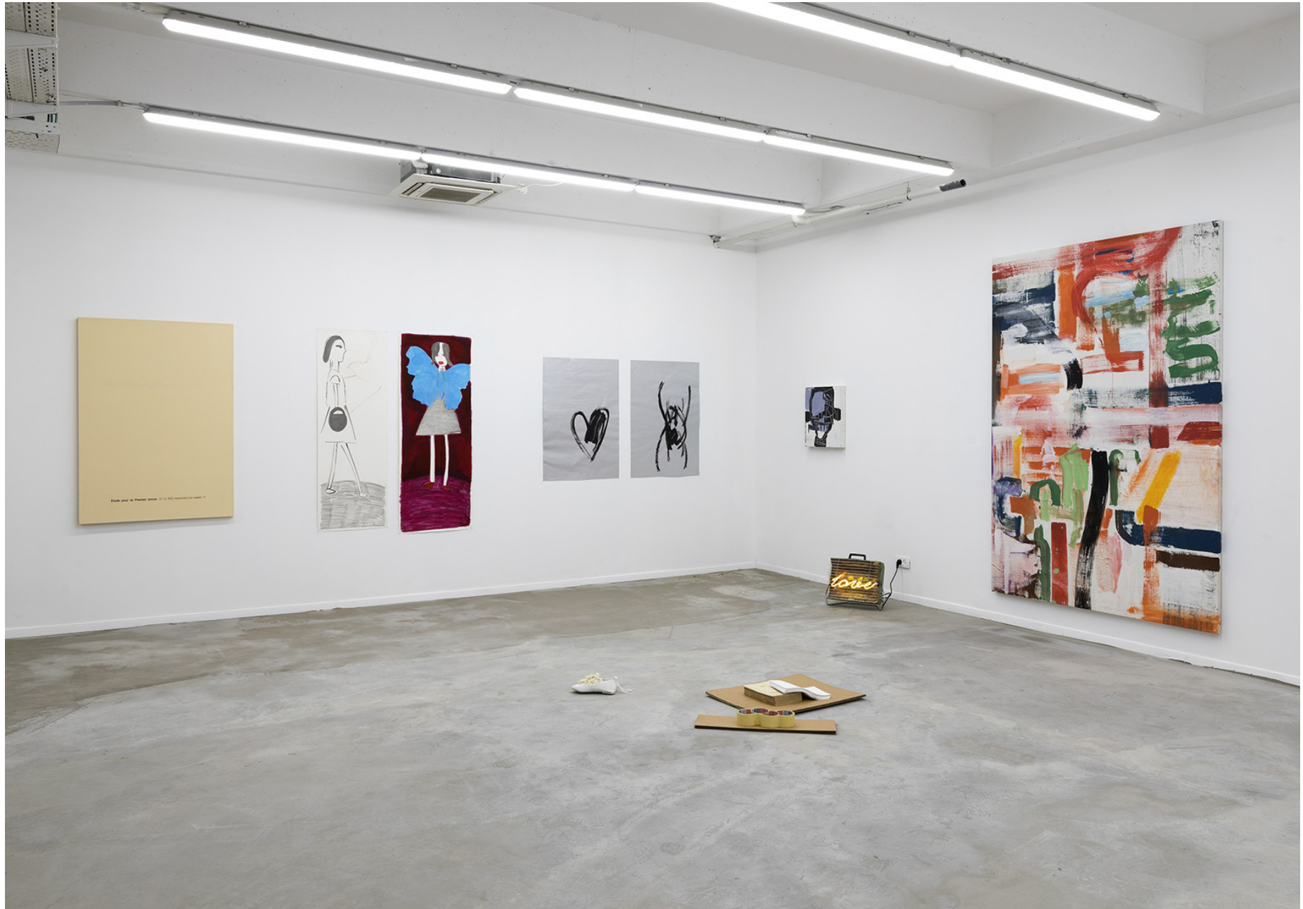
'Under the Volcano', 2022 exhibition view, Dvir Gallery Tel Aviv