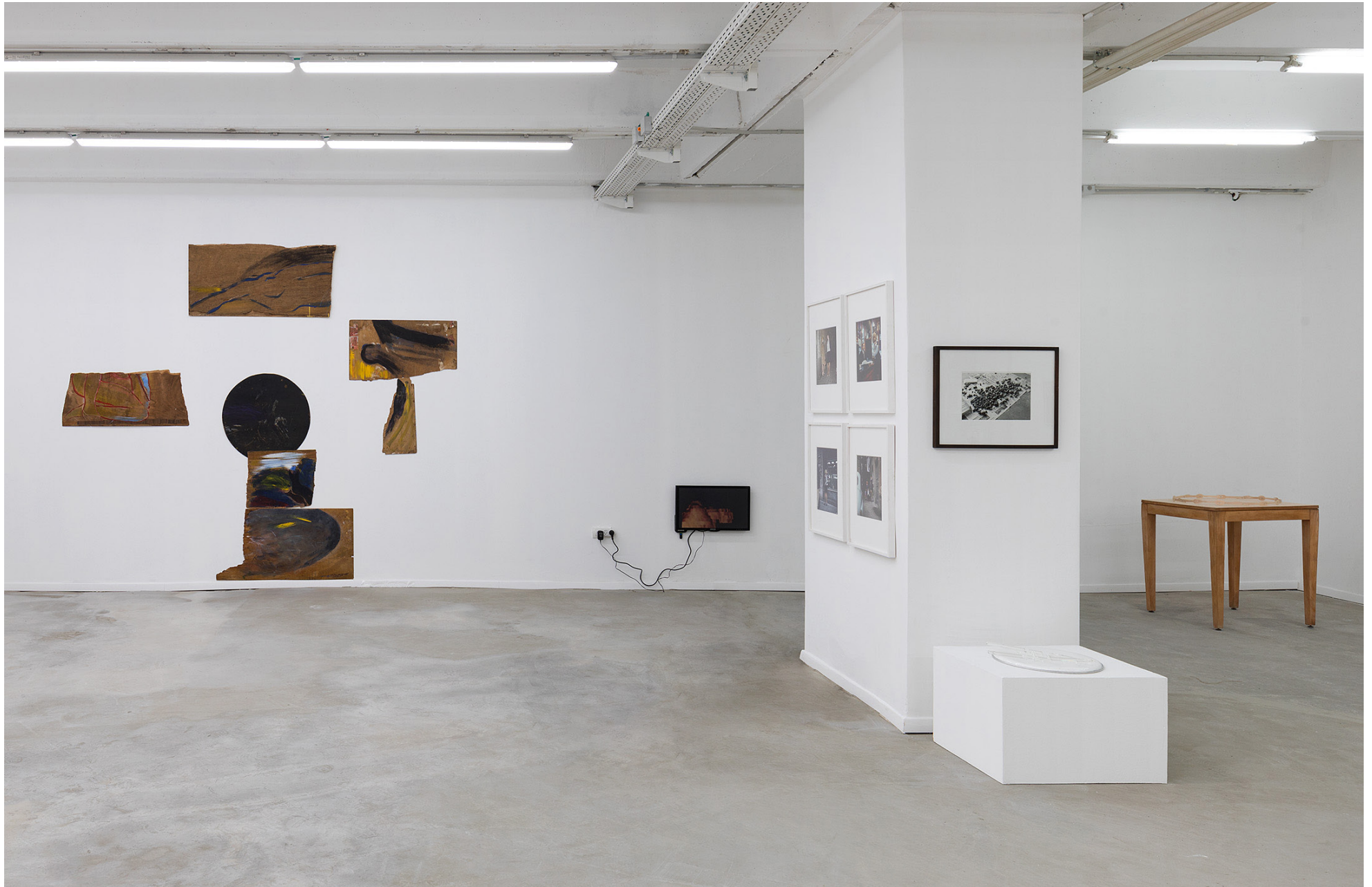
'Under the Volcano', 2022 exhibition view, Dvir Gallery Tel Aviv