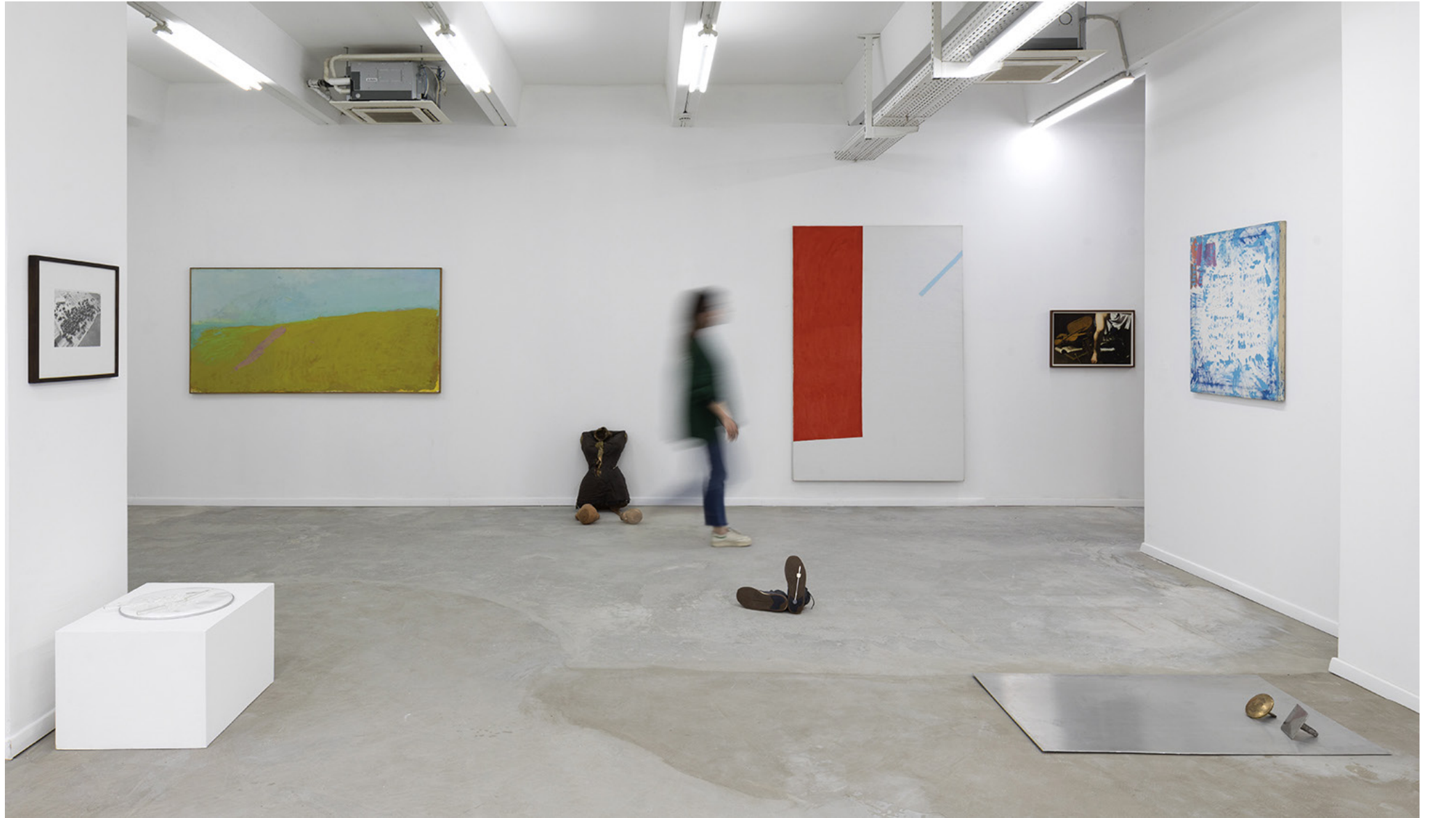
'Under the Volcano', 2022 exhibition view, Dvir Gallery Tel Aviv