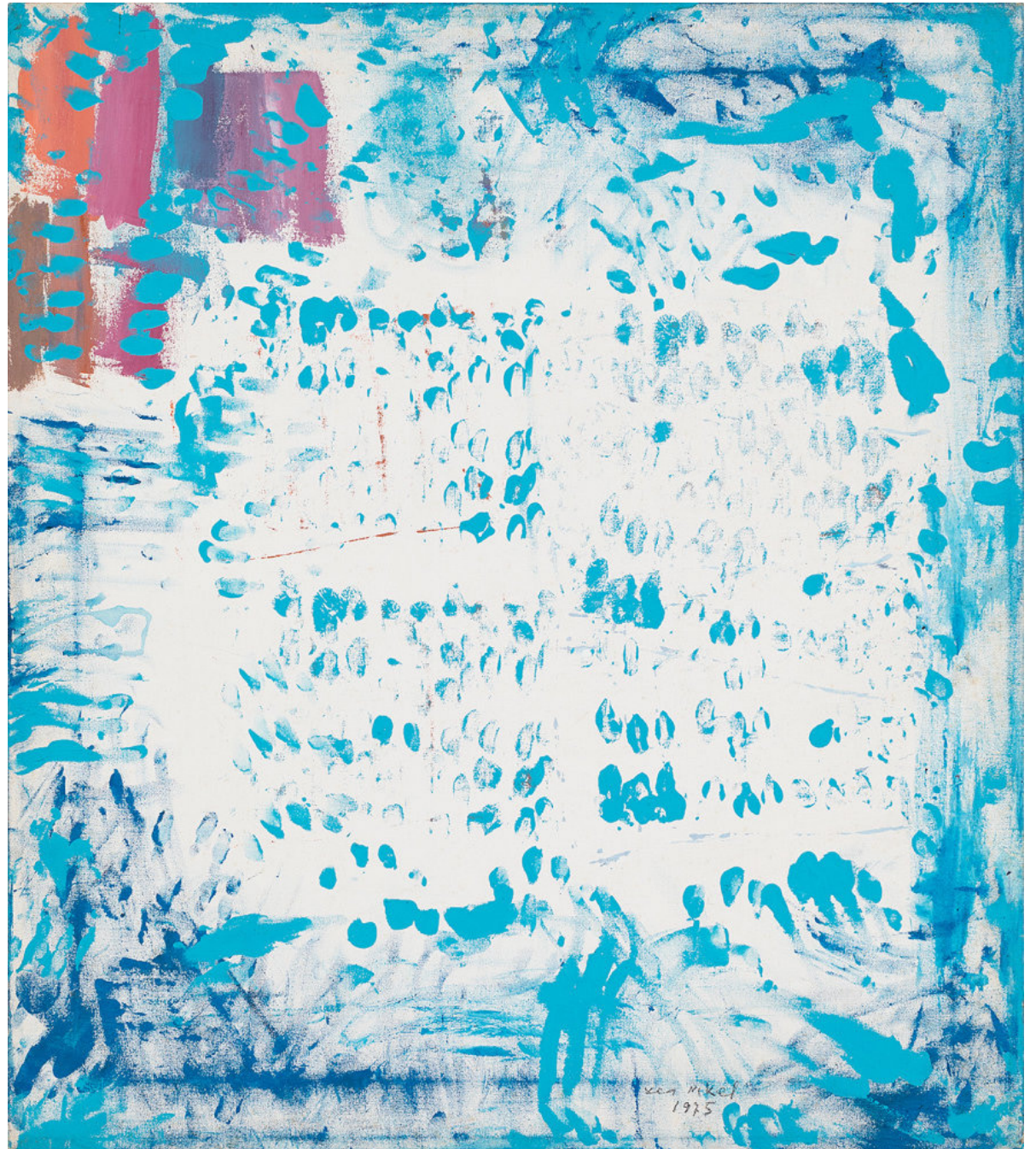
LEA NIKEL Untitled, 1975 oil on canvas 86 x 76 cm, unique