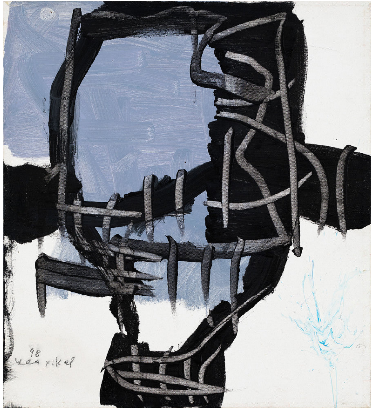
LEA NIKEL Untitled, 1998 oil on canvas 50 x 45 cm, unique