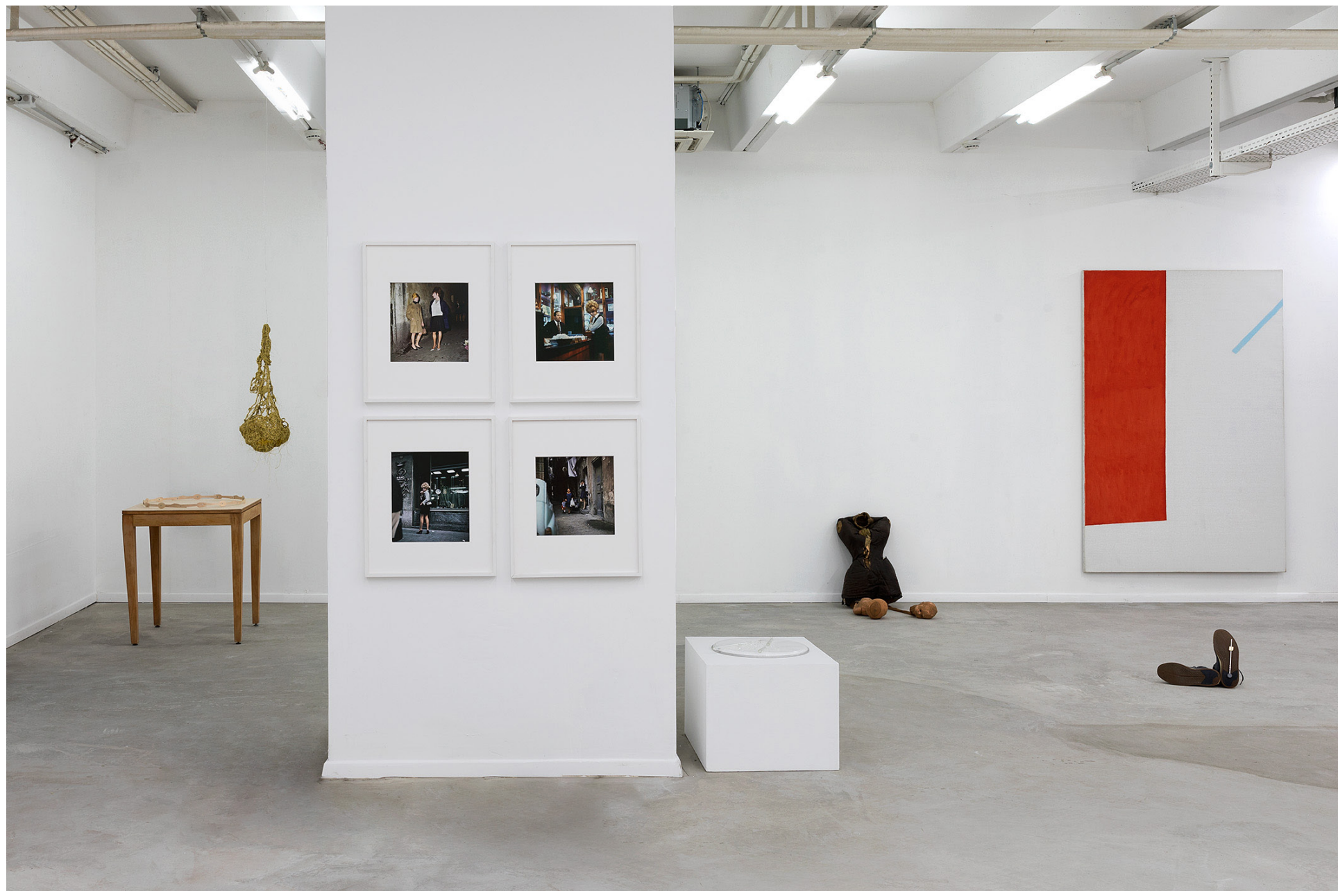
'Under the Volcano', 2022 exhibition view, Dvir Gallery Tel Aviv