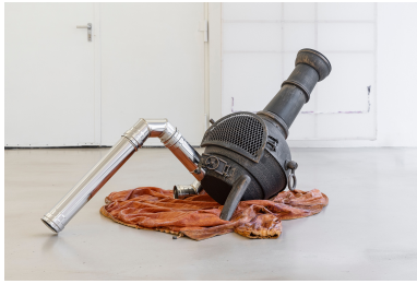
Christiane Blattmann - A Sediment, A Sentiment, A Threshold, 2022, oven, stainless steel, bronze, leather jacket, oil colour, polyurethane, 145×120×75 cm