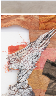
Christiane Blattmann - Watershed #2 (detail), 2022, cast silicone, dyed jute, pigment, 162×220 cm