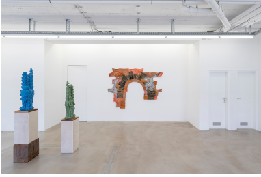
Sour Well - exhibition view #8

Courtesy of the artists; Damien & The Love Guru, Brussels; Sundy, London; Lucas Hirsch, Düsseldorf and Nir Altman, Munich