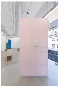
Henrik Potter - March 2022 / Elsa / Ade / (in peach), 2022, wood, muslin, clay, glue, oil paint, 250x130.3x4.4 cm

Courtesy of the artist; Sundry, London; Lucas Hirsch, Düsseldorf and Nir Altman, Munich