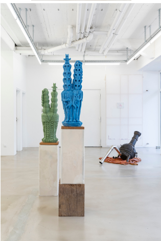
Sour Well - exhibition view #1