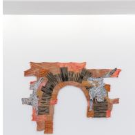
Christiane Blattmann - Watershed #2, 2022, cast silicone, dyed jute, pigment, 162×220 cm