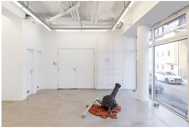
Sour Well - exhibition view #3