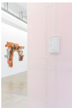
Sour Well - exhibition view #7