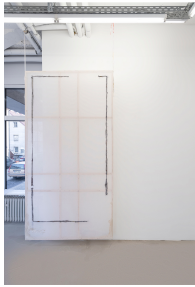
Henrik Potter - March 2022 / Pacify / or A Painting, 2022, wood, muslin, clay, glue, oil paint, 250x129.5x4.3 cm

Courtesy of the artist; Sundry, London; Lucas Hirsch, Düsseldorf and Nir Altman, Munich