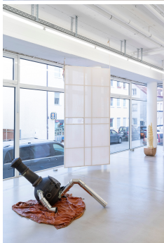
Sour Well - exhibition view #5