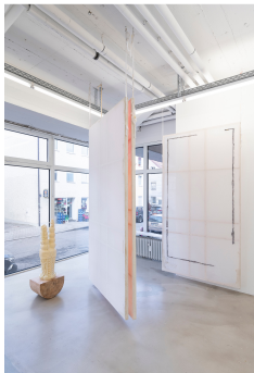
Sour Well - exhibition view #4