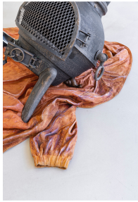
Christiane Blattmann - A Sediment, A Sentiment, A Threshold (detail), 2022, oven, stainless steel, bronze, leather jacket, oil colour, polyurethane, 145×120×75 cm