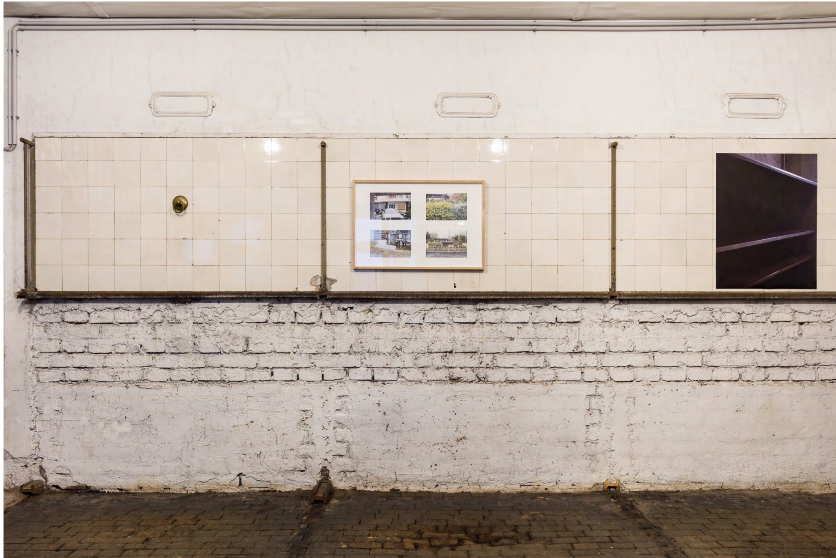
Il Lenzuolo Viola , 2020 Exhibition view Ermes-Ermes, Vienna