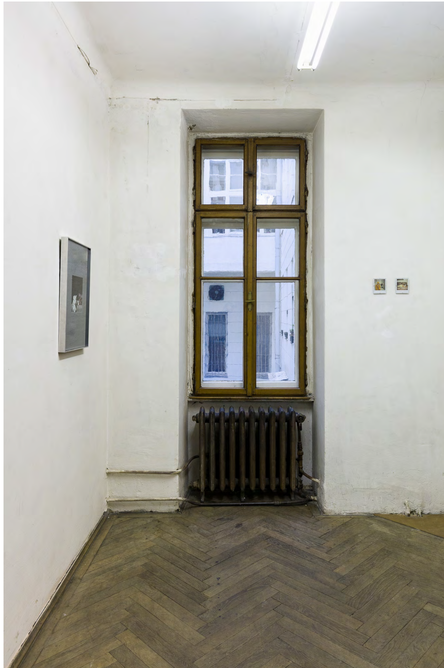
Il Lenzuolo Viola , 2020 Exhibition view Ermes-Ermes, Vienna