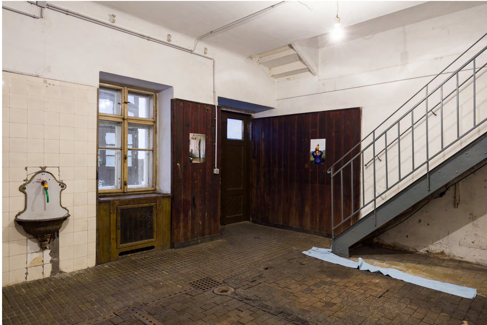
Il Lenzuolo Viola , 2020 Exhibition view Ermes-Ermes, Vienna