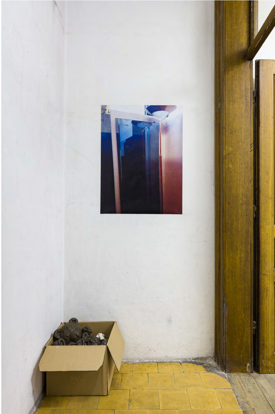
Stefano Faoro Untitled (shelves and lace) , 2019 Digital print on PVC 60 x 80 cm (unframed)