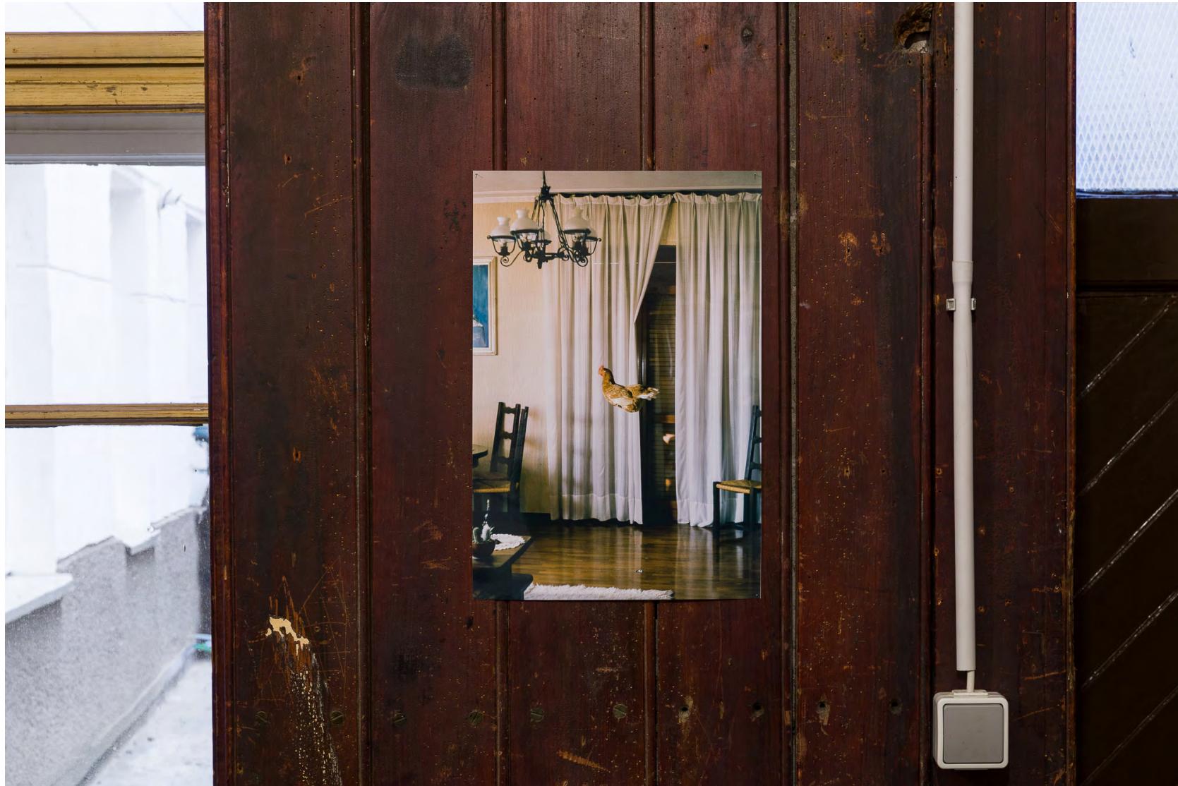
Diego Perrone Untitled , 1997 Photographic print 45 x 30,5 cm