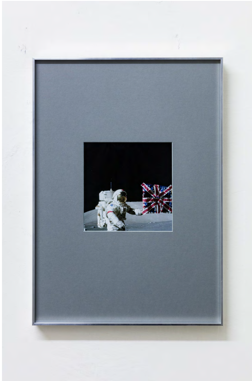
Darius Mikšys British On The Moon , 2008 Photoshop performance Photographic print 20 x 20 cm (unframed) - 59 x 42 cm (framed)