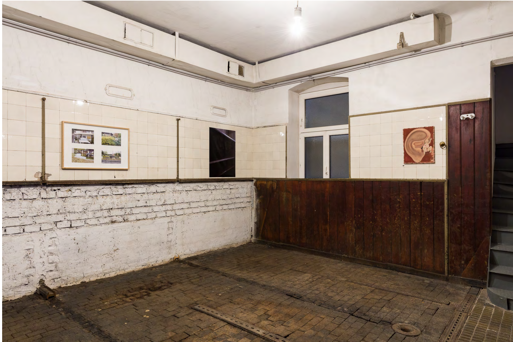
Il Lenzuolo Viola , 2020 Exhibition view Ermes-Ermes, Vienna