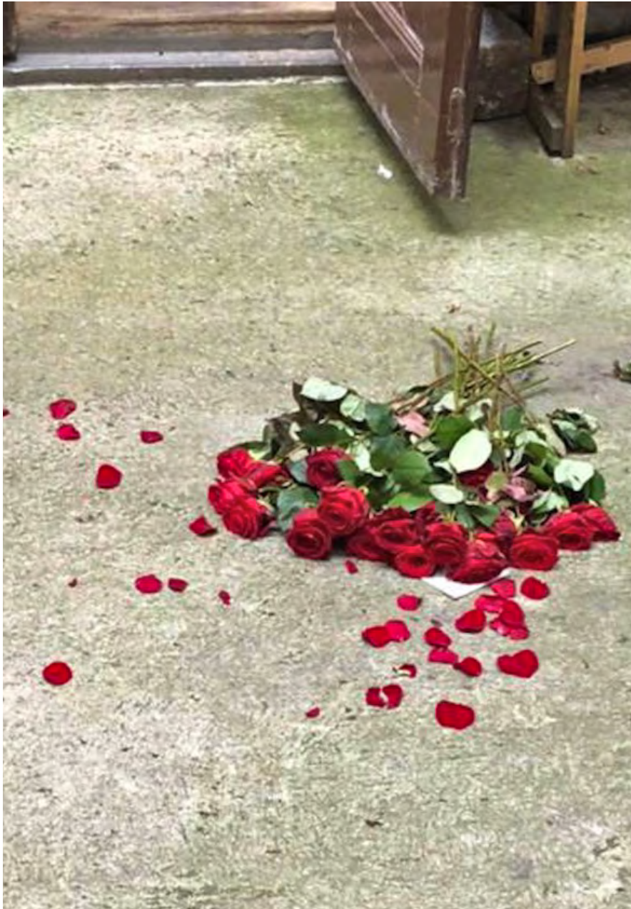
Adriana Lara The Language of Flowers , 2020 Letter with certificate Dimensions variable