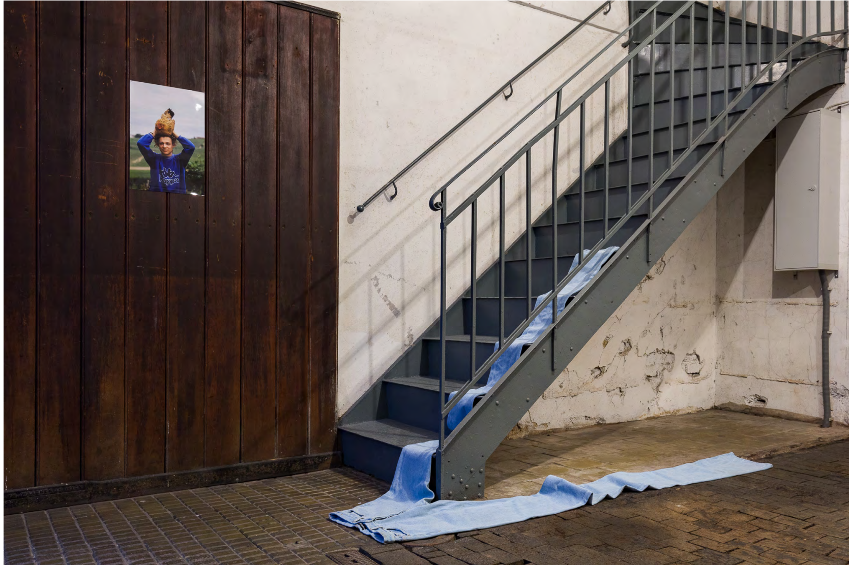
Il Lenzuolo Viola , 2020 Exhibition view Ermes-Ermes, Vienna