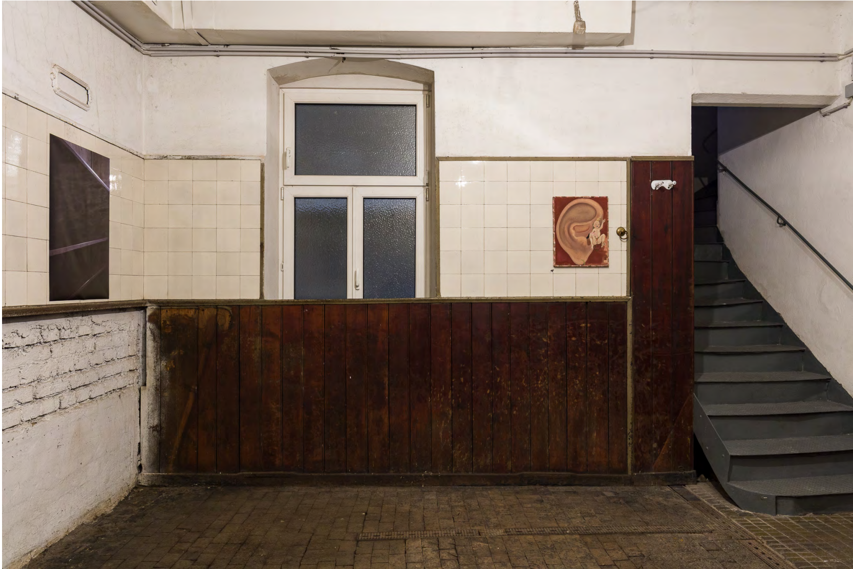
Il Lenzuolo Viola , 2020 Exhibition view Ermes-Ermes, Vienna