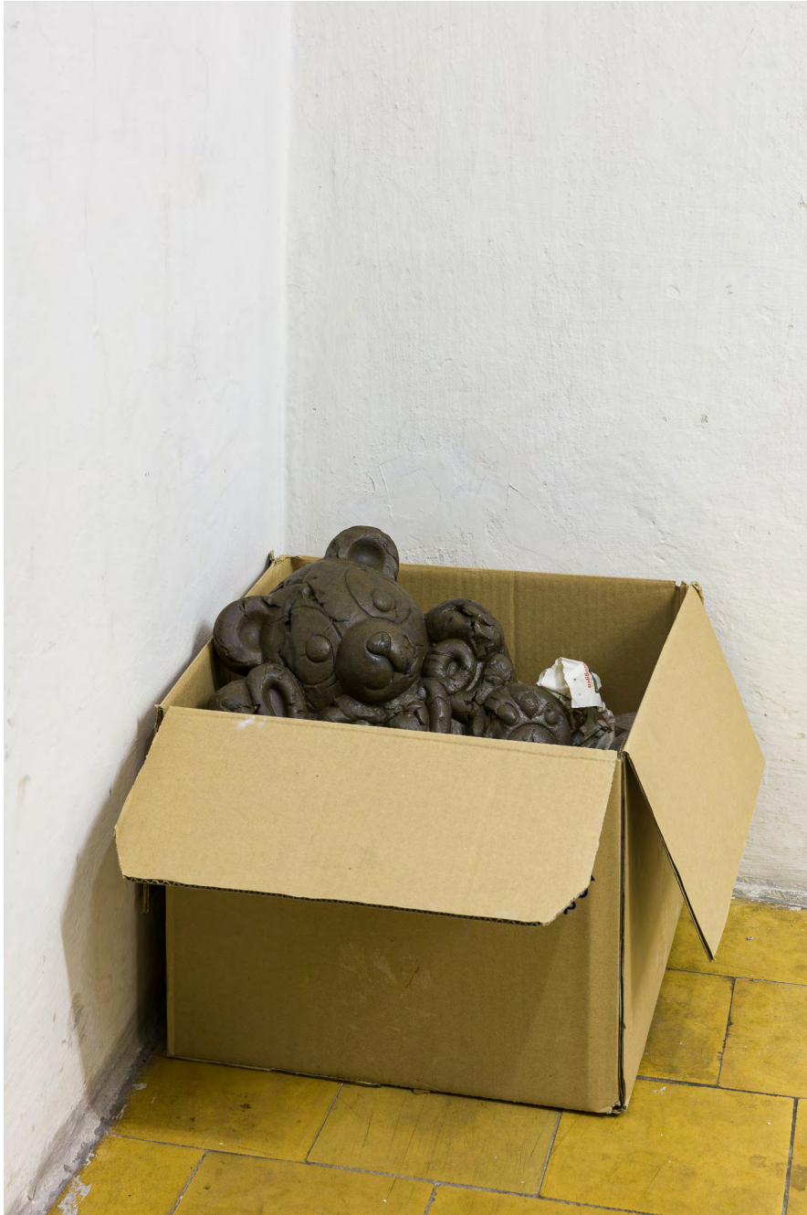
Gina Folly LOVE I , 2019 Cardboard box, newspaper, glazed ceramics 36,5 x 36,5 x 48,5 cm