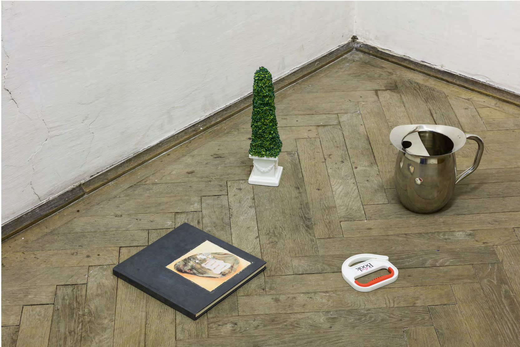
Darren Bader 3 sculptures , n. d. Pitcher, book with faded sticker, pair of sculptures Dimensions variable