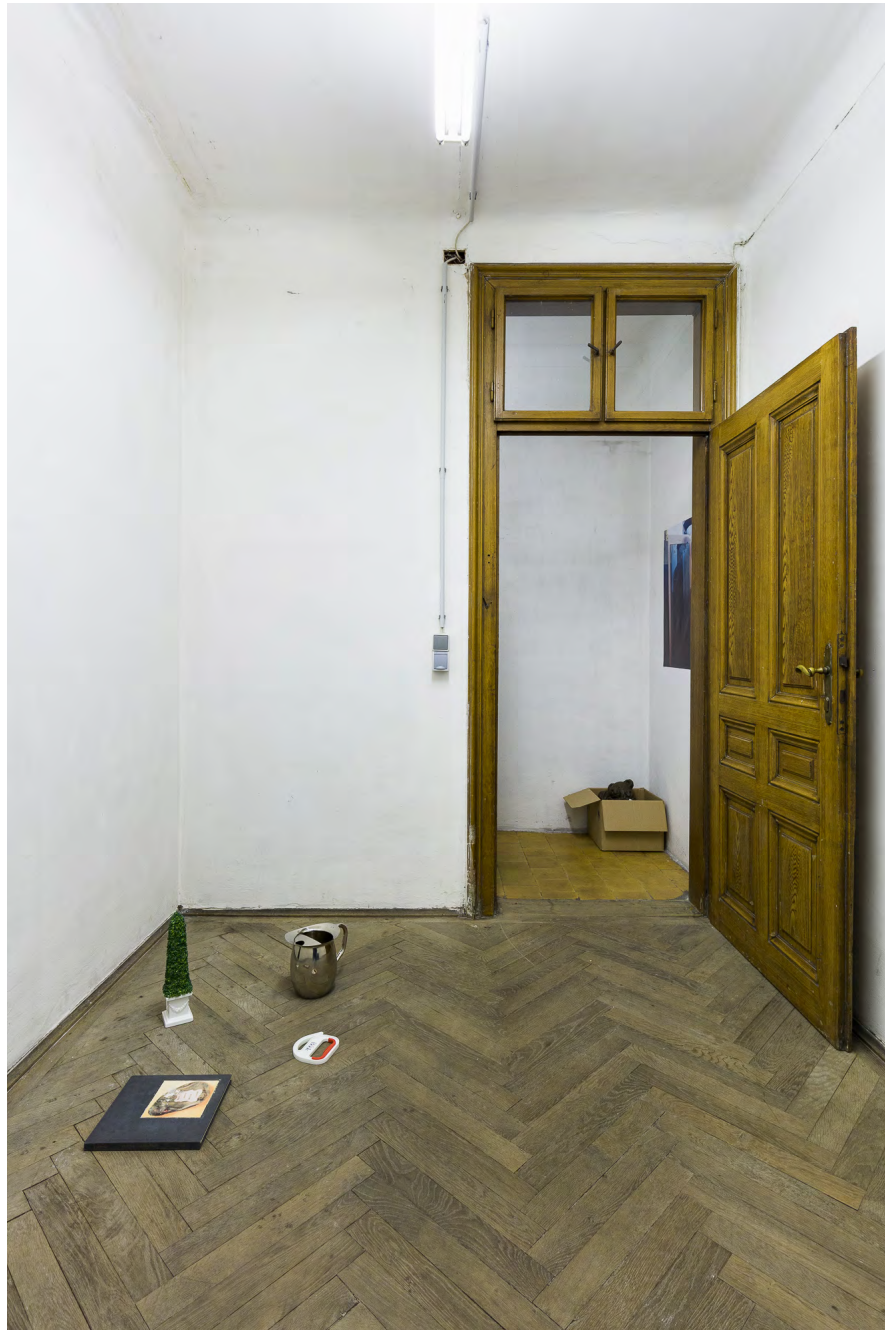
Il Lenzuolo Viola, 2020 Exhibition view Ermes-Ermes, Vienna