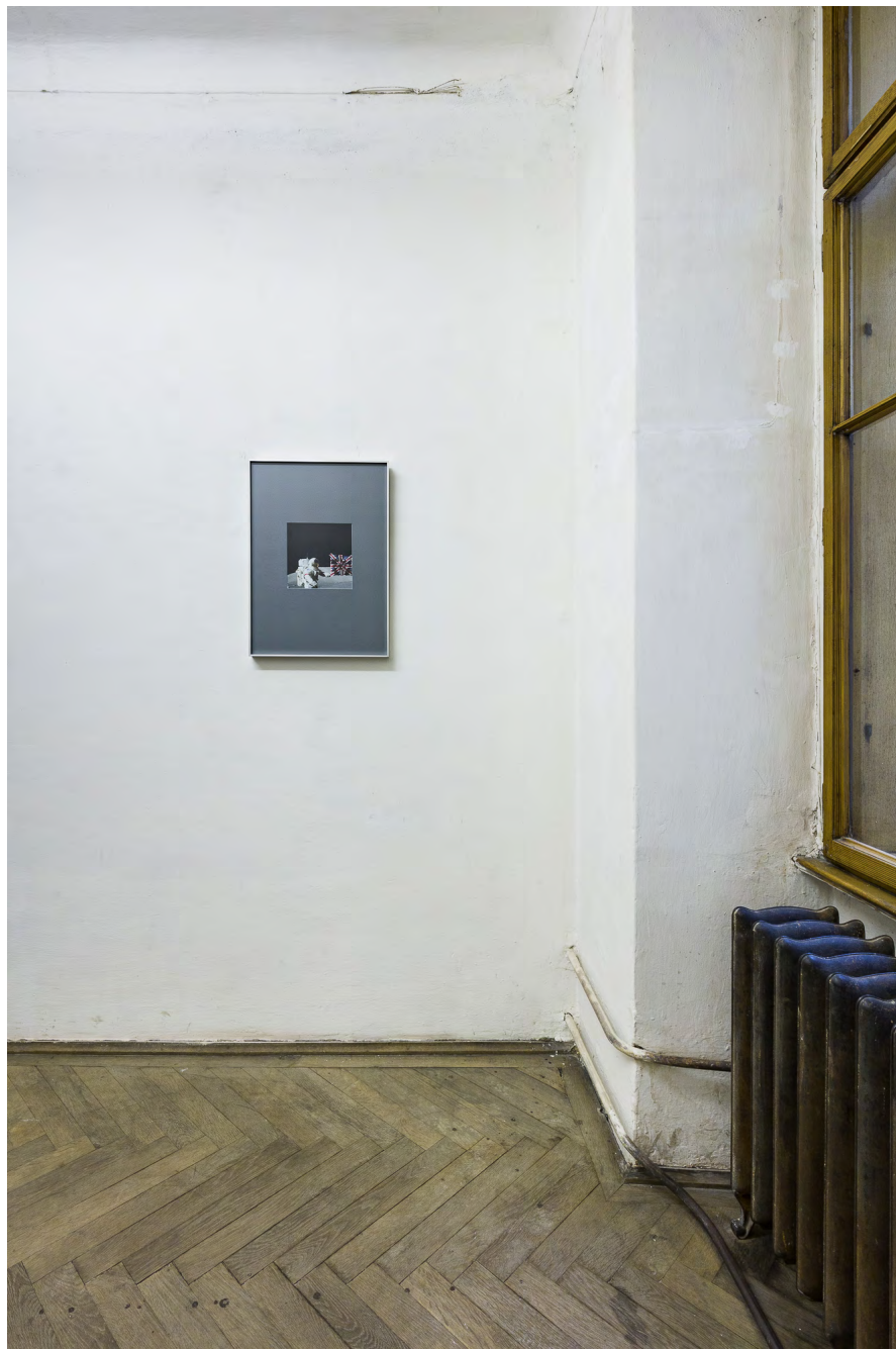
Il Lenzuolo Viola , 2020 Exhibition view Ermes-Ermes, Vienna