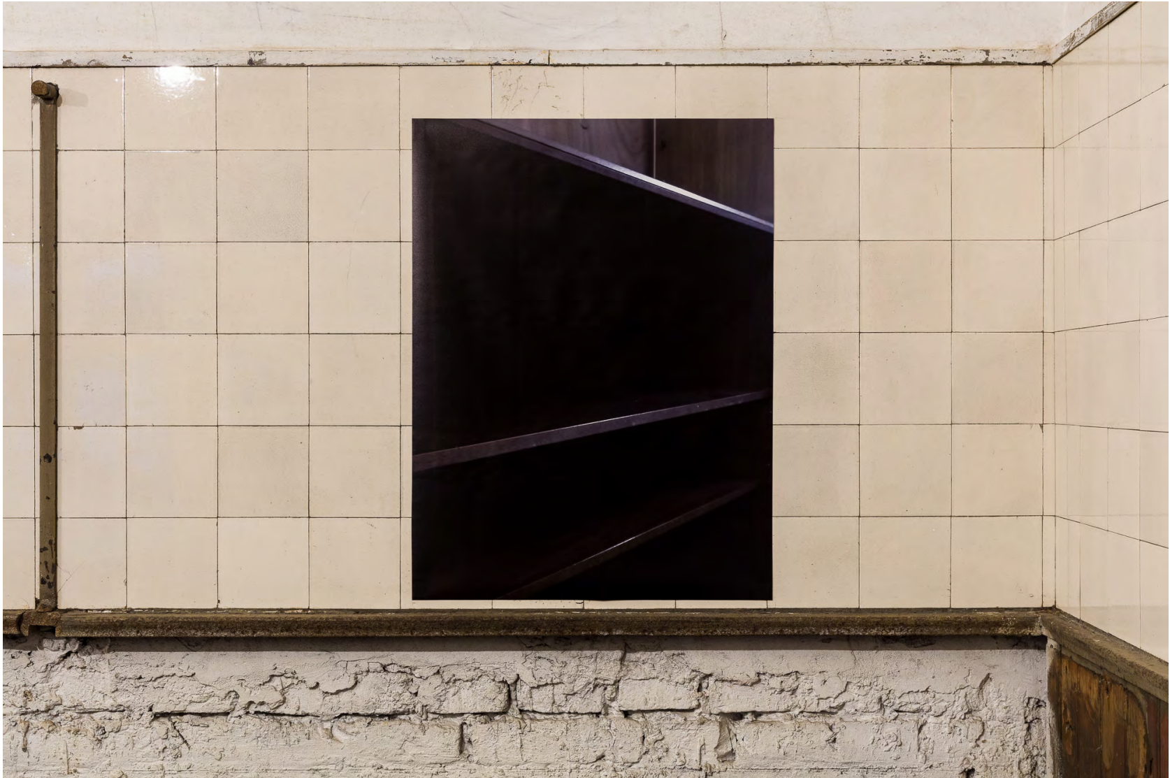
Stefano Faoro Untitled (shelves and lace) , 2019 Digital print on PVC 60 x 80 cm (unframed)