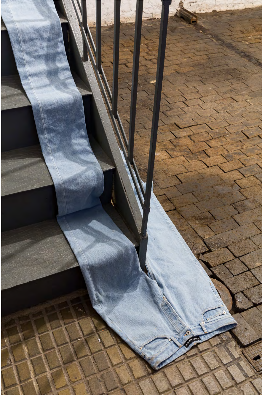
Davide Stucchi WW (Walkwear) II , 2015 Y-project oversized folded jeans, stairs Dimensions variable