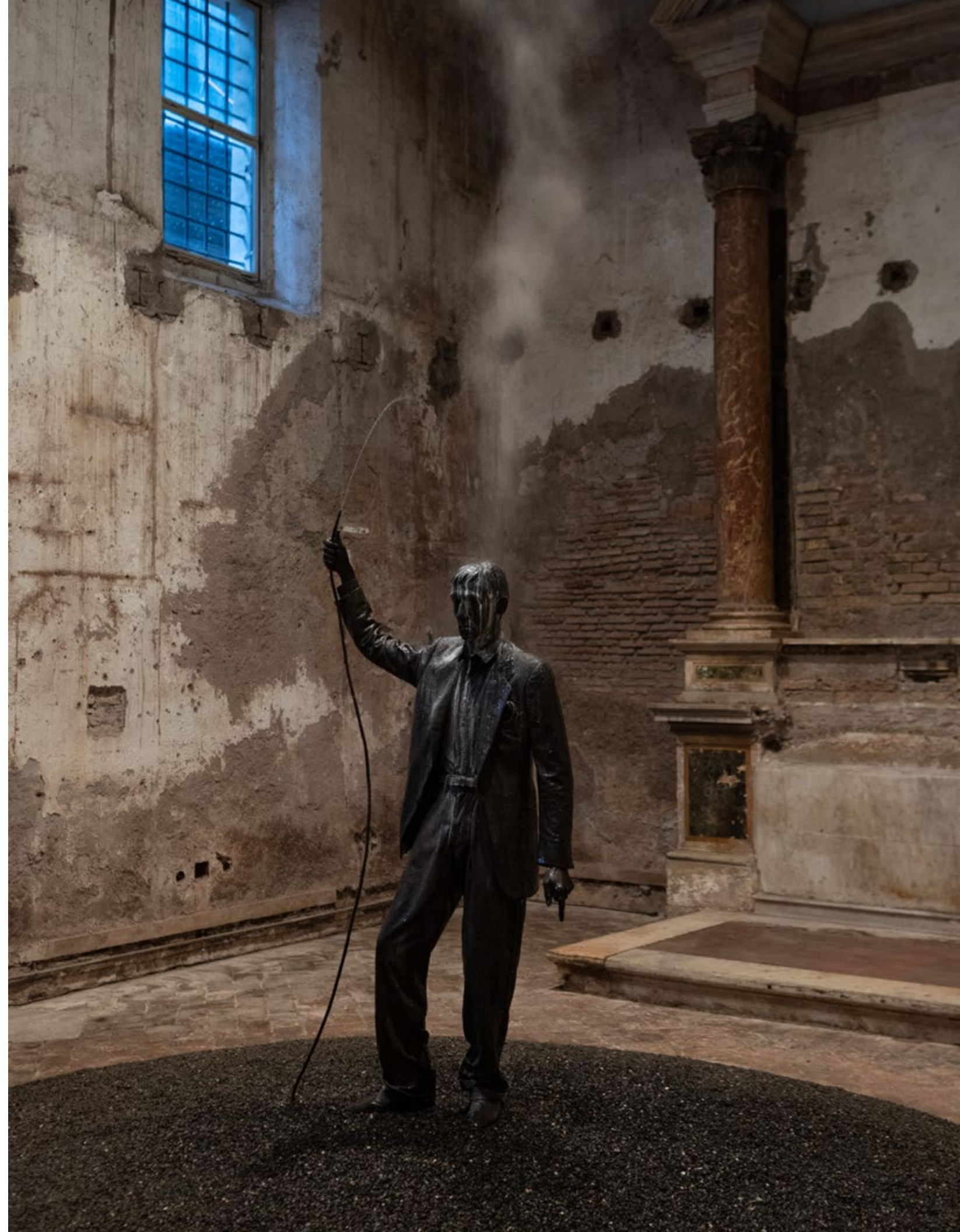
Installation view: Autoritratto , 1993 Sant'Andrea de Scaphis, Rome Open March 11, 2022