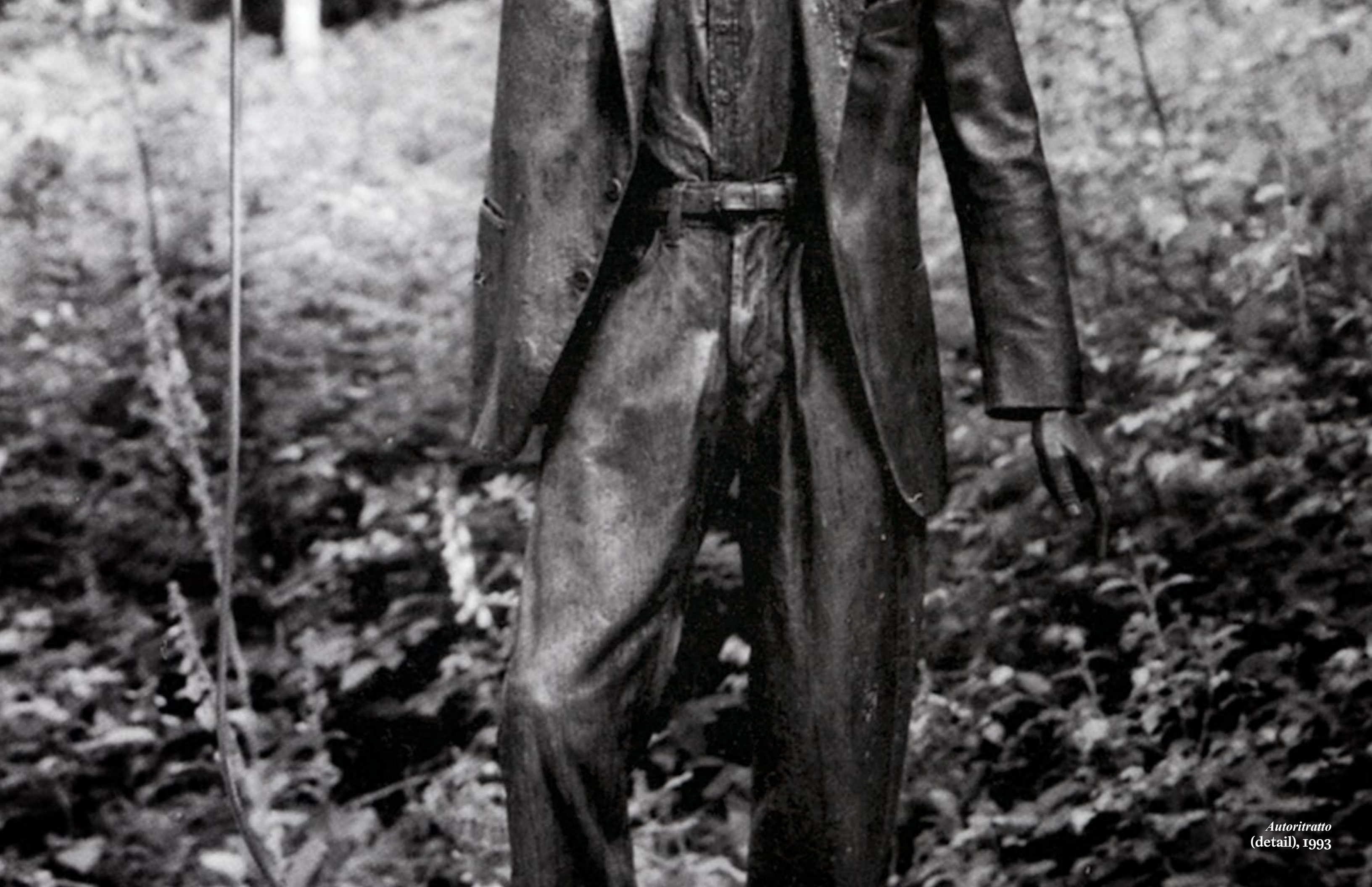
Autoritratto (detail), 1993