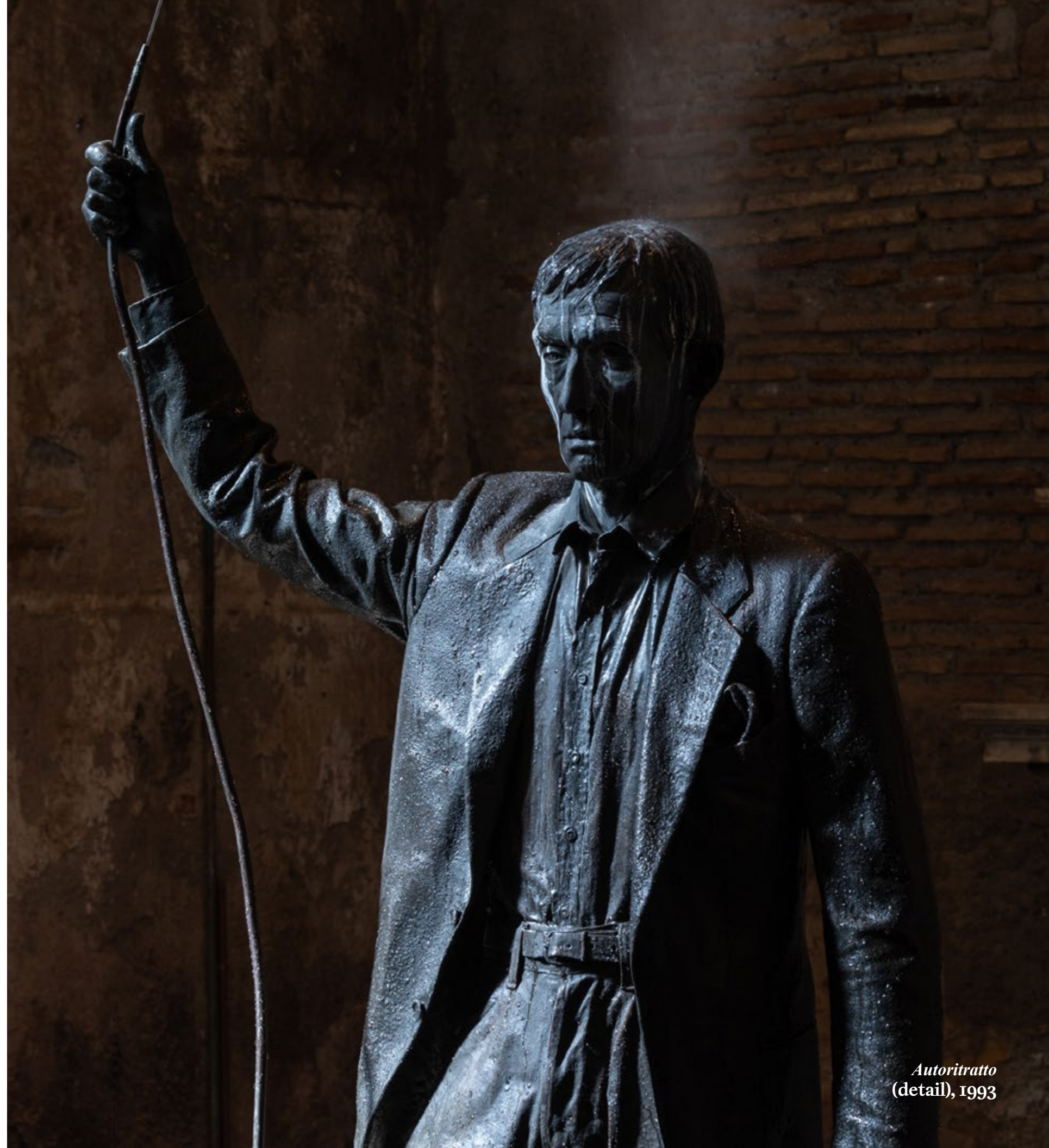
Autoritratto (detail), 1993

Works of art described are subject to changes in availability and price without prior notice.