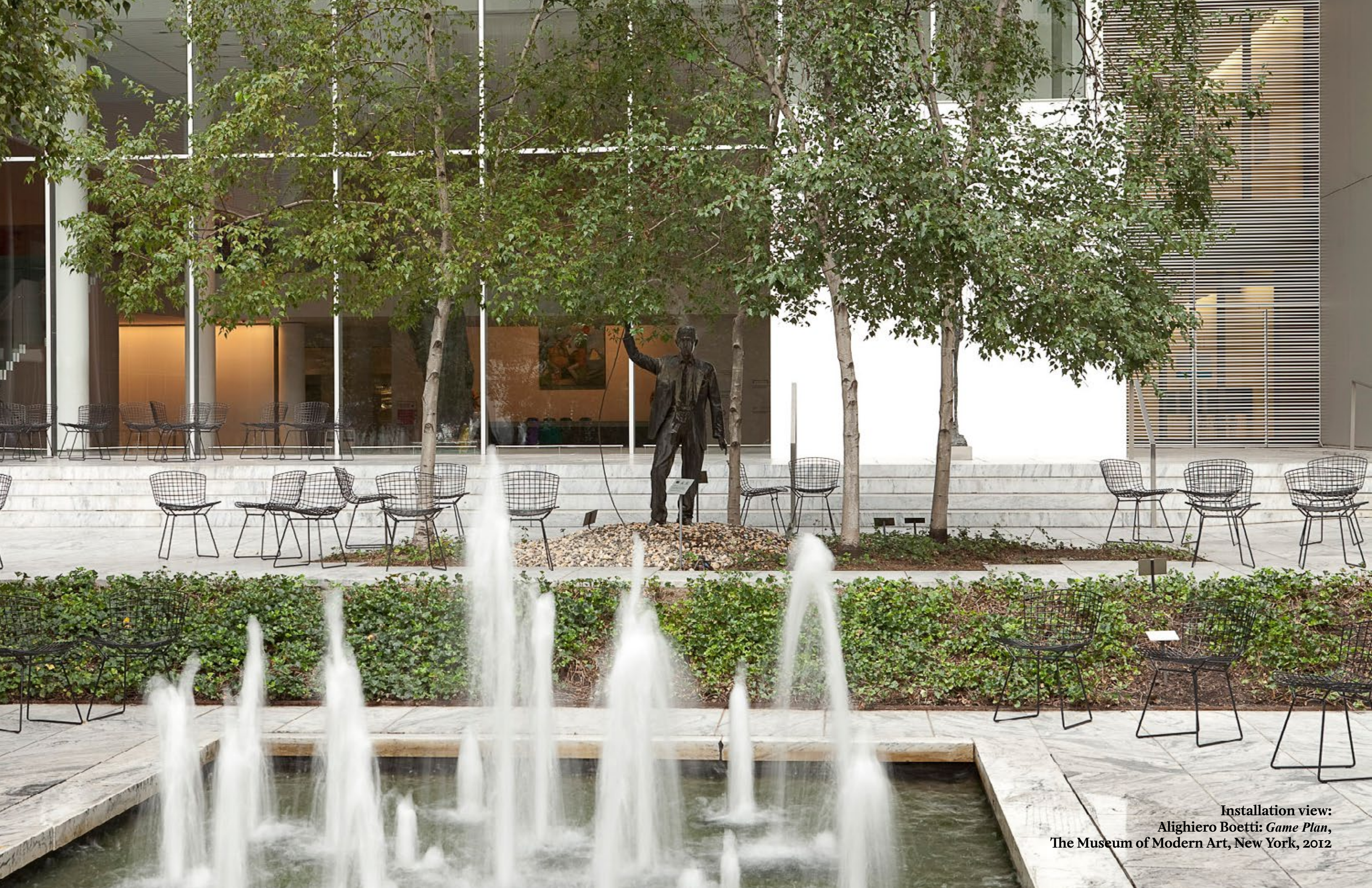
Installation view: Alighiero Boetti: Game Plan , The Museum of Modern Art, New York, 2012