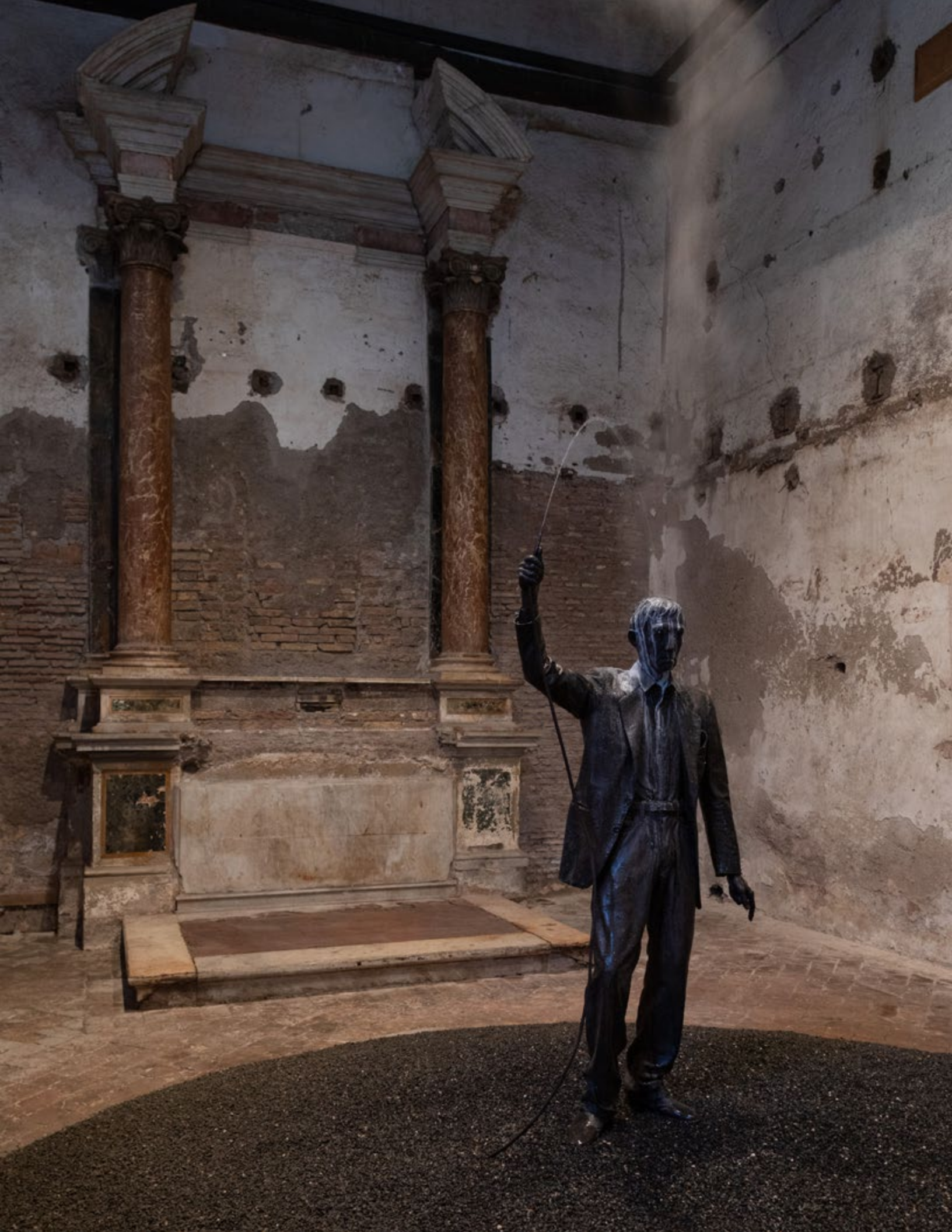
Installation view: Autoritratto , 1993 Sant'Andrea de Scaphis, Rome Open March 11, 2022