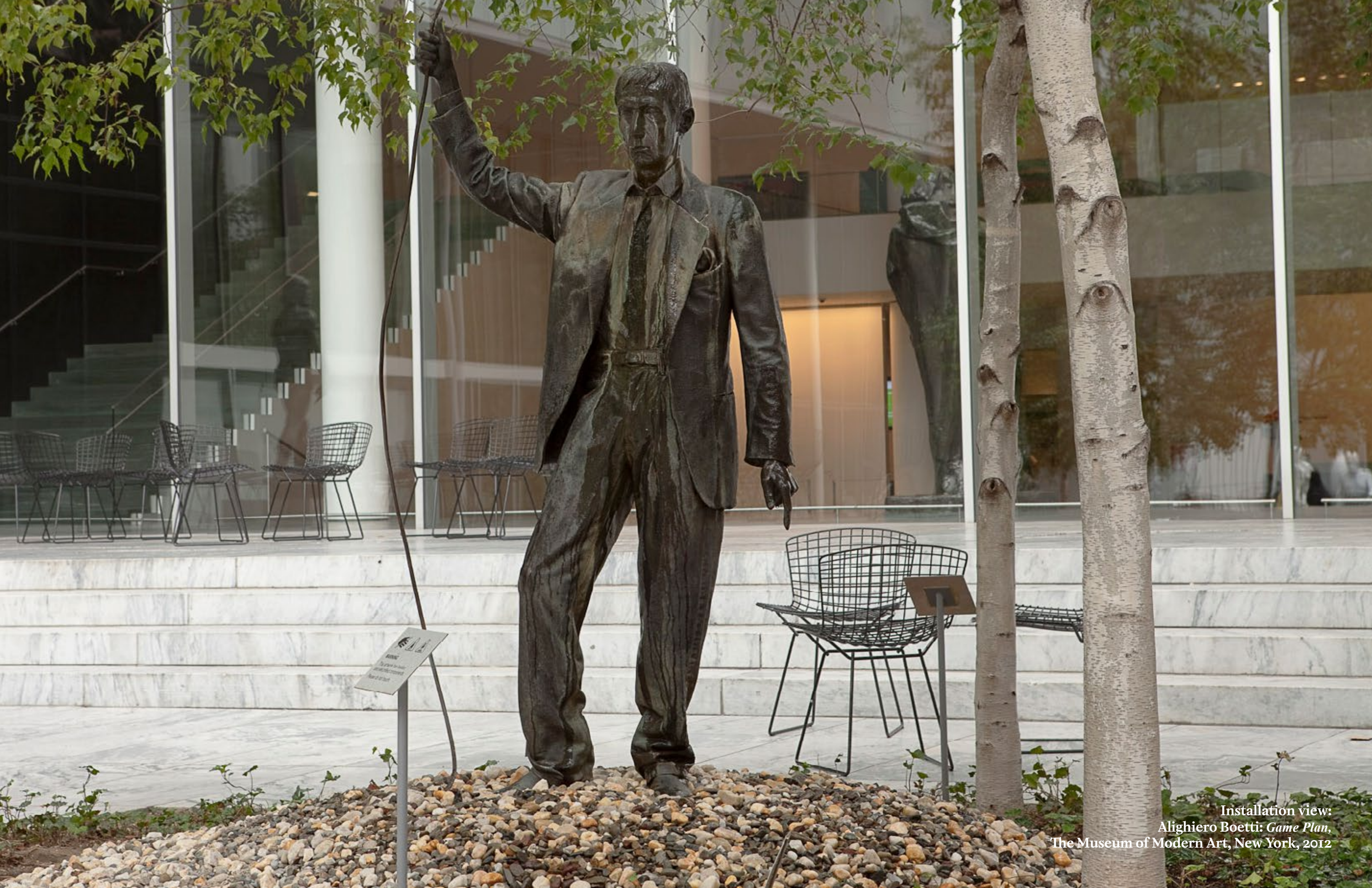
Installation view: Alighiero Boetti: Game Plan , The Museum of Modern Art, New York, 2012