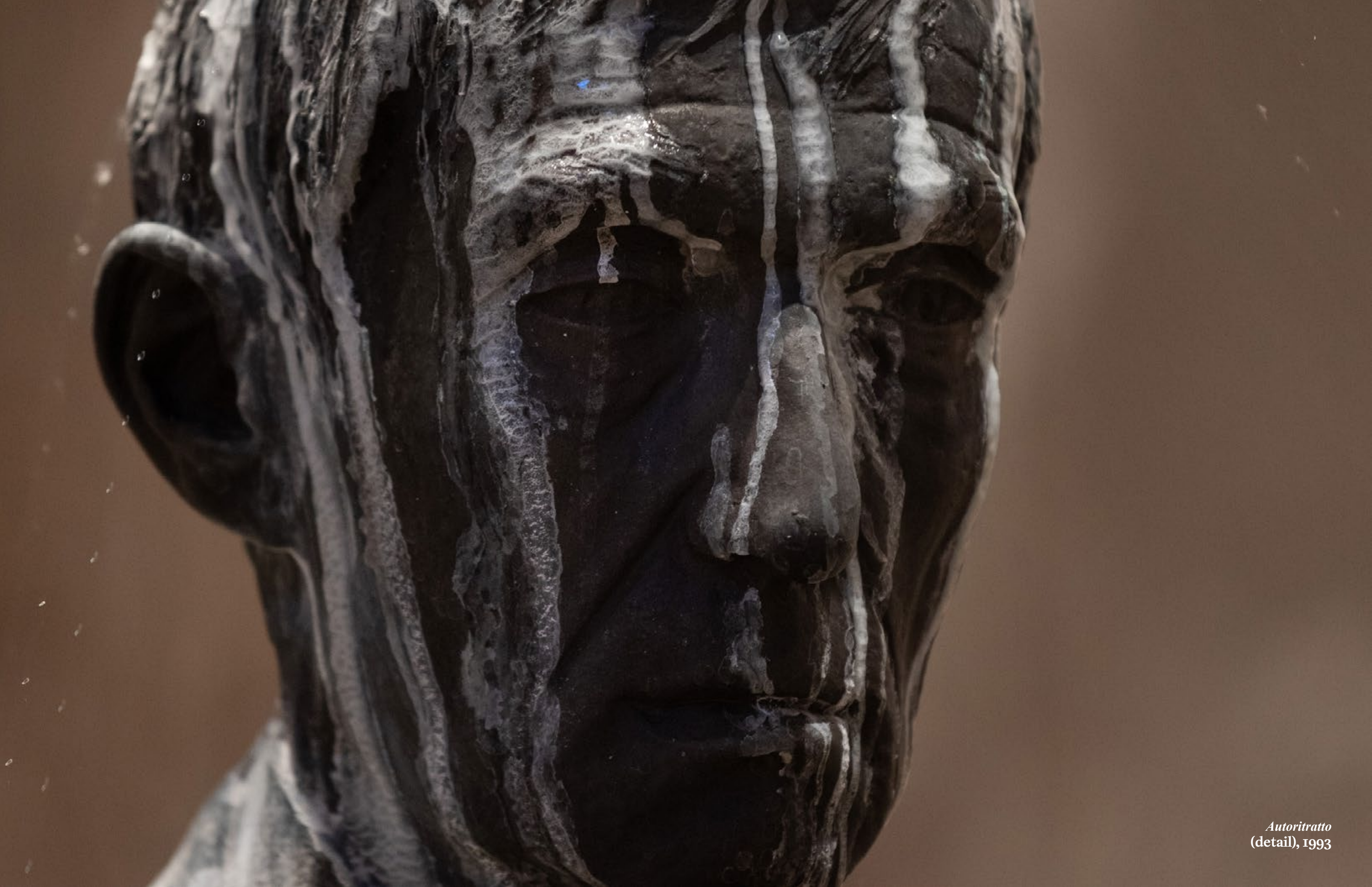
Autoritratto (detail), 1993