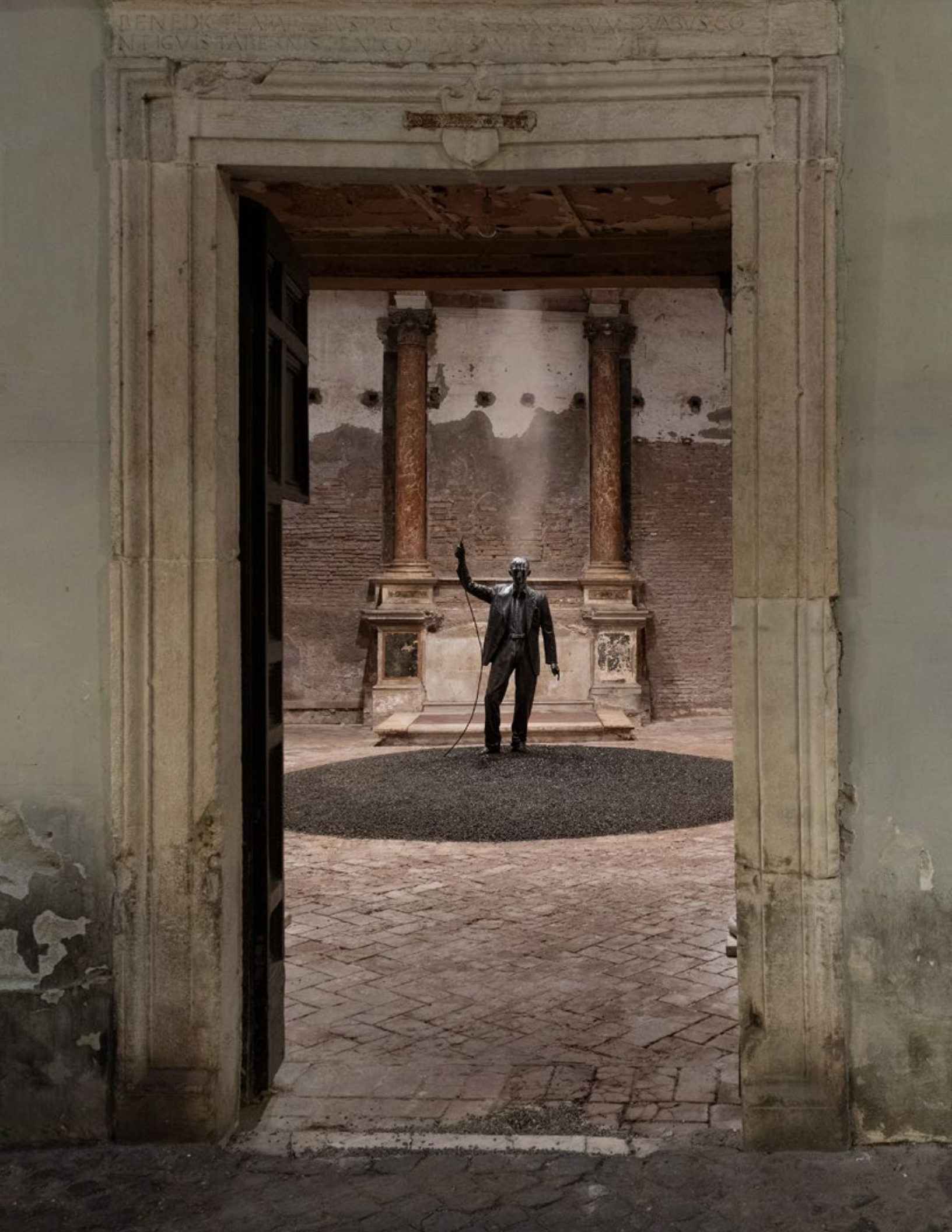
Installation view: Autoritratto , 1993 Sant'Andrea de Scaphis, Rome Open March 11, 2022