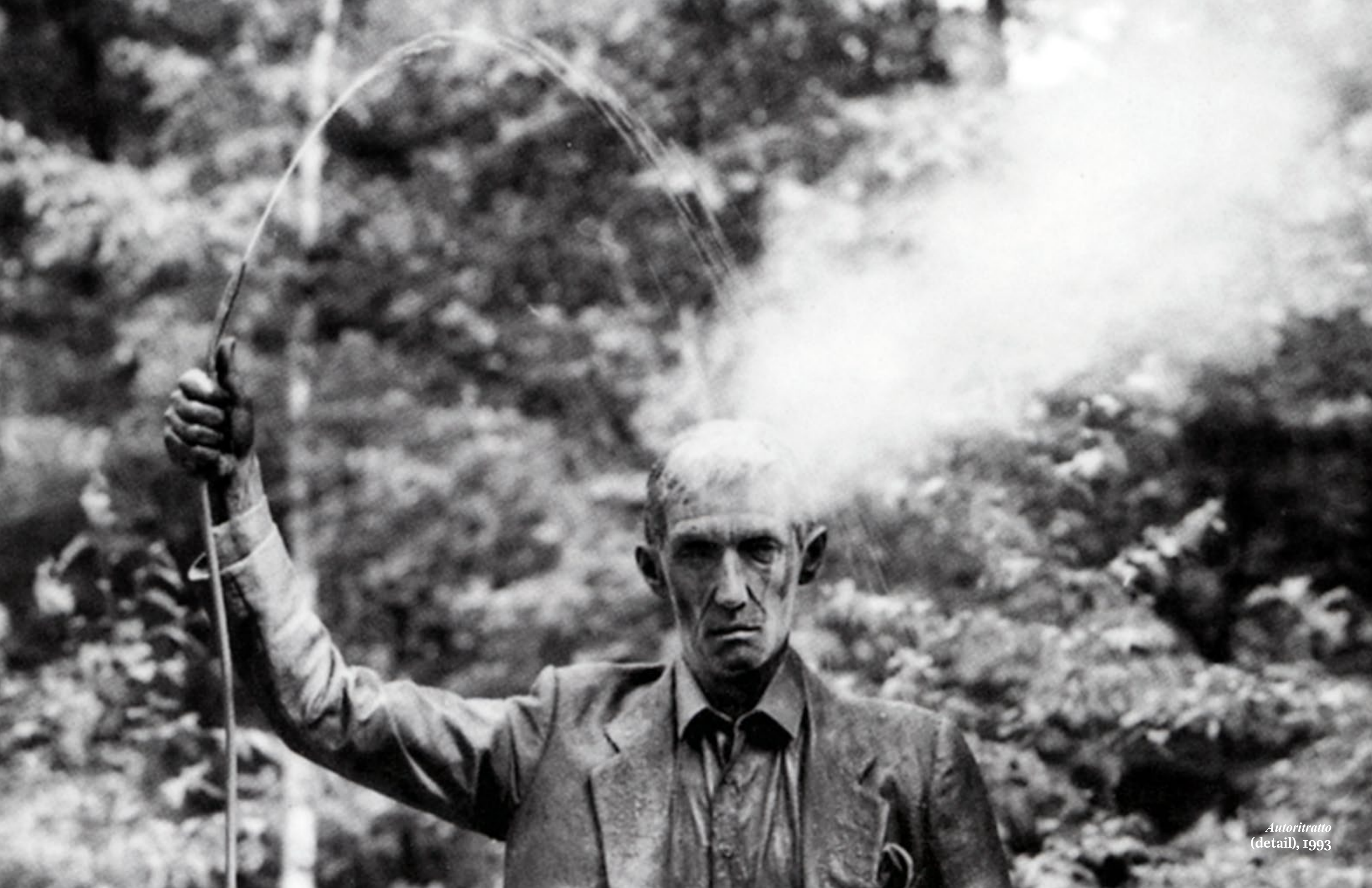
Autoritratto (detail), 1993