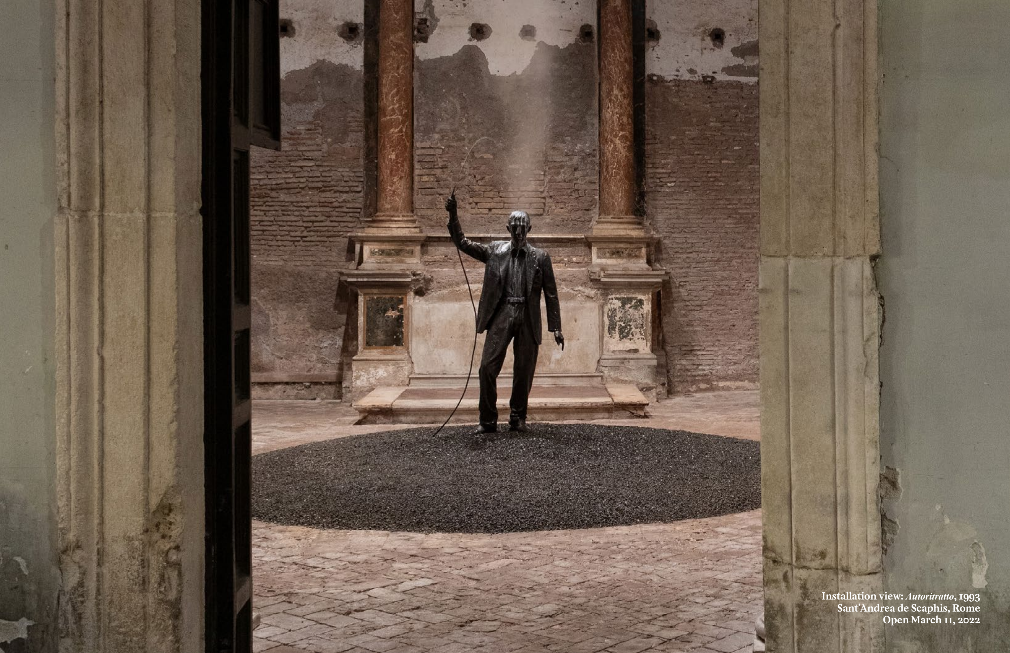
Installation view: Autoritratto , 1993 Sant'Andrea de Scaphis, Rome Open March 11, 2022