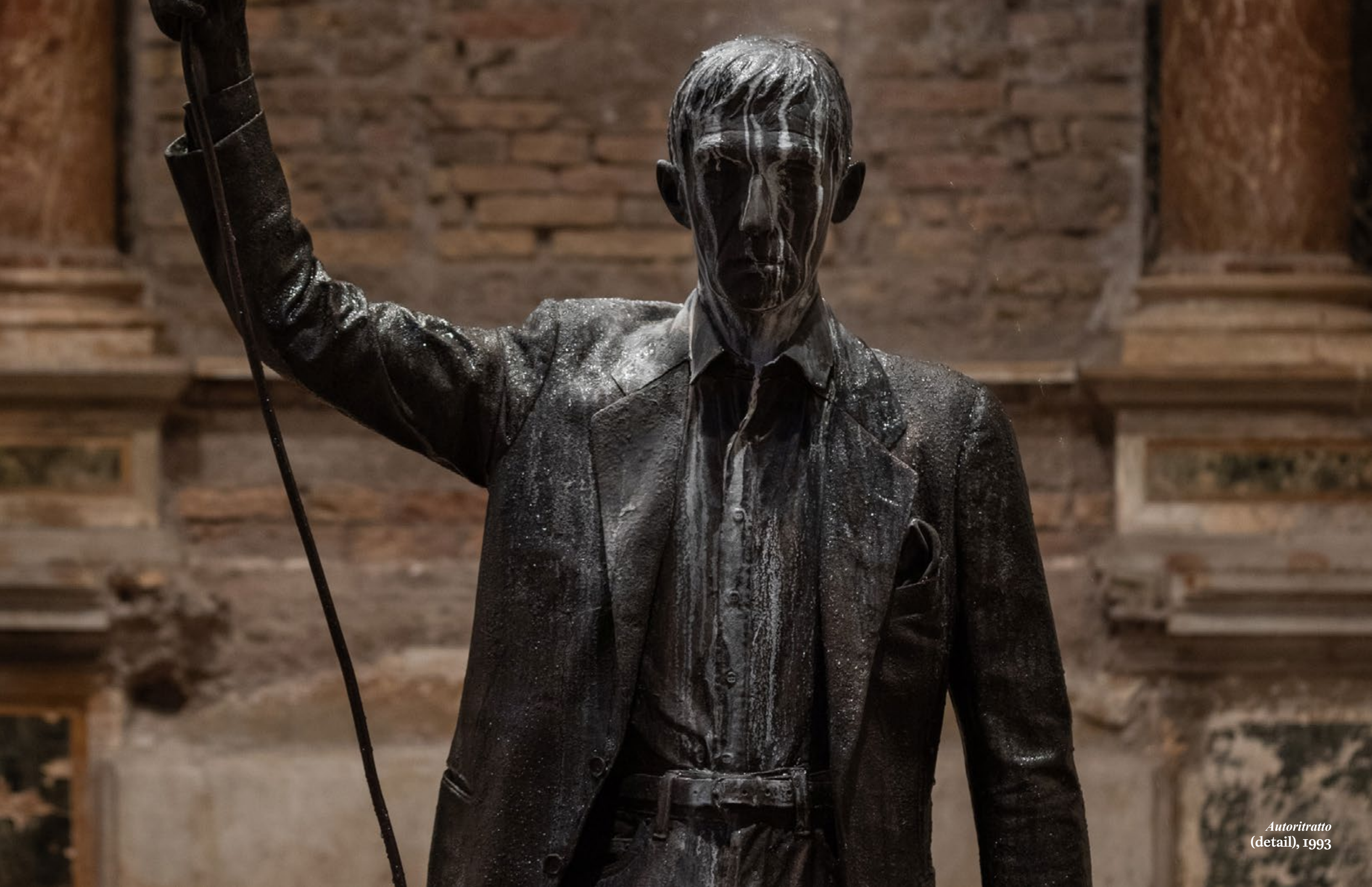
Autoritratto (detail), 1993