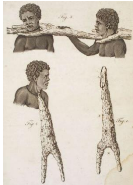
fig. 1. wood yokes used in coffles, Senegal, ca. 1789

Willie Cole is well-known for his inventive transformations of found materials into sculptures that depict everything from domestic objects and animals to African artifacts and antebellum imagery. Cole expands on this idea: "The objects that I use I see as them finding me, more so than me finding them...I see an object and suddenly I recognize what I can do with the object. So in that sense, there is an energy or spirit connection to the object. I am exploring the possibilities of these objects." 1