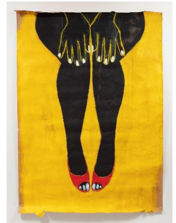
Fingers and Toes (shoes on) 2015