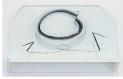
Steffani Jemison, Untitled , 2021 Acrylic, tempered glass table top, hardware 15 x 30 x .5 inches