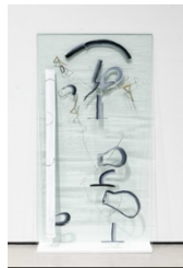
Steffani Jemison, Untitled , 2021 Acrylic, tempered glass table top, hardware 59 x 30 x .5 inches Collection of James Cahn and Jeremiah Collatz, Minneapolis