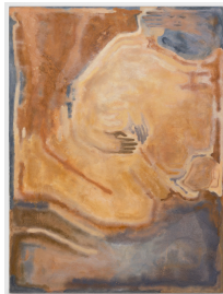
Cosmic Hiccup , 2022 Oil on canvas 47.3 x 35.4" / 120 x 90cm (YT2022-002)