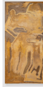
Pocket Microscope , 2022 Oil on canvas 74.8 x 35.4" / 190 x 90cm (YT2022-004)