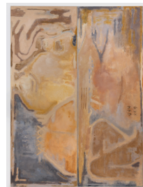
Humming Fluid , 2022 Oil on canvas 74.8 x 55.1 / 140 x 190 cm (YT2022-001)