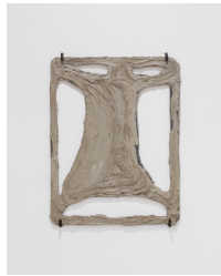
A Raw Nerve , 2022 Metal, concrete 17.32 x 13.4" / 44 x 34cm (YT2022-009)