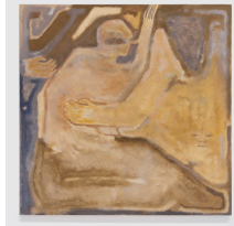
Semi-permanent Thin Spot , 2022 Oil on canvas 31.4 x 31.4" / 80 x 80cm (YT2022-006)