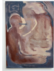
Glyph , 2022 Oil on canvas 28 x 20" / 71 x 51cm (YT2020-002)