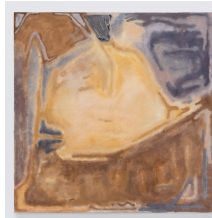
Archaic Wiring , 2022 Oil on canvas 36 x 36" / 91.5 x 91.5cm (YT2022-005)