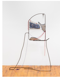
Eternity's Springboard , 2022 Metal, concrete, pigment, fiber 61 x 41.7 x 9" / 156 x 106 x 22.8cm (YT2022-010)