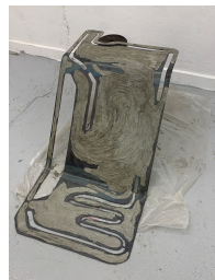
The Backbone of a History of Rewriting History , 2022 Metal, concrete 17.32 x 49.5" x 21.6 / 44 x 110.5 x 55cm (YT2022-008)