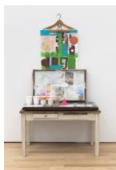
Susan Cianciolo The game of existence , 2021-22 Wood, paper, plastic, metal, clay, paint, pencil, marker 64h x 34w x 20d in scianciolo001