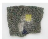
Savannah Knoop Leap Year (October/November/December 2020/January 2022) , 2022 Newspaper, Aqua-Resin, and pigment 72h x 80w x 7d in sknoop001