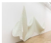
Eric N. Mack Bodice , 2022 Pleated polyester, paper, string, and pins 80h x 280w x 60d in enmack001