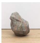
Liz Larner Asteroid (Jones) , 2020 Ceramic, glaze 21h x 19 1/2w x 16d in llarner002