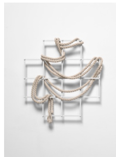
Calendar Relief #2 , 2022 bronze, patina, oil paint 62.2 x 62.2 x 9.5 cm 24 1/2 x 24 1/2 x 3 3/4 in