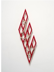
Skewed Relief #3 , 2022 bronze, patina, oil paint 121.9 x 38.1 x 8.9 cm 48 x 15 x 3 1/2 in