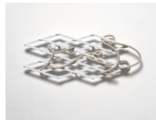
Skewed Relief #2 , 2022 bronze, patina, oil paint 38.7 x 99.1 x 9.5 cm 15 1/4 x 39 x 3 3/4 in