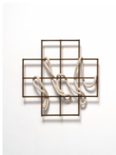
Calendar Relief #1 , 2022 bronze, patina, oil paint 62.2 x 62.2 x 9.5 cm 24 1/2 x 24 1/2 x 3 3/4 in