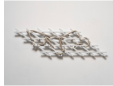
Skewed Relief #4 , 2022 bronze, patina, oil paint 38.1 x 129.5 x 8.9 cm 15 x 51 x 3 1/2 in