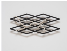
Skewed Relief #1 , 2022 bronze, patina, oil paint 36.8 x 88.3 x 10.2 cm 14 1/2 x 34 3/4 x 4 in