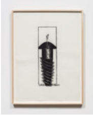
Judith Bernstein Hardware #1 , 1970 Charcoal on paper 88.9 x 59.7 cm 35 x 23 1/2 in