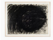
Judith Bernstein SMALL HORIZONTAL NUMBER 8 , 1973 Charcoal on paper 45.72 x 63.5 cm 18 x 25 in