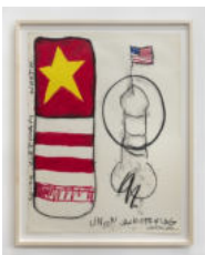
Judith Bernstein Union Jack-Off Flag , 1967 Oil stick and charcoal on paper 63.5 x 48.3 cm 25 x 19 in