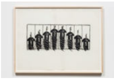
Judith Bernstein Hardware Screws , 1970 Charcoal on paper 59.7 x 88.9 cm 23 1/2 x 35 in