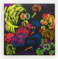
Judith Bernstein Gaslighting (10 Heads) , 2022 Acrylic on canvas 226.1 x 223.5 cm 89 x 88 in