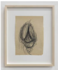
Judith Bernstein Half-Cock Black , 1980 Pencil on paper 24.1 x 17.1 cm 9 7/16 x 6 11/16 ins