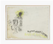
Judith Bernstein KEEP YOUR TIMBER LIMBER , 1966 Mixed media on paper 67 x 87.5 cm 26 6/16 x 34 7/16 ins