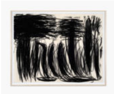
Judith Bernstein Truth , 1995 Charcoal on paper 120.7 x 160 cm 47 1/2 x 63 in