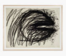
Judith Bernstein Small Horizontal Number 1 , 1973 Charcoal on paper 46 x 63.5 cm 18 x 25 in