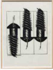
Judith Bernstein Screw Drawing #5 , 1970 Charcoal on paper 88.9 x 59.7 cm 35 x 23 1/2 in