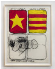
Judith Bernstein Union Jack-Off Flag , 1967 Oil stick and charcoal on paper 63.5 x 48.3 cm 25 x 19 in