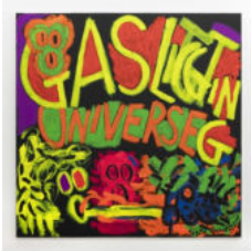
Judith Bernstein Gaslighting Universe , 2022 Acrylic on canvas 182.9 x 182.9 cm 72 x 72 in