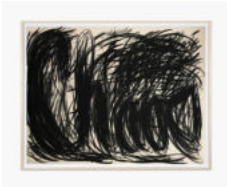
Judith Bernstein Chaos , 1995 Charcoal on paper 120.7 x 160 cm 47 1/2 x 63 in