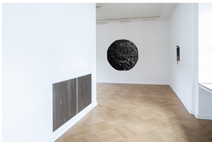
Pierre Allain Emotional Curative Maintenance , 2022 Cudalice Brazelton IV Unergird , 2019 Cudalice Brazelton IV Gauged , 2020 Ausstellungsansicht / Exhibition view Don't Say I Didn't Say So Kunstverein Bielefeld 2022