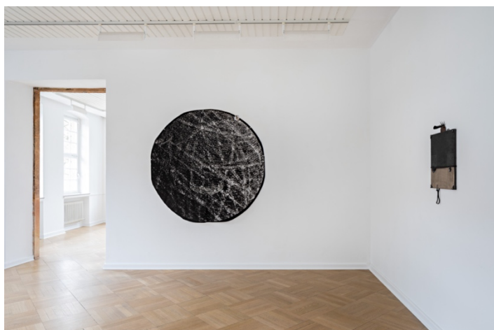
Cudelite Brazelton IV Undergird, 2019 Cudelite Brazelton IV Gauged, 2020 Ausstellungsansicht / Exhibition view Don't Say I Didn't Say So Kunstverein Bielefeld 2022