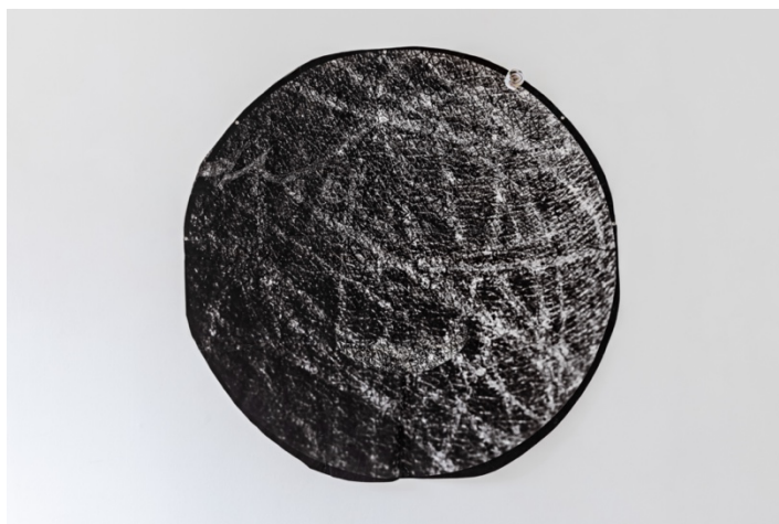
Cudelite Brazelton IV Undergird, 2019 Ausstellungsansicht / Exhibition view Don't Say I Didn't Say So Kunstverein Bielefeld 2022