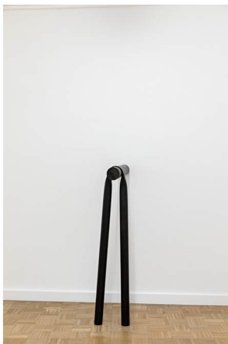
Toni Schmale fury #2, 2022 Ausstellungsansicht / Exhibition view Don't Say I Didn't Say So Kunstverein Bielefeld 2022