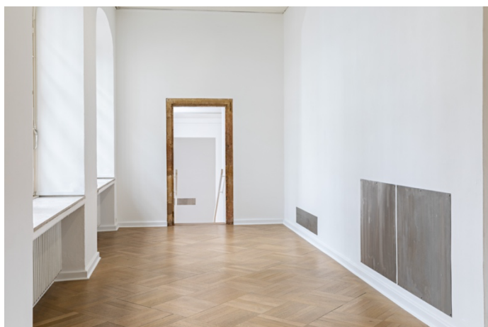
Pierre Allain Emotional Curative Maintenance , 2022 Ausstellungsansicht / Exhibition view Don't Say I Didn't Say So Kunstverein Bielefeld 2022